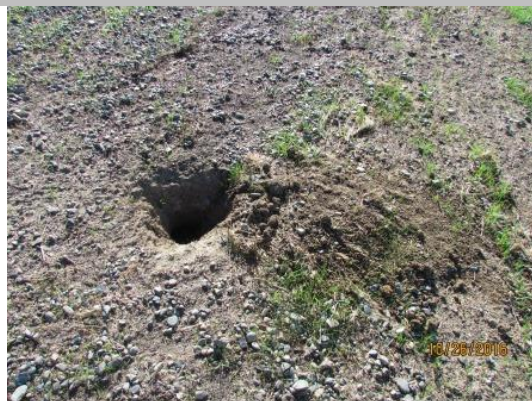
View of an animal burrow. Fall 2016.