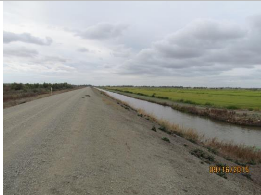
The ditch is at the levee toe on the landward side of the levee looking downstream. Fall 2015.