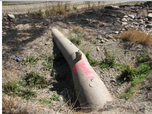
Waterside view: pipe and siphon breaker