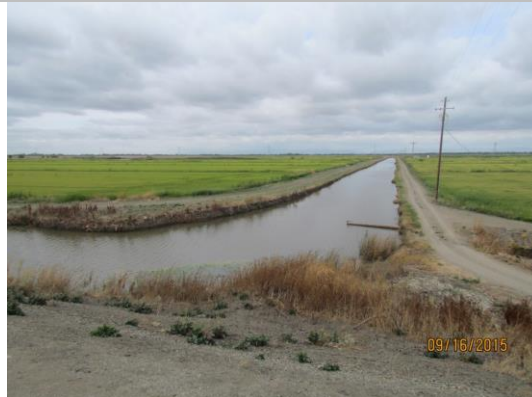
Looking west at the agricultural ditch. Fall 2015.