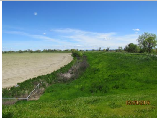
View of the ditch at the toe of the levee on the landward side. Spring 2016.