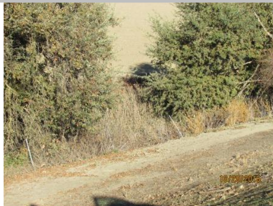
Another view of fence along the ditch on landside. Fall 2016.