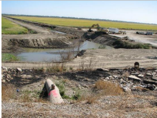
Waterside view: overview of pipe and water channel