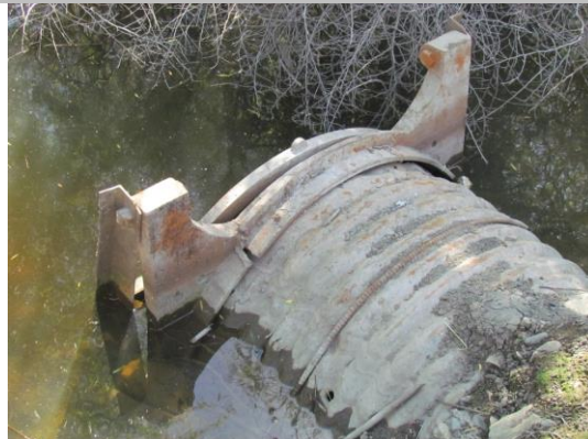
View of the flap gate in the ditch on the water side of the levee. There seems to be debris preventing the flap gate from closing. Spring 2015.

LS : Land Side N/A : Not Applicable WS : Water Side CR : Crown