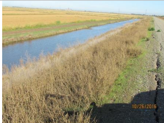
View of vegetation on WS slope. Fall 2016.

LS : Land Side N/A : Not Applicable WS : Water Side CR : Crown