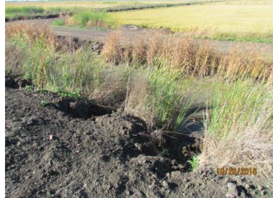
View of erosion sites on a side of the ditch. Fall 2016.