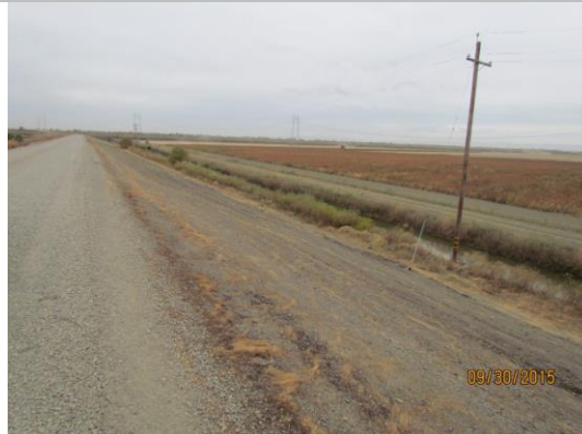
View of the ditch on the landward side of the levee looking downstream. Fall 2015.