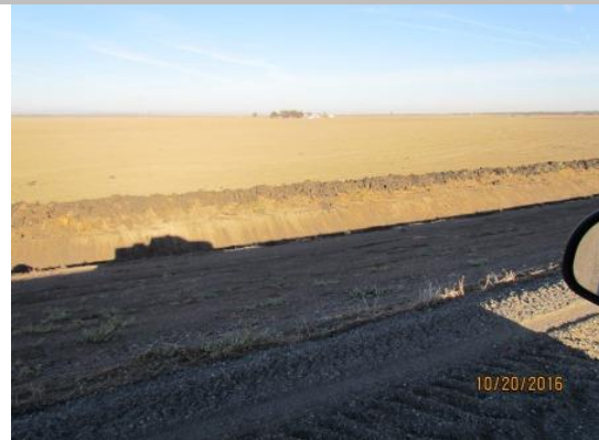
View of the ditch on landward side. Fall 2016.