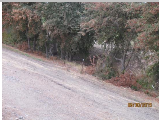
View of the ditch on the landward side of the levee. Fall 2015.

LS : Land Side N/A : Not Applicable WS : Water Side CR : Crown