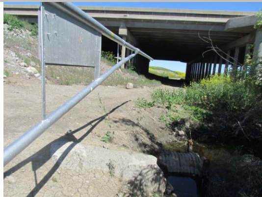
View of a perspective on the pipe looking upstream. Spring 2015.