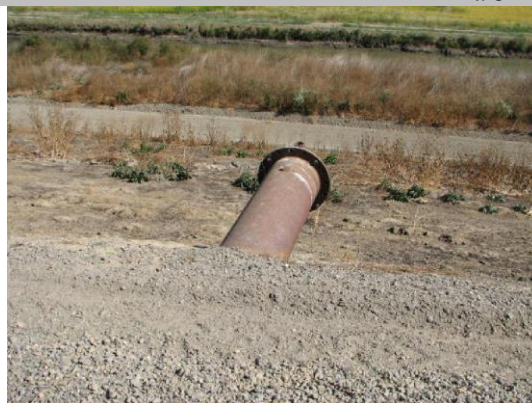
Waterside view: an abandoned steel pipe.