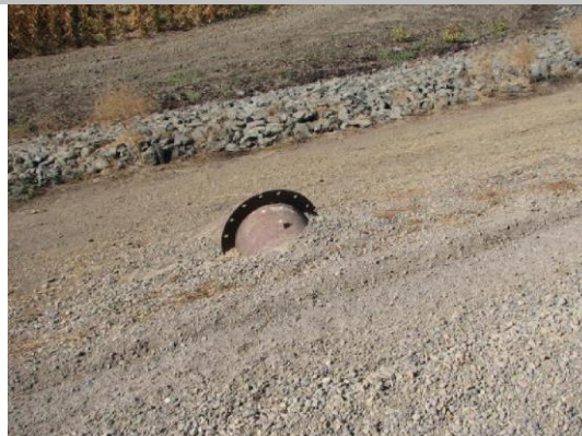
Landside view: an abandoned steel pipe.