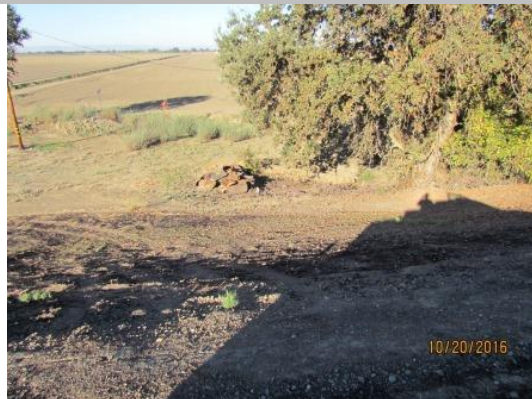
View of garbage within 10-foot easement of LS levee toe. Fall 2016.