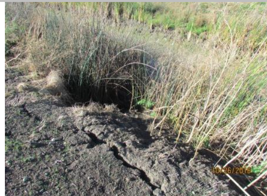
View of erosion site on a side of the ditch. Fall 2016.