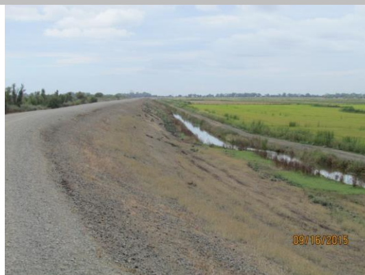
View of the ditch along the levee toe on the landward side of the levee looking downstream. Fall 2015.