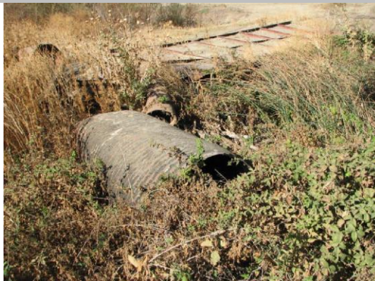
Landside view: an abandoned CM pipe on LS berm of the levee.