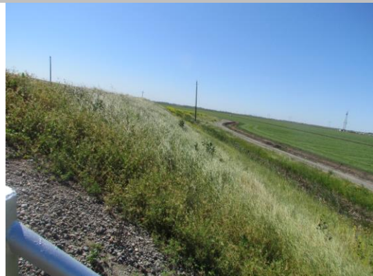
View of the ditch on the landward side of the levee looking downstream. Spring 2015.