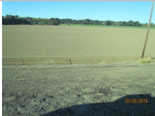
View of fence located within 10-foot easement of landside toe. Fall 2016.