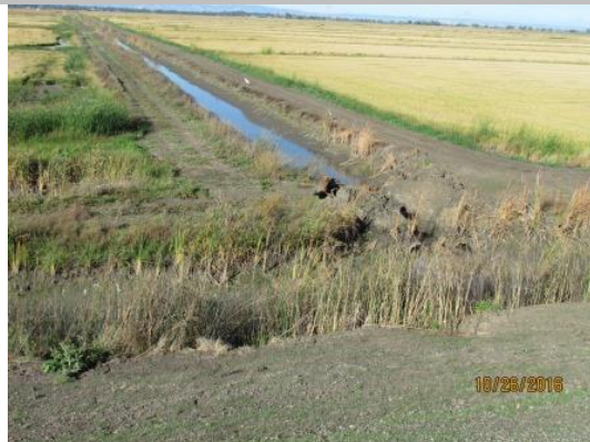
Perspective view of the erosion site. Fall 2016.