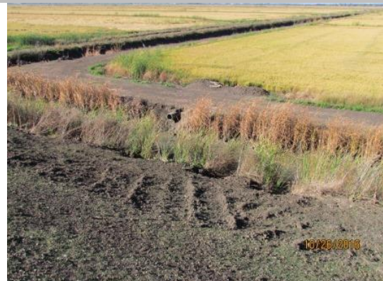
Prospective view of the erosion site. Fall 2016.