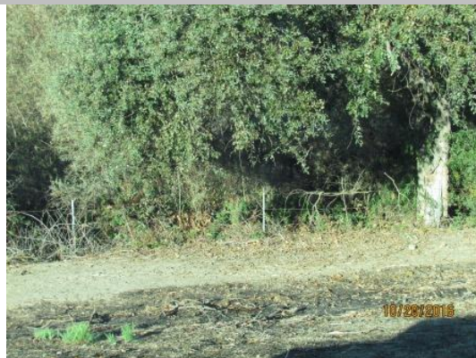
Another view of fence located within 10-foot easement of landside toe. Fall 2016.