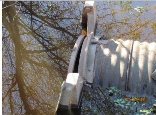
Updated view of the flap gate not closed completely. Fall 2016.