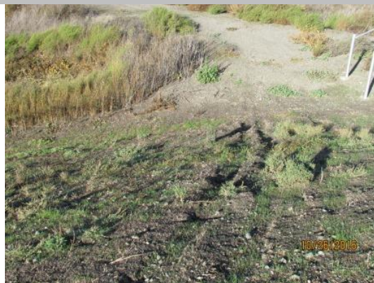
Slope was damaged by vehicle. Fall 2016.