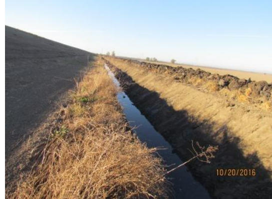
View of the ditch on landward side. Ditch was deepened to approximately 10 ft. Fall 2016.