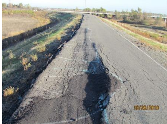
Asphalt paved crown has depression at this site. Fall 2016.