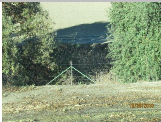
View of fence along the ditch on landside. Fall 2016.