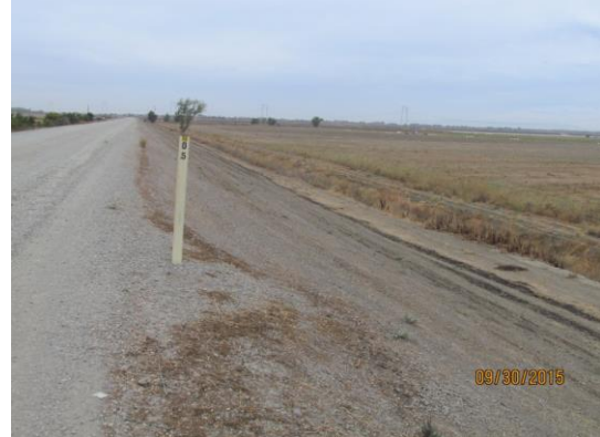
View of the ditch at the landward side of the levee looking downstream. Fall 2015.