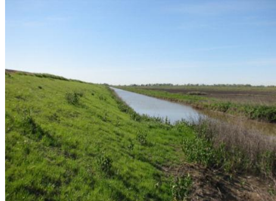
The ditch is in the profile of the levee slope. Spring 2014