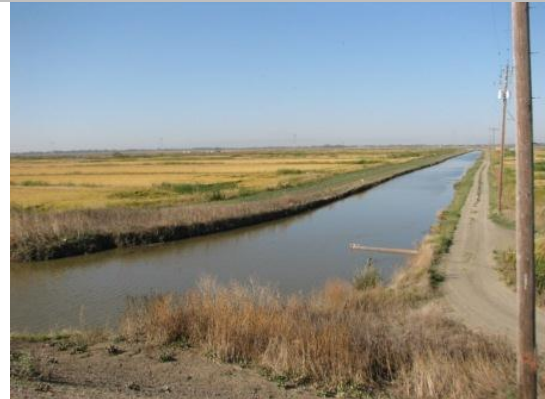
Looking west at the agricultural ditch. Fall 2013