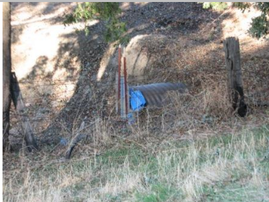
The culvert at the end of the agricultural ditch. Fall 2013