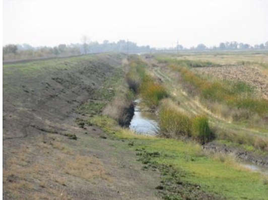
The agricultural ditch is within the easement of the levee. Fall 2013