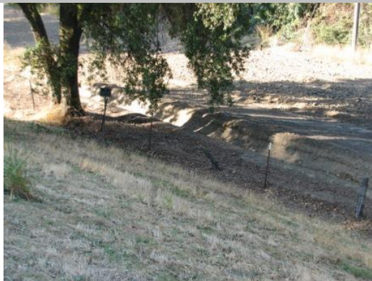
The agricultural ditch along the levee toe. Fall 2013