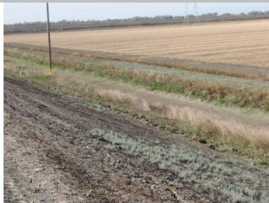
The agricultural ditch is within the easement of the levee. Fall 2013