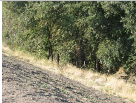
The agricultural ditch runs along the toe of the levee. Fall 2013