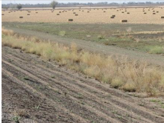
The agricultural ditch is within the easement of the levee. Fall 2013