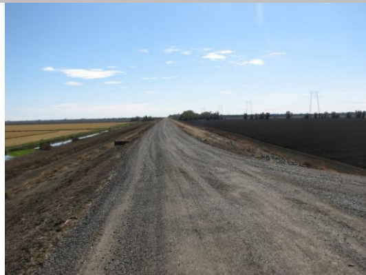
Levee mile 0.00, vegetation on levee slopes. Fall 2014.