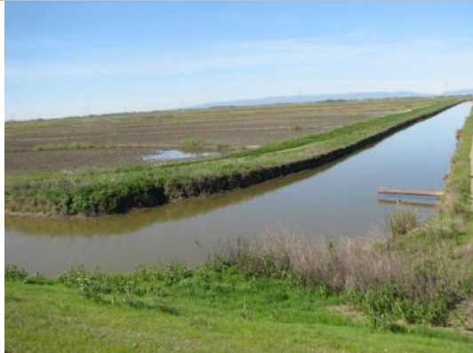
The ditch runs west for about a quarter of a mile. Spring 2014

LS : Land Side N/A : Not Applicable WS : Water Side CR : Crown