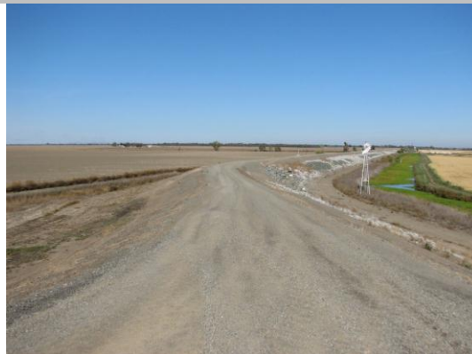
Levee mile 1.50, levee slopes and crown. Fall 2014.