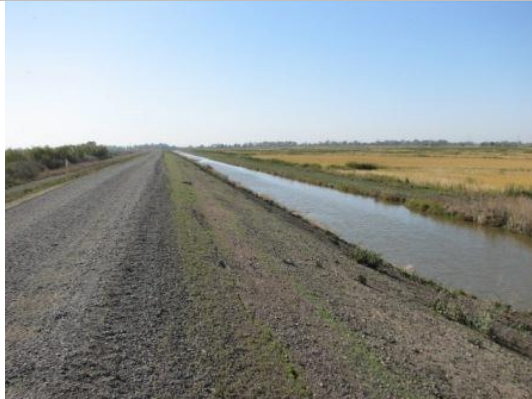
The agricultural ditch is within the easement of the levee. Fall 2013