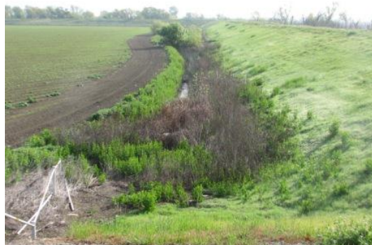
The agricultural ditch runs along the toe of the levee. Spring 2013