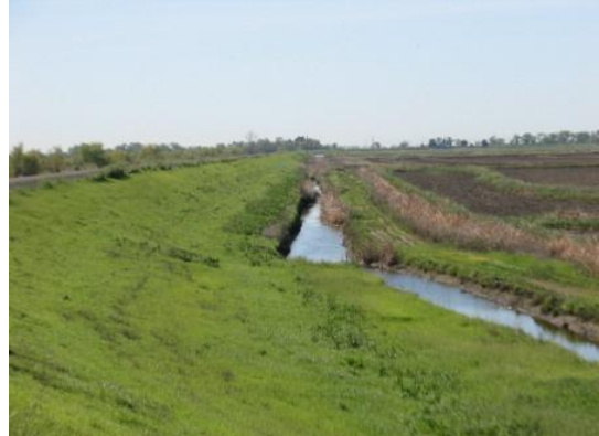
* Location ** Rating + Issue Type LS : Land Side N/A : Not Applicable A : Acceptable N : Not Inspected/Rated Ma : Maintenance Deficiency WS : Water Side M : Minimally Acceptable C : Corrected Ob : Design & System Obsolescence CR : Crown U : Unacceptable A/W : Acceptable but Monitor & Maintain En : Enforcement