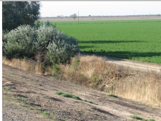
Another view of the agricultural ditch at the toe. Fall 2013