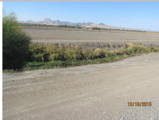
View of the erosion along the waterside toe.