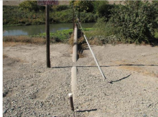
Pipe on WS slope with siphon breaker at WS shoulder.