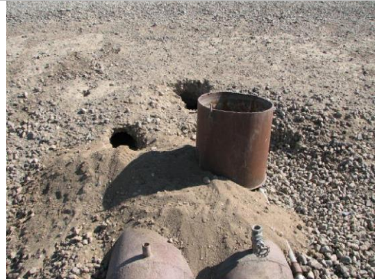
Pipe on LS showing rodent activity.