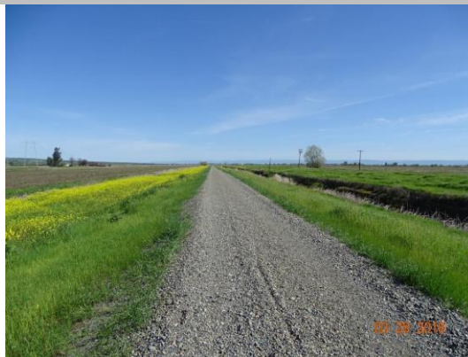
View of the native grasses on both slopes.