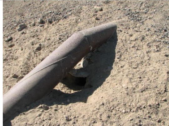
Heavy rodent activity along pipe, both sides.