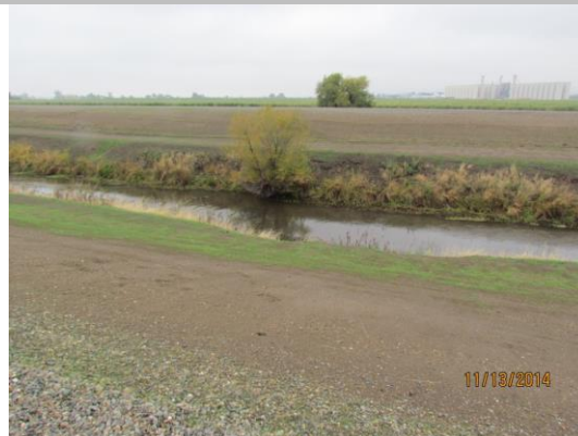
View of the erosion along the waterside toe.