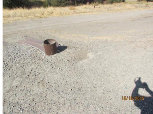
View of the rodent hole above the irrigation pipe.