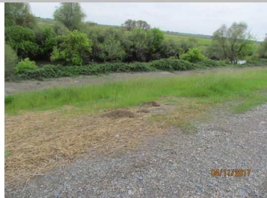
View of the rodent holes along the waterside slope.