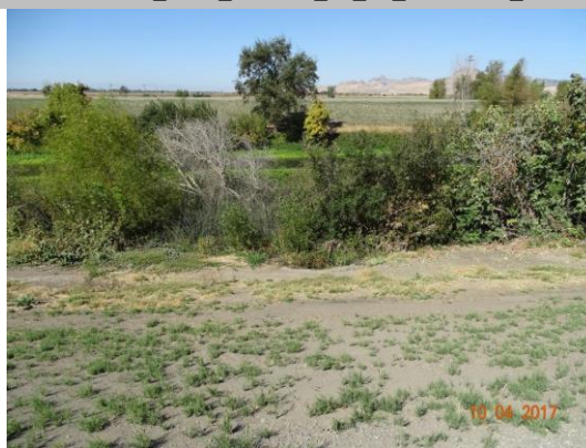
View of the beaver hole along the waterside berm.