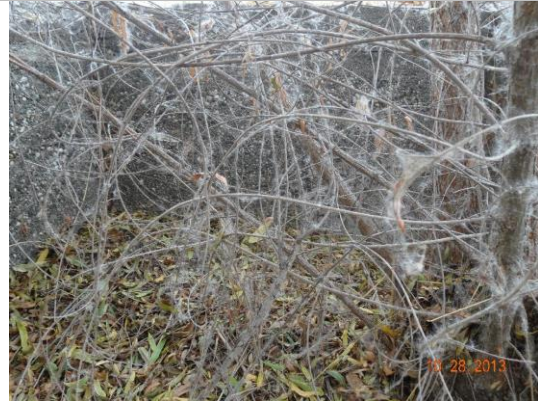
View of LS headwall silted in.