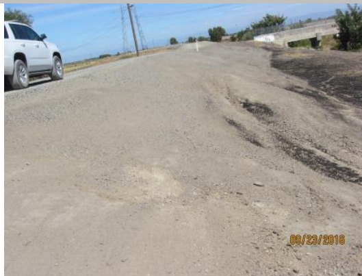
View the ramp encroaching into the levee.

* Location LS : Land Side N/A : Not Applicable WS : Water Side CR : Crown