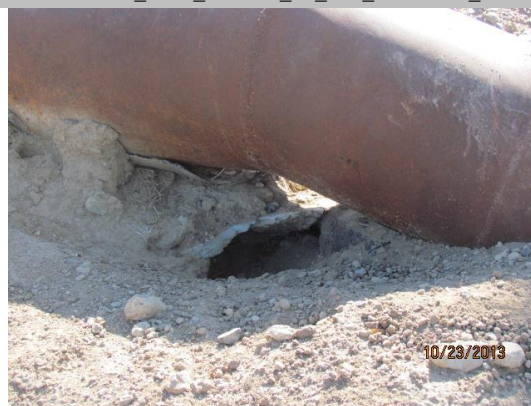
View of the rodent holes under the irrigation pipe.