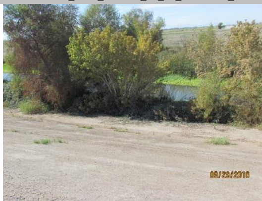
View of the erosion along the waterside toe.