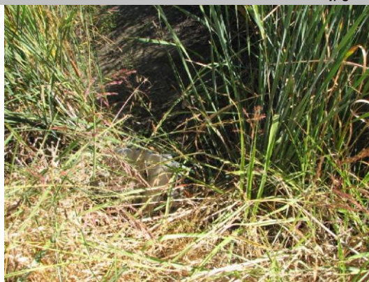
Inlet in weeds on LS toe.