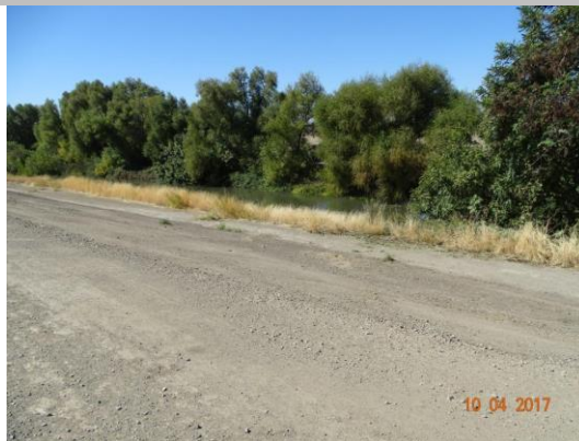
View of the rodent holes along the waterside slope.