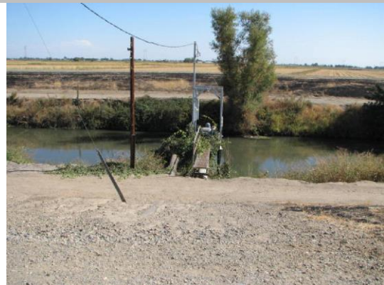
Pipe on left without pump.