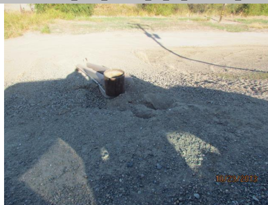
View of the rodent holes above the irrigation pipe.