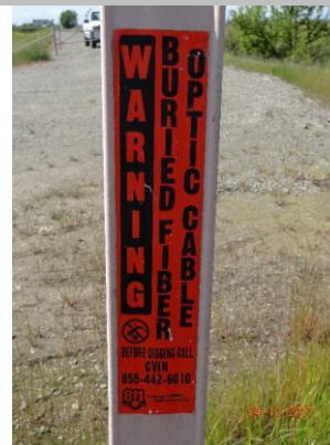
Close up of carsonite marker.