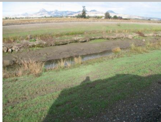
View of the erosion along the waterside toe of the levee.