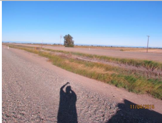
View of the erosion at the waterside toe.