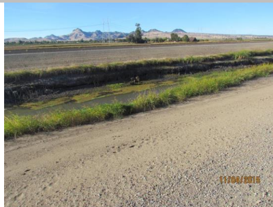
View of the erosion along the waterside toe.