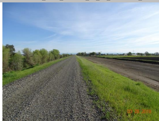
View of the native grasses on both slopes.