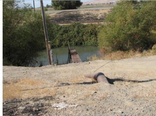
Pump missing from steel pier on WS toe.