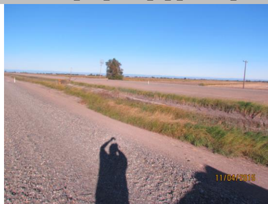
View of the erosion at the waterside toe.