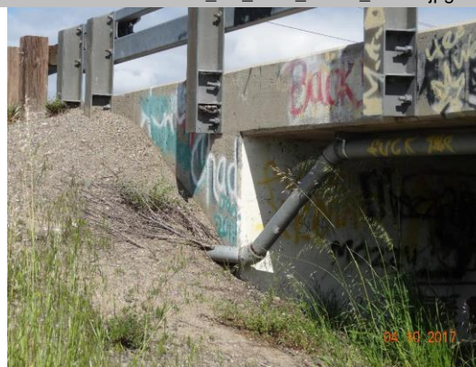
WS slope where conduit exits and attaches to downstream side of South Butte Rd bridge.