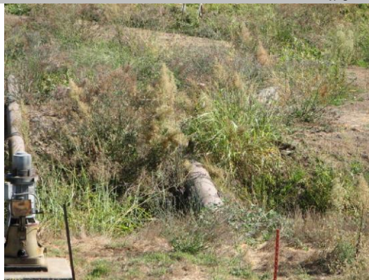
Pipe on LS toe.