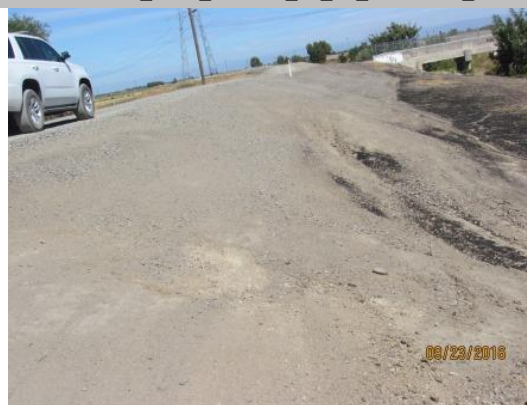
View the ramp encroaching into the levee.