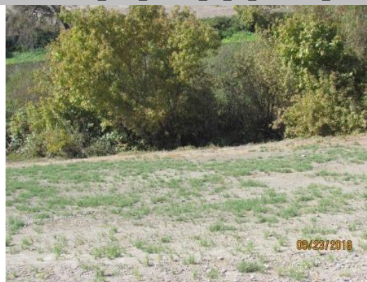
View of the erosion along the waterside toe.