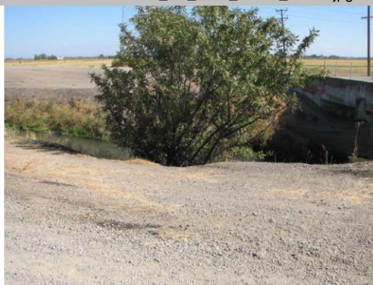
Bush camouflaging outlet of pipe on WS slope.