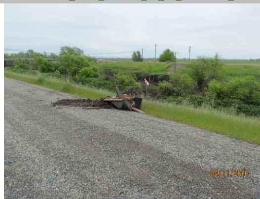
View of the garbage along the waterside slope.

* Location LS : Land Side N/A : Not Applicable WS : Water Side CR : Crown