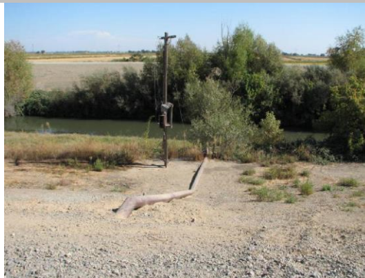
Pipe and pump facilities on WS slope.