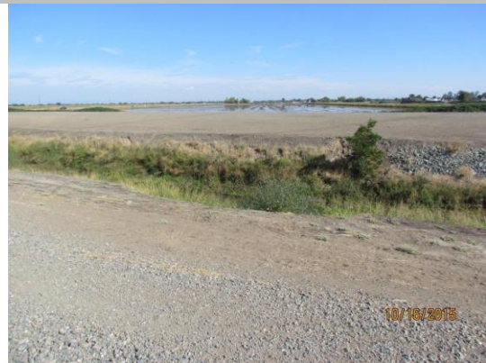
View of erosion along the waterside toe.