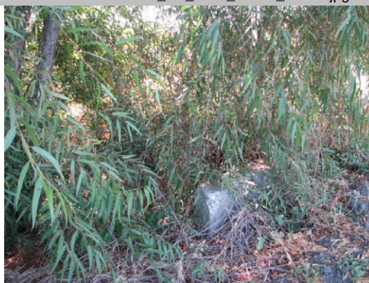
Concrete U shaped headwall on LS toe under tree.