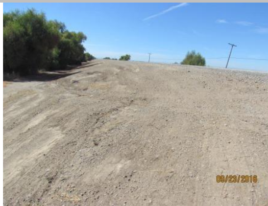
View the ramp encroaching into the levee.