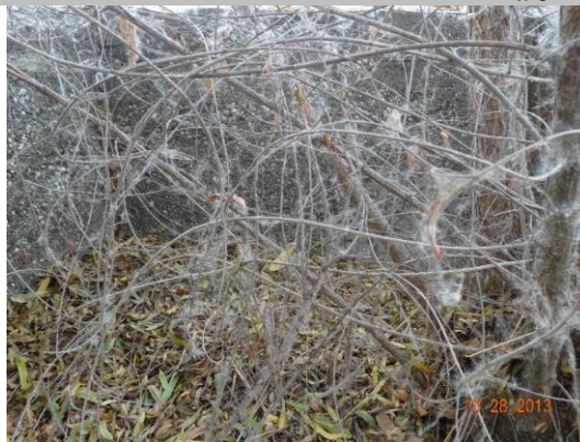
View of LS headwall silted in.