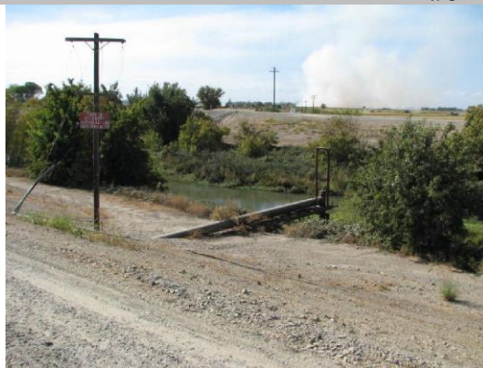
Power pole with cut powerlines, pump missing from steel pier.