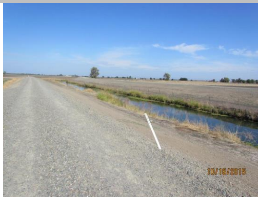
View of the erosion along the waterside toe.