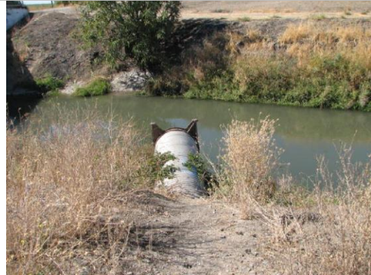
36-inch pipe with flapgate on WS slope.