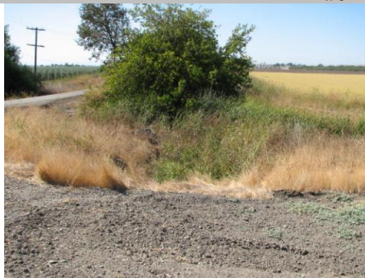
Heavy vegetation at LS inlet at channel.