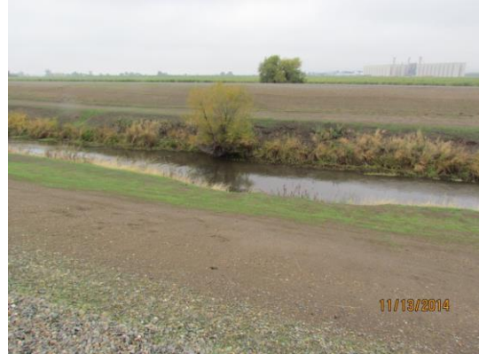
View of the erosion along the waterside toe.