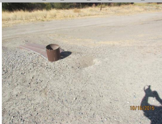
View of the rodent hole above the irrigation pipe.