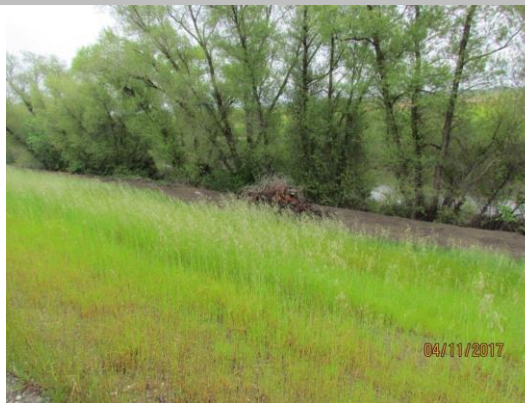
View of the prunings along the waterside toe.