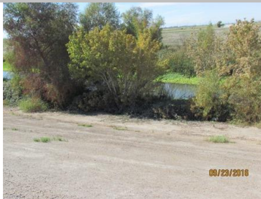
View of the erosion along the waterside toe.