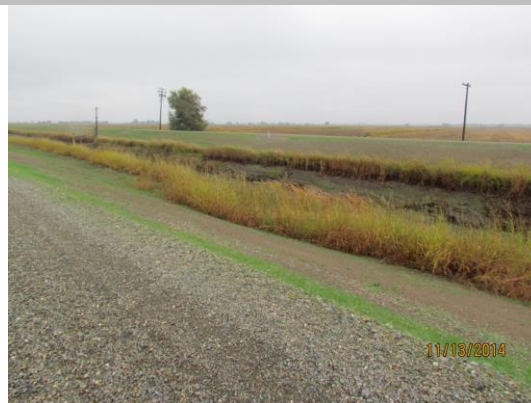
View of the erosion at the waterside toe.