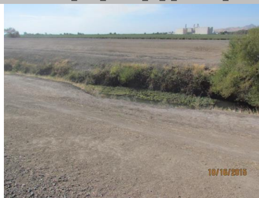
View of the erosion along the waterside toe.