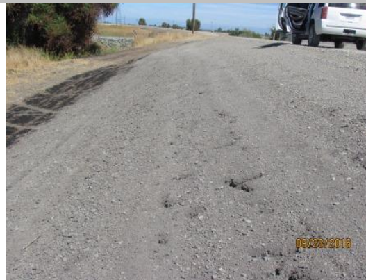
View of the longitudinal cracks along the landside slope.

LS : Land Side N/A : Not Applicable WS : Water Side CR : Crown