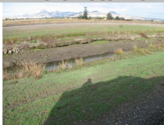
View of the erosion along the waterside toe of the levee.