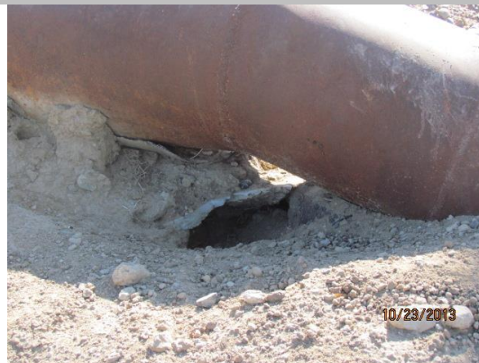
View of the rodent holes under the irrigation pipe.