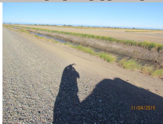
View of erosion at the waterside toe