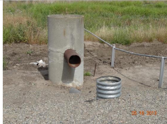
36in. concrete standpipe and 12in. cm riser on LS.