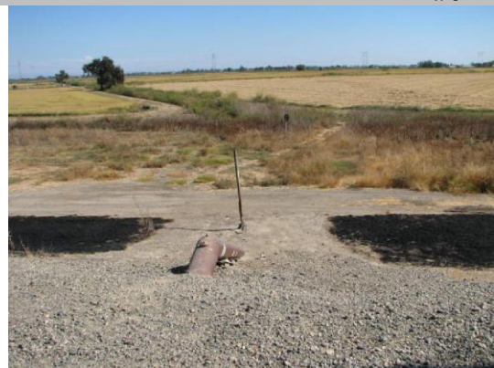
Pipe with siphon breaker plugged on LS shoulder.