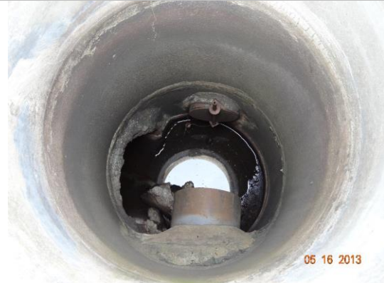
Inside of 36in. concrete riser