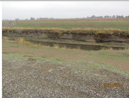
View of the erosion along the waterside toe.