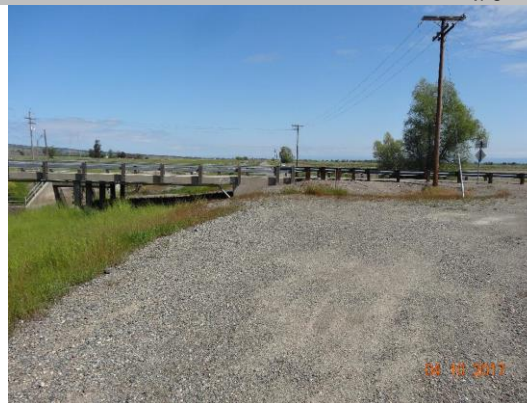
Levee overview looking upstream.