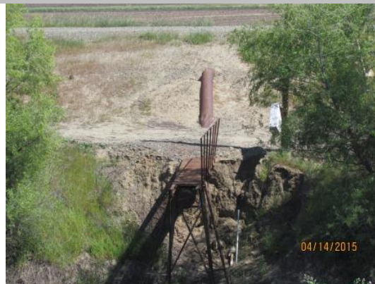
View of the erosion along both sides of the abandoned pump.