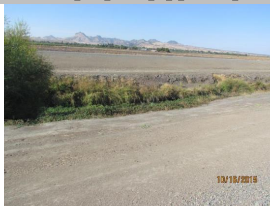
View of the erosion along the waterside toe.