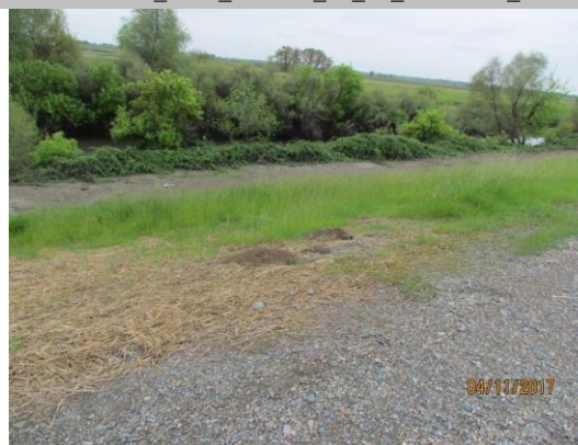
View of the rodent holes along the waterside slope.