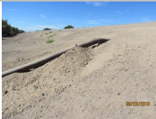
View of the rodent holes along the waterside slope.