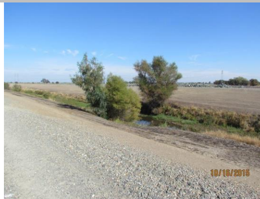
View of the erosion along the landside toe.