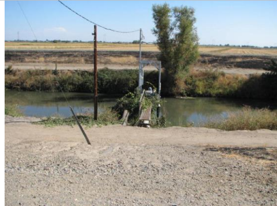
Pipe on left without pump.