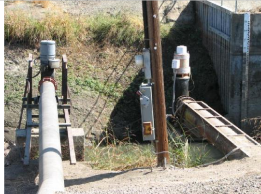
Pump on steel pier at WS toe.