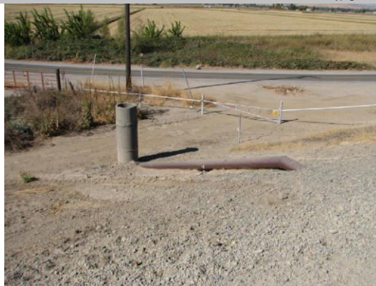
Pipe and Standpipe on LS toe.