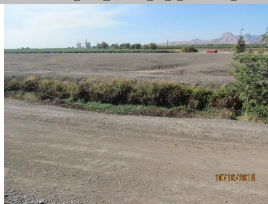
View of the erosion along the waterside toe.