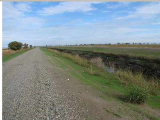
View of the erosion along the waterside toe.