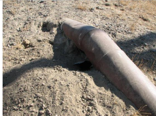
Extensive burrowing along pipe alignment on WS slope.