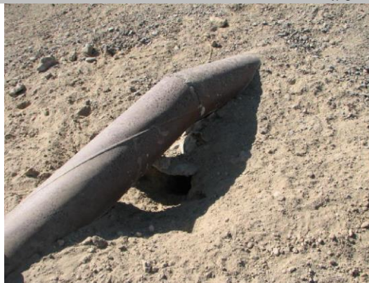
Heavy rodent activity along pipe, both sides.