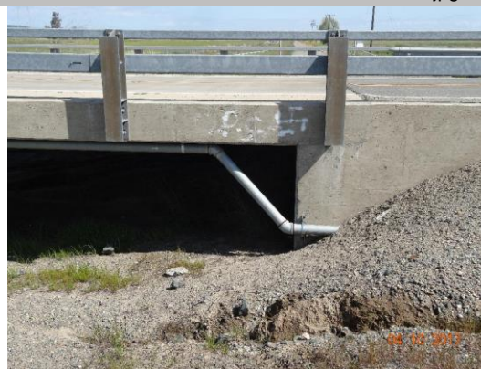
Conduit exiting WS slope and attaching to the downstream side of South Butte Rd bridge.