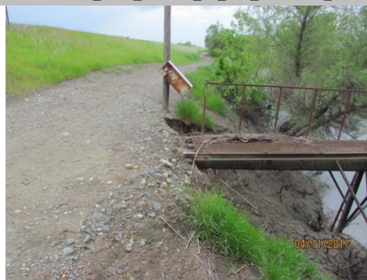
View of erosion along both sides of the abandoned pipe.