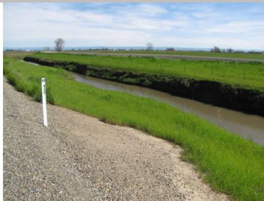
View of the erosion along the W/S toe.