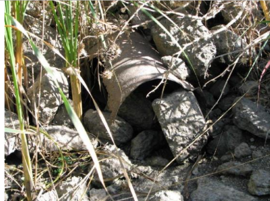
Rusted outlet at LS channel. Unclear if this is same pipe as one under investigation.