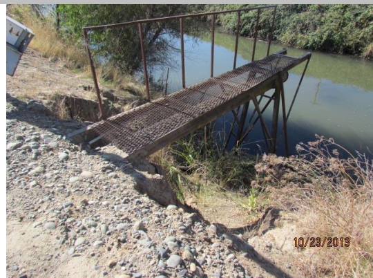
View of the erosion along both sides of the abandoned pump.