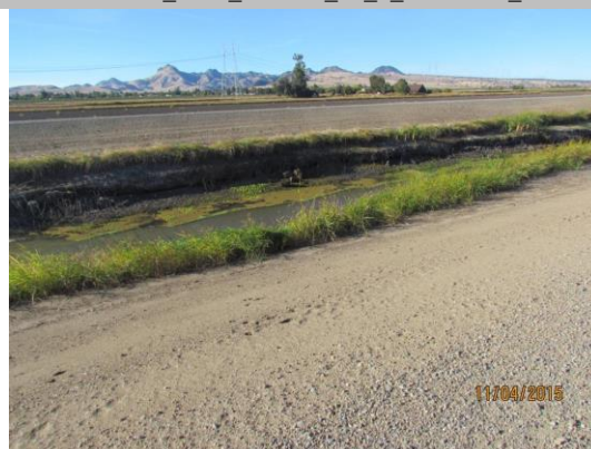
View of the erosion along the waterside toe.