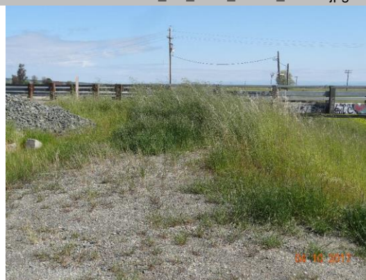
Levee crown overview looking upstream