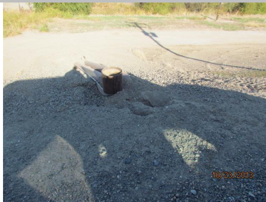
View of the rodent holes above the irrigation pipe.