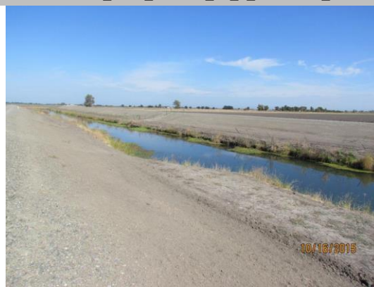
View of the erosion along the waterside toe.