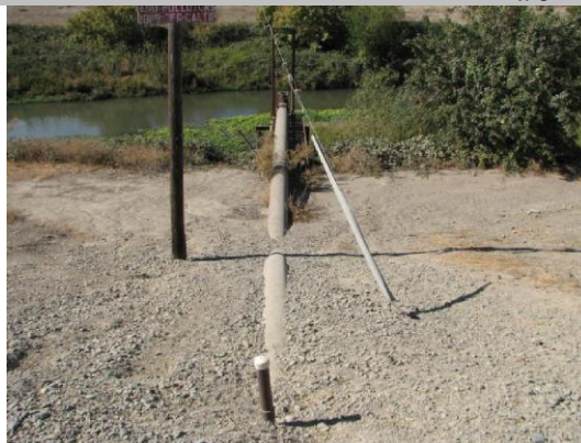
Pipe on WS slope with siphon breaker at WS shoulder.