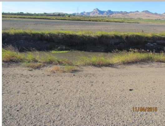
View of the erosion along the waterside toe.