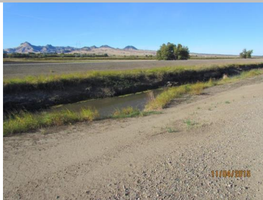
View of the erosion along the waterside toe.