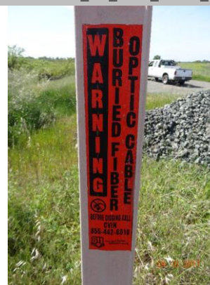
Close up of marker.