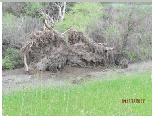
View of the erosion along the waterside toe caused by a tree that fell into the water.