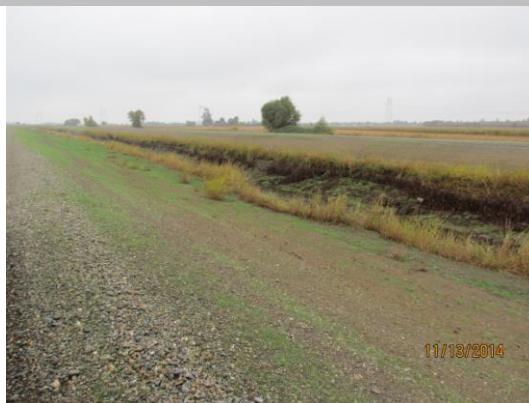
View of the erosion along the waterside toe.