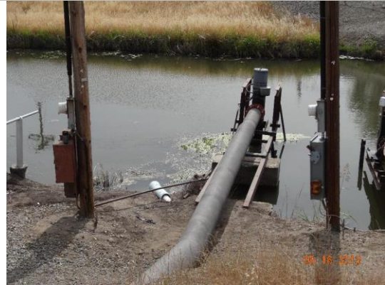
Pump station in channel on WS