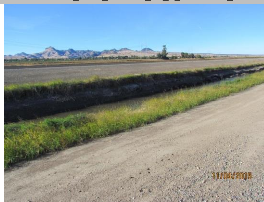
View of the erosion along the waterside toe.