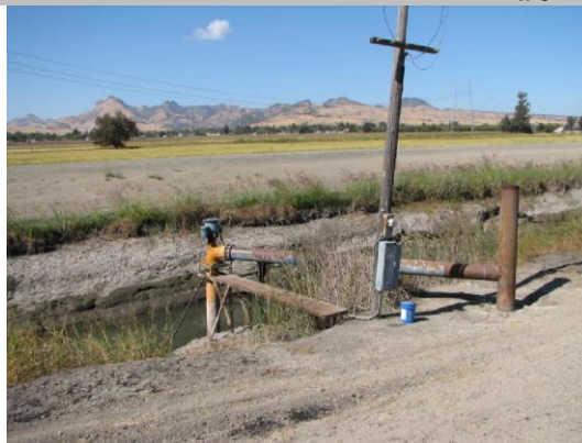
Pump, Pipe, walkway, power pole, and standpipe on WS toe.