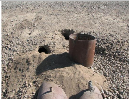
Pipe on LS with rodent activity shown.