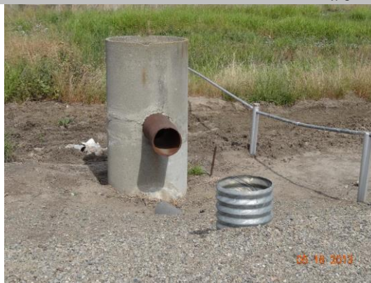
36in. concrete standpipe and 12in. cm riser on LS.