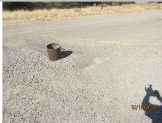
View of the rodent hole above the irrigation pipe.