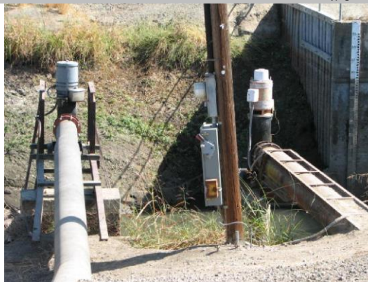
Pump on steel pier at WS toe.