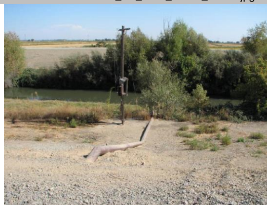
Pipe and pump facilities on WS slope.