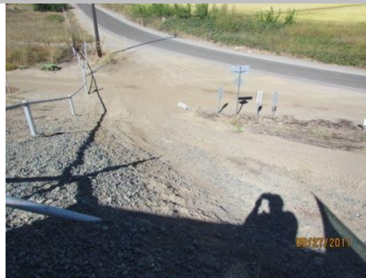
View of vehicle erosion along L/S slope.