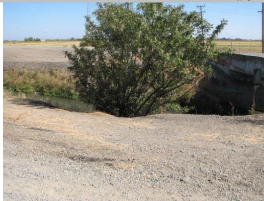
Bush camouflaging outlet of pipe on WS slope.