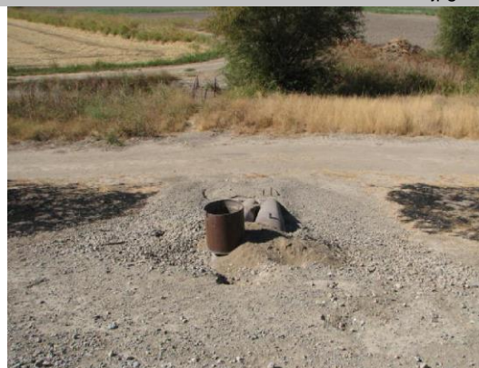
Pipe on LS with rodent activity shown.