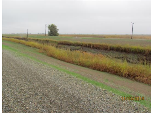
View of the erosion at the waterside toe.