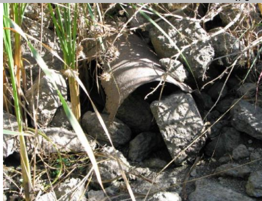
Rusted outlet at LS channel. Unclear if this is same pipe as one under investigation.