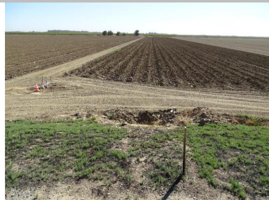
View of LS from levee crown