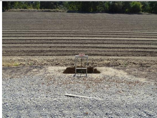
View of WS looking from levee crown