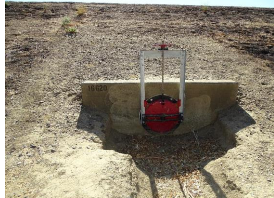
WS levee slope, headwall and slide gate