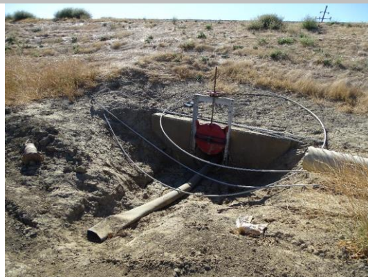
WS slope with headwall and slide gate