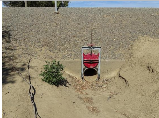
WS levee slope, headwall, and slide gate