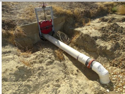
Headwall and slidegate at WS toe with a PVC pipe running through