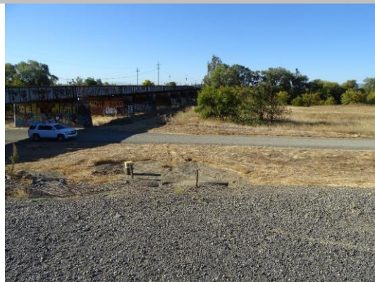
View of WS looking from levee crown

* Location LS : Land Side N/A : Not Applicable WS : Water Side CR : Crown