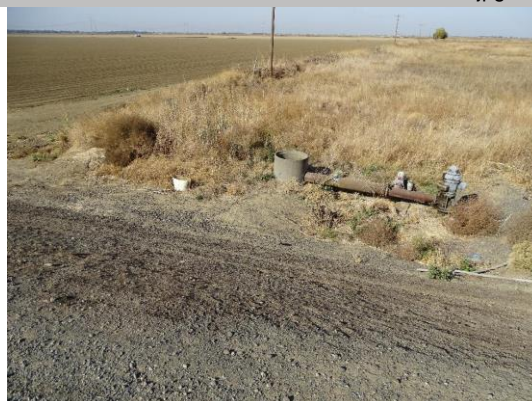
View of LS looking from levee crown