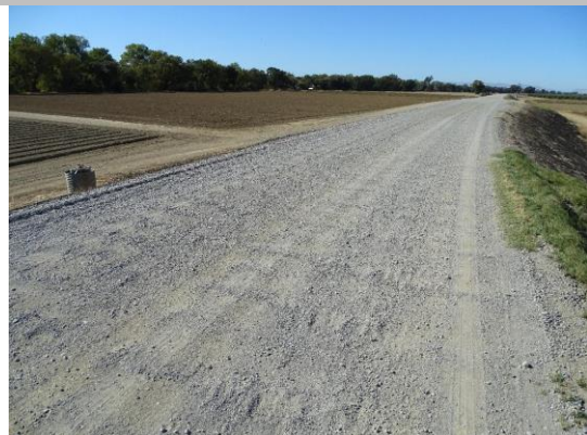
View of levee crown at the crossing