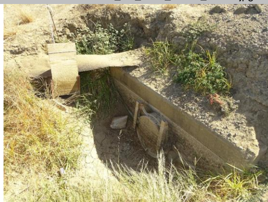
Headwall and flap gate at WS levee toe