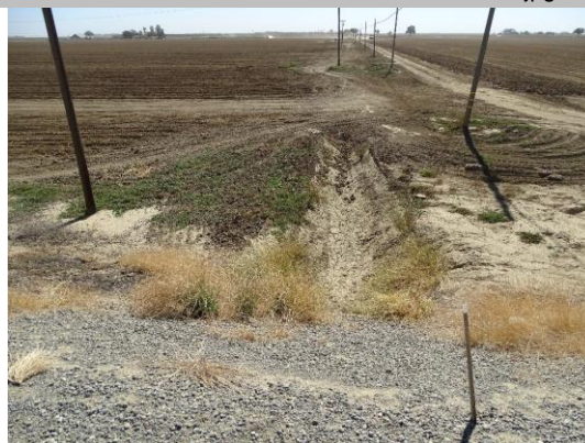
View of LS looking from levee crown