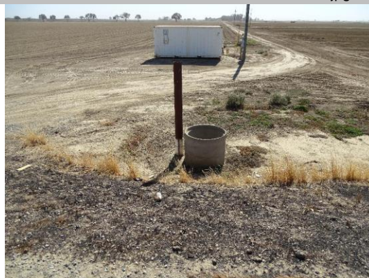
View of LS looking from levee crown. 36-inch standpipe near levee toe