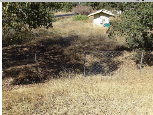
View of LS looking from levee crown