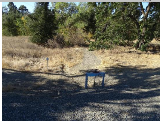
View of WS looking from levee crown