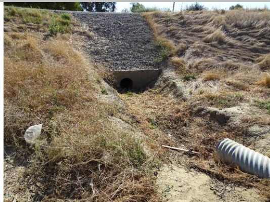
LS levee slope, headwall, and pipe end