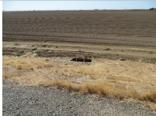
View of LS looking from levee crown