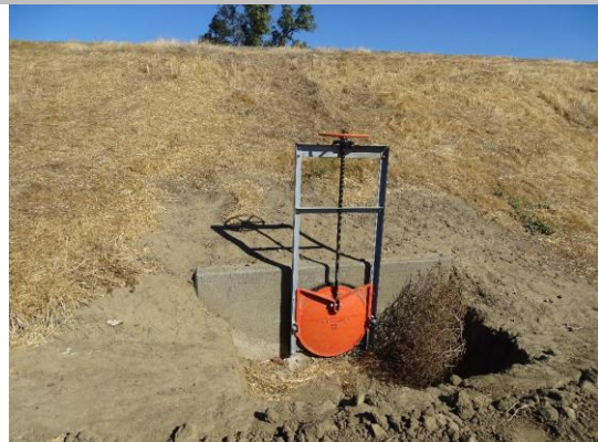
LS slope, headwall, and slide gate