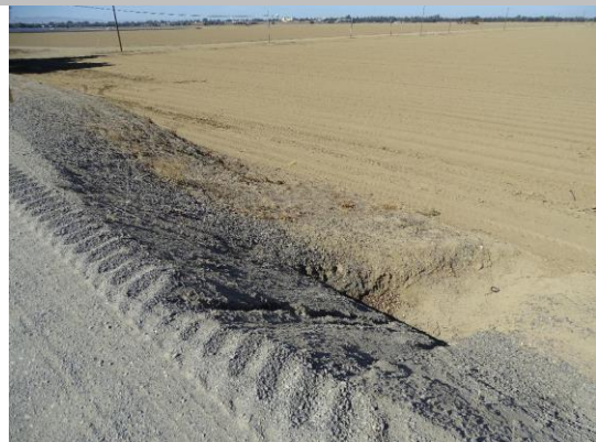
View of LS looking from levee crown