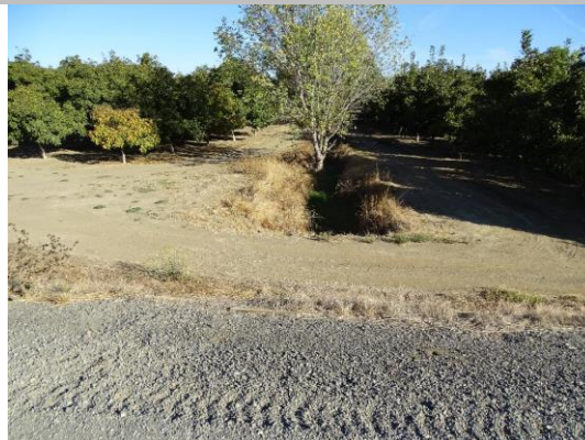
View of WS looking from levee crown