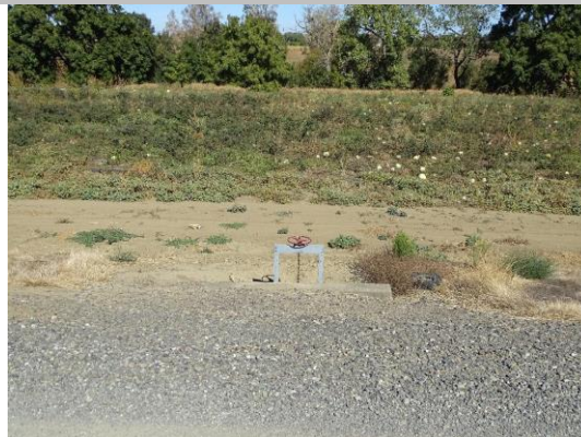
View of WS looking from levee crown