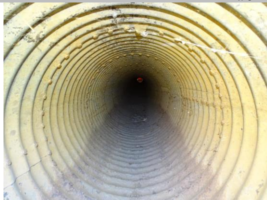
View inside of CMP drainage pipe