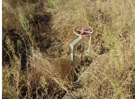
WS: headwall and slide gate