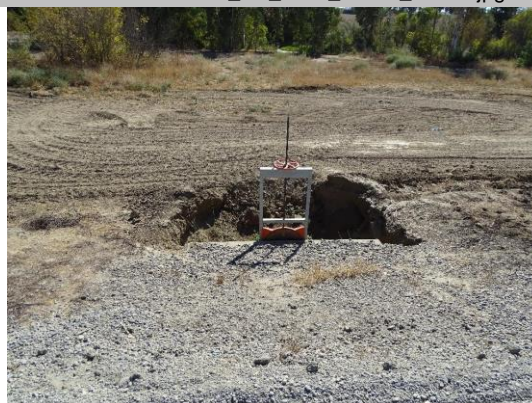
View of WS looking from levee crown