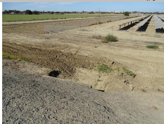
View of LS looking from levee crown