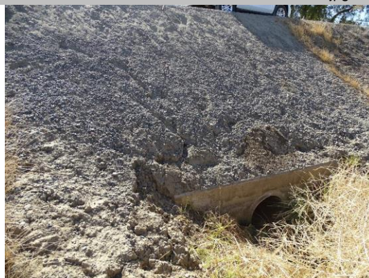
LS levee slope, headwall, and pipe end