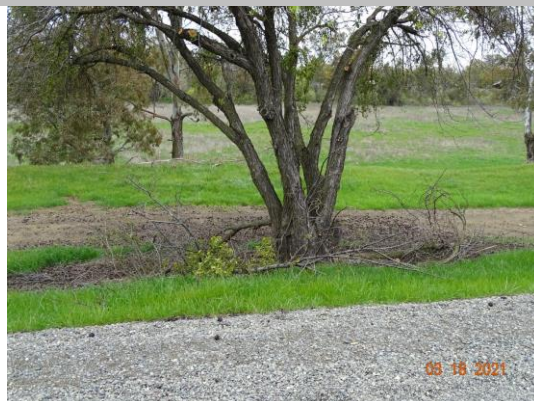
View of pruned tree limbs on the waterside slope (Spring 2021).

LS : Land Side N/A : Not Applicable WS : Water Side CR : Crown