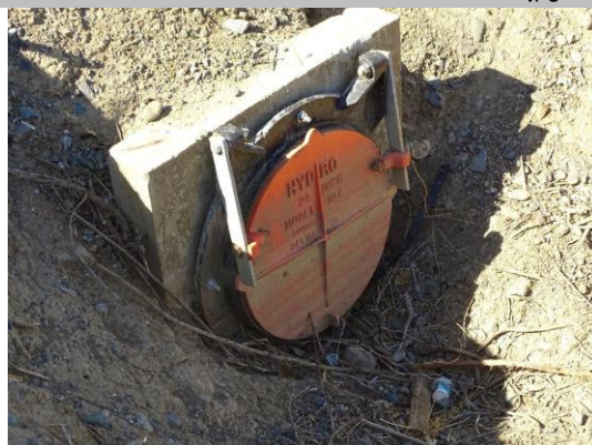
Headwall and flap gate