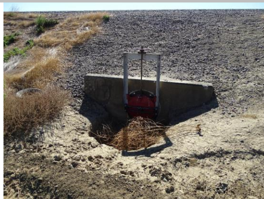
WS levee slope, headwall, and slide gate