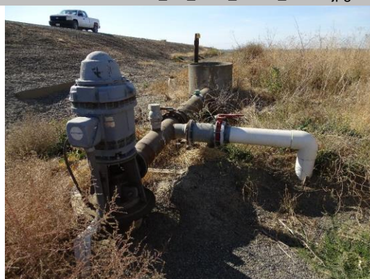
Water well connected to standpipe at LS toe. Top of headwall is visible