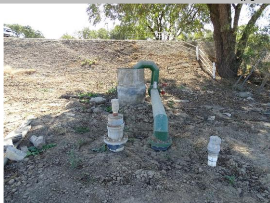
View of LS slope with concrete standpipe at levee toe