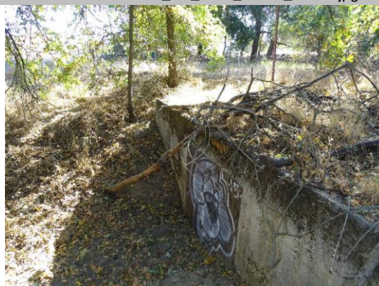
Steel plate installed over pipe off LS toe