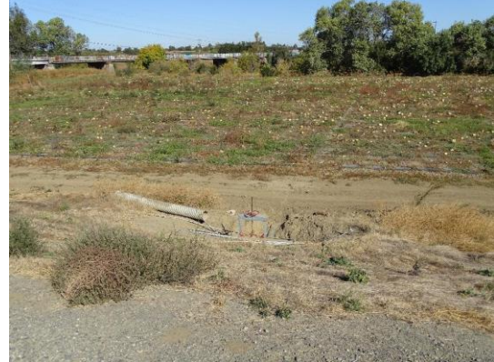
View of WS from levee crown