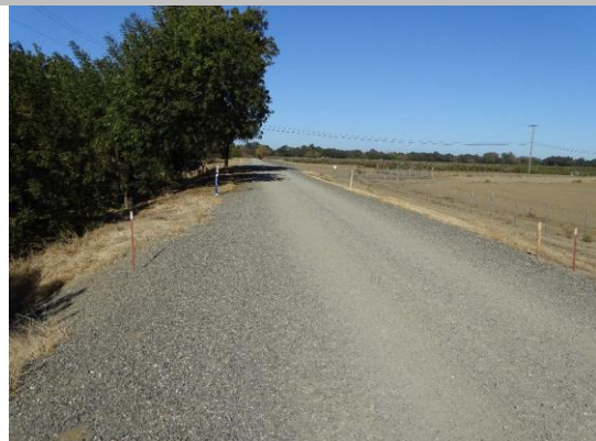
View of levee crown at the crossing