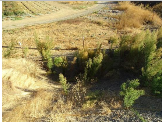
View of LS looking from levee crown