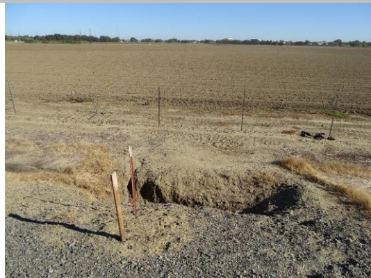
View of LS looking from levee crown