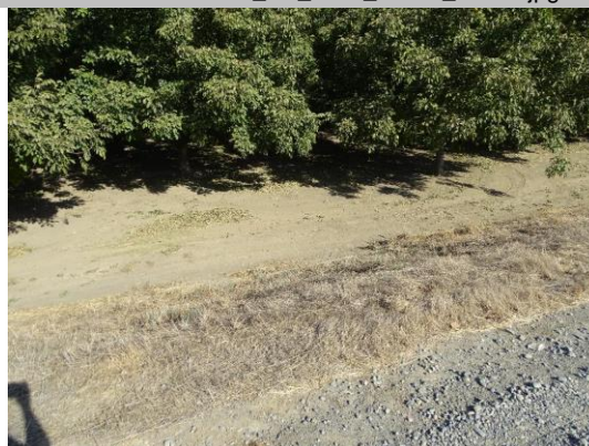
View of LS looking from levee crown