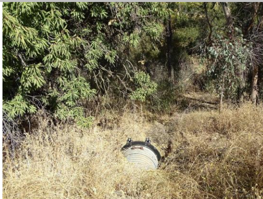
Pipe end on WS