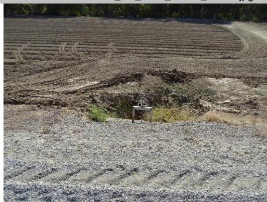
View of WS looking from levee crown