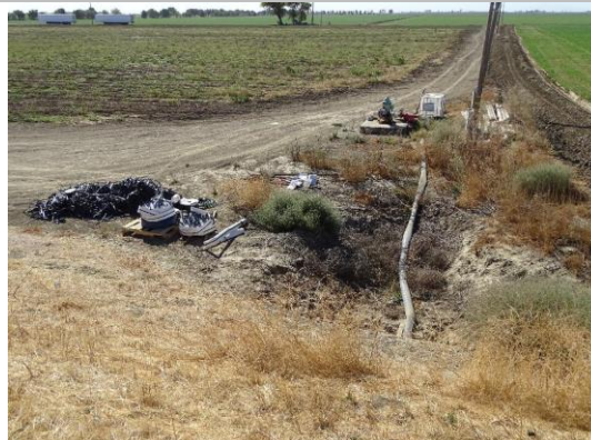
View of LS from levee crown