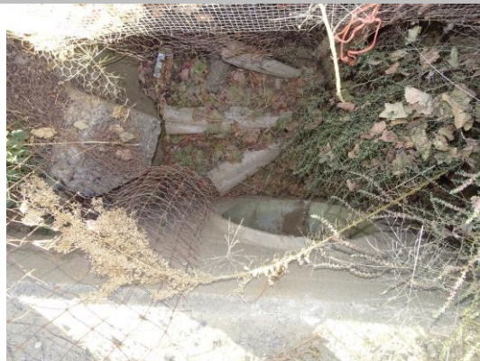
LS: headwall and pipe end near a fence