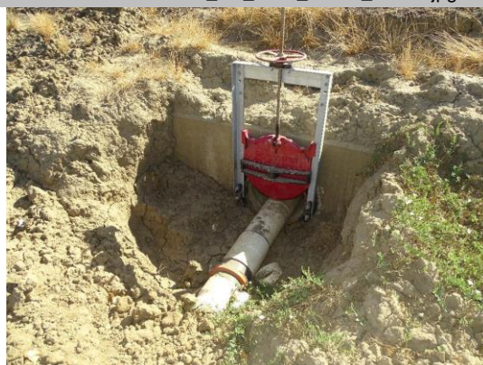
Headwall and slidegate at WS toe with a PVC pipe running through