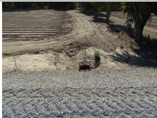
View of WS looking from levee crown