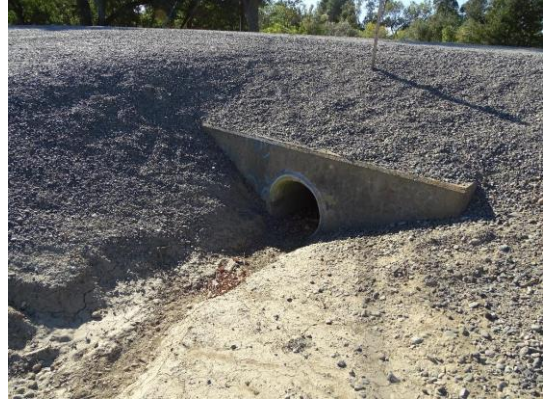
LS levee slope, headwall, and pipe end