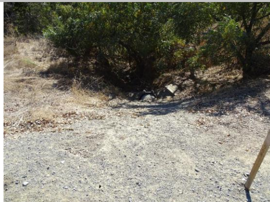
View of WS looking from levee crown