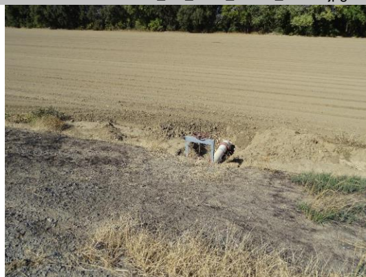
View of WS from levee crown