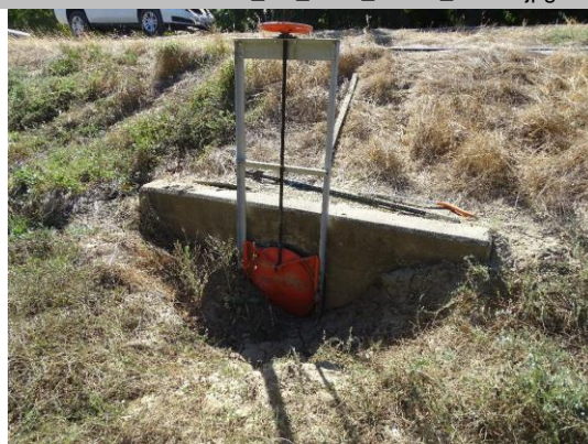
WS levee slope, headwall, and slide gate