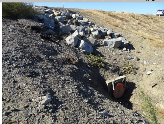
View of WS slope and flap gate at levee toe