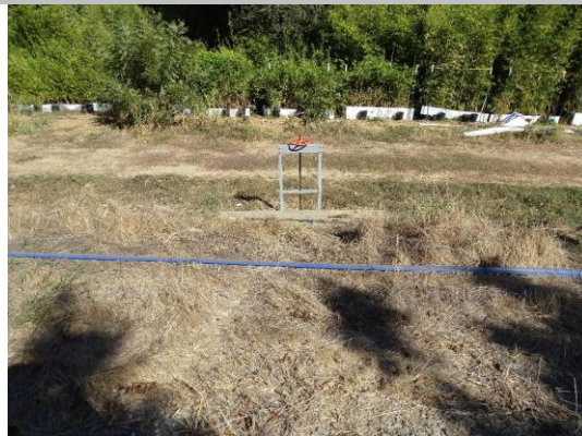
View of WS looking from levee crown