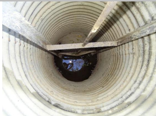
View inside of CMP standpipe on WS