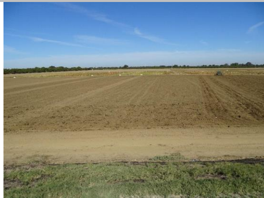
View of LS looking from levee crown