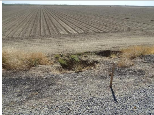
View of LS from levee crown