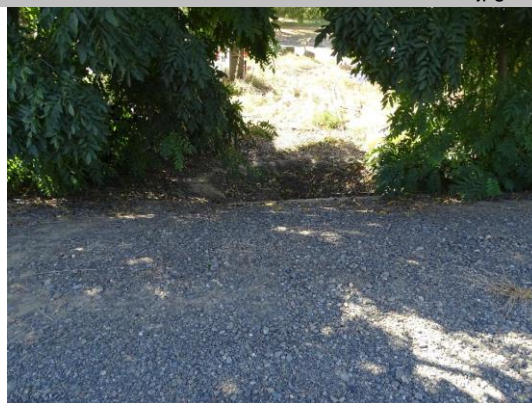
View of LS looking from levee crown