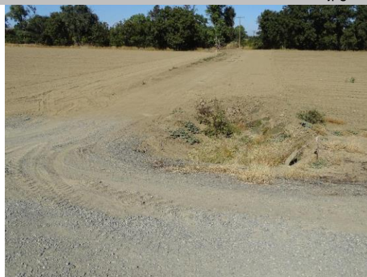
View of WS looking from levee crown