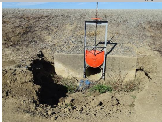
WS levee slope, headwall, and slide gate