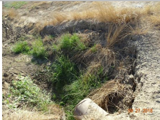
View of erosion on the levee slope appears to be due to water from the pipe and trench (September 2018).