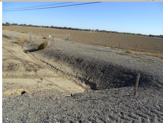
View of LS looking from levee crown