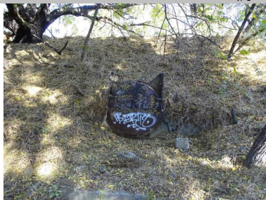
WS levee slope, headwall, and flap gate