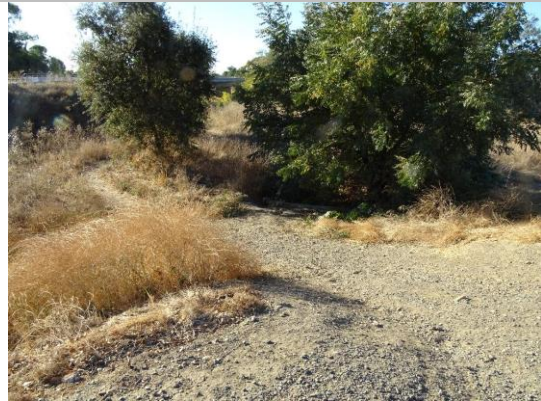
View of WS looking from levee crown