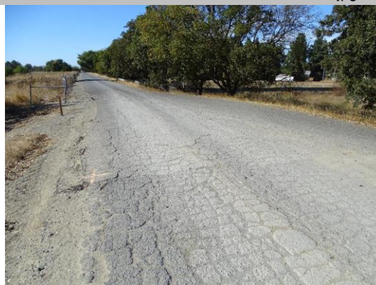
View of levee crown at the crossing