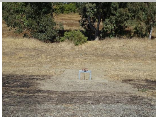
View of WS looking from levee crown