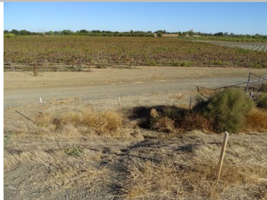
View of LS looking from levee crown