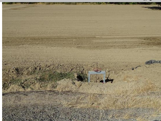
View of WS from levee crown