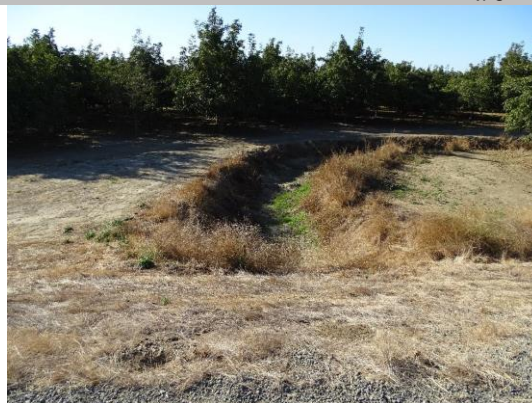
View of LS looking from levee crown