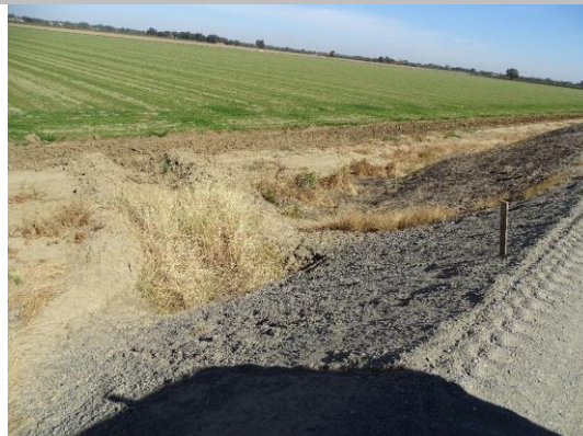
View of LS looking from levee crown