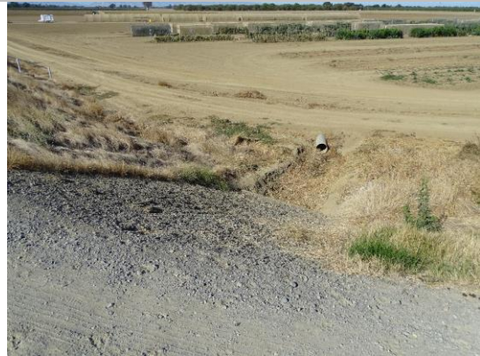
View of LS looking from levee crown