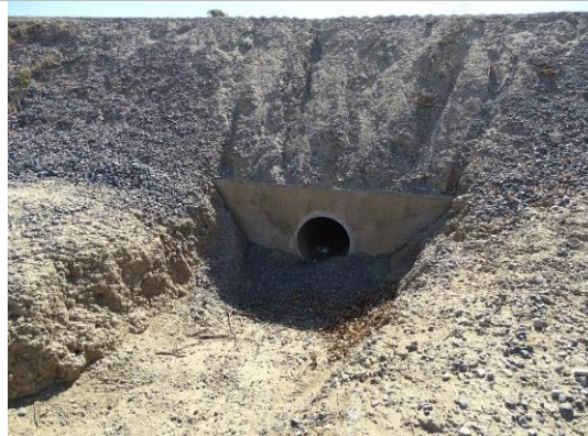
LS levee slope, headwall, and pipe end