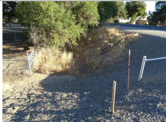
View of LS looking from levee crown