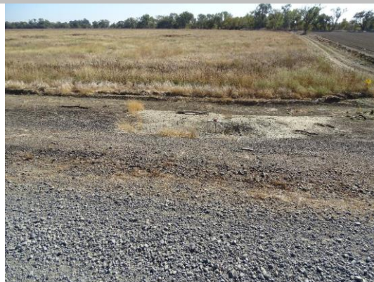
View of WS looking from levee crown