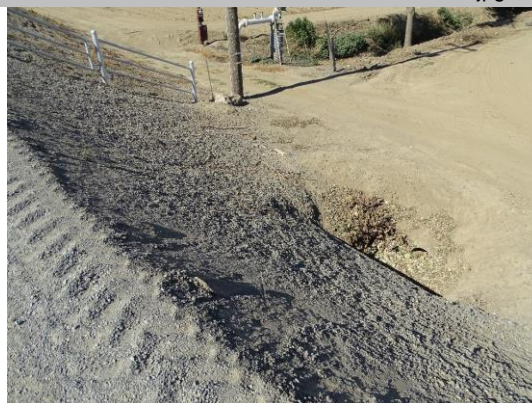
View of LS looking from levee crown