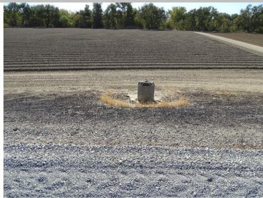
View of WS looking from levee crown