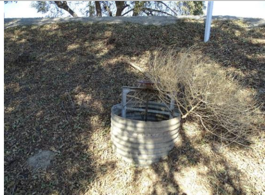
36-inch CMP standpipe with slide gate at WS levee toe