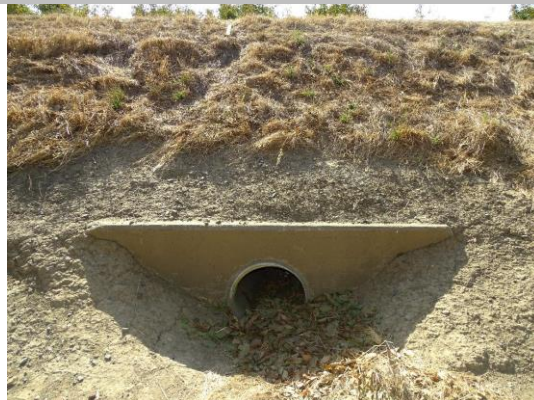
LS levee slope, headwall, and pipe end