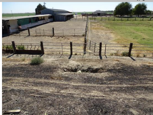
View of LS looking from levee crown