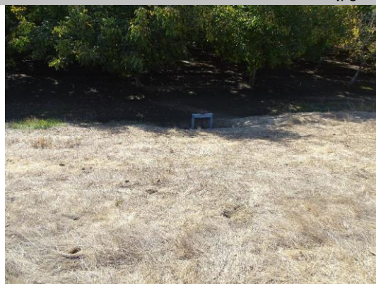
View of WS looking from levee crown