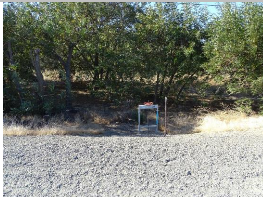
View of WS looking from levee crown