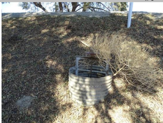
36-inch CMP standpipe with slide gate at WS levee toe