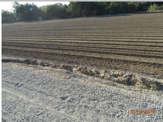
View of vehicle track depression on waterside shoulder (Fall 2019).

* Location LS : Land Side N/A : Not Applicable WS : Water Side CR : Crown