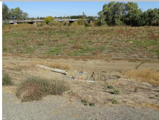
View of WS from levee crown