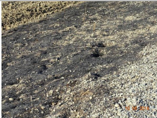
View of animal holes on the waterside slope (Fall 2019).