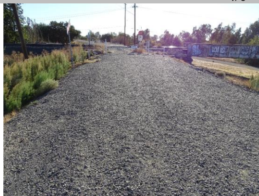
View of levee crown at the crossing