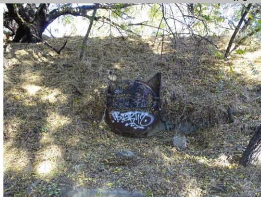
WS levee slope, headwall, and flap gate