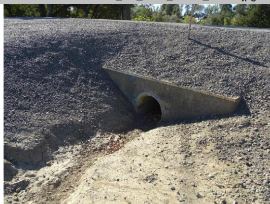
LS levee slope, headwall, and pipe end