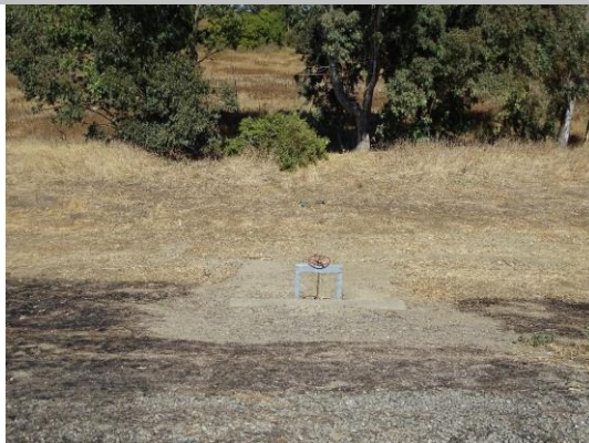
View of WS looking from levee crown