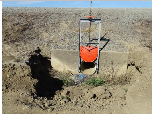
WS levee slope, headwall, and slide gate