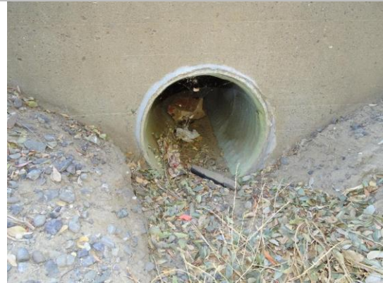
LS levee slope, headwall, and pipe end