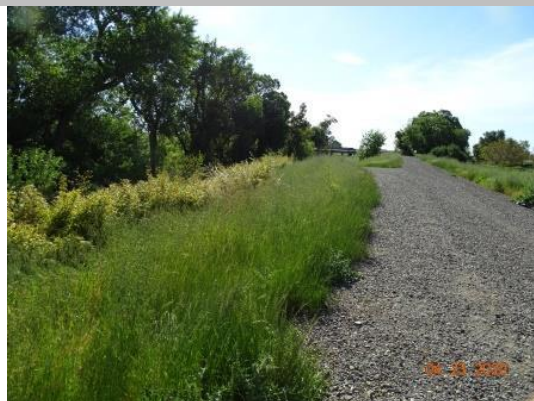
View looking downstream at annual vegetation on the waterside slope (Spring 2020).