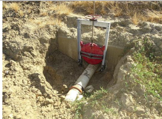
Headwall and slidegate at WS toe with a PVC pipe running through