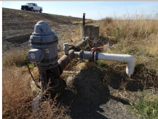
Water well connected to standpipe at LS toe. Top of headwall is visible