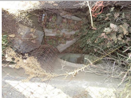
LS: headwall and pipe end near a fence