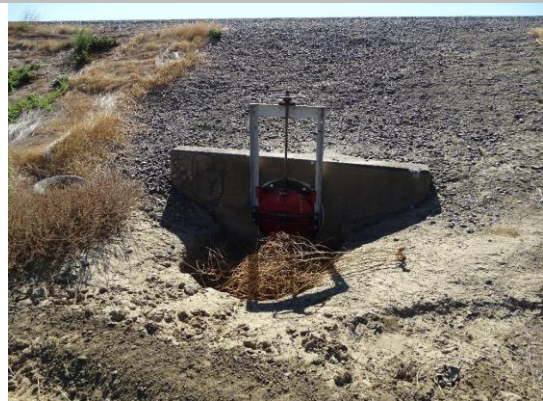
WS levee slope, headwall, and slide gate