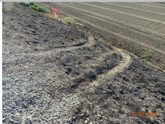
View of vehicle tracks on the waterside slope (Fall 2019).