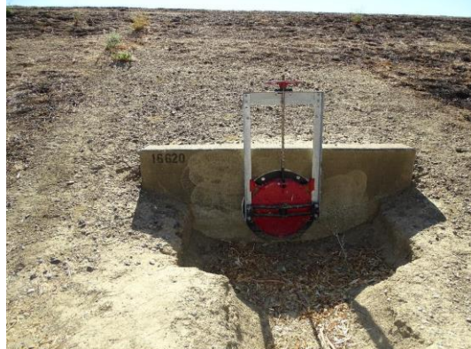
WS levee slope, headwall and slide gate