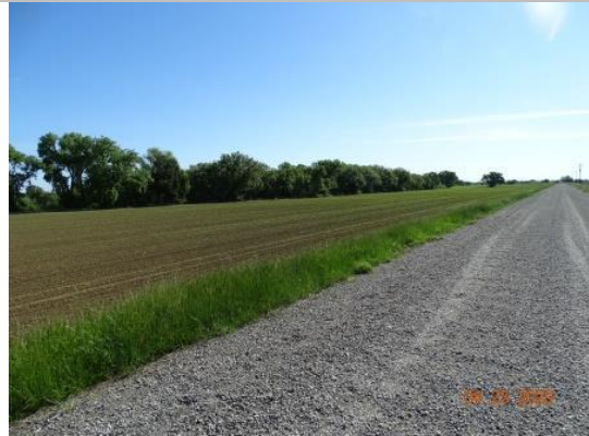
View looking downstream at annual vegetation on the waterside slope (Spring 2020).