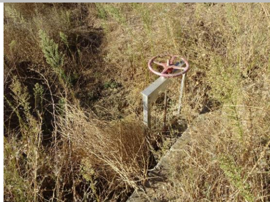
WS: headwall and slide gate