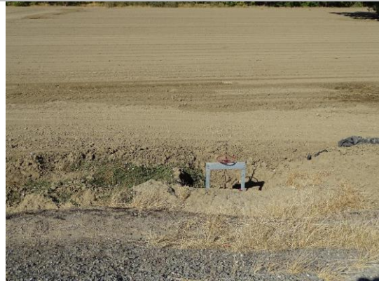
View of WS from levee crown