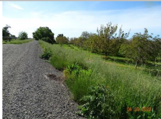
View looking downstream at annual vegetation on the landside slope (Spring 2020).

* Location LS : Land Side N/A : Not Applicable WS : Water Side CR : Crown