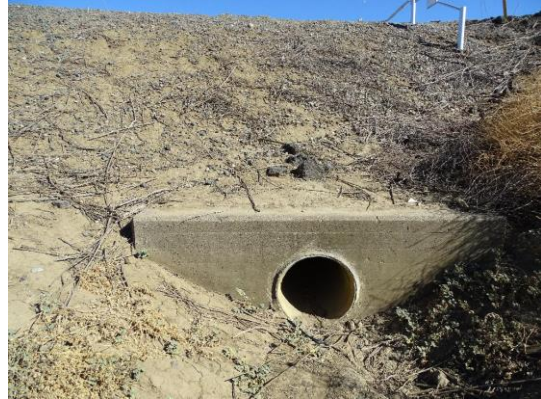
LS levee slope, headwall and pipe