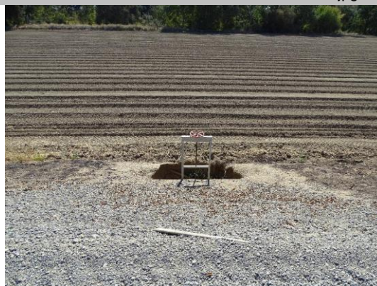
View of WS looking from levee crown