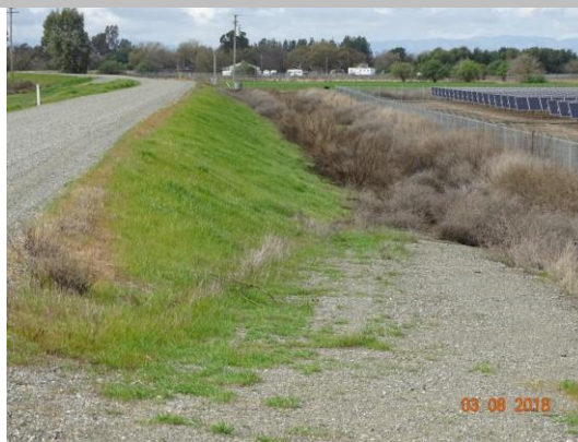
Large weeds at levee toe are dead, but should be removed to allow inspection and access.