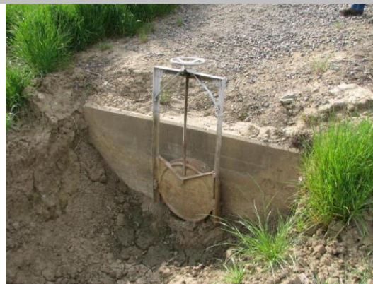
WS headwall and slidegate