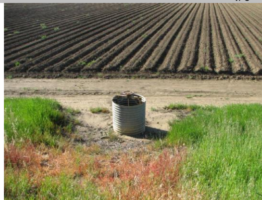
Slide gate in 36-inch Standpipe on WS toe.