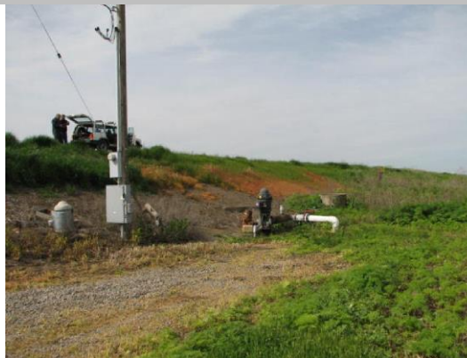
LS pump and appurtenances