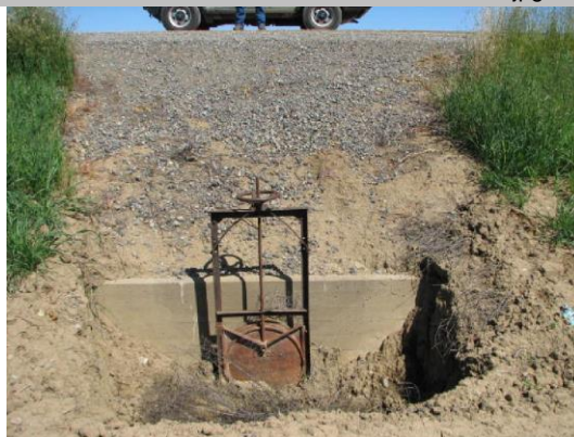
WS headwall and slidegate