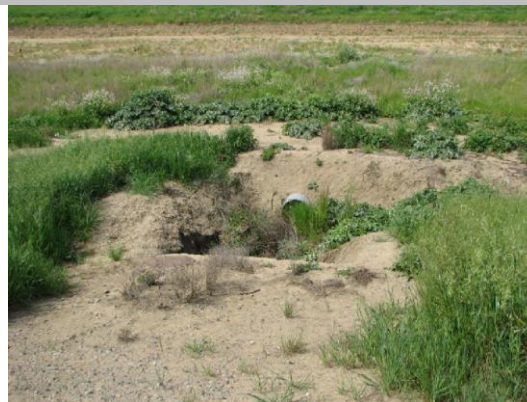
L/S headwall at pipe