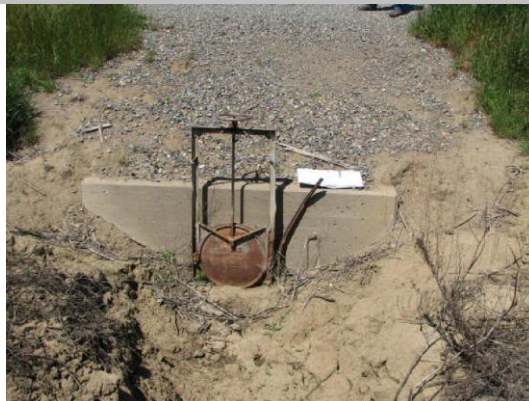
WS Slide Gate