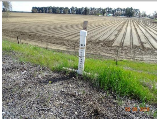
Rodent bait station at LM 2.09.