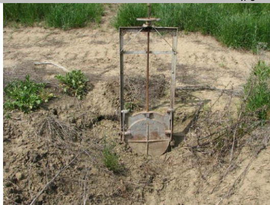
W/S slide gate