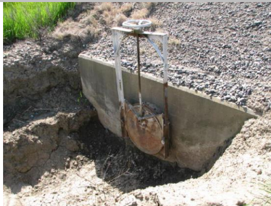
WS headwall and slide gate