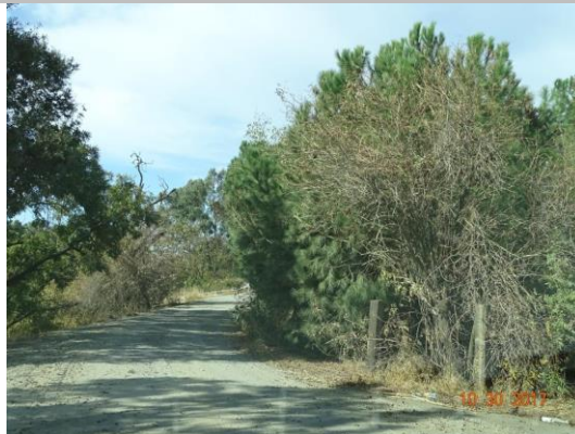
Trees and bushes on landside block visibility and access. Includes elderberries.