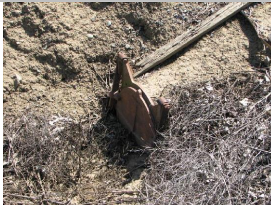
WS Flapgate blocked by sedimentation