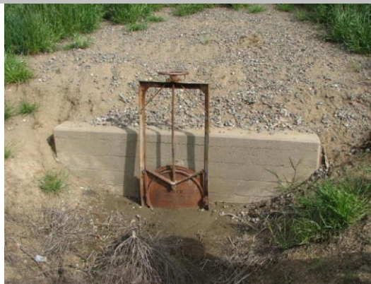
WS slide gate and headwall