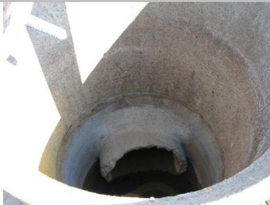
LS looking down standpipe at CC pipe