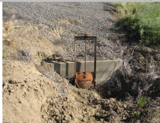
WS slide gate