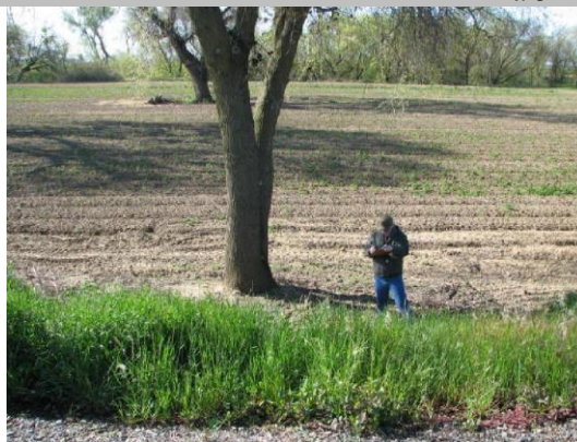
WS toe looking down from shoulder