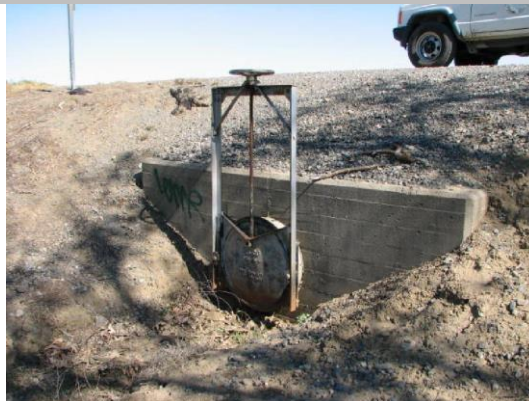
WS headwall and slidegate