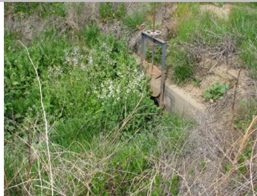
WS slide gate with vegetation