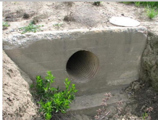
L/S headwall and pipe