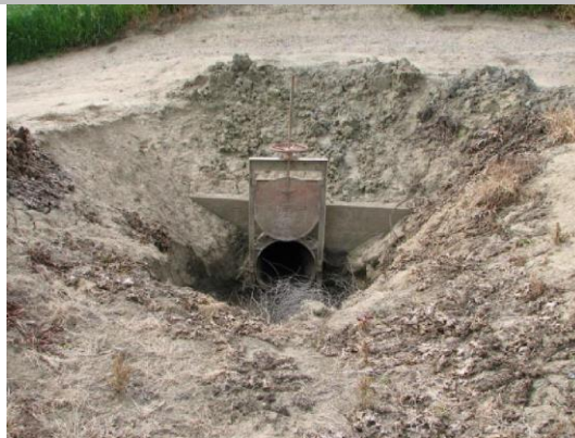
WS slide gate