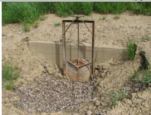
WS Slide gate