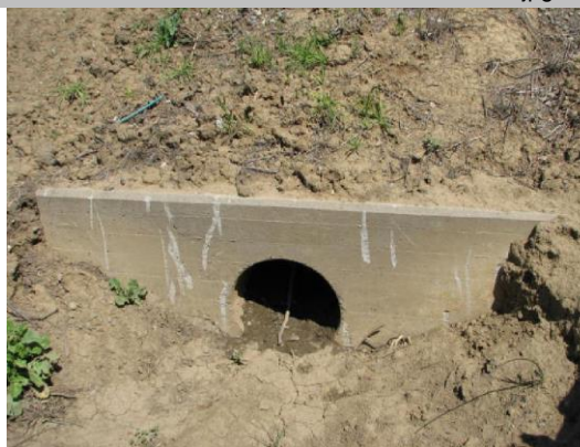
LS headwall showing soil plug