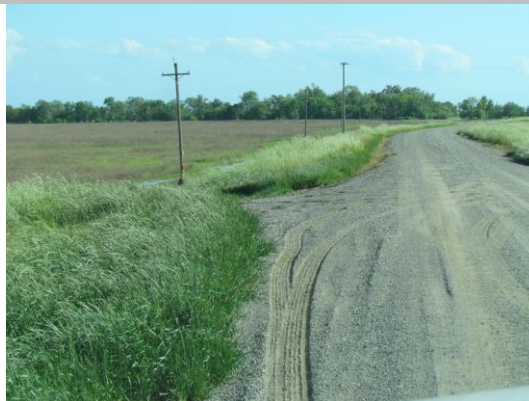
Looking upstream from levee mile 0.01 waterside levee shoulder. Tall weeds present on the levee section.