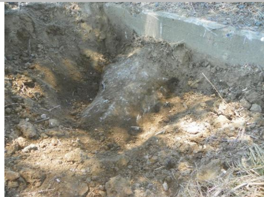
Enter photo 5 description or comment here.