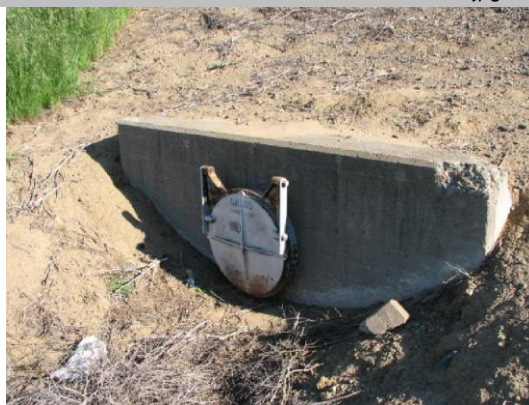
WS Flap Gate and headwall.