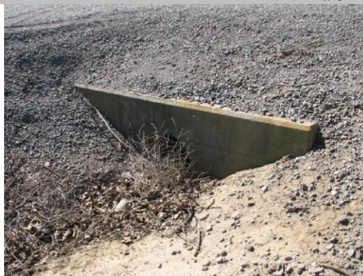
LS headwall showing partial blockage