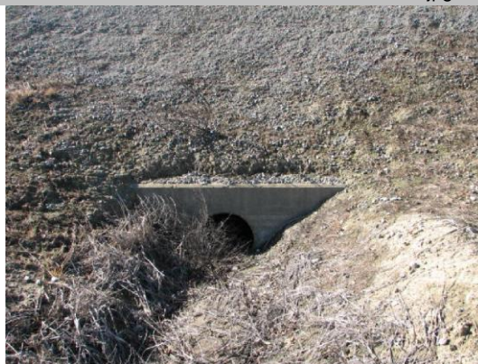
LS headwall showing debris