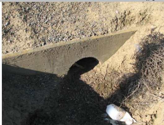
LS headwall showing pipe partially blocked with soil.