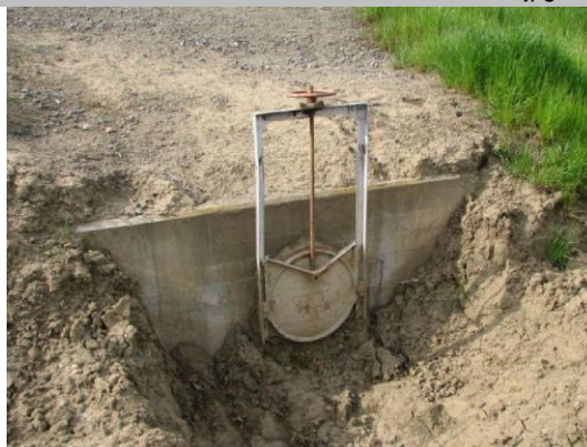
WS headwall and slide gate