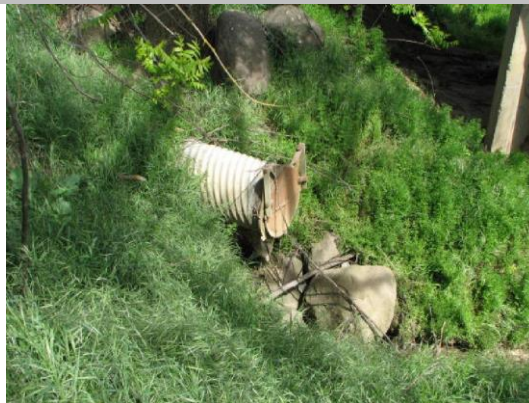
Outfall at creek with flap gate.