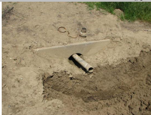
LS headwall showing sedimentation and 6-inch pipe sleeved through 24-inch pipe.