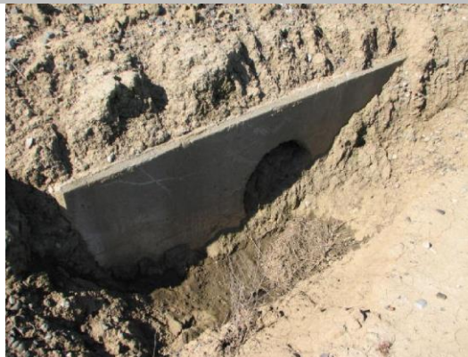
LS headwall showing pipe plugged with soil