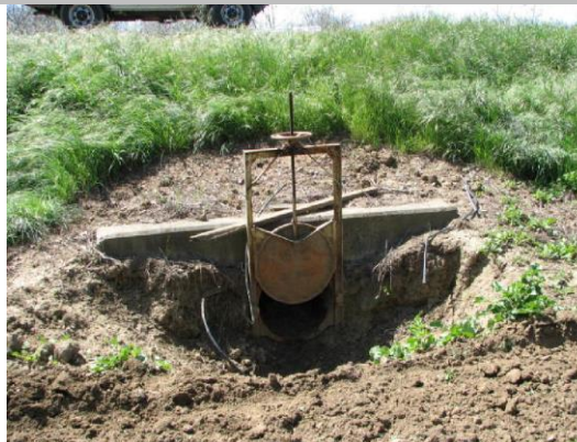
WS slide gate showing soil plug