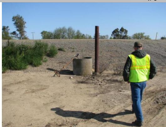
LS 36-inch standpipe