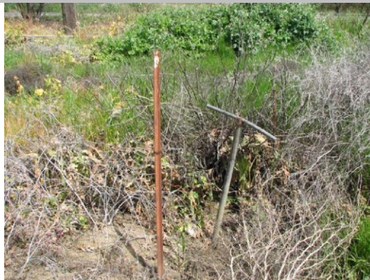
WS toe at T handle. No access to pipe.