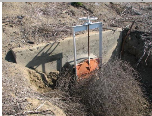
WS headwall and slide gate