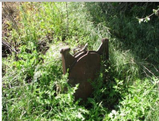
WS flap gate