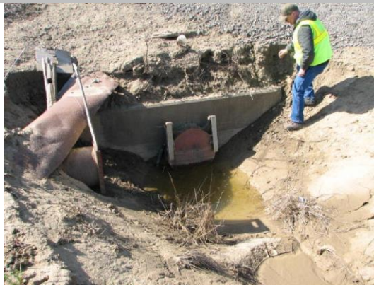
WS headwall and flapgate.