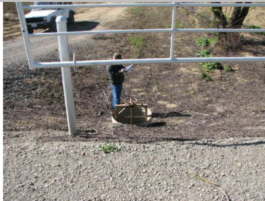
WS slide gate in 36-inch cmp standpipe