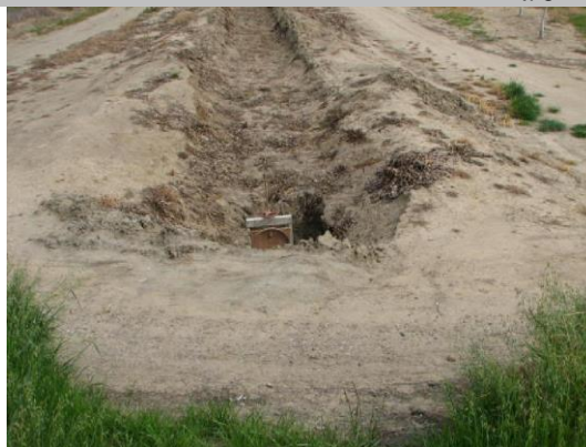
WS Channel and Slide gate