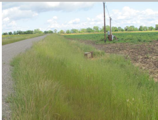
Looking upstream from levee mile 0.01 Unit 2 waterside slope.