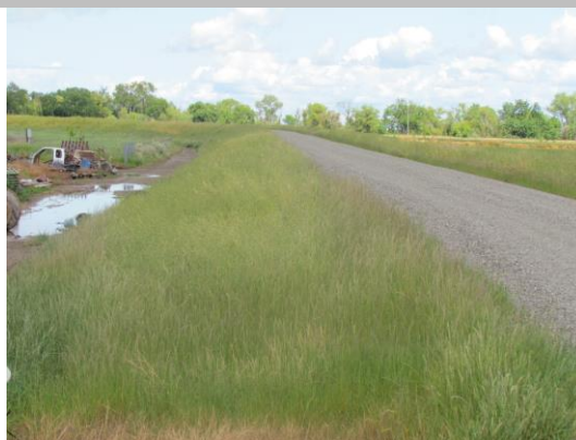
Looking upstream from levee mile 0.01 landside shoulder at the weed growth on the landward slope.