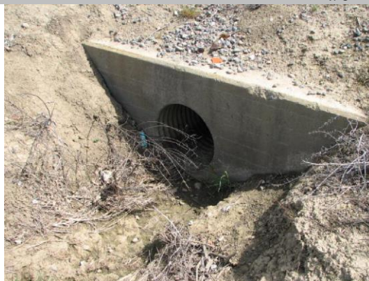
LS headwall and pipe