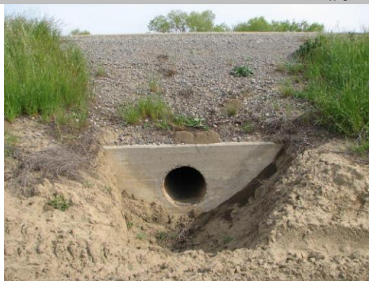
LS headwall and pipe