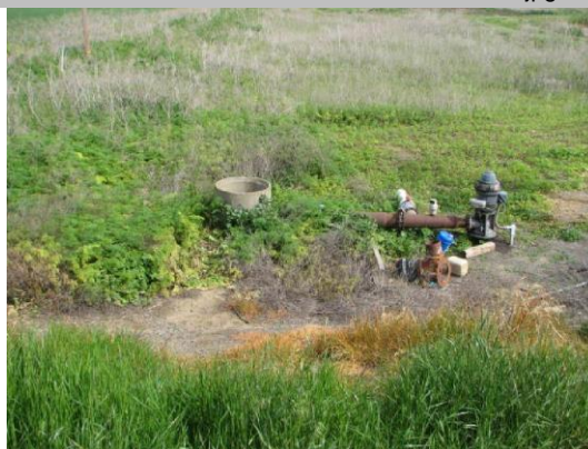
LS pump and appurtenances