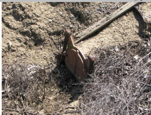
WS Flapgate blocked by sedimentation