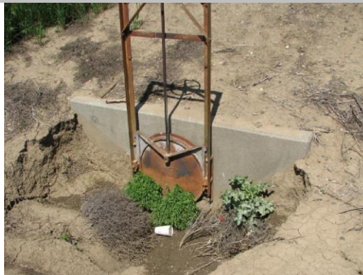
LS slide gate