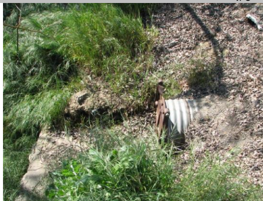
WS flap gate