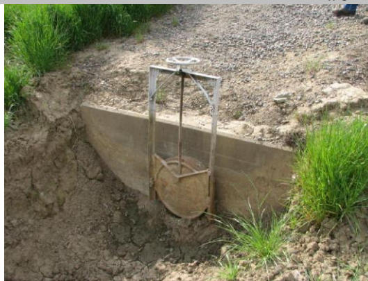
WS headwall and slidegate