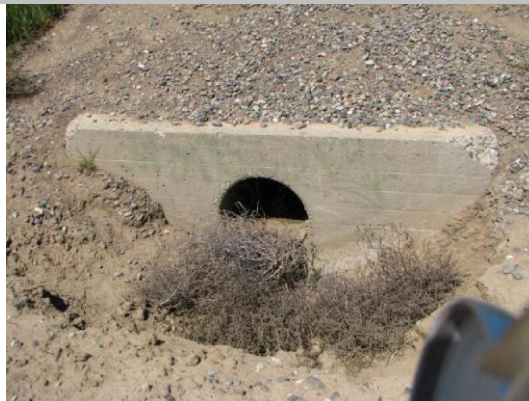
LS headwall and pipe showing sediment buildup.