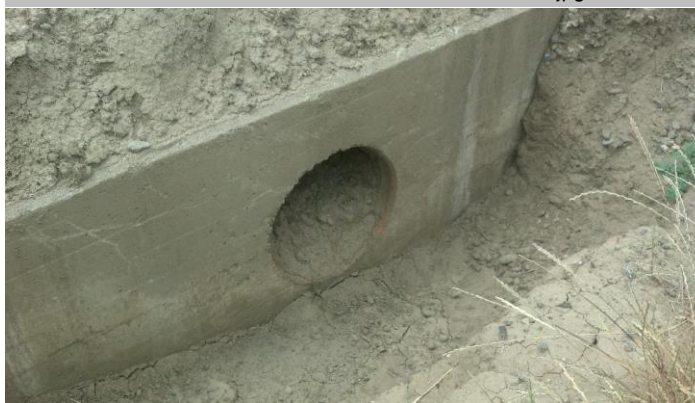
Enter photo 3 description or comment here.