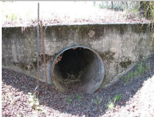
LS headwall and pipe before steel plate was installed over pipe to abandon it.