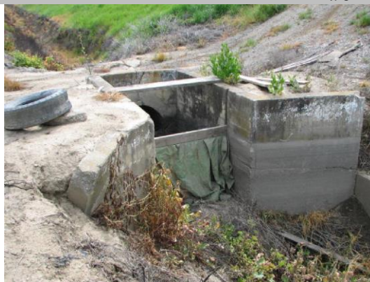
LS distribution box