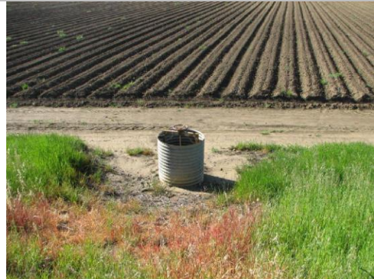
Slide gate in 36-inch Standpipe on WS toe.