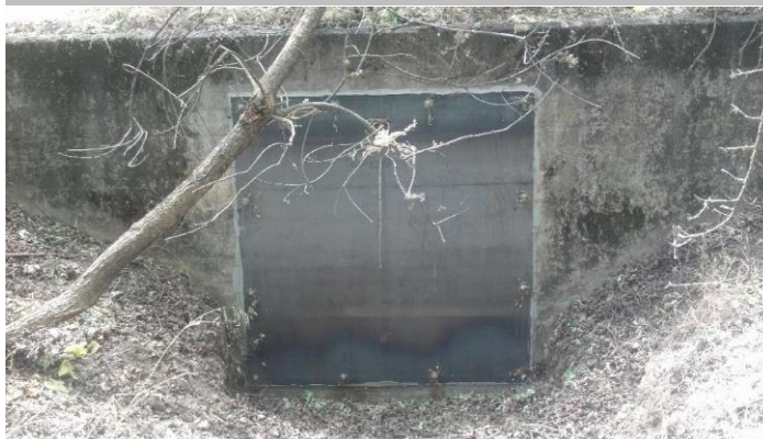
Steel plate installed over pipe off LS toe.