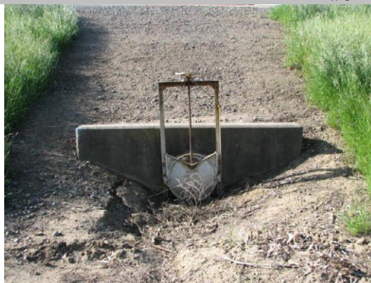
W/S positive closure device