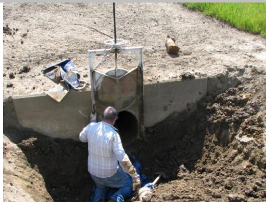
WS slide gate and headwall. 6-inch irrigation pipe just inside 24-inch pipe.