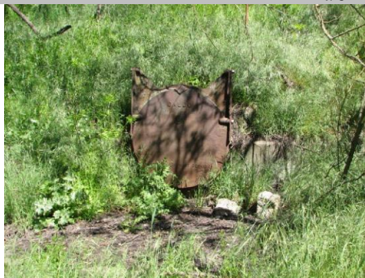
WS flap gate