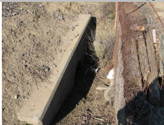
LS headwall showing fence and soil buildup.