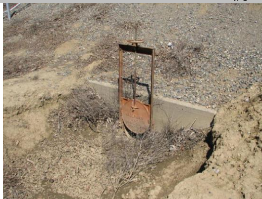
WS slide gate