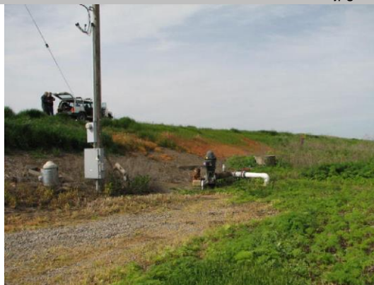
LS pump and appurtenances