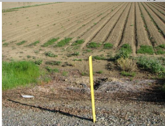
LS shoulder looking down on headwall