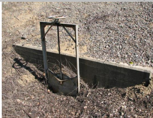
WS slide gate showing some blockage with soil.