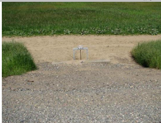
WS slide gate