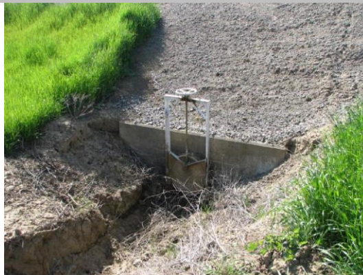
WS slide gate and headwall