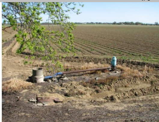
LS pump and stand pipe