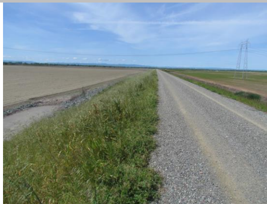
View of vegetation on the waterward side of the levee looking upstream. Spring 2015.