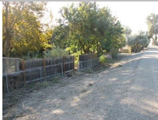
The landscaping and fence are obstructive to viewing the levee toe. Fall 2011