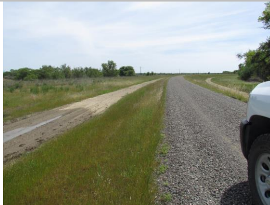
View of vegetation on the landward side of the levee looking upstream. Spring 2015.