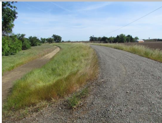
View of the vegetation on the waterward side of the levee looking downstream. Spring 2015.