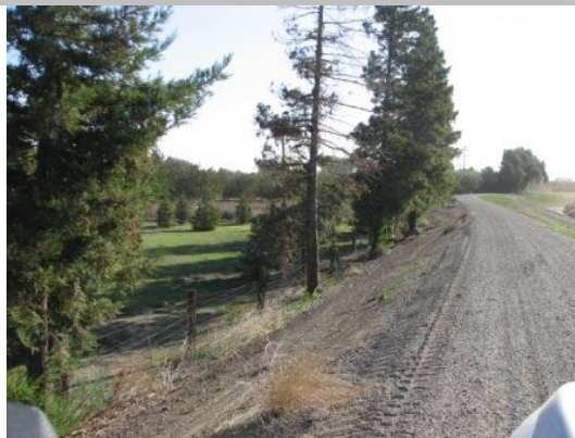
Landscape trees are planted along the levee to and on the slope. Some of the trees are trimmed up for visibility. Fall 2011