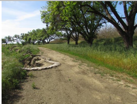
The view of the erosion from a distance. Spring 2015.