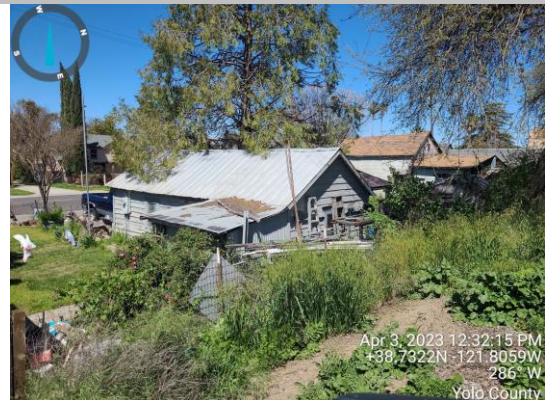
View of building within landside easement. Spring 2023.