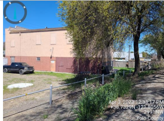
View of building within landside easement. Spring 2023.