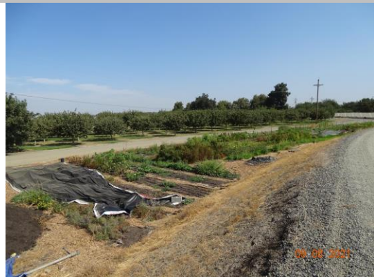
View of garden at landside toe. Fall 2021.