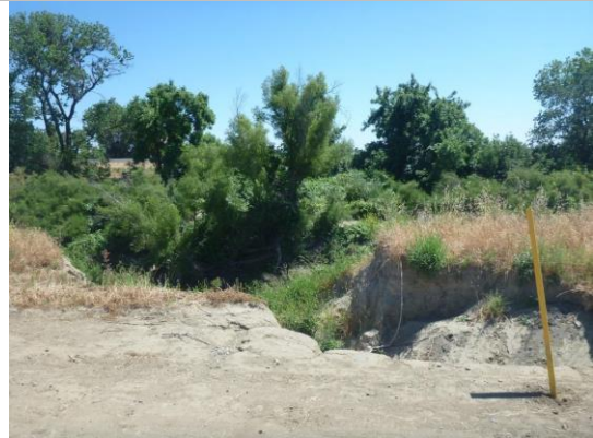
View of erosion near waterside toe road.