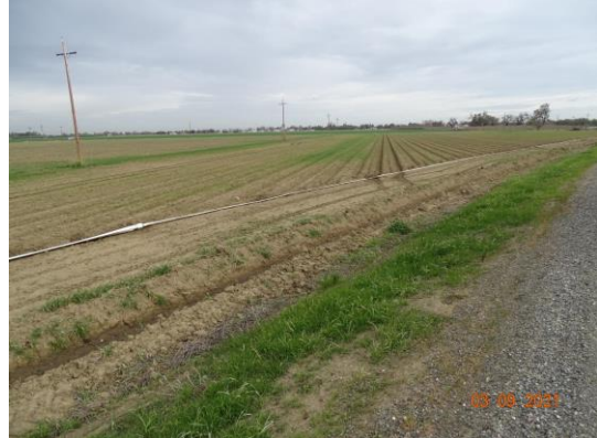
View of irrigation ditch near the landside toe. Spring 2021.