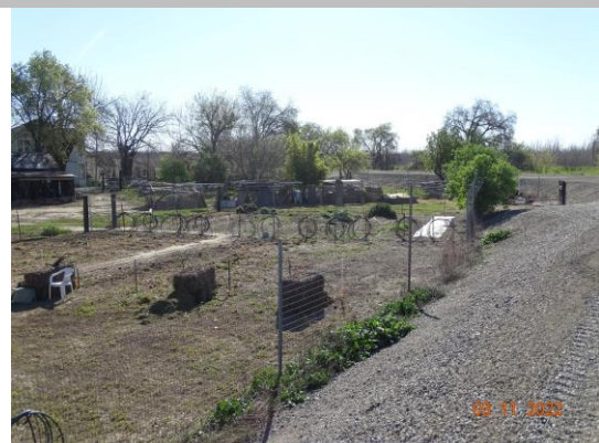
Chain fence at the landside levee toe. Spring 2022.