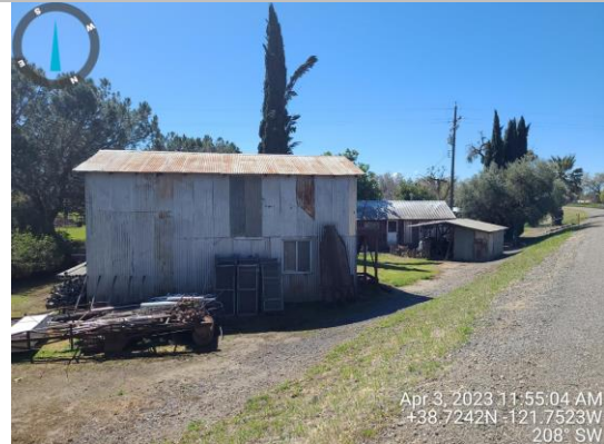
View of building within the landside easement. Spring 2023.