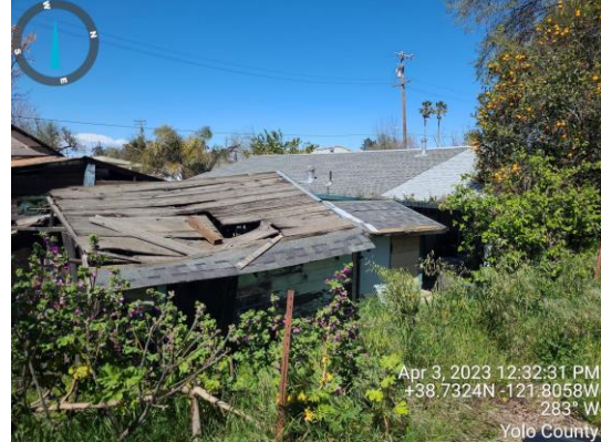
View of building within landside easement. Spring 2023.