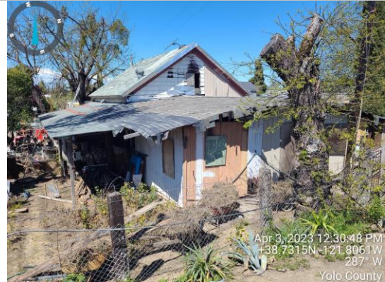
View of building within landside easement. Spring 2023.