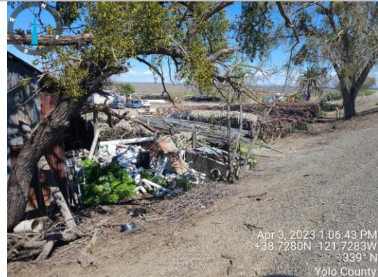
View of equipment on landside toe. Spring 2023.