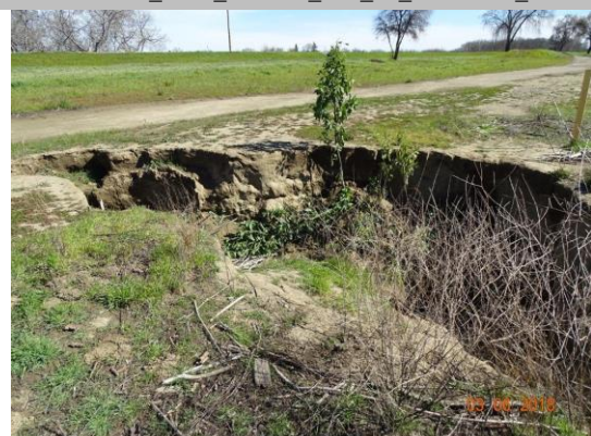
View of erosion looking towards the landside levee slope, facing northeast. Spring 2018.