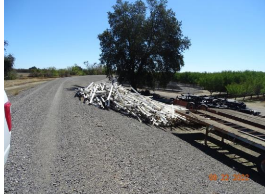
View of equipment on the landside shoulder. Fall 2022.