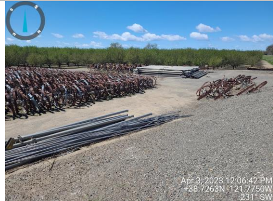
View of pipes and equipment on the landside toe. Spring 2023.