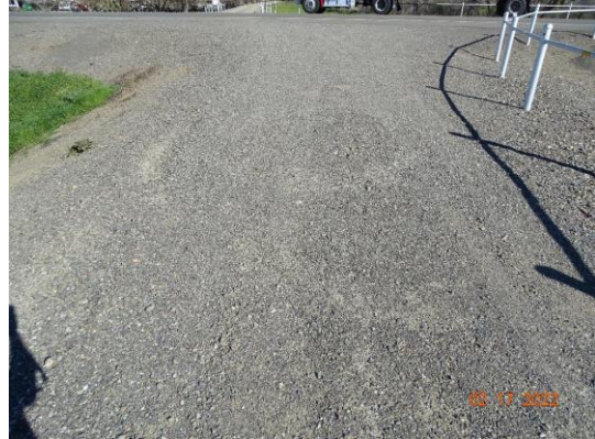
Top of Levee: View of levee crown looking downstream