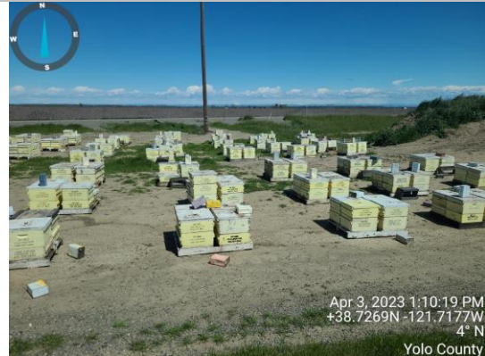
Beehives within the landside easement. Spring 2023.