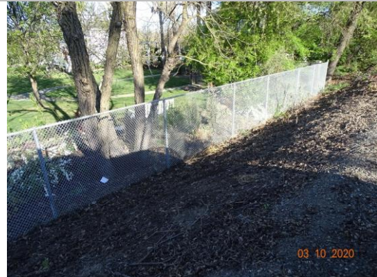
View of fence at the landside toe. Spring 2020.