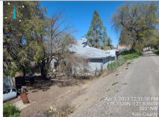
View of house within landside easement. Spring 2023.