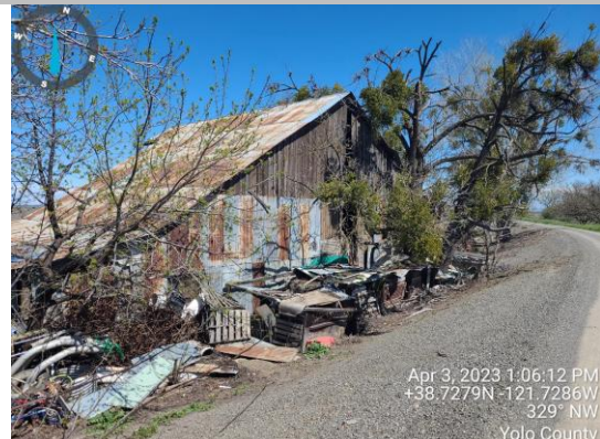
View of building within landside easement. Spring 2023.