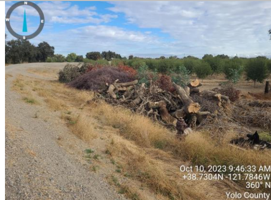
View of tree at the landside toe. Fall 2023.