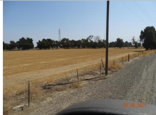
View of fence at landside toe. Fall 2021.