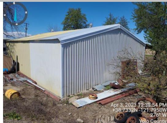
View of building on landside easement. Spring 2023.