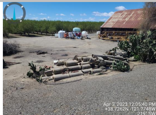
View of pipes on the landside toe. Spring 2023.