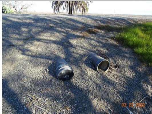
Water-Side: pipes on levee slope. Cap is installed on pipe end