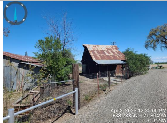
View of horse barn and corral within landside easement. Spring 2023.