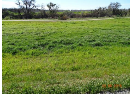
View of erosion from levee crown, facing Cache Creek. Fall 2018.