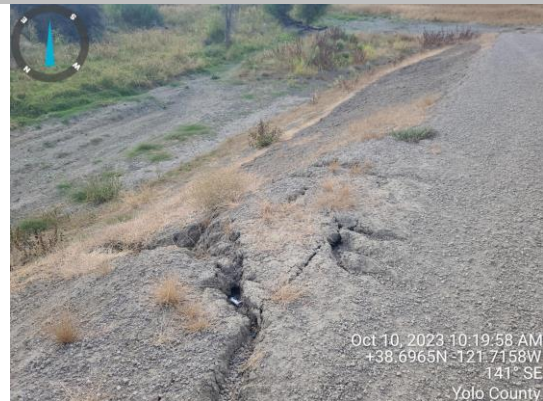
View of erosion on the landside slope and toe. Fall 2023.