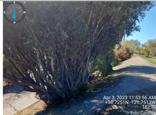
View of vegetation on the landside slope. Spring 2023.