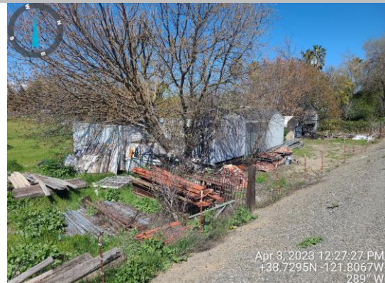
View of equipment on the landside easement. Spring 2023.