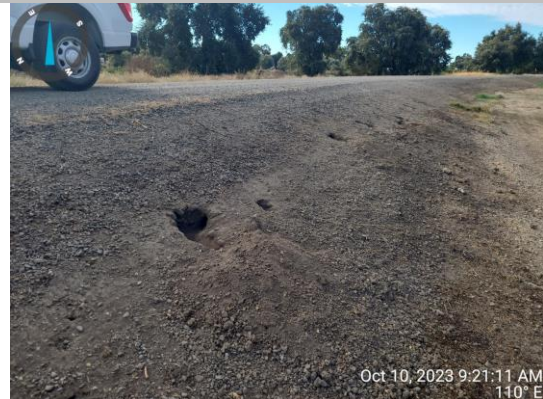
View of rodent holes on the landside slope. Fall 2023.