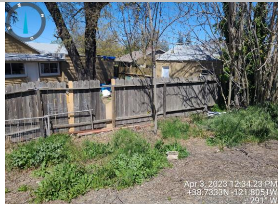
View of the fence within landside easement. Spring 2023.