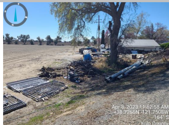
View of equipment on the landside toe. Spring 2023.