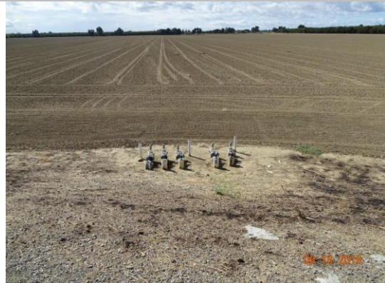
View of the pumps, air valves, and bollards at the landside toe. Fall 2019.