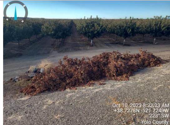
View of the pruning pile on the landside slope. Fall 2023.