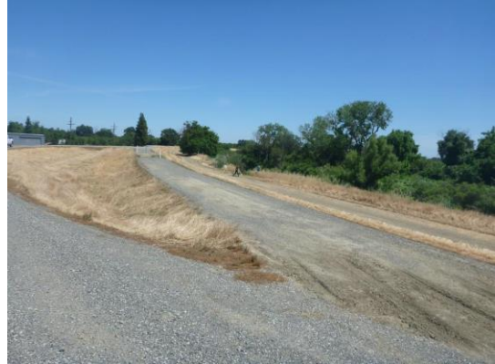
View of toe road where erosion is located.