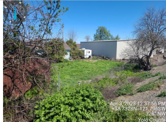
View of wire fence on landside easement. Spring 2023.