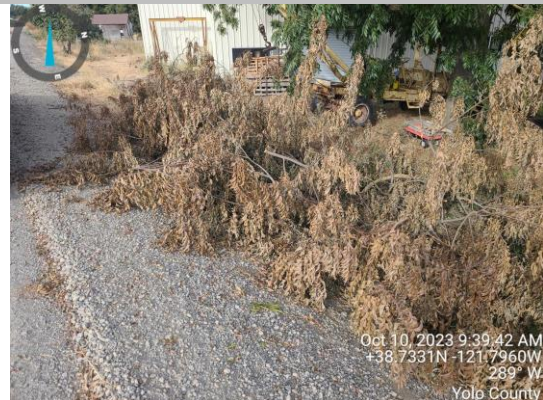
View of tree limbs on the landside slope. Fall 2023.