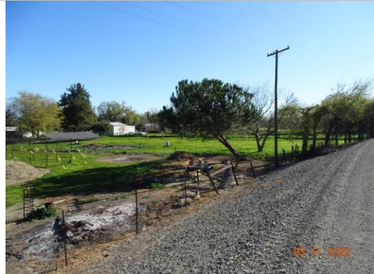
Barbed wire fence at the landside levee toe. Spring 2022.