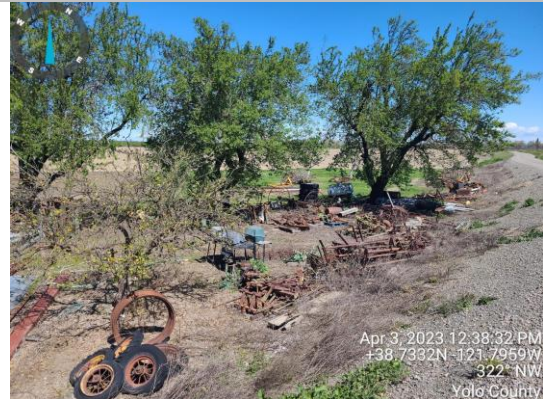
View of equipment on landside toe. Spring 2023.