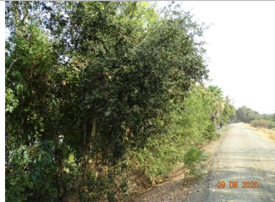
View of the landscaping on the landward side of the levee looking downstream. Fall 2020.