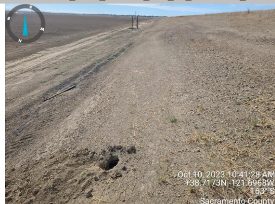
View of rodent hole on the landside slope. Fall 2023.