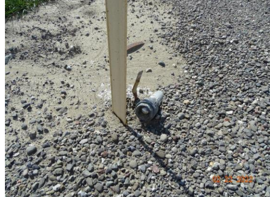
Water-Side: Air vent on levee shoulder