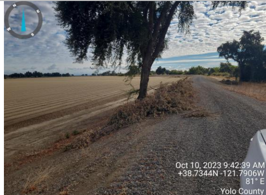
View of tree limbs on the landside slope. Fall 2023.