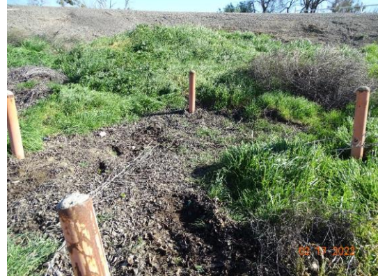
Land-Side: Manholes covered with vegetation and debris