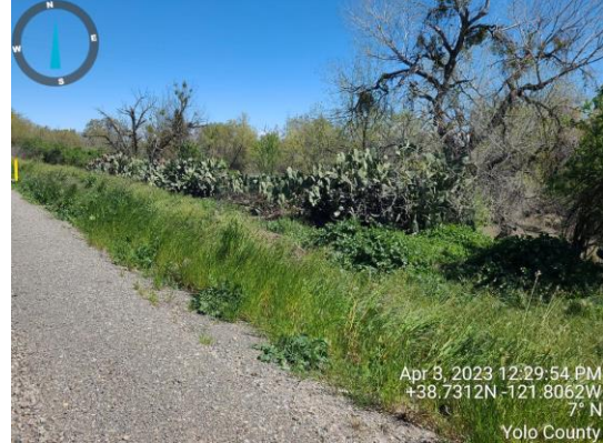
View of cactus on the waterside slope. Spring 2023.