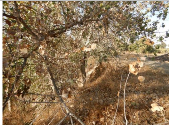
USACE 2018 Erosion Photo #1