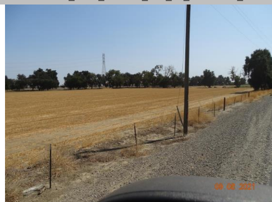
View of fence at landside toe. Fall 2021.

Photo 1 of 1 : FA_2022_ST0001_260_15_20220921_00009.jpg