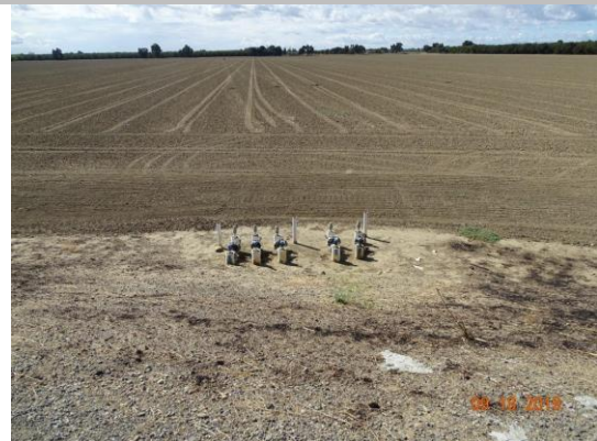
View of the pumps, air valves, and bollards at the landside toe. Fall 2019.