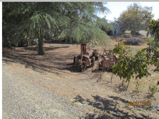
View of the equipment at the toe of the landward side of the levee. Fall 2015.