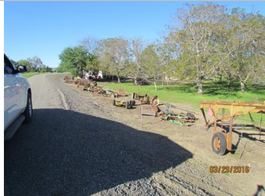
View of the equipment on the landward side of the levee looking upstream. Spring 2016.