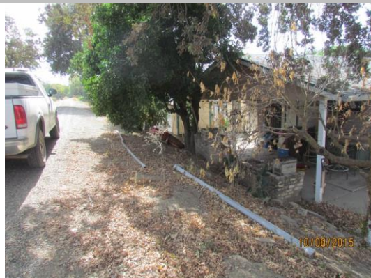
View of the building on the landward side of the levee looking upstream. Fall 2015.