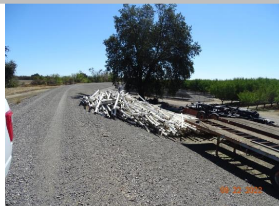
View of equipment on the landside shoulder. Fall 2022.

Photo 1 of 1 : FA_2022_ST0001_260_29_20220929_00025.jpg