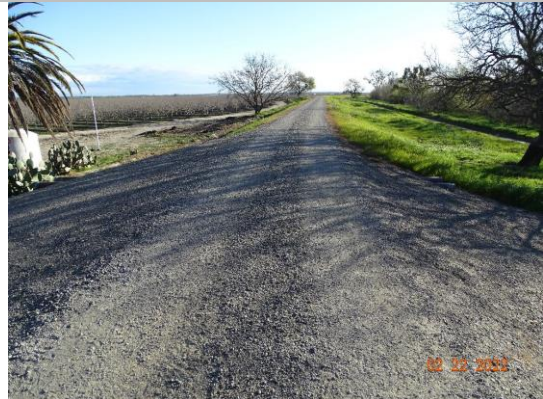
Top of Levee: View of levee crown looking downstream