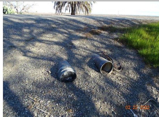
Water-Side: pipes on levee slope. Cap is installed on pipe end