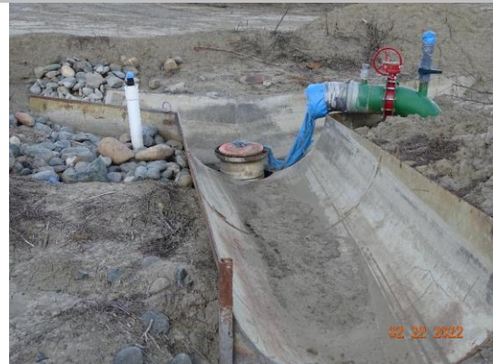
Water-Side: Capped pipe at irrigation ditch