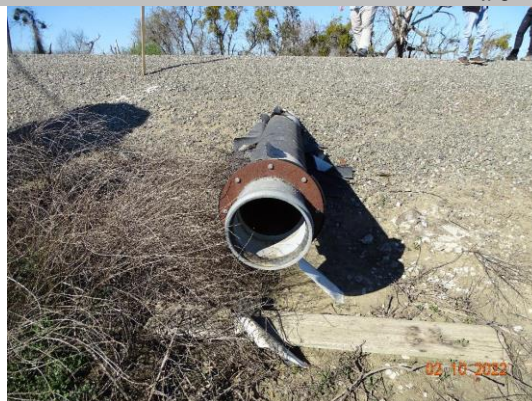
Land-Side: Pipe end open on landside