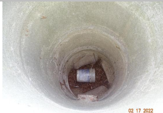
Water-Side: Concrete pipes inside concrete standpipe