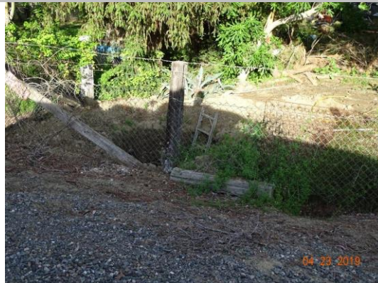
View of the hole within the landside easement. Spring 2019.

* Location LS : Land Side N/A : Not Applicable WS : Water Side CR : Crown