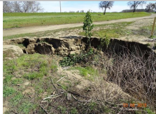
View of erosion looking towards the landside levee slope, facing northeast. Spring 2018.