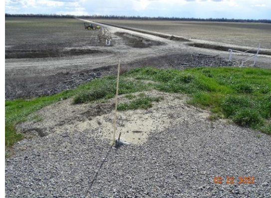
Water-Side: View of levee slope looking from crown