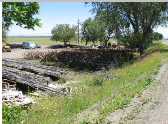
Irrigation pipe and equipment are within the easement of the levee.