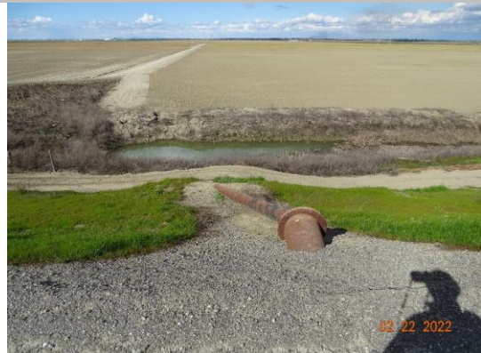
Land-Side: View of levee slope looking from crown