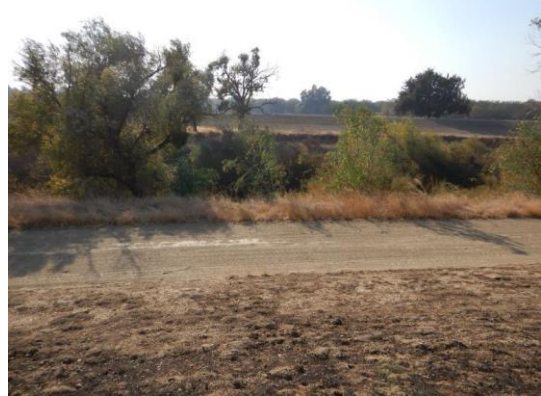
USACE 2018 Erosion Photo #1