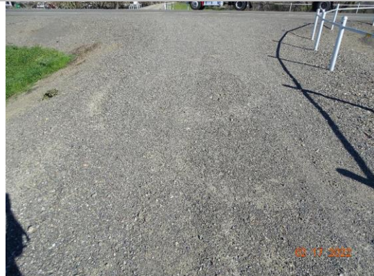
Top of Levee: View of levee crown looking downstream