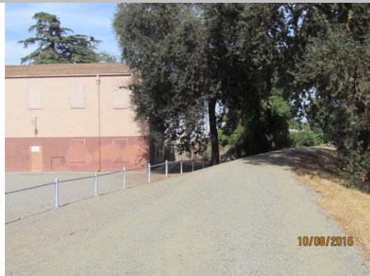
View of the building on the landward side of the levee looking downstream. Fall 2015.