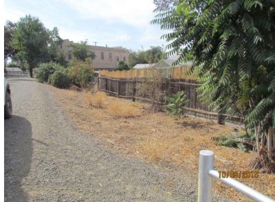
View of the fence on the landward side of the levee looking upstream. Fall 2015.