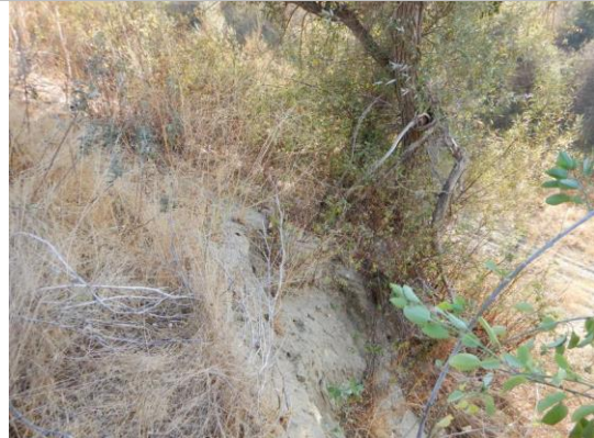
USACE 2018 Erosion Photo #2