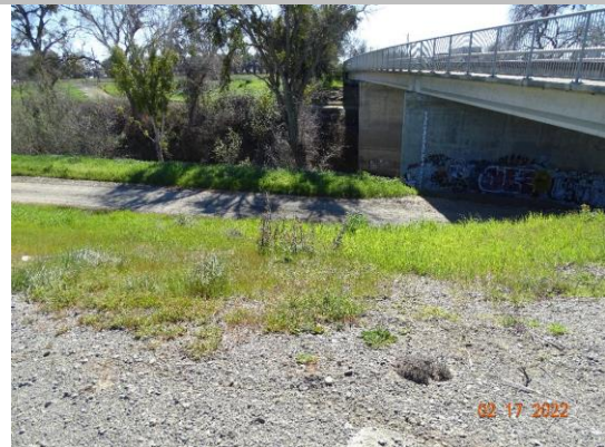
Water-Side: View of levee slope looking from crown