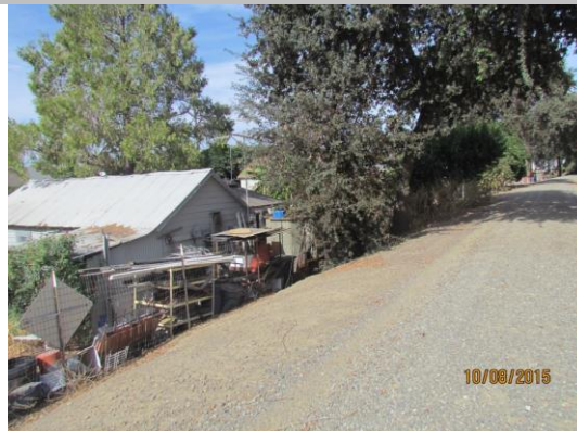
View of the building on the landward side of the levee looking downstream. Fall 2015.