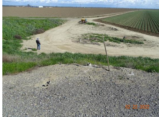
Land-Side: View of levee slope looking from crown. Water well in the