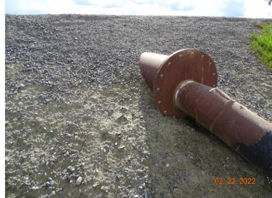
Land-Side: 11--inch pipe welder to flange joint on levee slope