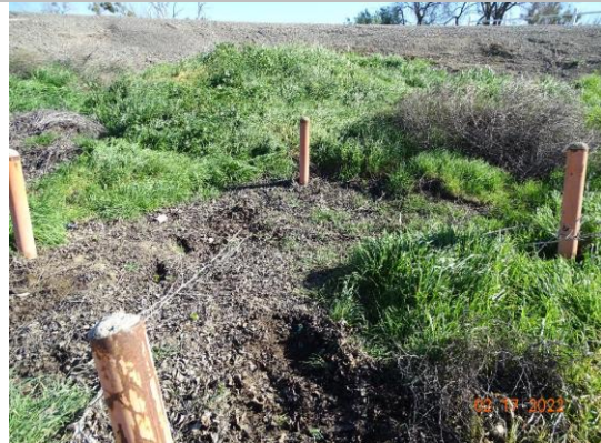
Land-Side: Manholes covered with vegetation and debris