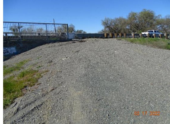
Top of Levee: View of levee crown looking upstream. State Hwy 113 on the background