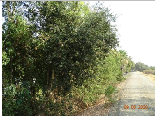
View of the landscaping on the landward side of the levee looking downstream. Fall 2020.