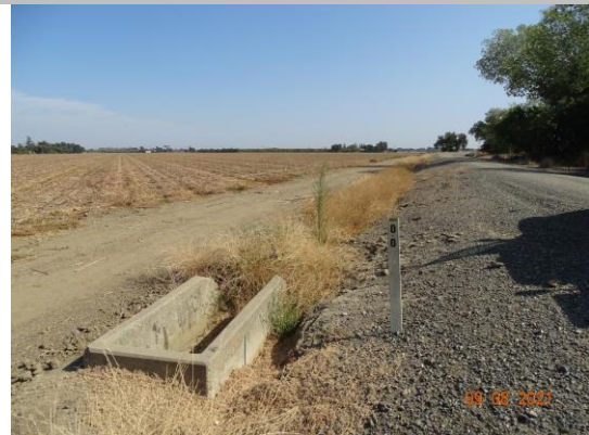
View of ditch at landside toe. Fall 2021.