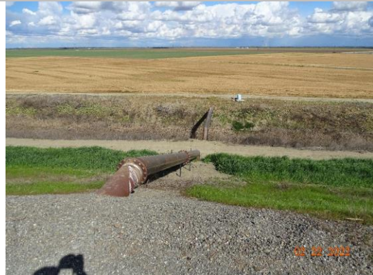
Land-Side: View of levee slope looking from crown. Pipe on the slope and over irrigation ditch