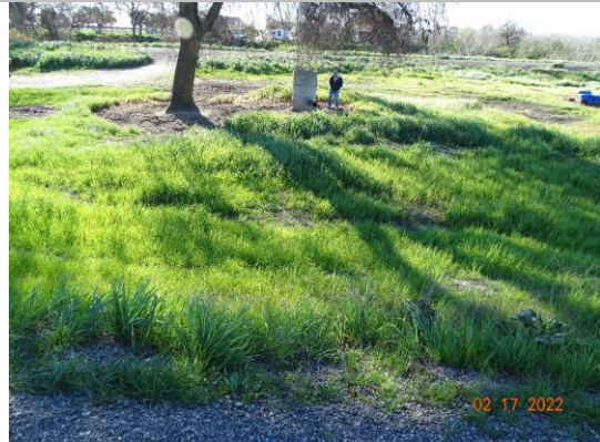
Water-Side: View of levee slope looking from crown