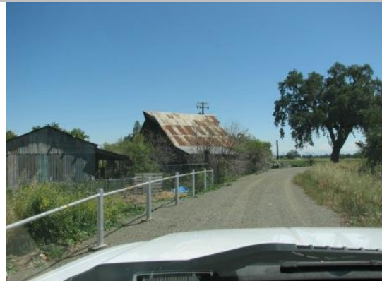
Horse barn and corral are within the easement of the levee.