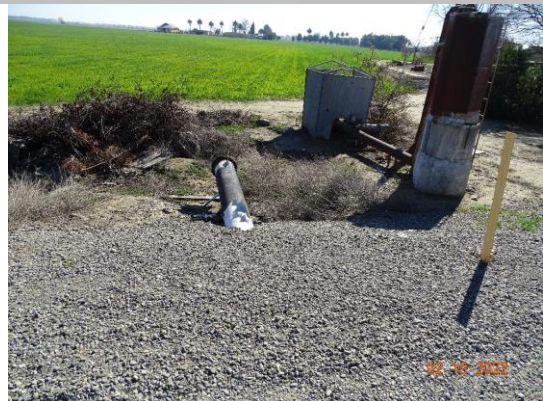
Land-Side: View of levee slope looking from crown