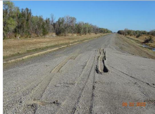
View of tire ruts on the crown. Fall 2022.