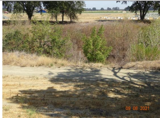
View of erosion on waterside toe road. Fall 2021.