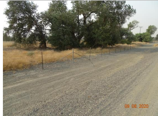
View of the fence near the toe road. Fall 2020.