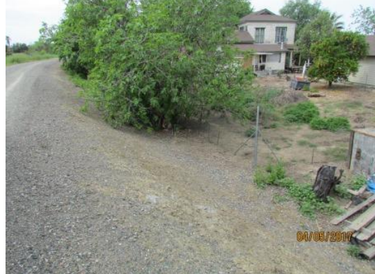
Chain fence at landside levee toe. Spring 2017.