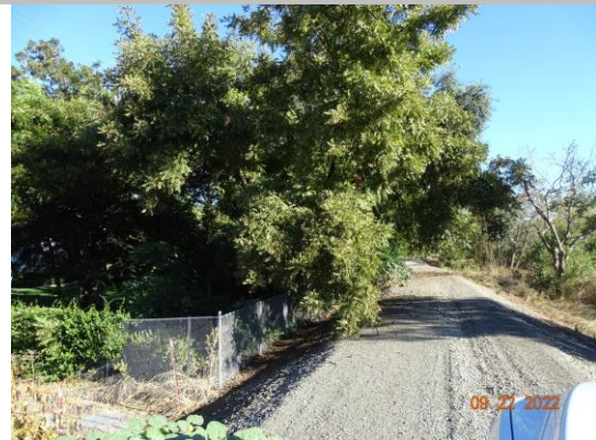
View of vegetation on the landside slope. Fall 2022.