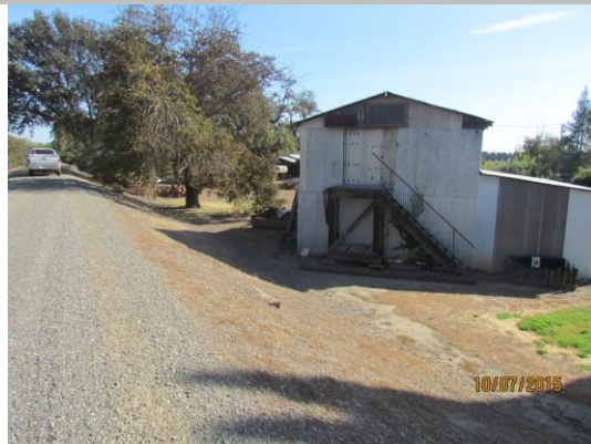
View of the building on the landward side of the levee looking downstream. Fall 2015.

* Location LS : Land Side N/A : Not Applicable WS : Water Side CR : Crown