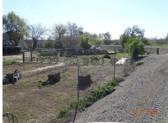
Chain fence at the landside levee toe. Spring 2022.