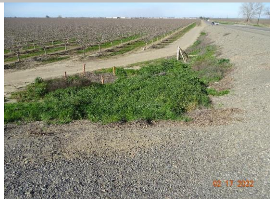
Land-Side: View of levee slope looking from crown