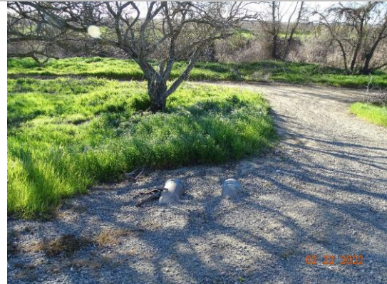
Water-Side: View of levee slope looking from crown