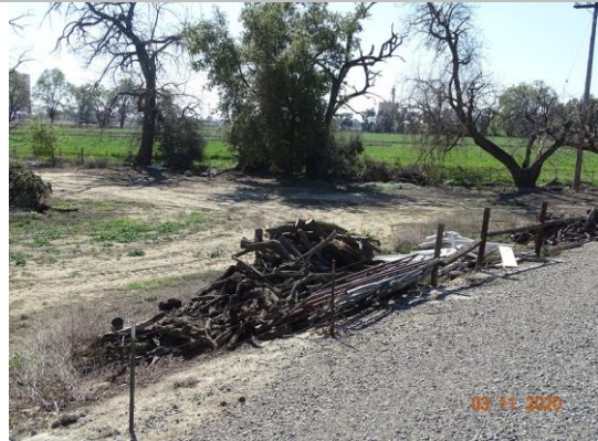
View of firewood pile. Spring 2020.