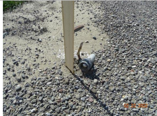
Water-Side: Air vent on levee shoulder