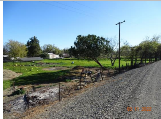
Barbed wire fence at the landside levee toe. Spring 2022.