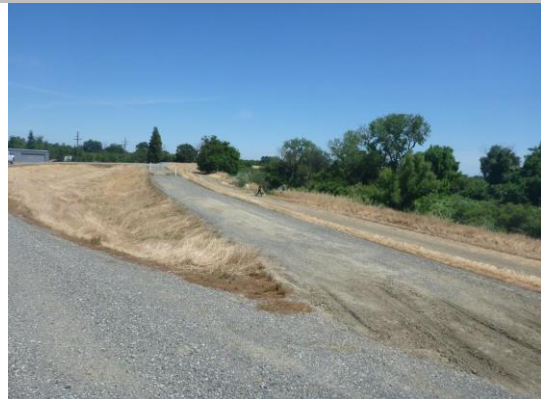
View of toe road where erosion is located.