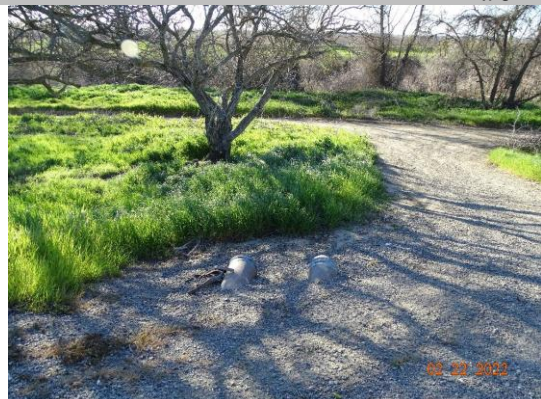
Water-Side: View of levee slope looking from crown