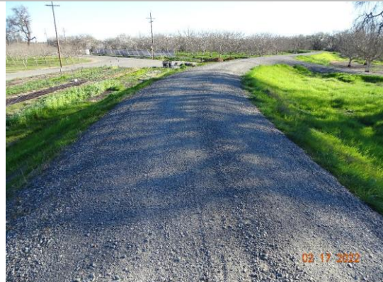
Top of Levee: View of levee crown looking downstream