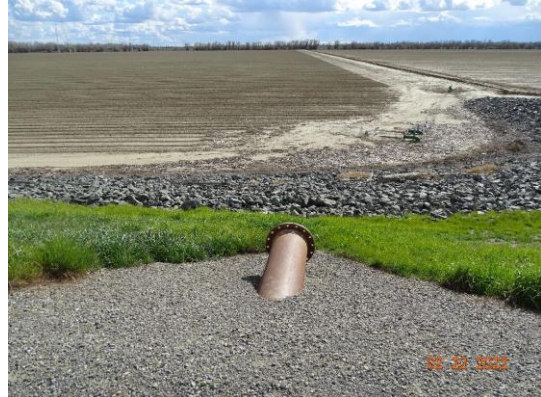
Water-Side: View of levee slope looking from crown. Pipe end is open