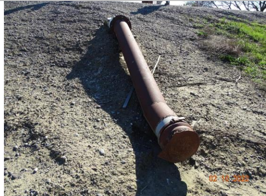
Water-Side: View of levee slope looking from toe. Capped pipe on the slope