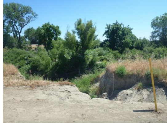
View of erosion near waterside toe road.