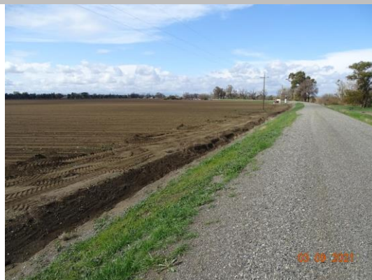
View of irrigation ditch at the landside toe. Spring 2021.

* Location LS : Land Side N/A : Not Applicable WS : Water Side CR : Crown