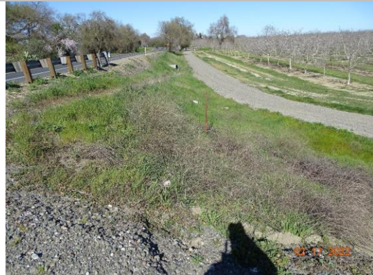
Land-Side: View of levee slope looking from crown