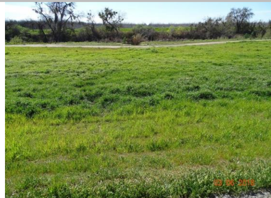
View of erosion from levee crown, facing Cache Creek. Fall 2018.