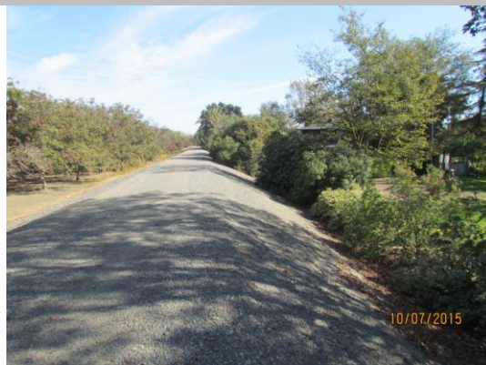
View of the landscaping vegetation on the landward side of the levee looking downstream. Fall 2015.

* Location LS : Land Side N/A : Not Applicable WS : Water Side CR : Crown