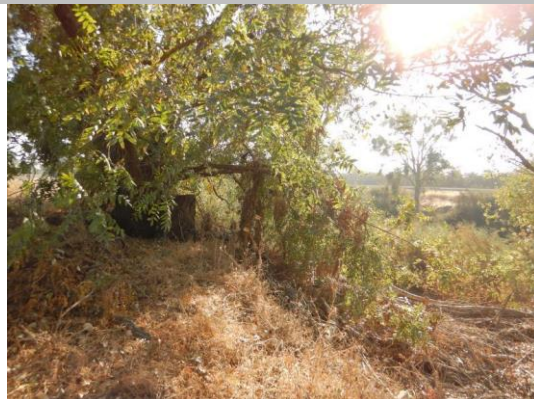
USACE 2018 Erosion Photo #2