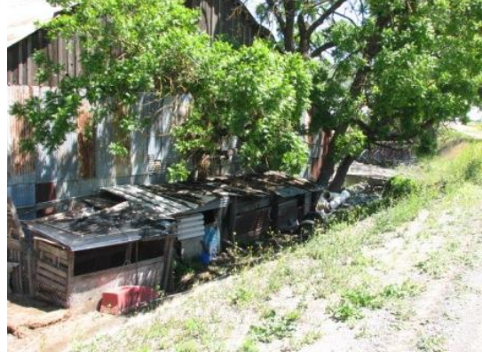
View of barn and livestock pens.