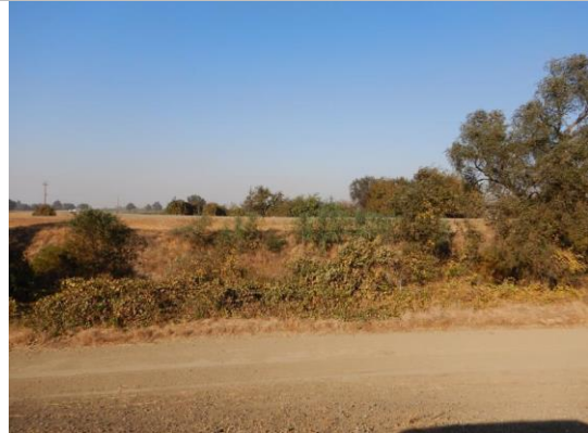
USACE 2018 Erosion Photo #1