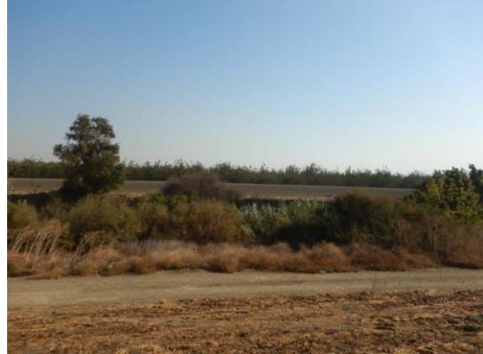
USACE 2018 Erosion Photo #1