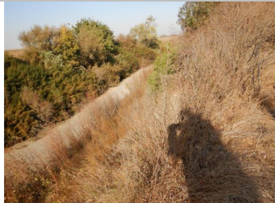
USACE 2018 Erosion Photo #2