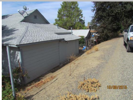
View of the house on the landward side of the levee looking downstream. Fall 2015.

* Location LS : Land Side N/A : Not Applicable WS : Water Side CR : Crown