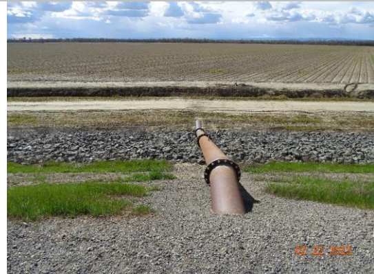
Water-Side: View of levee slope looking from crown. Pipe on levee slope