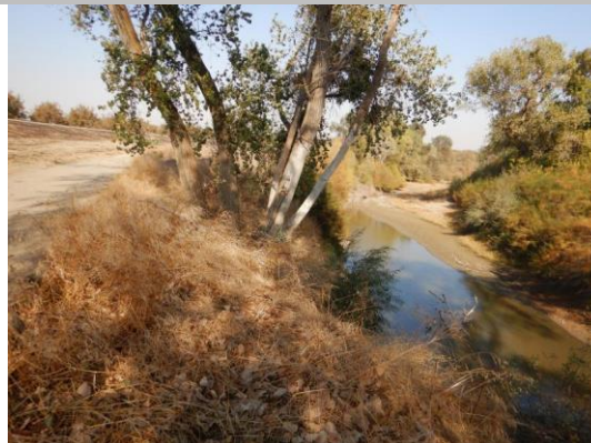
USACE 2018 Erosion Photo #1