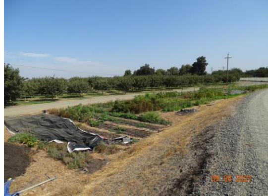
View of garden at landside toe. Fall 2021.