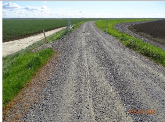
Top of Levee: View of levee crown looking downstream