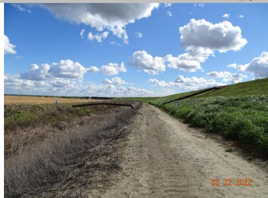
Land-Side: Pipe profile on landside