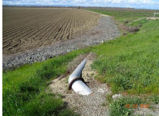
Water-Side: View of levee slope looking from crown. Pipe daylights on levee slope