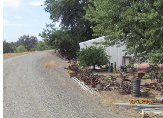
View of the building on the landward side of the levee looking upstream. Fall 2015.