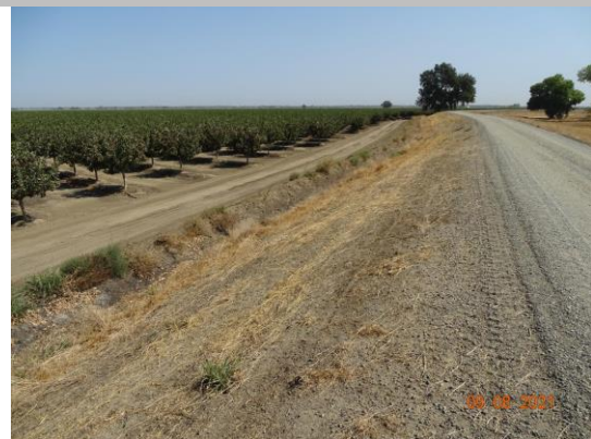
View of ditch at landside toe. Fall 2021.