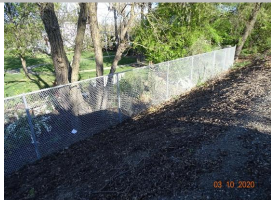
View of fence at the landside toe. Spring 2020.