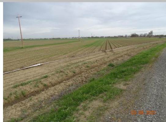
View of irrigation ditch near the landside toe. Spring 2021.