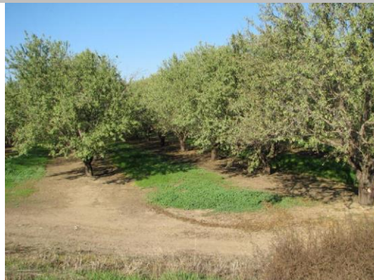
Landside view: no gasoline marker