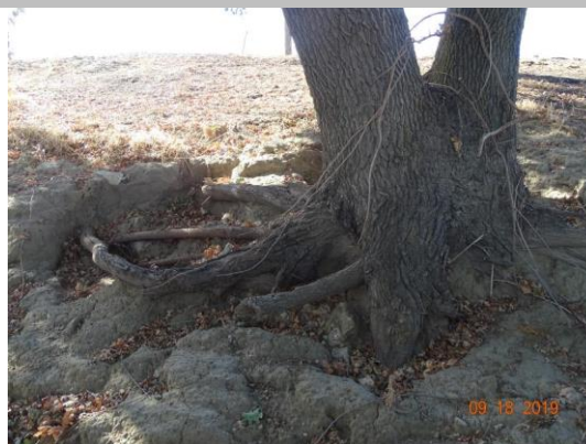
View of the erosion around the tree. Fall 2019.