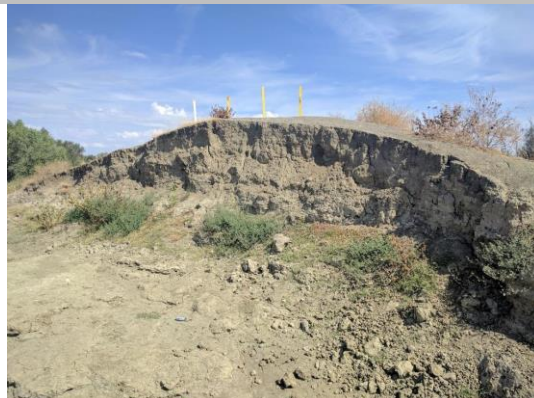
View of scour at the end of the Training Levee. Ramp is inaccessible at this time. Fall 2017.