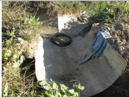
Waterside view: pipe in the ditch