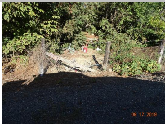
View of the hole within the landside easement. Fall 2019.