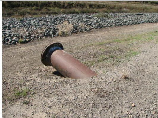
Waterside view: steel pipe on the slope of the levee