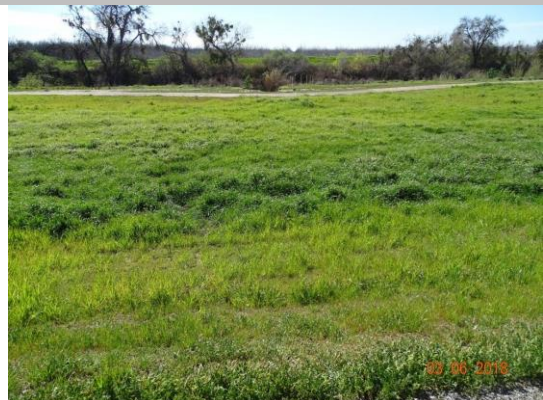
View of erosion from levee crown, facing Cache Creek. Fall 2018.