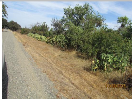
View of the cactus landscaping on the waterward side of the levee looking downstream. Fall 2015.

* Location LS : Land Side N/A : Not Applicable WS : Water Side CR : Crown