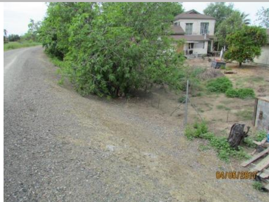
Chain fence at landside levee toe. Spring 2017.

* Location LS : Land Side N/A : Not Applicable WS : Water Side CR : Crown