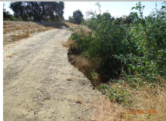
Additional view of the erosion, facing downstream. Fall 2018.