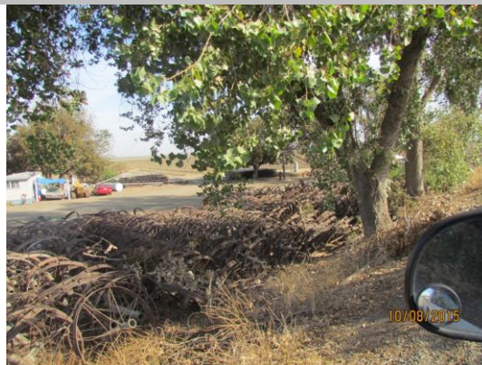
View of the equipment at the levee toe on the landward side looking downstream. Fall 2015.

* Location LS : Land Side N/A : Not Applicable WS : Water Side CR : Crown