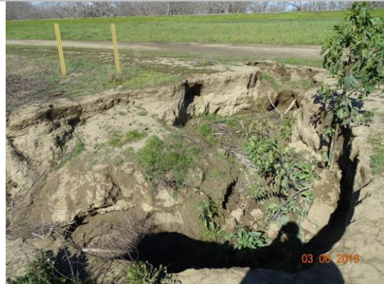
Additional view of erosion, looking northwest. Spring 2018.