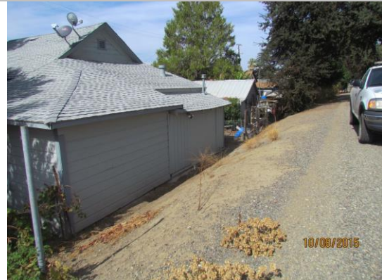
View of the house on the landward side of the levee looking downstream. Fall 2015.