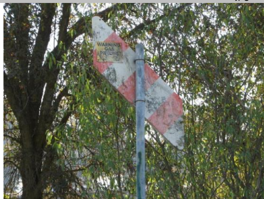
Waterside view: closer look at gasline marker