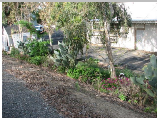
The property owner has planted cactus along the toe of the levee. Spring 2014