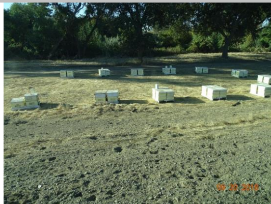
View of beehives at the landside toe. Fall 2018.