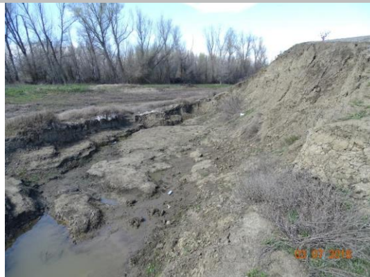
View of scour on waterside levee slope at the end of Unit 4. Spring 2018.