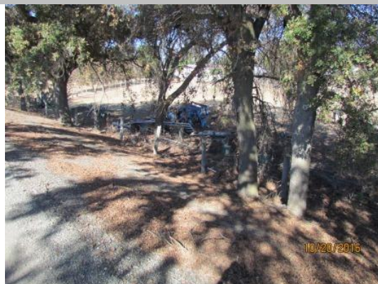
Fence on landside slope. Fall 2016.