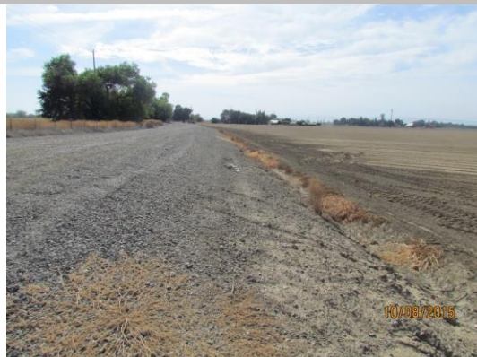
View of the ditch on the landward side of the levee looking upstream. Fall 2015.