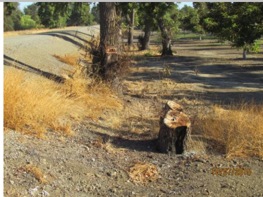
View of the tree stump at the landward side of the levee looking downstream. Fall 2015.