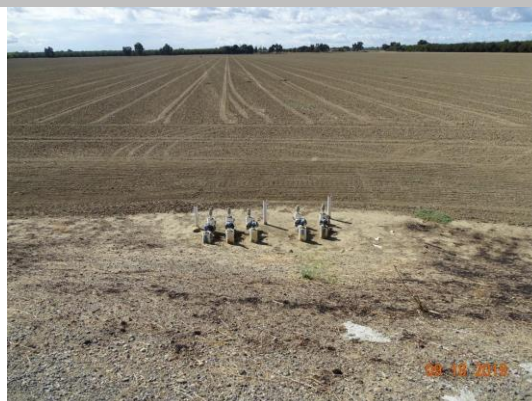
View of the pumps, air valves, and bollards at the landside toe. Fall 2019.