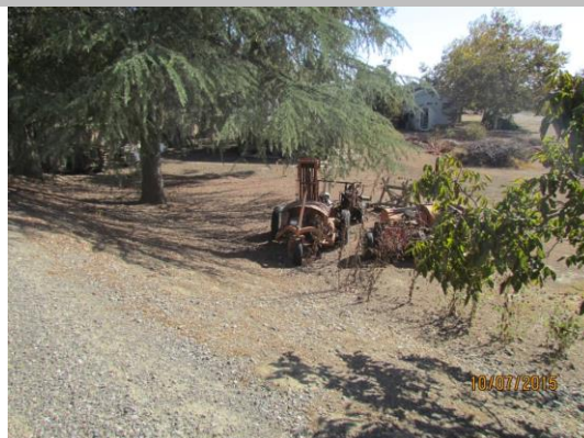
View of the equipment at the toe of the landward side of the levee. Fall 2015.

* Location LS : Land Side N/A : Not Applicable WS : Water Side CR : Crown