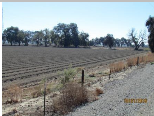
View of fence on LS slope. Fall 2016.

LS : Land Side N/A : Not Applicable WS : Water Side CR : Crown