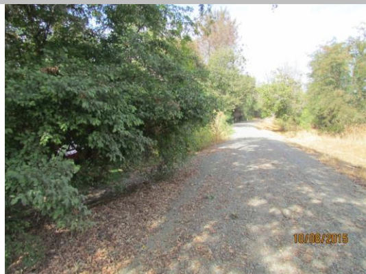
View of the landscaping that needs to be trimmed on the landward side of the levee looking downstream. Fall 2015.