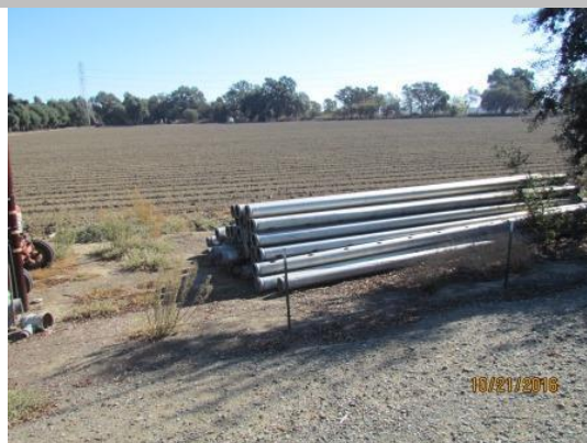
Pipes are stored at levee toe on landside. Fall 2016.