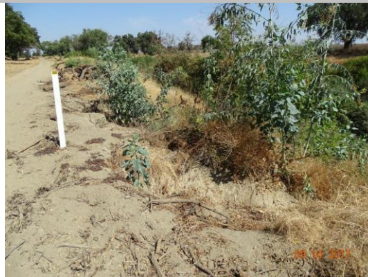
View of storm damage site on waterside berm. Does not appear to be within the levee prism at this time. Fall 2017.