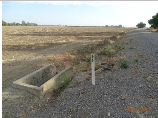
View of the ditch at the landside levee toe. Fall 2017.