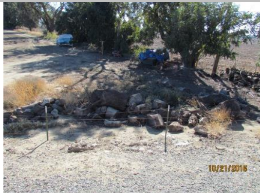
View of firewood at LS levee toe. Fall 2016.