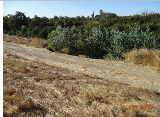
View of erosion on the waterside toe road. Fall 2018.