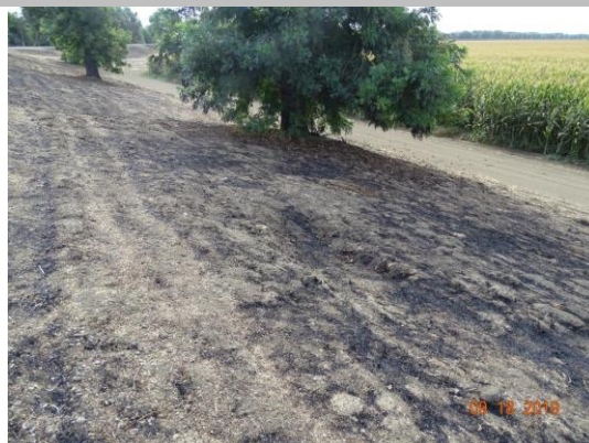
View of sinkhole on the landside slope. Fall 2019.

* Location LS : Land Side N/A : Not Applicable WS : Water Side CR : Crown