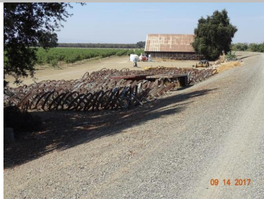
View of farm equipment at landside toe. Fall 2017.

LS : Land Side N/A : Not Applicable WS : Water Side CR : Crown