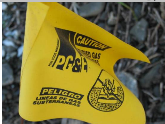
Landside view: gasoline indicator/flag