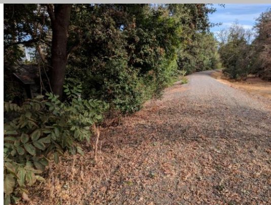
View of thick vegetation on landside slope. Fall 2017.