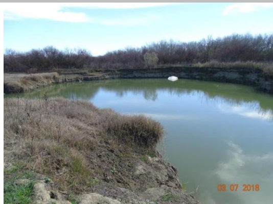
View of newly scoured pond adjacent to the levee. Spring 2018.