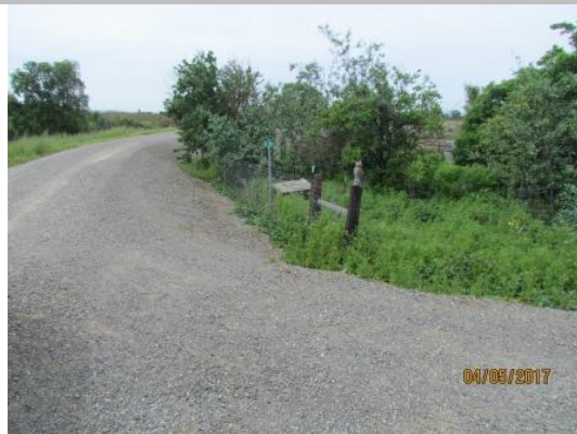
Chain fence at landside levee toe. Spring 2017.

* Location LS : Land Side N/A : Not Applicable WS : Water Side CR : Crown