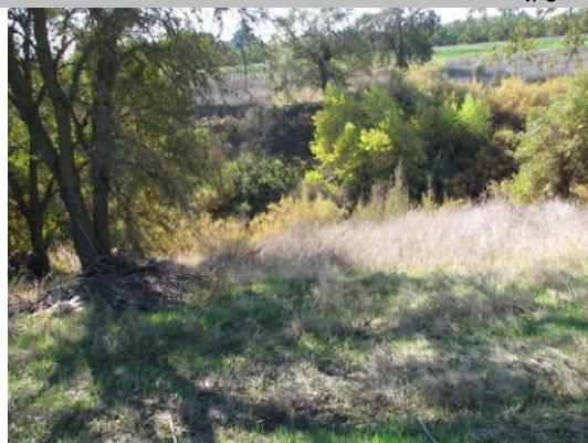
Waterside view: no indicators found