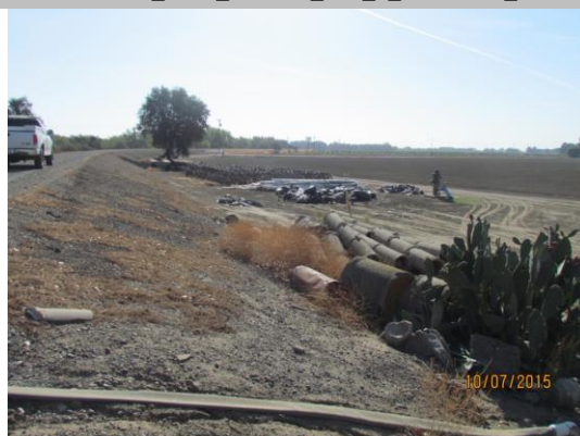
View of the concrete pile at the toe of the landward side of the levee looking downstream. Fall 2015.