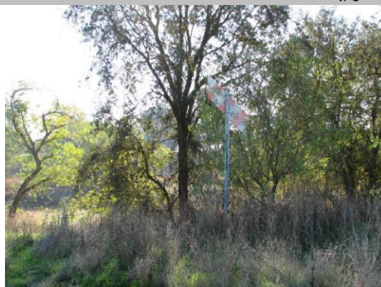
Waterside view: gasline marker