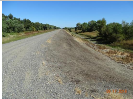
View of the maintained landside slope. Fall 2019.