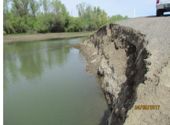
Scour on waterside levee slope at end of Unit 04 levee. Spring 2017.