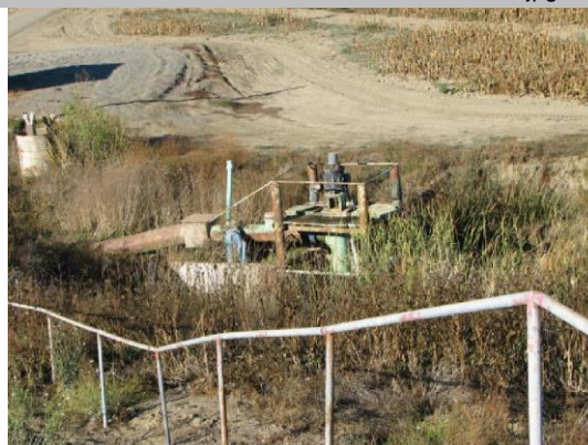
Landside view: pumping plant