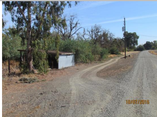
View of the horse corral and building on the waterward side of the levee looking downstream. Fall 2015.