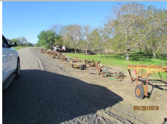
View of the equipment on the landward side of the levee looking upstream. Spring 2016.