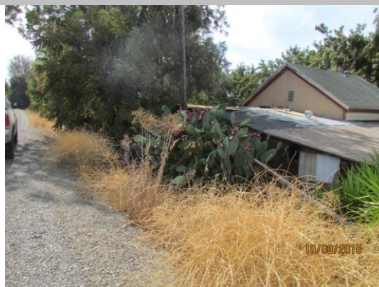
View of the building on the landward side of the levee looking upstream. Cactus planted at the toe obstructs visibility. Fall 2015.