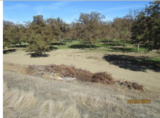
View of prunings on LS slope. Fall 2016.