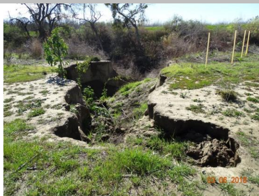
View of erosion on toe road, looking towards Cache Creek. Spring 2018.