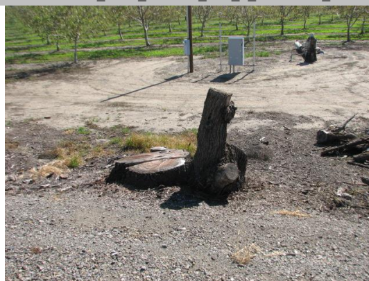
A large black walnut tree stump is at the toe of the levee. Spring 2014