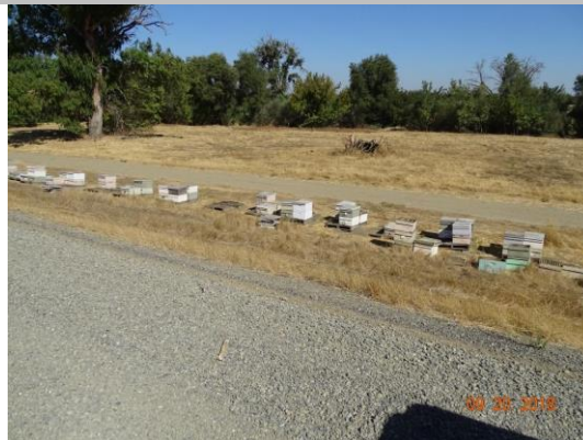
View of beehives on the waterside toe. Fall 2018.