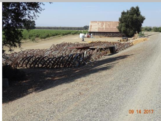
View of farm equipment at landside toe. Fall 2017.