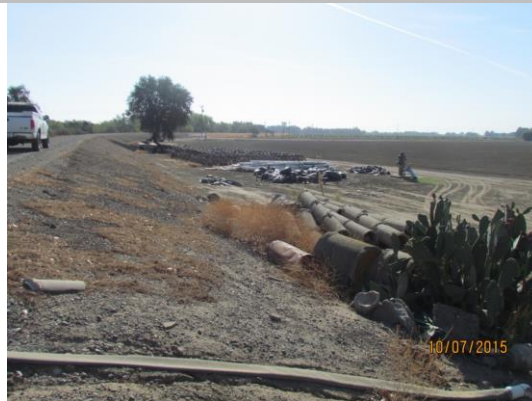
View of the concrete pile at the toe of the landward side of the levee looking downstream. Fall 2015.