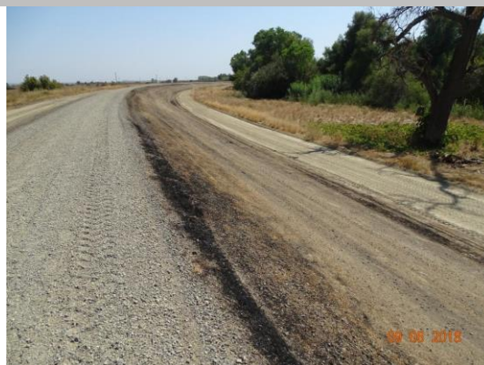
View of the recently burned and dragged landside slope. Fall 2018.