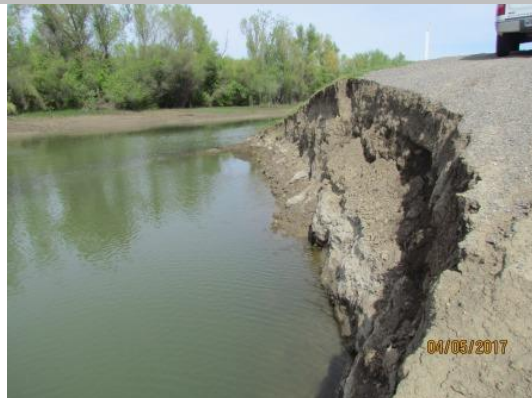
Scour on waterside levee slope at end of Unit 04 levee. Spring 2017.