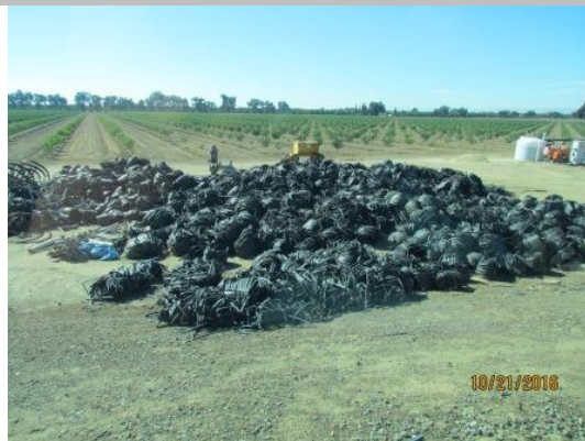
Additional view of debris at the same site on landward side of the levee. Fall 2016.