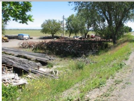
Irrigation pipe and equipment are within the easement of the levee.