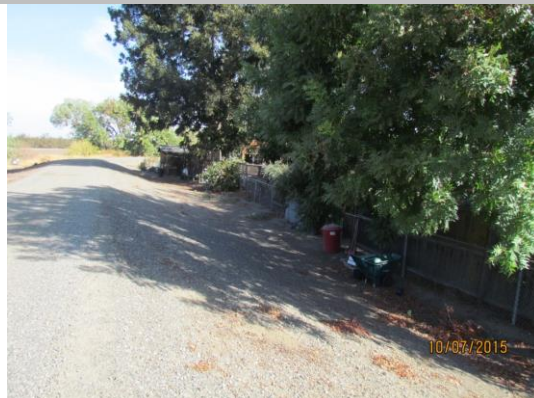
View of the landscaping and fence on the landward side of the levee looking downstream. Fall 2015.

LS : Land Side N/A : Not Applicable WS : Water Side CR : Crown