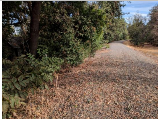
View of thick vegetation on landside slope. Fall 2017.