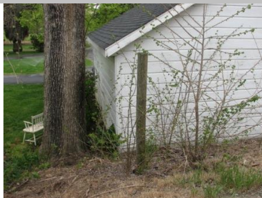
The building backs up to the landside levee toe of the levee.