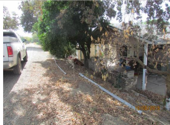
View of the building on the landward side of the levee looking upstream. Fall 2015.