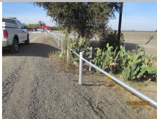
View of the cactus on the landward side of the levee looking upstream. Fall 2015.