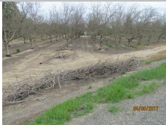
Prunings at landside levee toe. Spring 2017.

Photo 1 of 1 : FA_2018_ST0001_259_75_20180904_00046.jpg