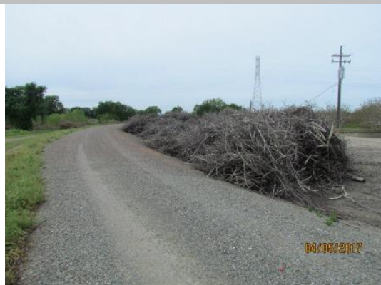
View of prunings on landside slope. Spring 2017.