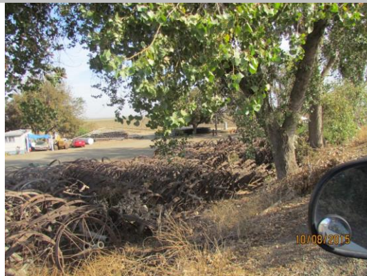
View of the equipment at the levee toe on the landward side looking downstream. Fall 2015.