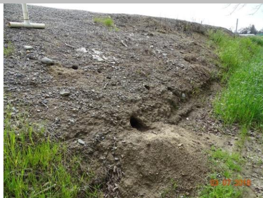
View of rodent holes on the landside slope. Spring 2018.