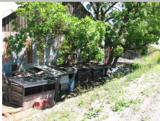
The barn and livestock pens are within the easement of the levee.