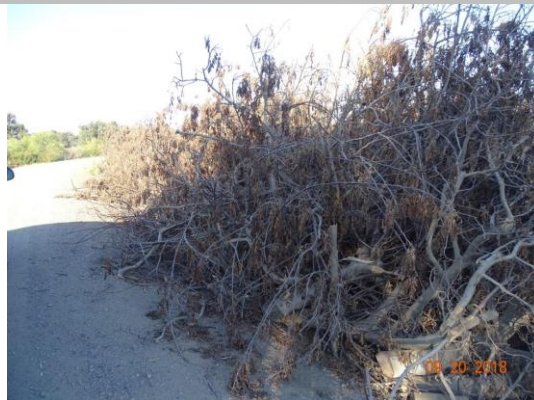
View of the pruning pile on the landside slope. Fall 2018.