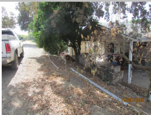
View of the building on the landward side of the levee looking upstream. Fall 2015.