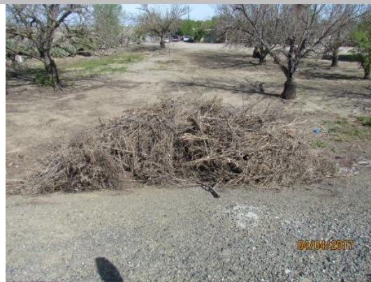
Prunings at landside levee toe. Spring 2017.

LS : Land Side N/A : Not Applicable WS : Water Side CR : Crown