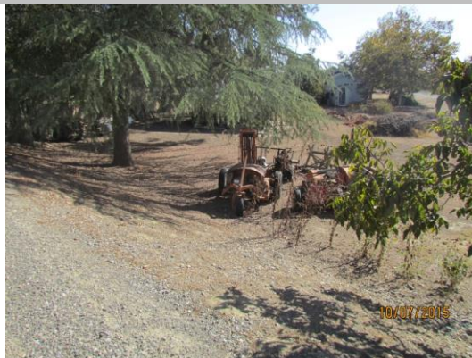
View of the equipment at the toe of the landward side of the levee. Fall 2015.