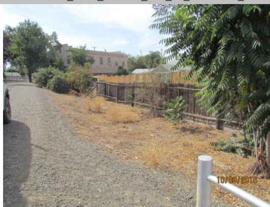
View of the fence on the landward side of the levee looking upstream. Fall 2015.