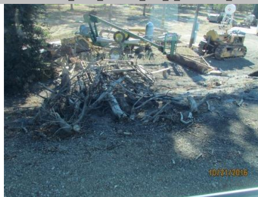
Prunings on LS levee slope. Fall 2016.