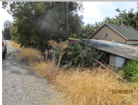
View of the building on the landward side of the levee looking upstream. Cactus planted at the toe obstructs visibility. Fall 2015.