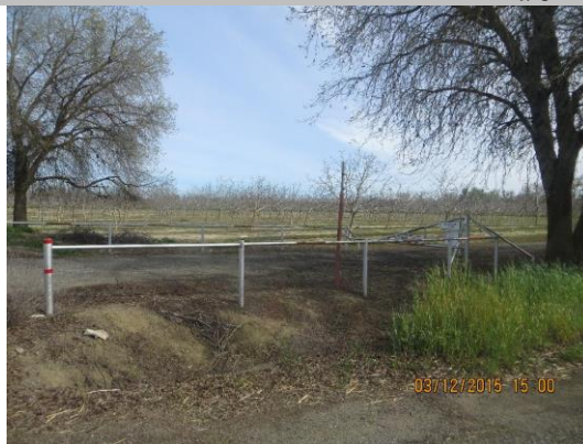
Gasline marker next to levee access gate 500-feet north of levee crown.