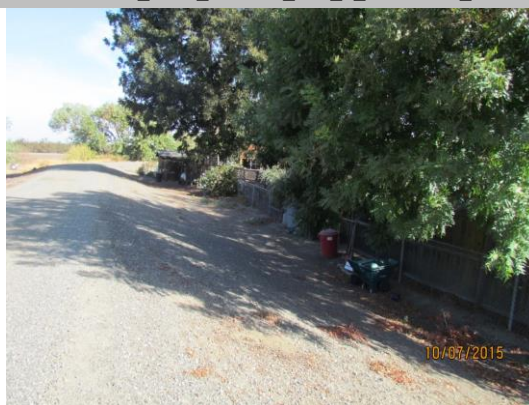
View of the landscaping and fence on the landward side of the levee looking downstream. Fall 2015.