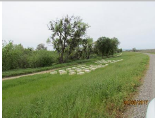
Beehives at waterside levee toe. Spring 2017.