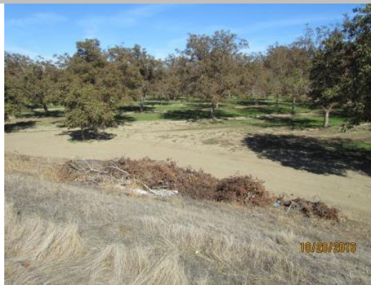
View of prunings on LS slope. Fall 2016.