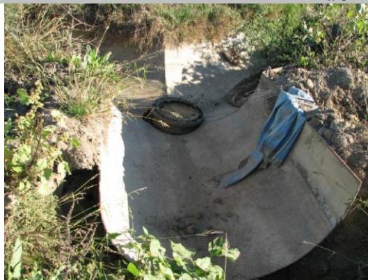
Waterside view: pipe in the ditch