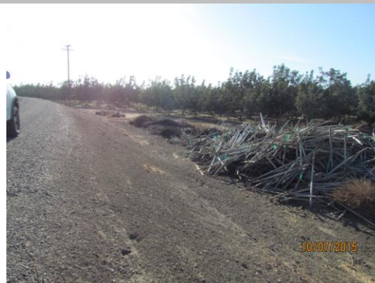
View of the prunings and stakes at the toe of the landward side of the levee looking downstream. Fall 2015.