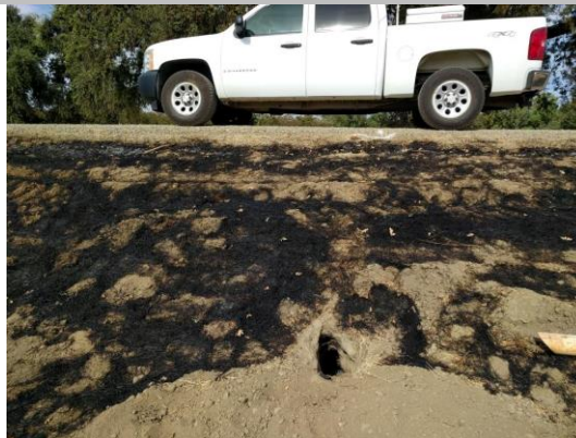
View of rodent hole on landside slope. Fall 2017.