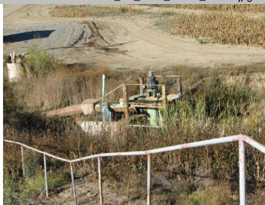
Landside view: pumping plant