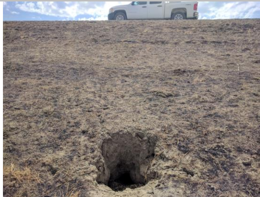
View of large rodent hole on landside slope. Fall 2017.