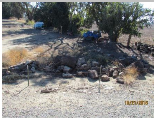
View of firewood at LS levee toe. Fall 2016.