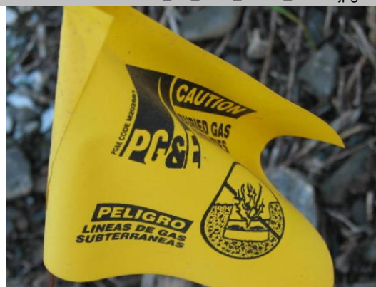
Landside view: gasoline indicator/flag