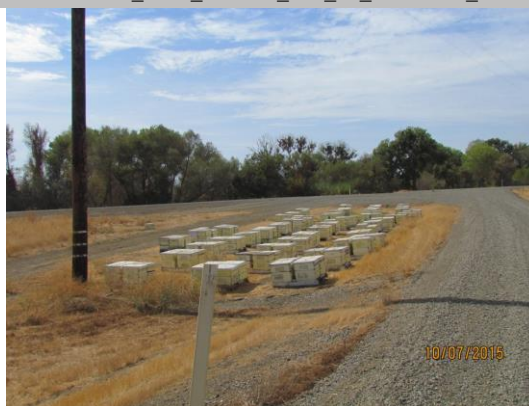
View of the beehives on the waterward side of the levee looking upstream. Fall 2015.