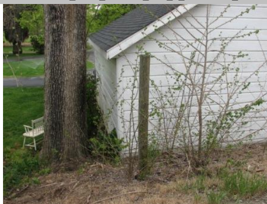
The building backs up to the landside levee toe of the levee.