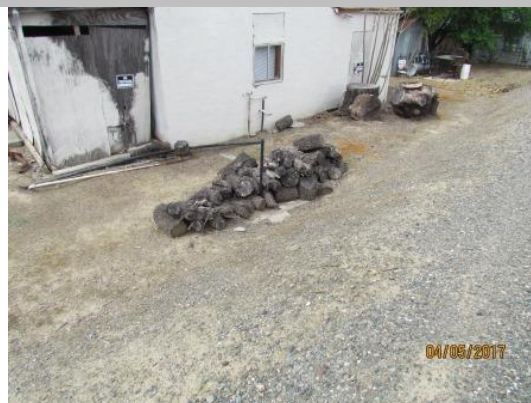
Firewood pile at landside levee toe. Spring 2017.