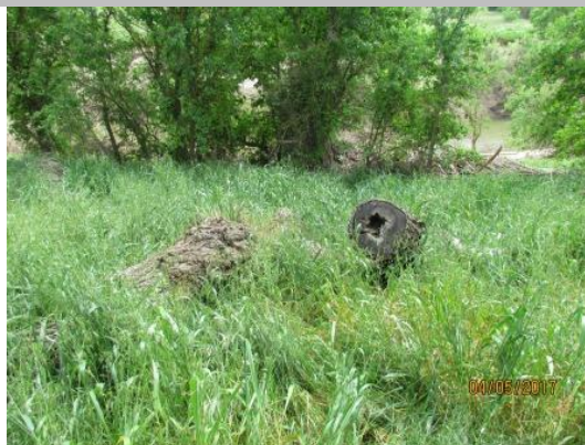
Dead tree stumps on waterside levee slope. Spring 2017.