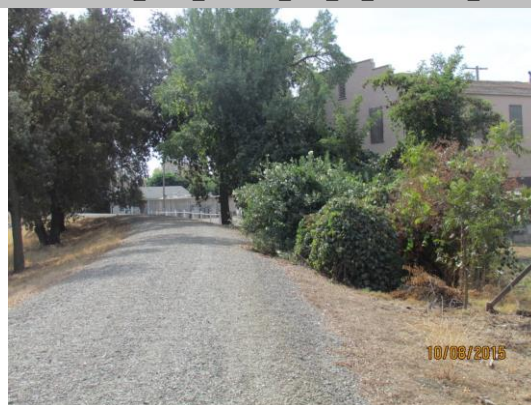
View of the shrubs on the landward side of the levee looking upstream. Fall 2015.