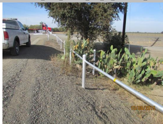
View of the cactus on the landward side of the levee looking upstream. Fall 2015.