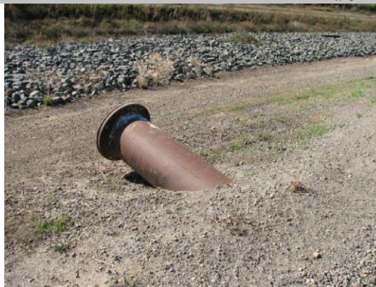
Waterside view: steel pipe on the slope of the levee