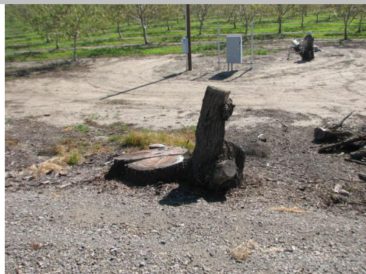
A large black walnut tree stump is at the toe of the levee. Spring 2014