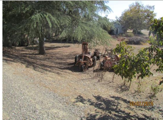
View of the equipment at the toe of the landward side of the levee. Fall 2015.