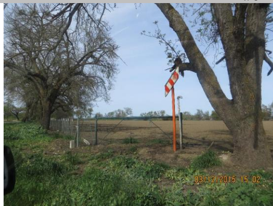
Gasline marker at Best Ranch Road, 1500-feet south of levee crossing.