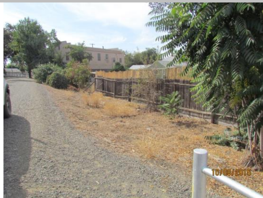
View of the fence on the landward side of the levee looking upstream. Fall 2015.

LS : Land Side N/A : Not Applicable WS : Water Side CR : Crown