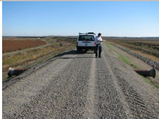
Crown view: overview