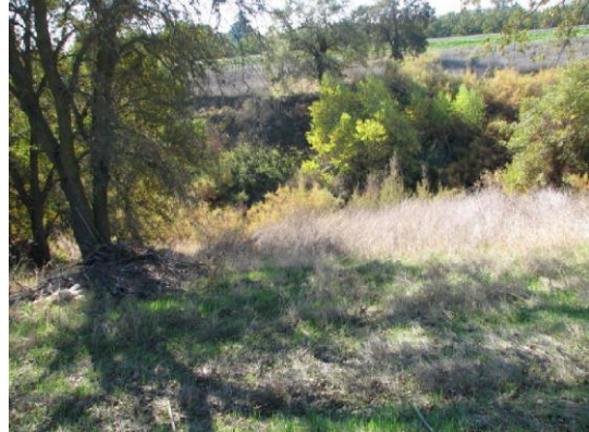
Waterside view: no indicators found