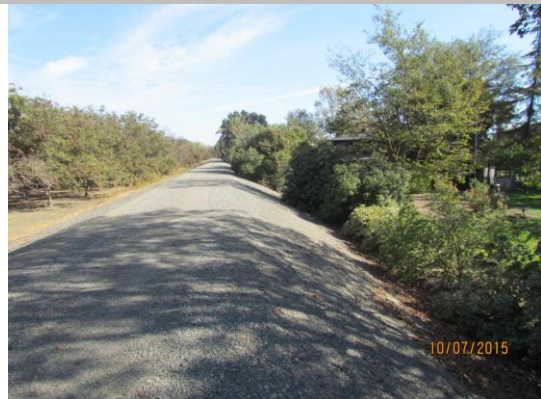
View of the landscaping vegetation on the landward side of the levee looking downstream. Fall 2015.