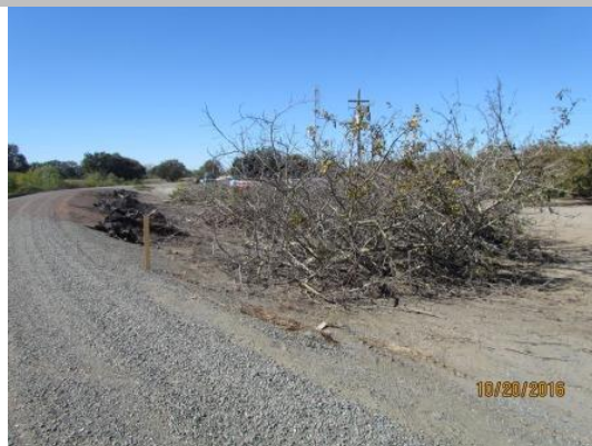
View of prunings on landside slope. Fall 2016.