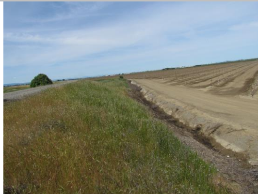
View of ditch on the landward side of the levee looking upstream. Spring 2015.