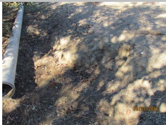
Erosion on LS levee slope toward the toe. Fall 2016.