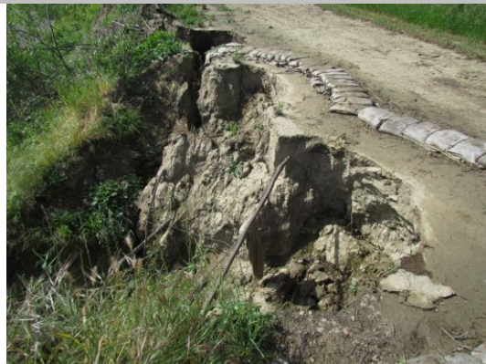
View of the erosion on the channel looking downstream. Spring 2015.