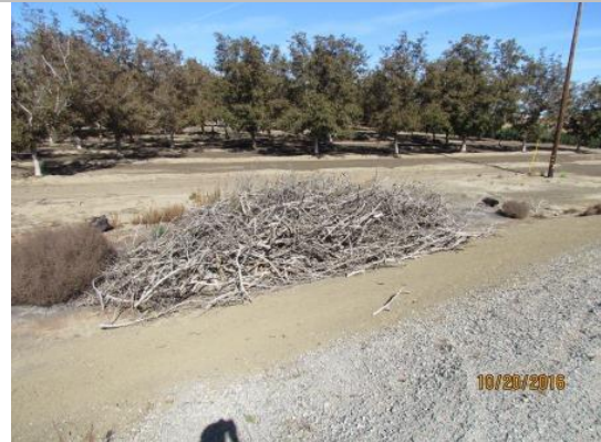
View of prunings on LS slope. Fall 2016.