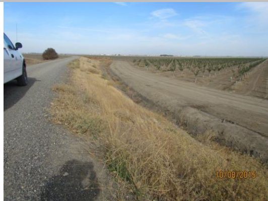
View of the ditch on the landward side of the levee looking upstream. Fall 2015.