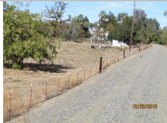
View of fence on LS slope. Fall 2016.