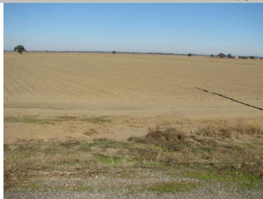
Landside view: no indicator found.