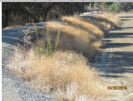
View of vegetation on LS slope. Fall 2016.

LS : Land Side N/A : Not Applicable WS : Water Side CR : Crown