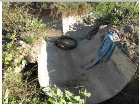
Waterside view: pipe in the ditch