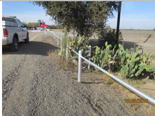
View of the cactus on the landward side of the levee looking upstream. Fall 2015.