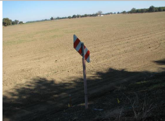
Landside view: gasoline indicator