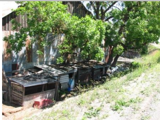
The barn and livestock pens are within the easement of the levee.