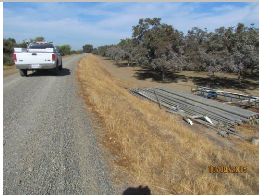
View of the aluminum irrigation pipe along the levee toe of the landward side looking upstream. Fall 2015.