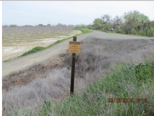
Sign on LS toe.