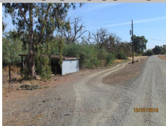
View of the horse corral and building on the waterward side of the levee looking downstream. Fall 2015.