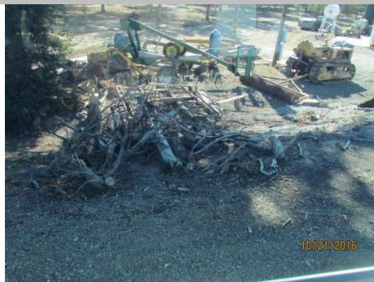
Prunings on LS levee slope. Fall 2016.