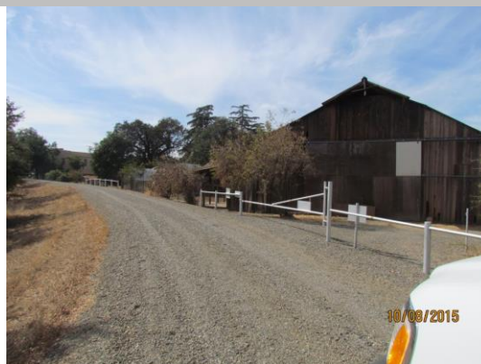
View of the horse barn on the landward side of the levee looking upstream. Fall 2015.