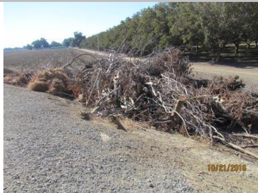
View of prunings on LS slope of the levee. Fall 2016.