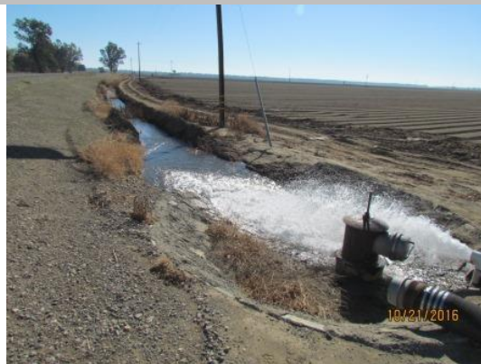
View of ditch on landside near the levee toe looking downstream of Cache Creek. Fall 2016.