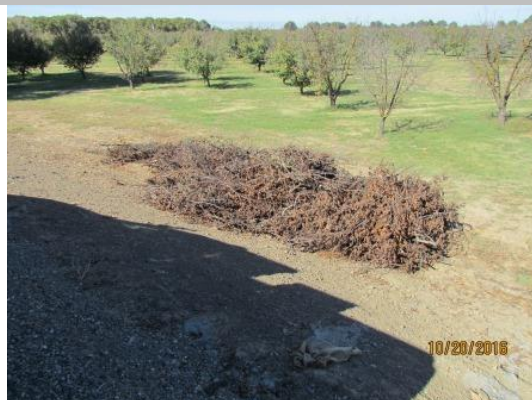
Prunings on LS slope. Fall 2016.

LS : Land Side N/A : Not Applicable WS : Water Side CR : Crown