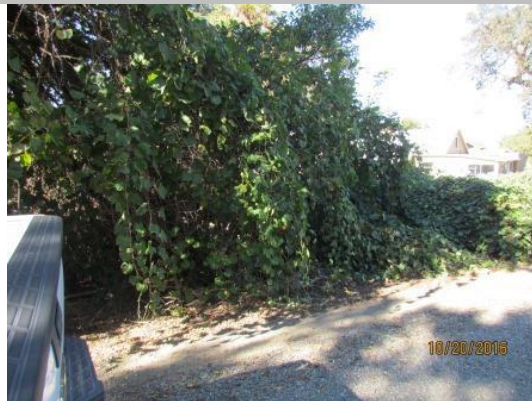
Another view of the shrubs. Fall 2016.