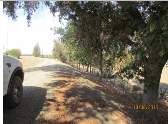
View of the landscape trees on the landward side of the levee looking upstream. Fall 2015.