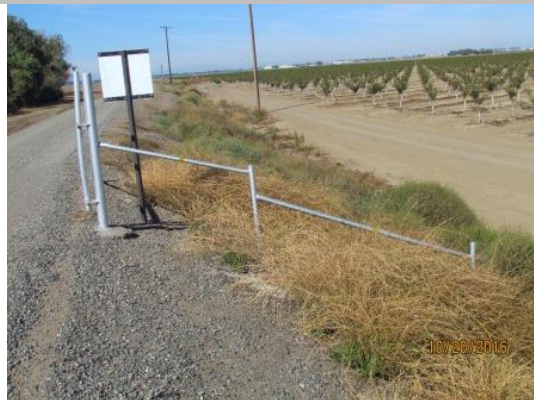
Vegetation on LS slope. Fall 2016.