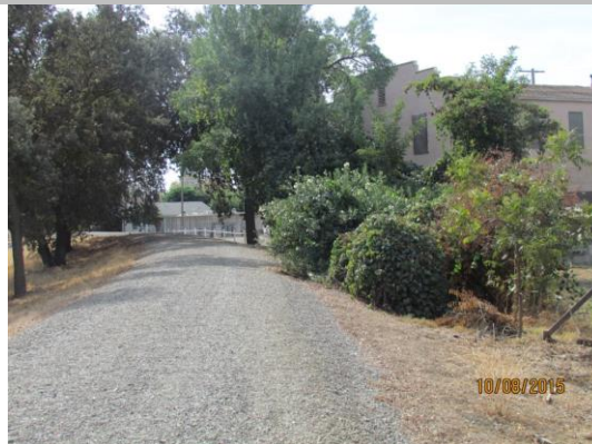
View of the shrubs on the landward side of the levee looking upstream. Fall 2015.