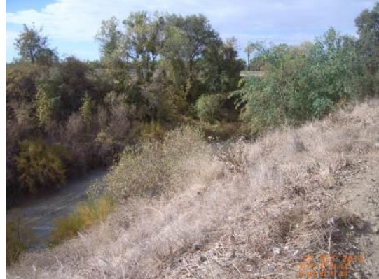
USACE 2013 Photo #1