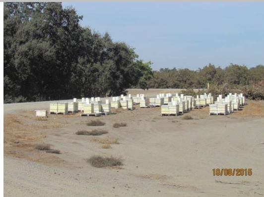
View of the beehives on the landward side of the levee looking upstream. Fall 2015.