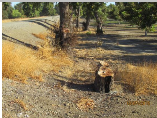
View of the tree stump at the landward side of the levee looking downstream. Fall 2015.