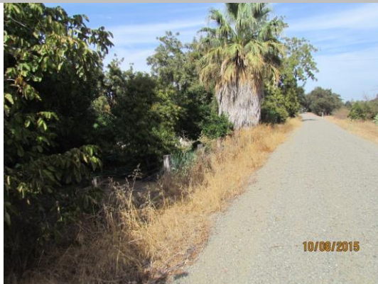
View of the landscaping on the landward side of the levee looking downstream. Fall 2015.