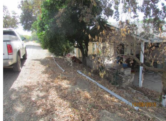
View of the building on the landward side of the levee looking upstream. Fall 2015.