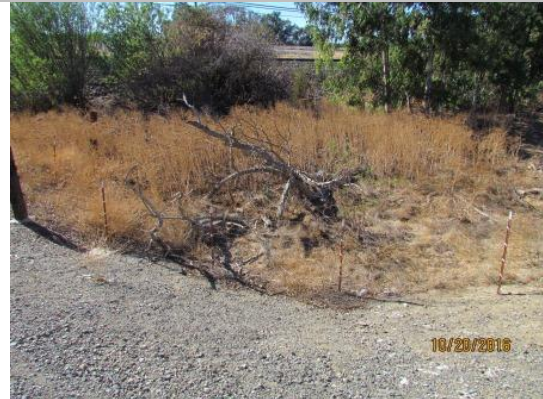
Prunings on LS slope. Fall 2016.