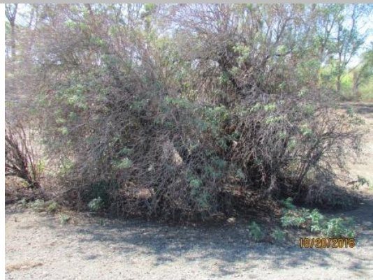
View of an elderberry tree on waterward side. Fall 2016.