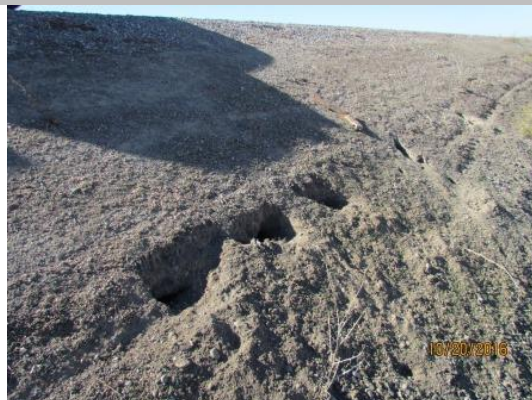
Rodent holes on landside slope of the levee. Fall 2016.