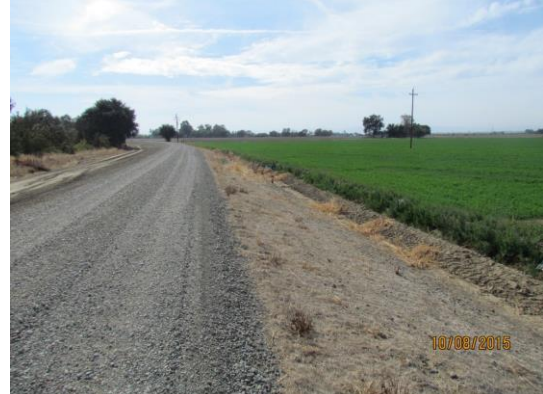
View of the ditch on the landward side of the levee looking upstream. Fall 2015.