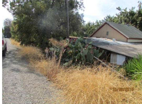
View of the building on the landward side of the levee looking upstream. Cactus planted at the toe obstructs visibility. Fall 2015.