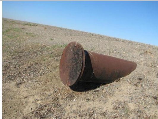
Waterside view: closer look at capped pipe.