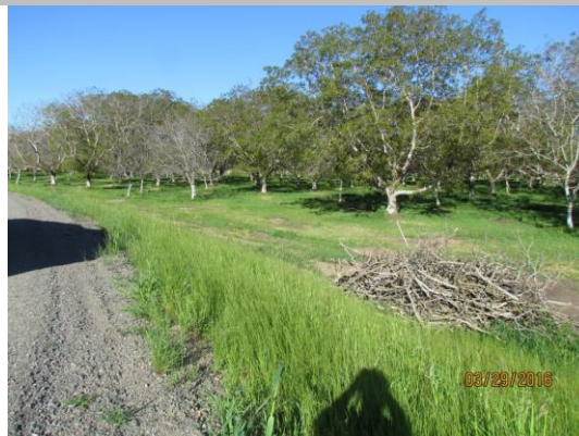
View of the pruning pile on the landward side of the levee looking upstream. Spring 2016.