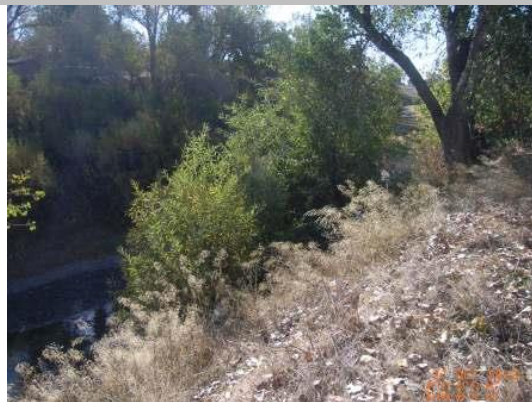
USACE 2013 Photo #1