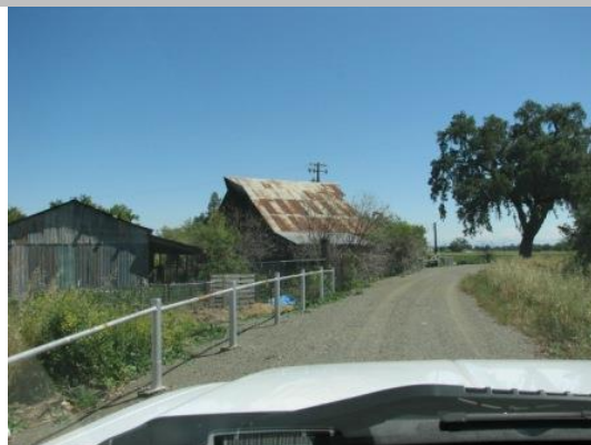
Horse barn and corral are within the easement of the levee.