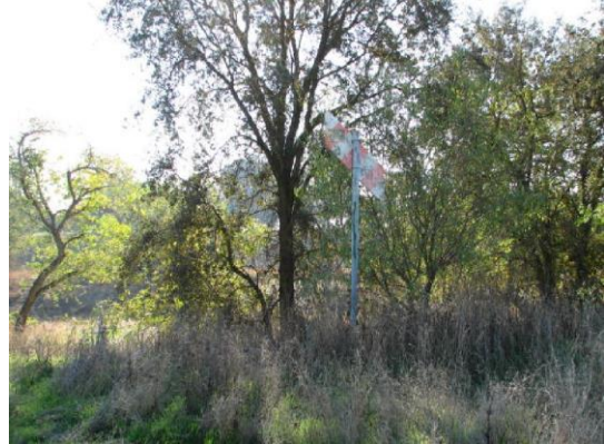
Waterside view: gasline marker