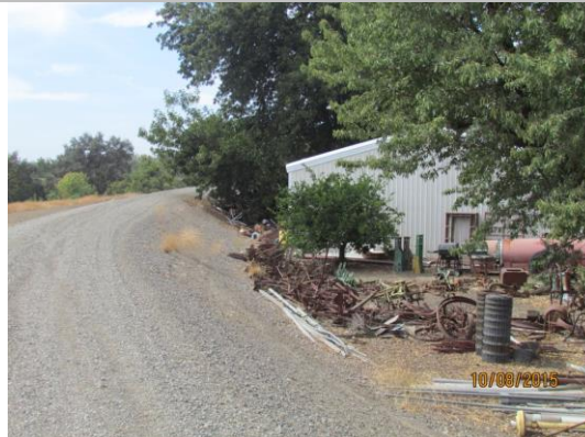
View of the building on the landward side of the levee looking upstream. Fall 2015.