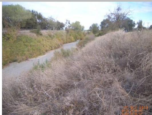
USACE 2013 Photo #1