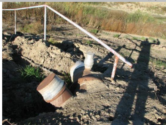
Landside view: pipe daylight on LS levee slope