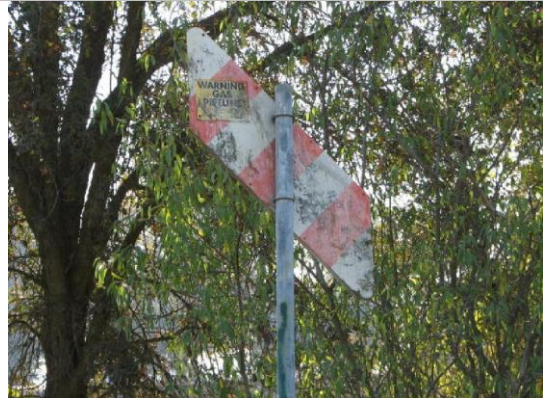
Waterside view: closer look at gasline marker