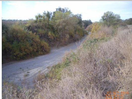
USACE 2013 Photo #1