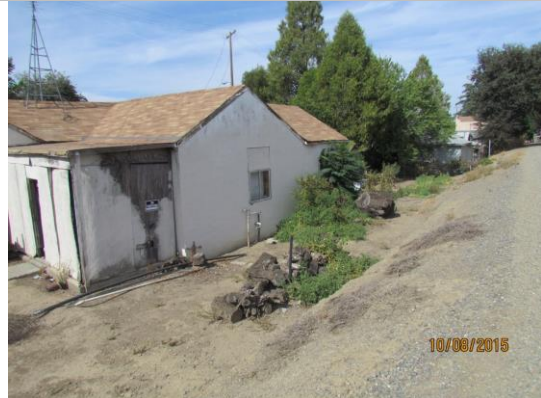
View of the house in the town of Yolo on the landward side of the levee looking downstream. Fall 2015.