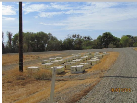
View of the beehives on the waterward side of the levee looking upstream. Fall 2015.