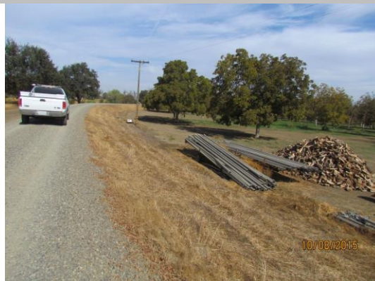
View of pipes on the landward side of the levee looking upstream. Fall 2015.

LS : Land Side N/A : Not Applicable WS : Water Side CR : Crown