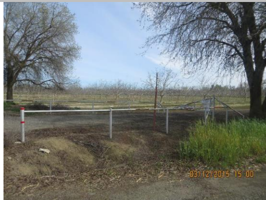
Gasline marker next to levee access gate 500-feet north of levee crown.