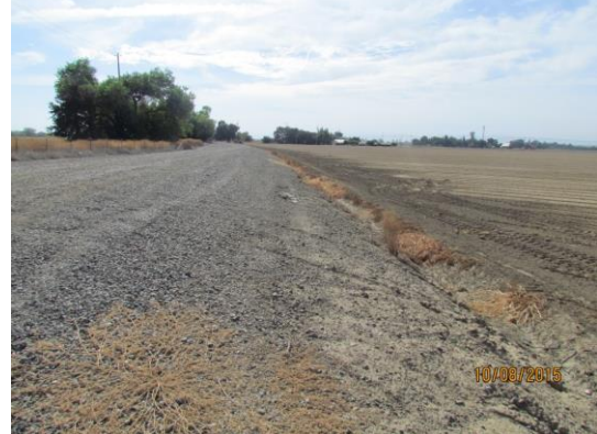
View of the ditch on the landward side of the levee looking upstream. Fall 2015.