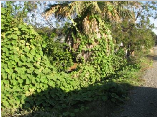
Wild grape and other plants are obstructing the view for inspection. Fall 2011