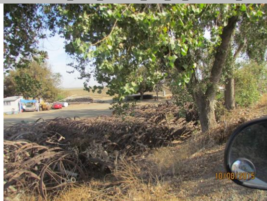
View of the equipment at the levee toe on the landward side looking downstream. Fall 2015.

LS : Land Side N/A : Not Applicable WS : Water Side CR : Crown