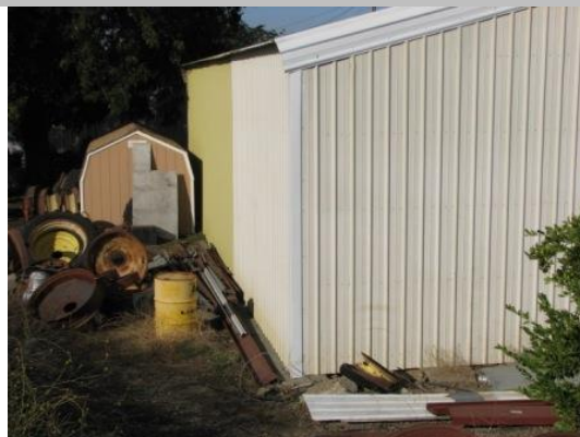
The corner of the shop is within the easement of the levee. Fall 2011