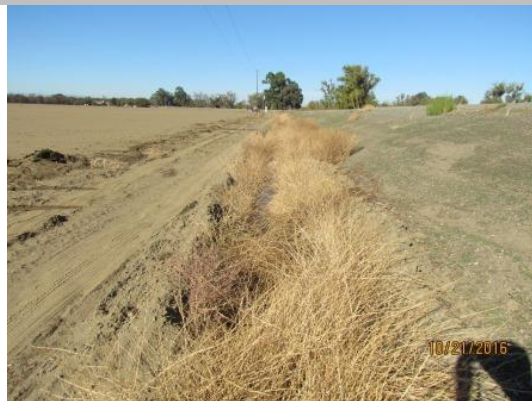
View of ditch on landside near the levee toe looking upstream of Cache Creek. Fall 2016.