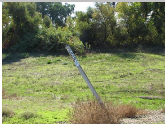
Waterside view: gasline indicator