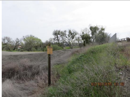
Sign on LS toe.