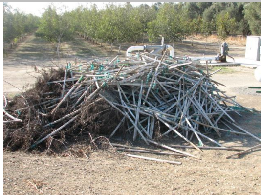
Tree stakes and pruning's are at the toe of the levee. Fall 2013