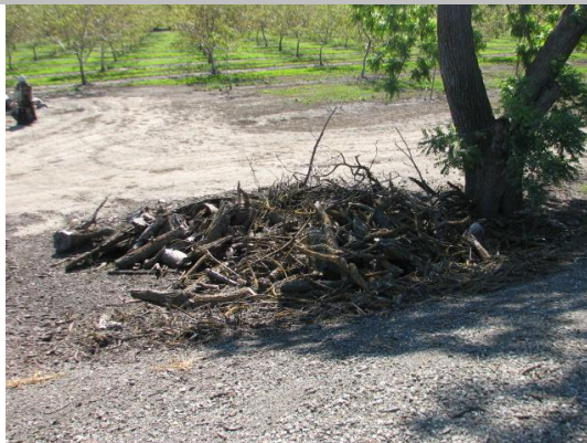
A pruning pile is at the toe of the levee. Spring 2014