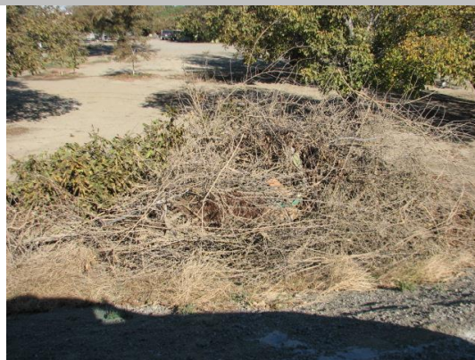
A pruning pile is at the toe of the levee. Fall 2013

LS : Land Side N/A : Not Applicable WS : Water Side CR : Crown