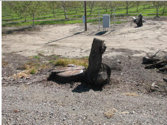
A large black walnut tree stump is at the toe of the levee. Spring 2014

LS : Land Side N/A : Not Applicable WS : Water Side CR : Crown