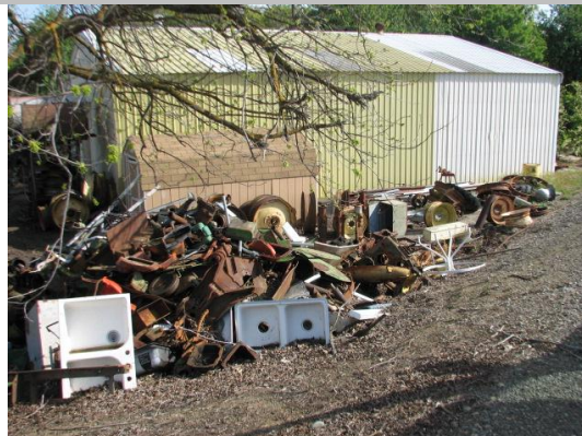
Equipment and parts stacked along the levee toe and slope. Spring 2014