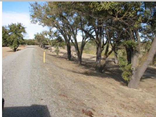
Levee mile 1.80, pruning piles at water side toe. Fall 2014.