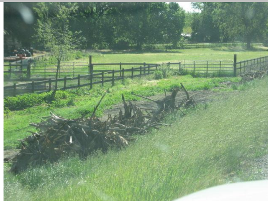
Prunings and root balls at the toe of the levee. Spring 2013