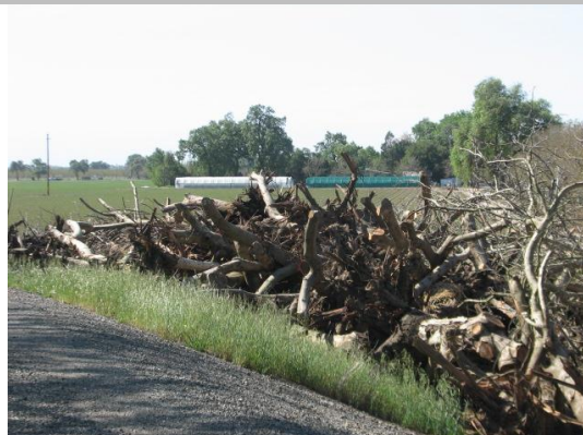
The pruning pile at the toe continues to grow. Spring 2013

LS : Land Side N/A : Not Applicable WS : Water Side CR : Crown