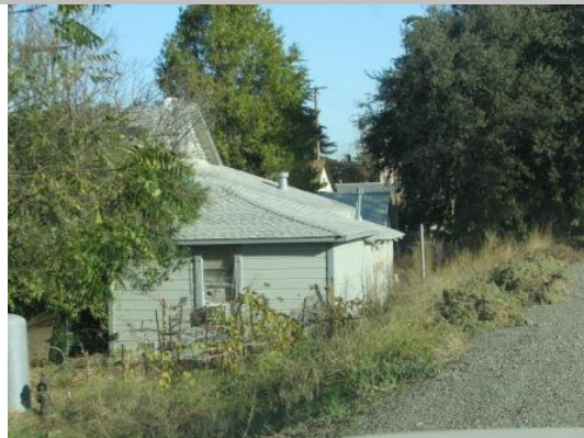
The house is in the easement of the levee toe. Fall 2011