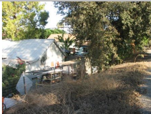
The building is in the easement of the levee. Fall 2011