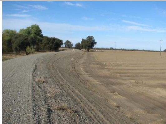
Levee mile 7.14, agricultural ditch has been removed. Fall 2014.