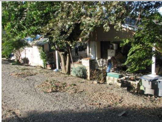
The building is in the easement of the levee. Fall 2011