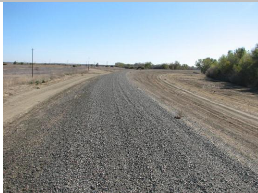
Levee mile 0.17, vegetation controlled on levee slopes and crown. Fall 2014.