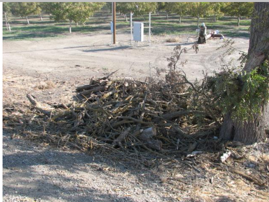
A pruning pile is within the easement of the levee. Fall 2013