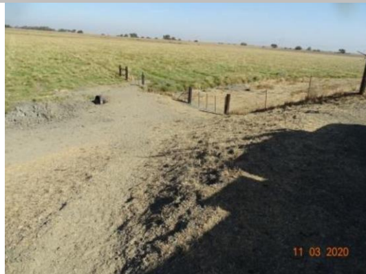
View of cow path down the landside slope (Fall 2020).