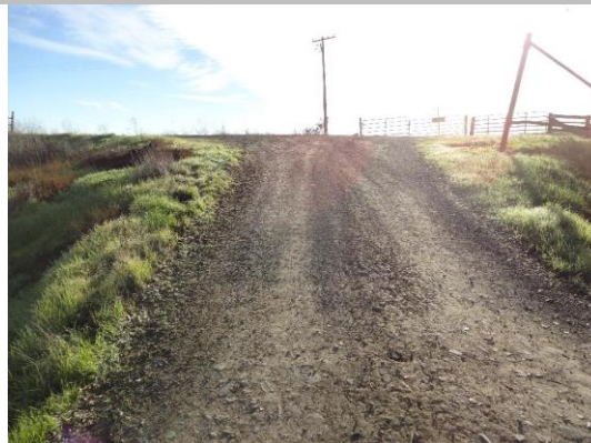
No signs present at ramp to enter RD2104.