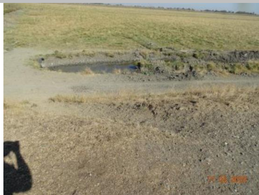
View of cow path down the landside slope (Fall 2020).

* Location LS : Land Side N/A : Not Applicable WS : Water Side CR : Crown