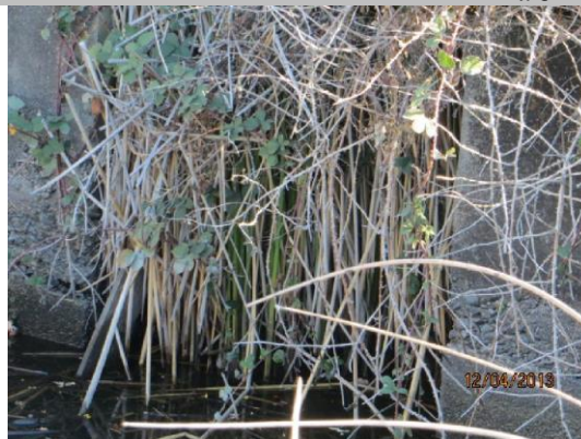
Vegetation covering possible location for 4X4 concrete culvert at LS toe.