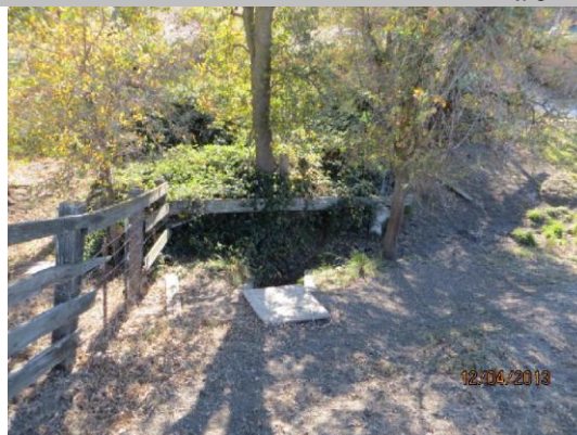
Concrete U shaped headwall on LS toe.