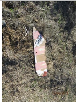
Broken sign marker on LS toe.