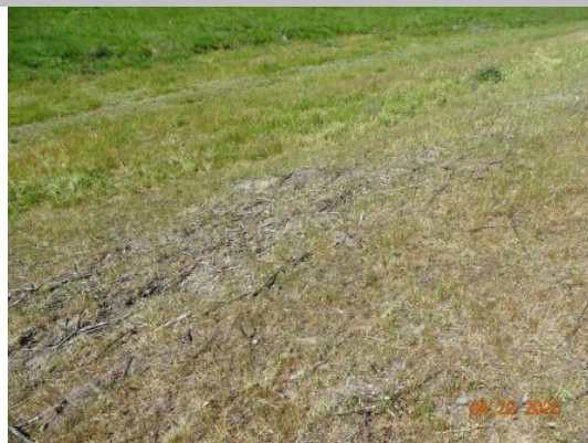
View looking upstream at terracing due to cows in the landside slope (Spring 2020).