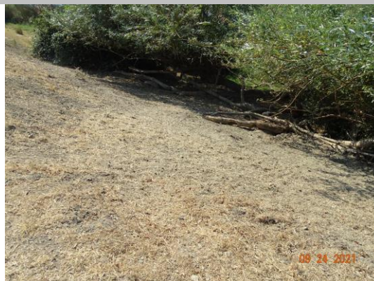
View looking downstream at trail caused by cows on the waterside slope (Fall 2021).