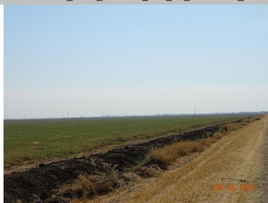
View looking upstream at ditch within 15 feet of landside toe (Fall 2021).