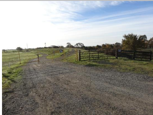
No signs present of gas line.