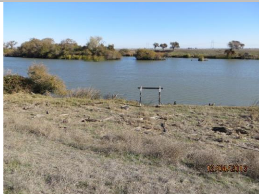
Sign on WS berm.