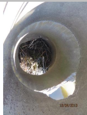
36-inch concrete riser with vegetation buildup inside.