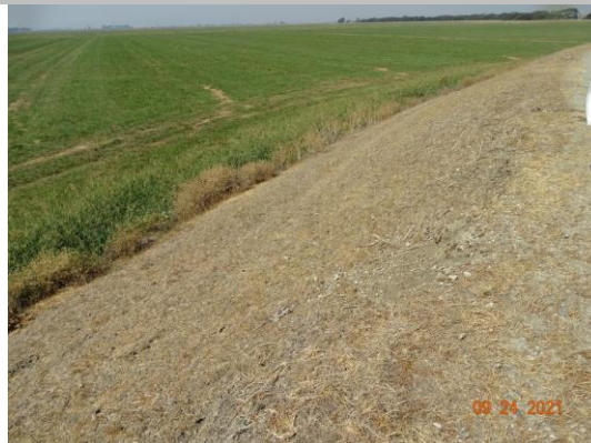
View looking upstream at slope instability at the landside hinge (Fall 2021).