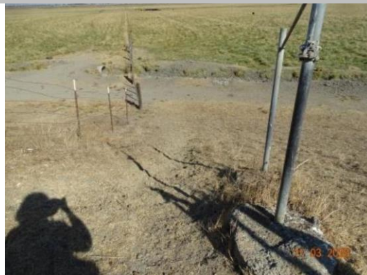
View of cow path down the landside slope (Fall 2020).