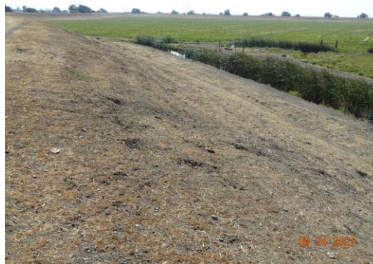
View looking downstream at depressions due to cows on the landside slope (Fall 2021).