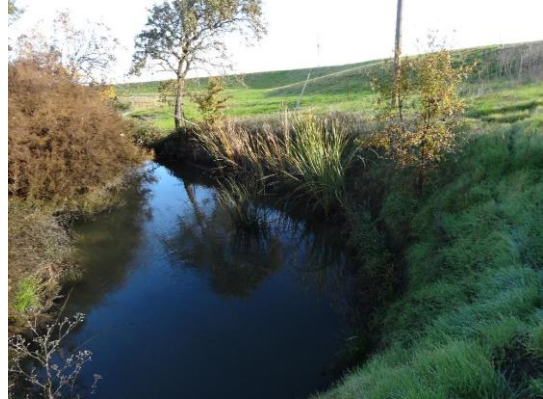
Photo of where the line is estimated to cross on LS.