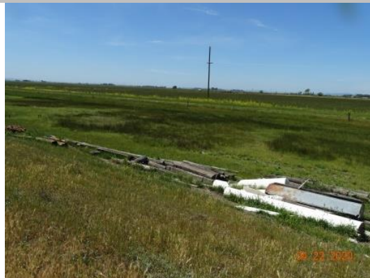
View looking upstream at debris on the waterside toe (Spring 2020).