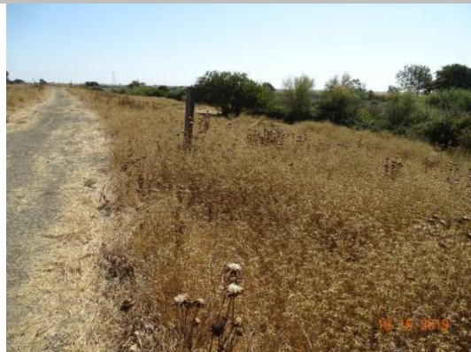
View looking downstream at thick annual vegetation on the waterside slope (Fall 2019).