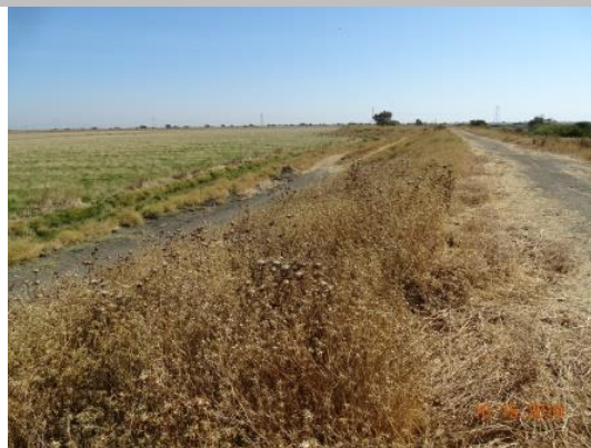
View looking downstream at thick annual vegetation on the landside slope (Fall 2019).

* Location LS : Land Side N/A : Not Applicable WS : Water Side CR : Crown