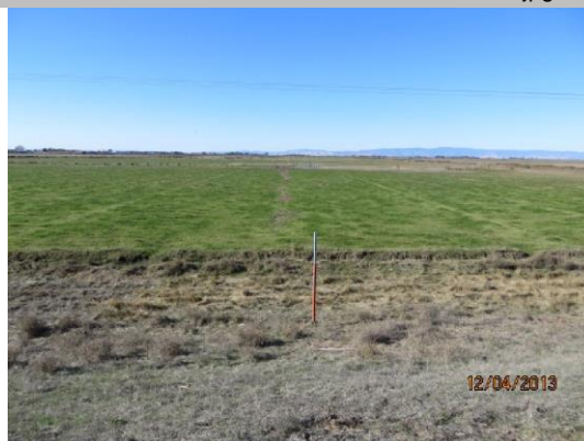
Sign post on LS toe.