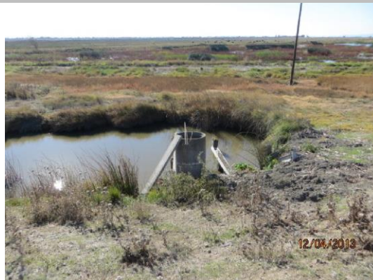
36-inch concrete riser on LS toe at channel.