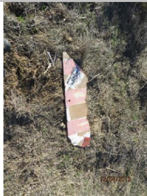
Broken sign marker on LS toe.