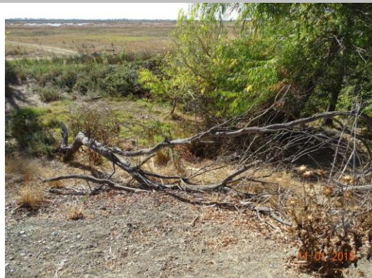
View of down tree limb on the landside slope (November 2018).