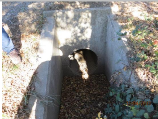
Concrete U shaped headwall on LS toe.