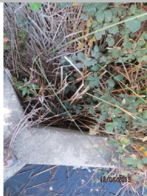
Some erosion on levee side of headwall at LS toe.