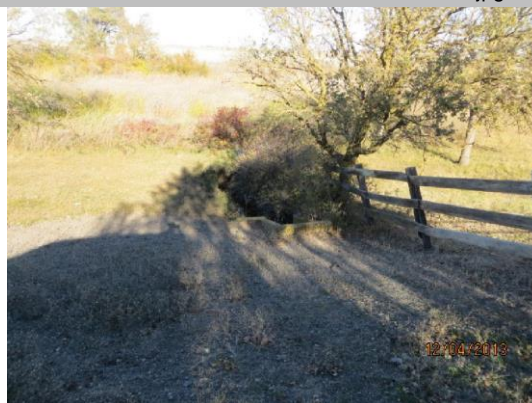
Concrete U shaped headwall on WS toe.