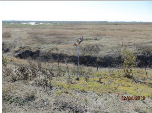
Gasline marker on LS toe.