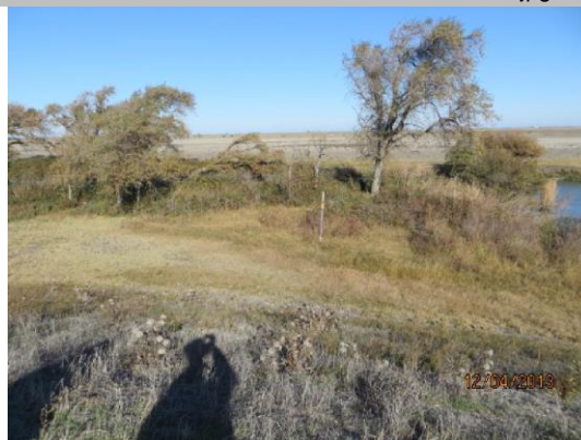
Sign pole on WS toe missing sign.