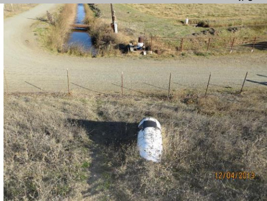
Pipe on LS slope with pump in irrigation ditch off LS toe visible in background.