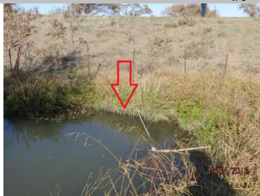
Concrete headwall on LS toe at irrigation ditch.