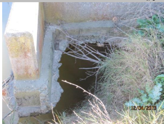
Headwall undermined on WS toe.