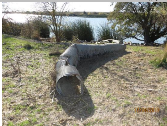
Pipe debris on WS berm.