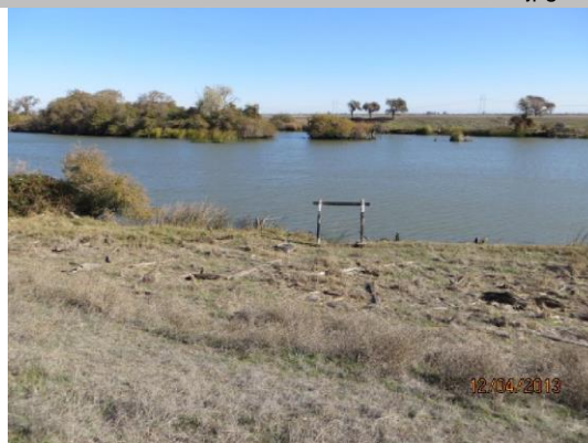
Sign on WS berm.