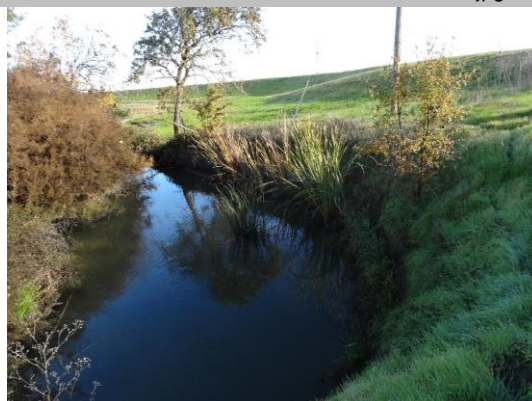
Photo of where the line is estimated to cross on LS.