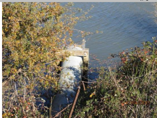
CMP pipe and flapgate off WS toe.