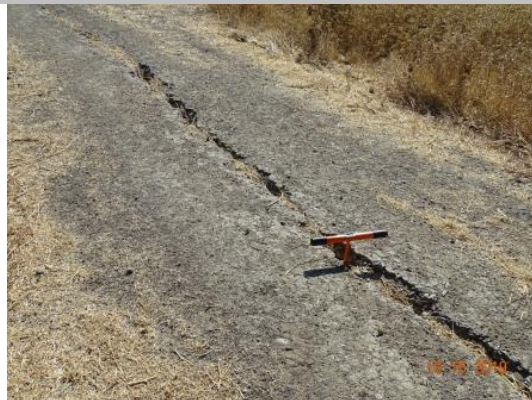
View of deep crack with 48" pole stuck all the way into it on the crown (Fall 2019).