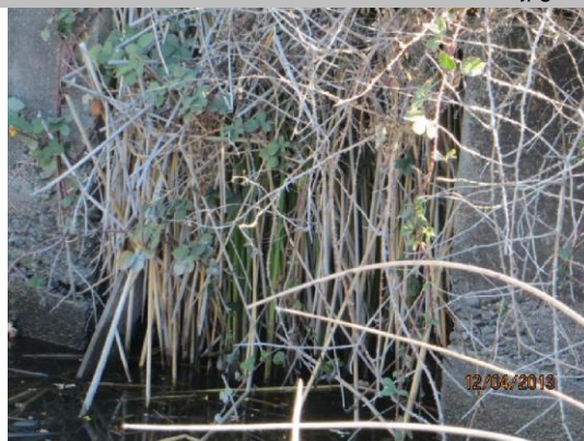
Vegetation covering possible location for 4X4 concrete culvert at LS toe.