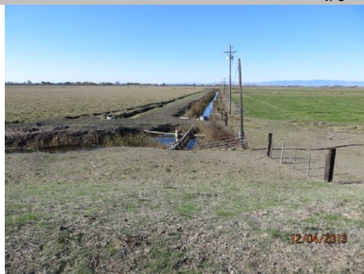
Pump on pier in ditch off LS toe.