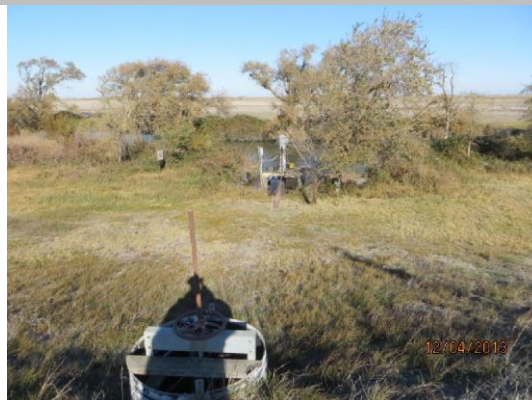
Slide gate in CMP riser on WS slope with pump on pier in background.