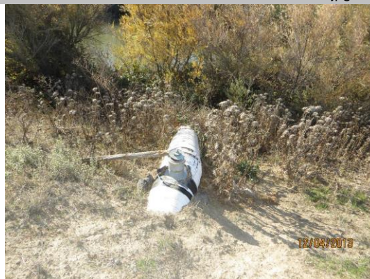
Siphon breaker on pipe at WS slope.