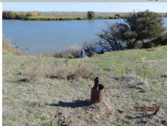
Siphon breaker in steel riser on WS slope with pipe and flap gate visible in background at WS berm.