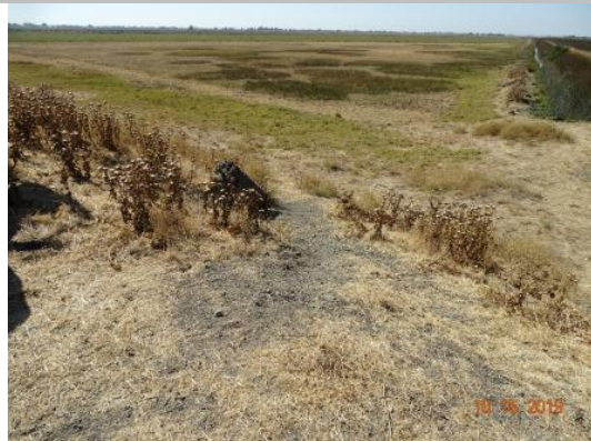
View looking downslope at cow path on the landside slope (Fall 2019).