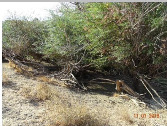
View of tree branches on the waterside slope (November 2018).