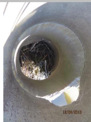
36-inch concrete riser with vegetation buildup inside.