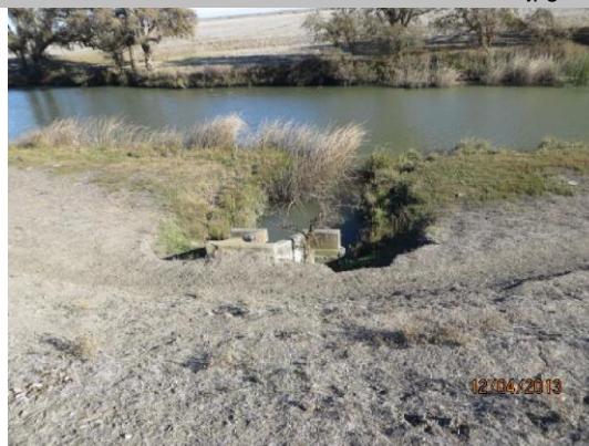
Concrete U-shaped headwall on WS toe. Note erosion scarp around headwall.