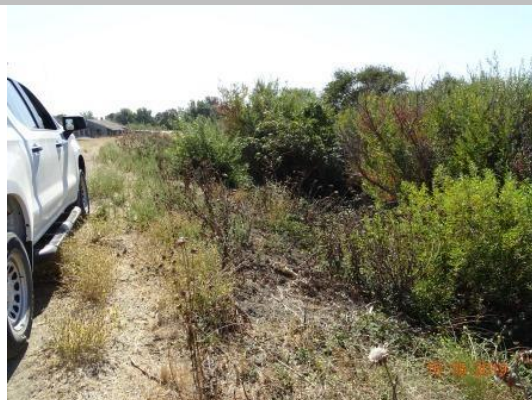
View looking downstream at thick vegetation on the waterside slope (Fall 2019).