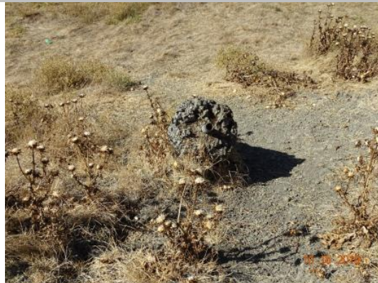
View of large concrete block on the landside slope (Fall 2019).

* Location LS : Land Side N/A : Not Applicable WS : Water Side CR : Crown