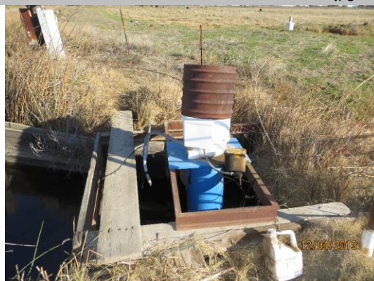
Pump in wooden distribution box off LS toe.