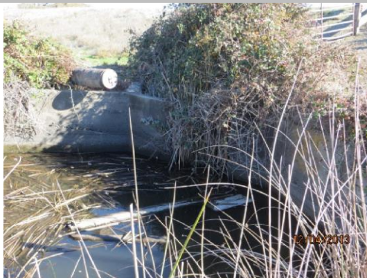
Vegetation covering possible location for 4X4 concrete culvert at LS toe.