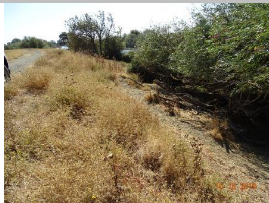
View looking downstream at trail caused by cows on the waterside slope (Fall 2019).