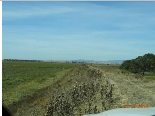
View looking upstream at vegetation on the land side slope (November 2018).