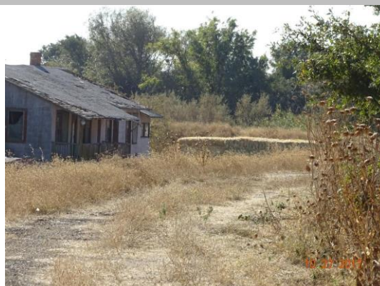
Crown vegetation should be reduced to facilitate inspection and access.