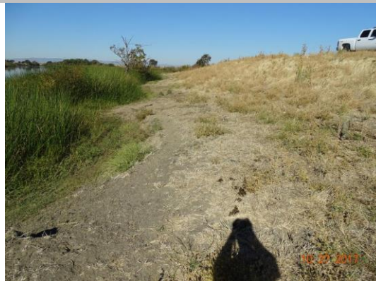
Scalloped bank erosion along slough is approaching levee toe.