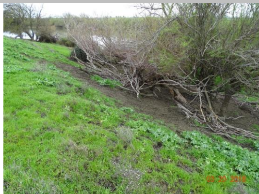
Spring 2018 - Trees should be trimmed and deadwood removed, and erosion from cattle repaired.