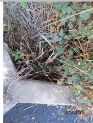
Some erosion on levee side of headwall at LS toe.