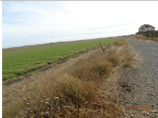
View looking downstream of vegetation on the land side slope (November 2018).