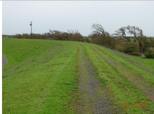
Spring 2018 - Crown road should be kept free of vegetation.