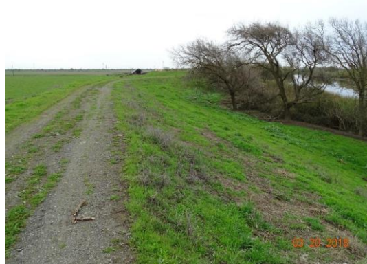
This previous erosion site should be monitored for future erosion from cattle.