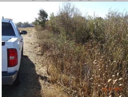
Remove wild growth to 20 feet from crown.