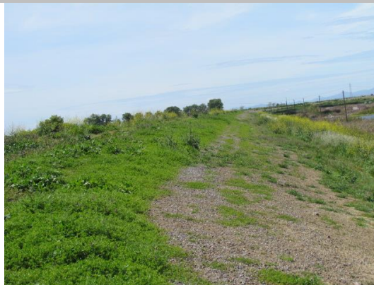
RD 2098 1A Looking upstream from levee mile 0.00-0.52 landside slope.