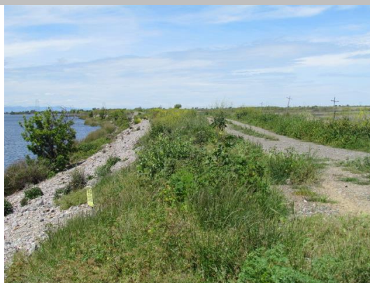
RD 2098 Unit 2 levee mile 5.30- 7.14 waterside levee slope and shoulder.

* Location LS : Land Side N/A : Not Applicable WS : Water Side CR : Crown