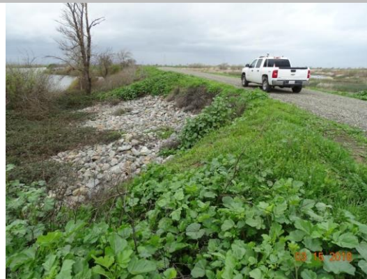
Monitor slumping on waterside slope.