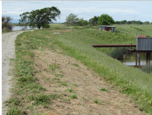
RD 2098 Looking downstream from levee mile 7.19-7.31