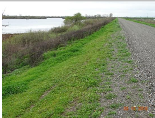
Thick vegetation on waterside slope.