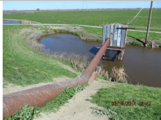
Pipe visible under new pipe on LS slope.