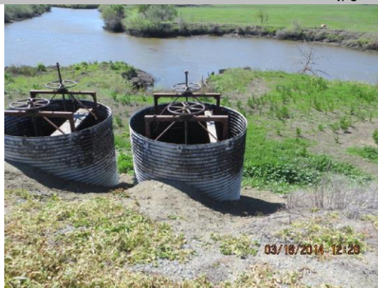
7-foot diameter CMP riser with two slide gates inside.