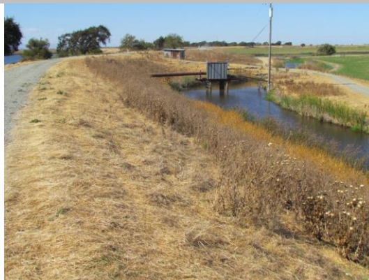
RD 2098 Looking downstream from levee mile 7.19 landside slope.