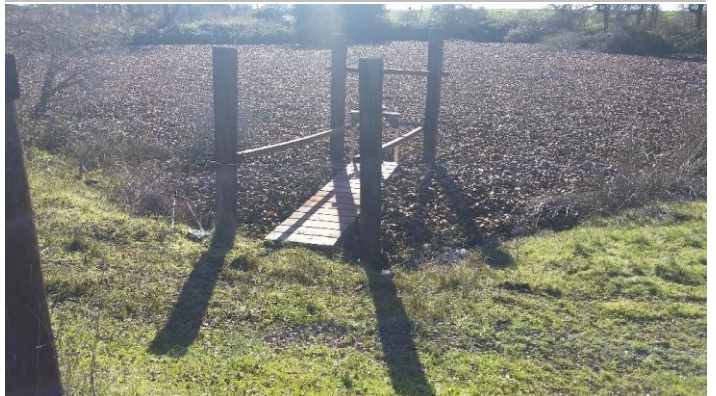
Walkway has been re-built, photo 2 of 2.