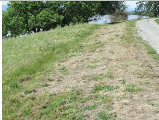
RD 2098 Unit 3 levee mile 7.19-7.31 waterside slope.

* Location LS : Land Side N/A : Not Applicable WS : Water Side CR : Crown