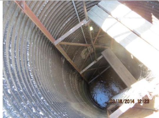
7-foot diameter CMP riser with two slide gates inside.