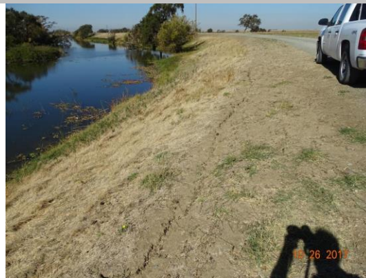
View upstream of cracks in waterside shoulder.