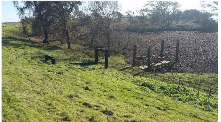
Walkway has been re-built, photo 1 of 2.