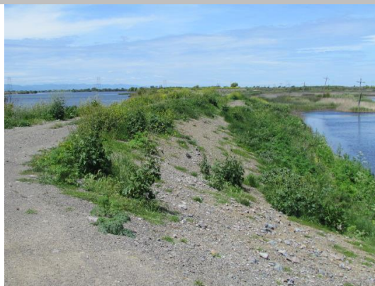
RD 2098 Unit 2 Levee mile 5.30-7.14 wild growth on the landside slope.