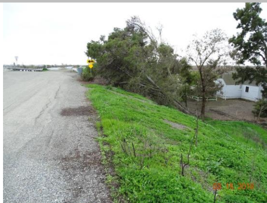
Remove fallen tree and trim remaining trees.