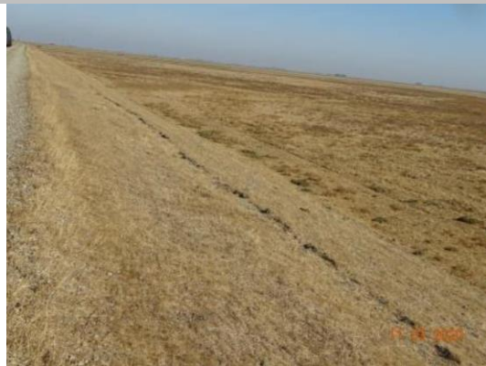
View looking upstream at depressions in the landside slope due to cows (Fall 2020).

* Location LS : Land Side N/A : Not Applicable WS : Water Side CR : Crown