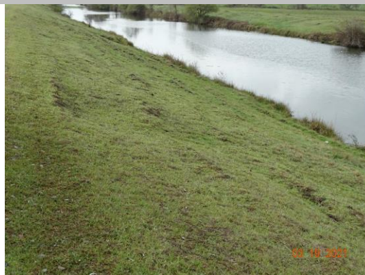
View of terracing due to cows on the landside slope (Spring 2021).