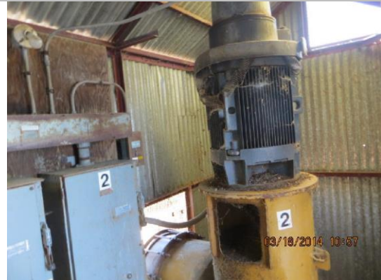
Pump in pumphouse on LS toe.