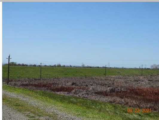
View of vegetation on the landside slope off in the distance (Spring 2021).