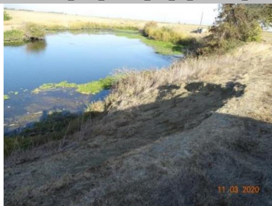
View looking upstream at erosion into the waterside slope (Fall 2020).