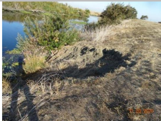
View looking upstream at erosion into the waterside slope (Fall 2020).