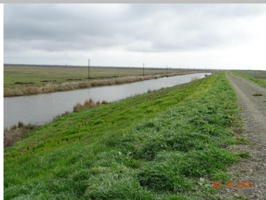
View looking downstream at vegetation on the landside slope (Spring 2021).