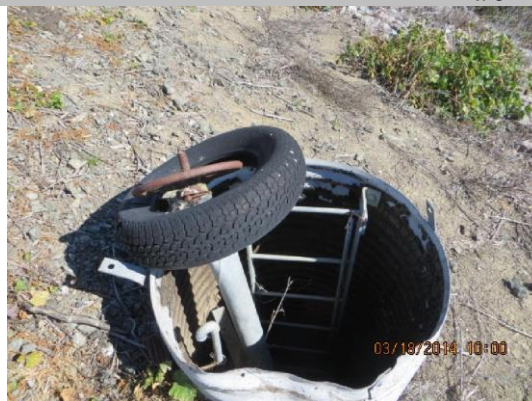
36-inch CMP riser with bent slide gate actuator on WS slope.