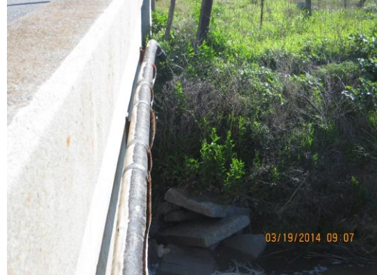
Pipe visible on South side of Bridge at Swan Road.