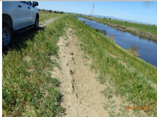
View looking upstream at erosion at the top of the landside slope (Spring 2020).

* Location LS : Land Side N/A : Not Applicable WS : Water Side CR : Crown