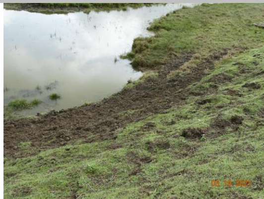
View of slope terracing caused by cattle on the landside slope (Spring 2021).