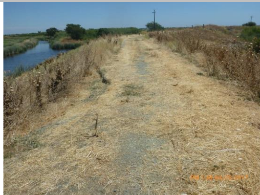
View of erosion on the landside levee crest. Photo taken in 2017.