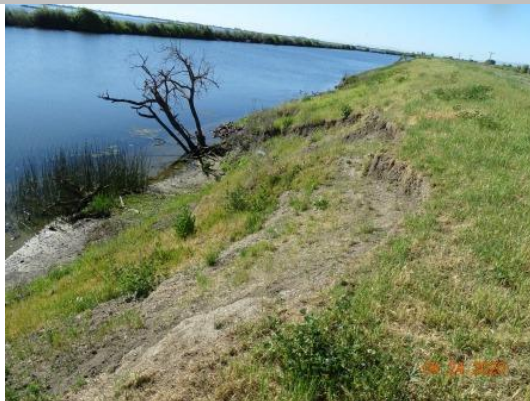
View looking downstream at erosion into the waterside slope (Spring 2020).