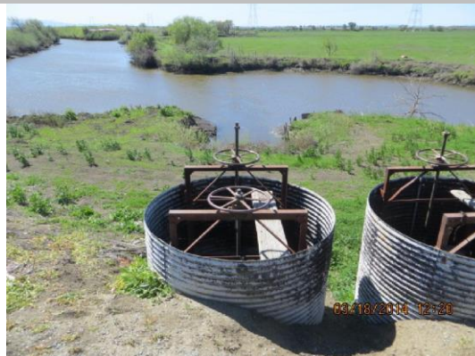
Two slide gates in 7-foot diameter CMP riser on waterward slope.