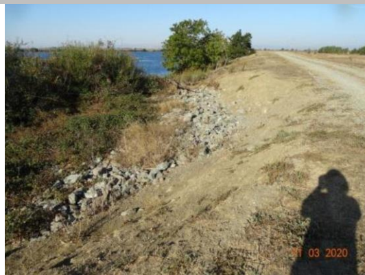
View looking upstream at erosion into waterside slope (Fall 2020).