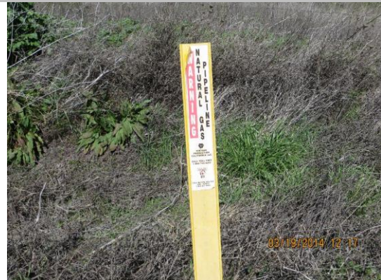
Sign off LS toe on East side of canal.