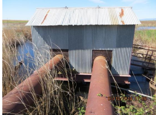
Pump in pumphouse on LS toe.