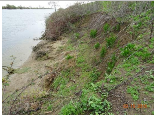
View of erosion.