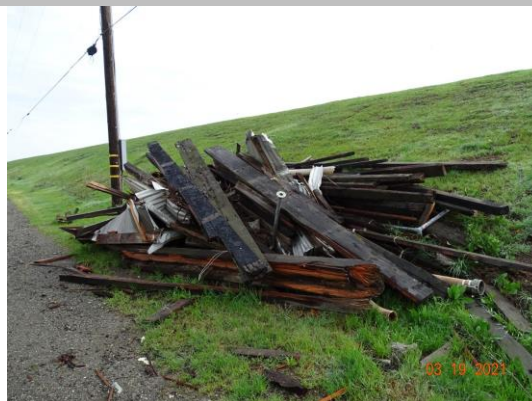
View of debris pile on the landside toe (Spring 2021).

* Location LS : Land Side N/A : Not Applicable WS : Water Side CR : Crown