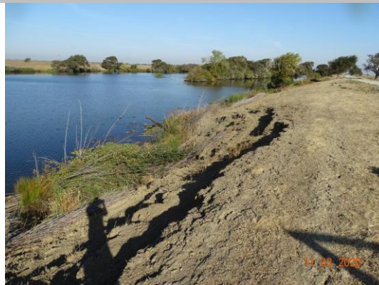
View looking upstream at erosion into the waterside slope (Fall 2020).