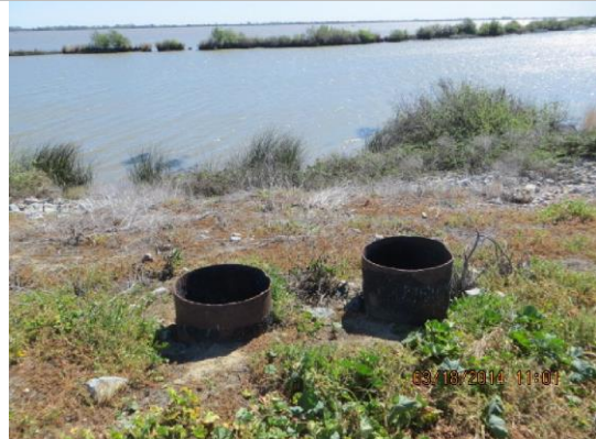
Siphon breaker in 24-inch steel riser on WS shoulder.