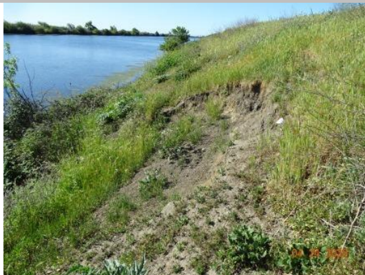
View looking upstream at erosion into the waterside slope (Spring 2020).