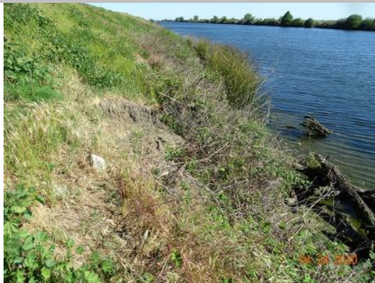
View looking upstream at erosion into the waterside slope (Spring 2020).