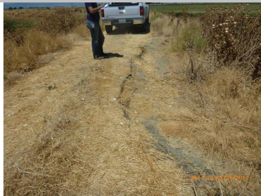
View of landside sloughing. Photo taken in 2017.