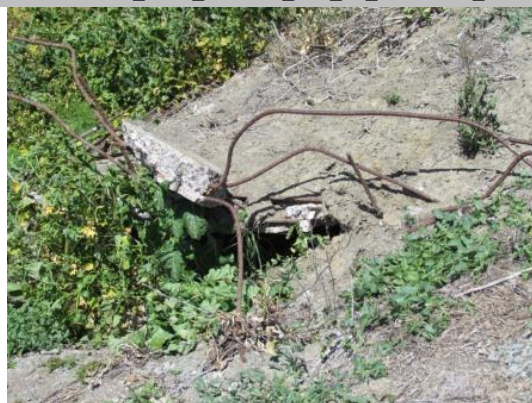
There is some slope damage at this location under this concrete.

* Location LS : Land Side N/A : Not Applicable WS : Water Side CR : Crown