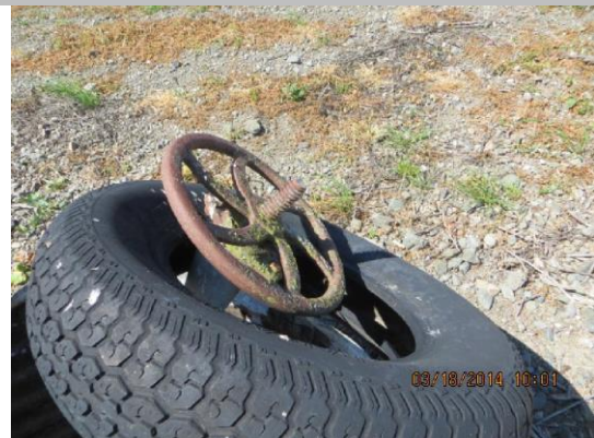
bent actuator on WS slope.