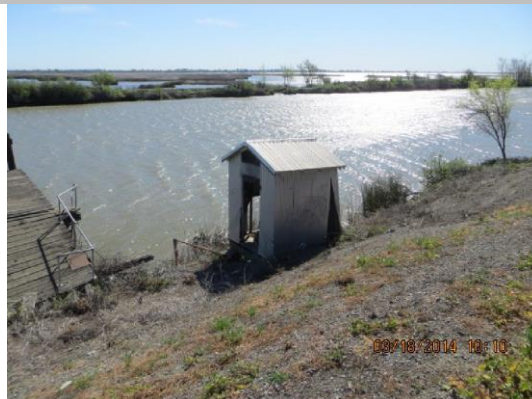
Pumphouse next to fishing dock on WS slope.