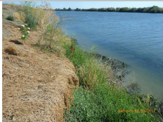
View of erosion on the waterside slope. Photo was taken in 2017.