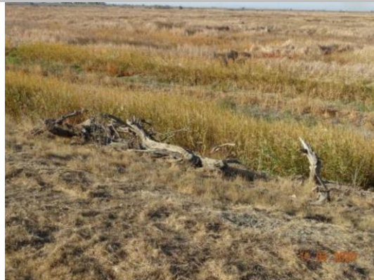
View of tree limb on the landside slope (Fall 2020).

LS : Land Side N/A : Not Applicable WS : Water Side CR : Crown