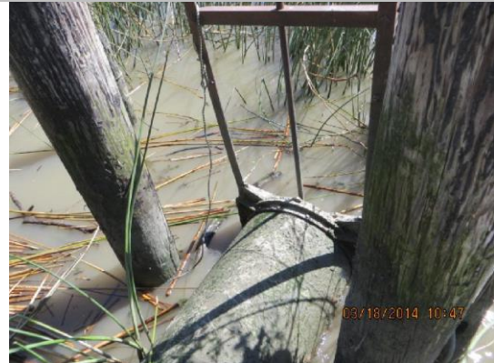
Slidegate on WS toe at pipe.