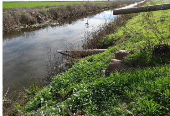
View of LS--damaged concrete distribution box has been removed.