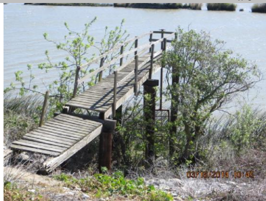
Walkway to slide gate actuator on WS toe.