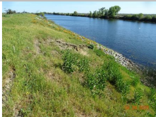
View looking upstream at erosion in the waterside slope (Spring 2020).