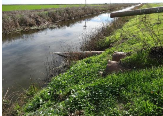
View of LS--damage distribution box noted in last inspection has been removed.