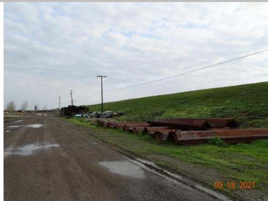
View of material piles on the landside toe (Spring 2021).