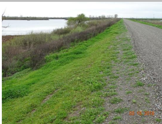
Thick vegetation on waterside slope.