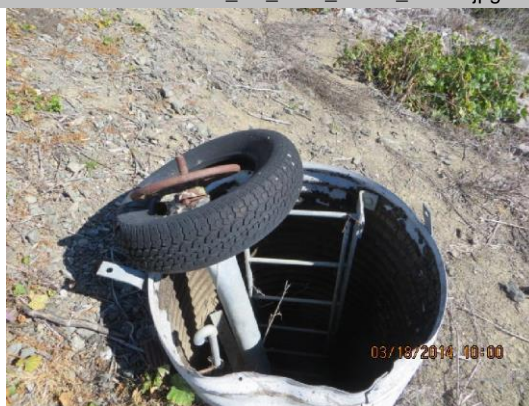
36-inch CMP riser with bent slide gate actuator on WS slope.