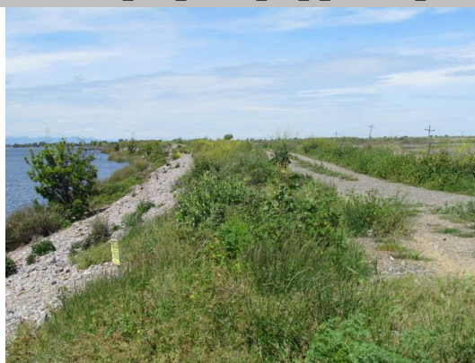
RD 2098 Unit 2 levee mile 5.30- 7.14 waterside levee slope and shoulder.

* Location LS : Land Side N/A : Not Applicable WS : Water Side CR : Crown