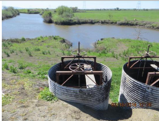
Two slide gates in 7-foot diameter CMP riser on waterward slope.