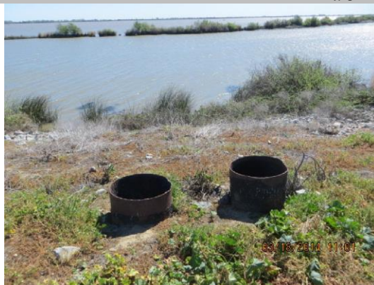
Siphon breaker in steel riser on WS shoulder.