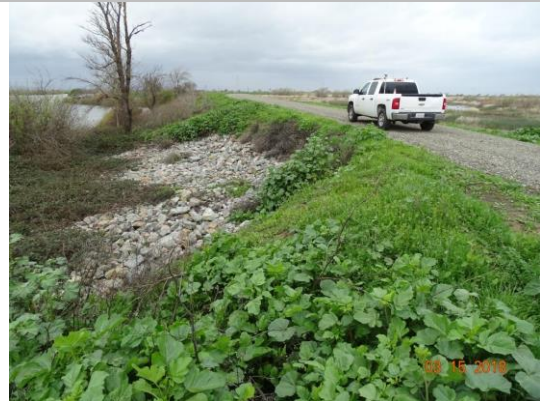
Monitor slumping on waterside slope.