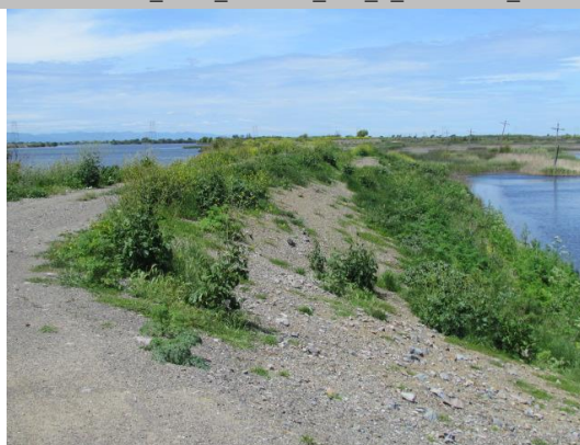
RD 2098 Unit 2 Levee mile 5.30-7.14 wild growth on the landside slope.