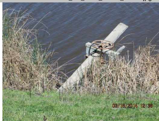
Slide gate at LS toe.