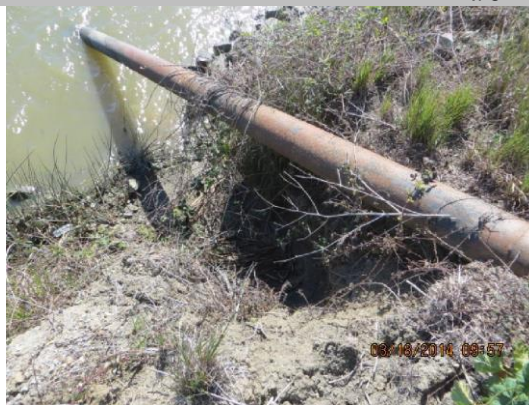
Erosion under pipe at WS toe.