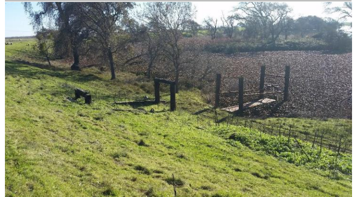
Walkway has been re-built, photo 1 of 2.