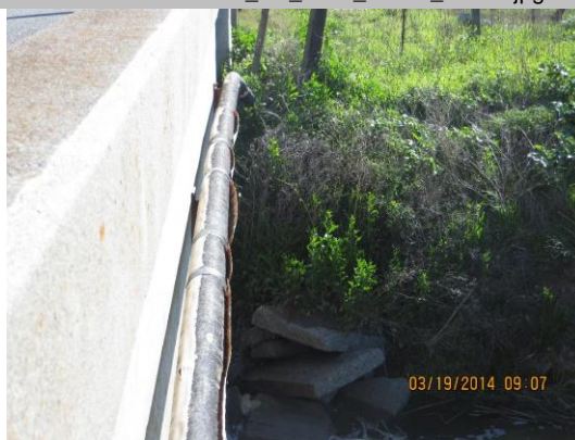
Pipe visible on South side of Bridge at Swan Road.