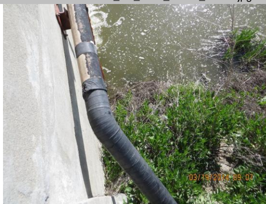
Pipe visible on South side of Bridge at Swan Road.