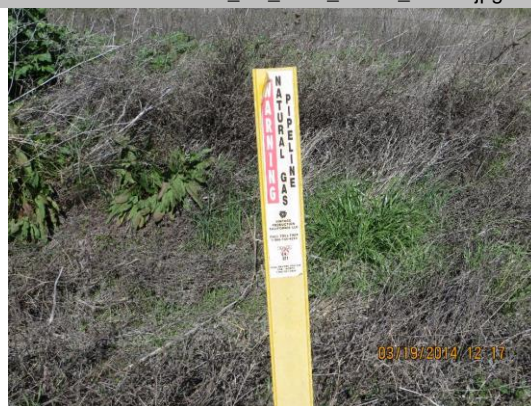
Sign off LS toe on East side of canal.