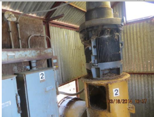
Pump in pumphouse on LS toe.