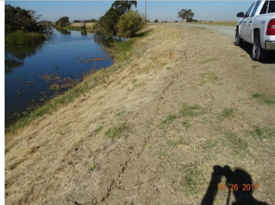
View upstream of cracks in waterside shoulder.