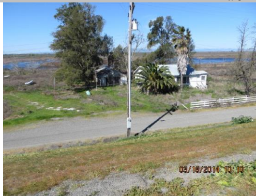
Power pole and meter next to spigot on LS toe.