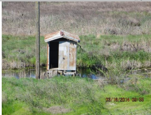
Pumphouse at lowpoint off LS toe.