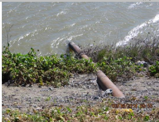
Pipe on WS slope.