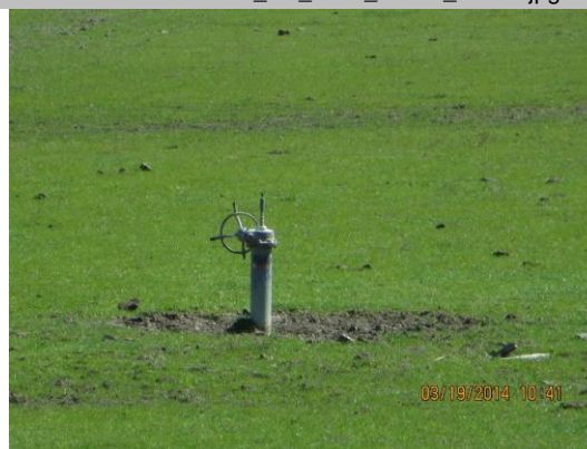
Shutoff valve visible 370-feet off LS toe.