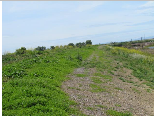
RD 2098 1A Looking upstream from levee mile 0.00-0.52 landside slope.