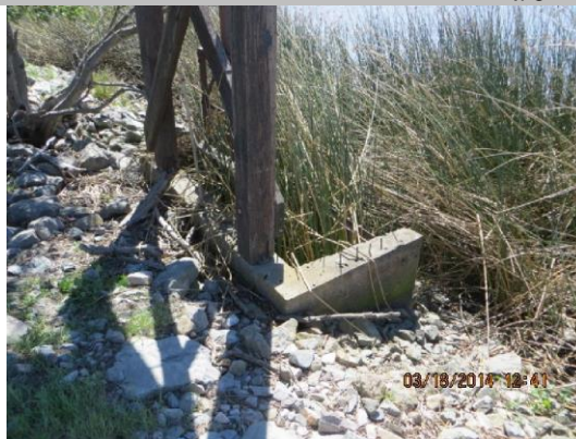
Concrete U-shaped headwall on WS toe.