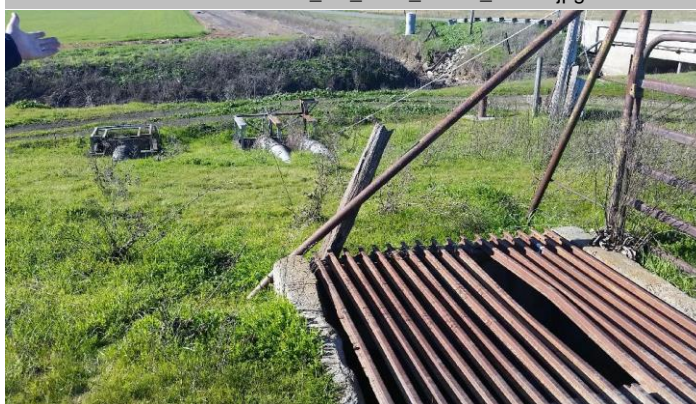
View of WS photo taken from levee crown.