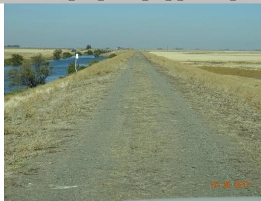
Several areas of scalloped erosion at waterside toe. Largest area is visible in distance in this photo.