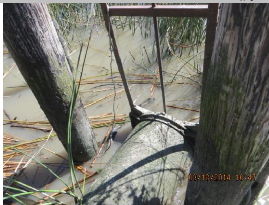
Slidegate on WS toe at pipe.