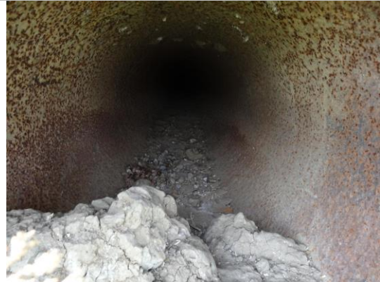
Inside view of pipe from LS.