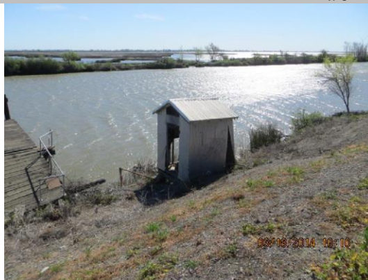
Pumphouse next to fishing dock on WS slope.