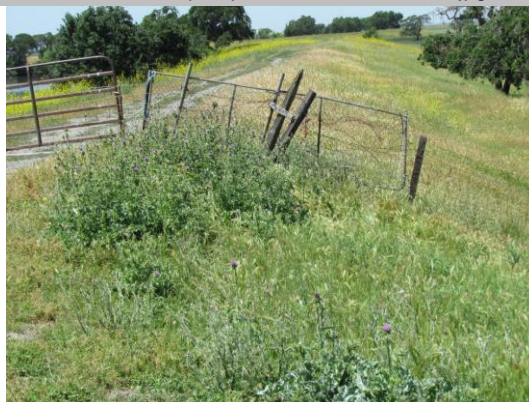
Tall weeds on the landside shoulder slope and toe of the levee section.