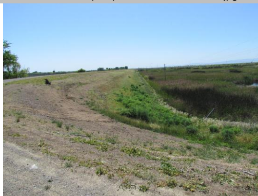
Looking downstream from landside slope levee mile 0.02 RD 2098 Unit 1. Photo taken 05-13-2014.