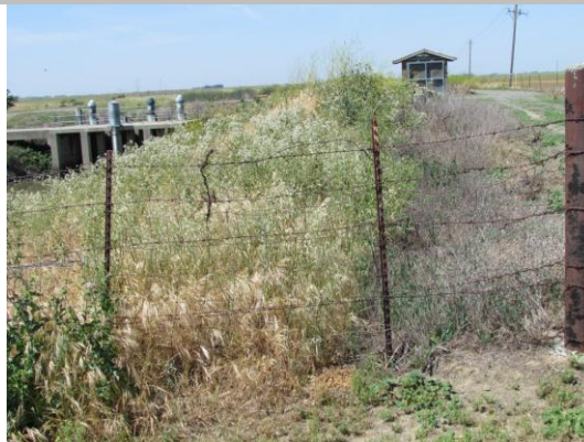
Unsatisfactory tall weeds covering the waterward slope and shoulder.