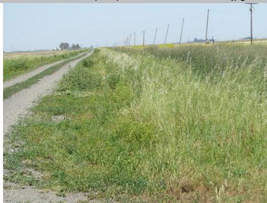
Tall weeds along the canal.

* Location LS : Land Side WS : Water Side CR : Crown