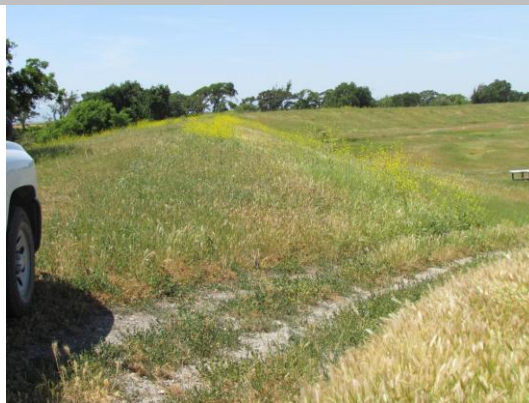
Tall weed grasses covering the landside levee slope.

* Location LS : Land Side WS : Water Side CR : Crown