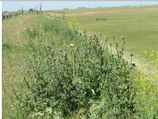
Unsatisfactory tall weeds on the landside shoulder and slope. Photo taken 05-14-2014.