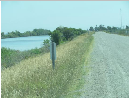
RD 2098 Looking downstream waterside levee mile 0.02. Photo taken 13-05-2014.