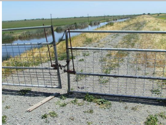
This gate has no hinges.