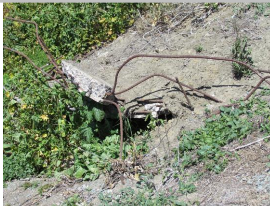
There is some slope damage at this location under this concrete.