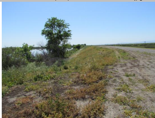
Unit 1A waterside looking downstream. 0.01. Photo taken 05-13-2014.

* Location LS : Land Side WS : Water Side CR : Crown