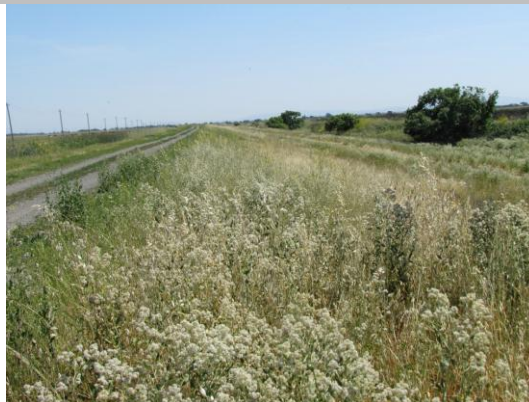
Waterside looking upstream at tall weeds covering the levee section.

* Location LS : Land Side WS : Water Side CR : Crown