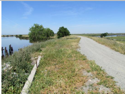
Looking downstream from the waterside of Unit 3. Photo taken 05-14-2014.