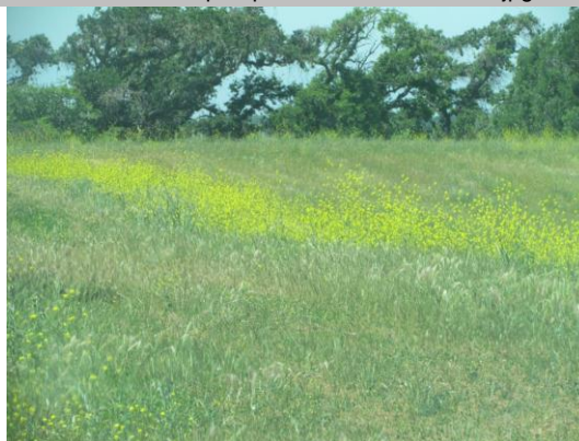
Unsatisfactory tall weeds are covering landside slope.