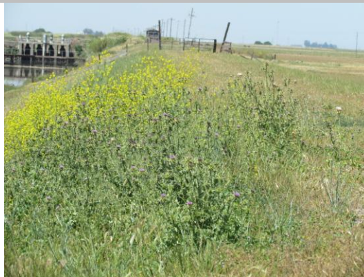
Unsatisfactory milk weeds covering the waterside levee section. Photo taken 05-14-2014.