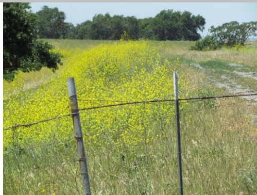
Unsatisfactory growth of tall mustard grass completely covering the waterward levee slope.

LS : Land Side WS : Water Side CR : Crown