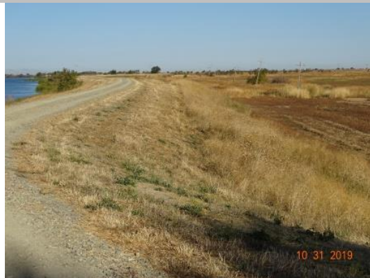
View looking upstream at vegetation on the landside slope (Fall 2019).