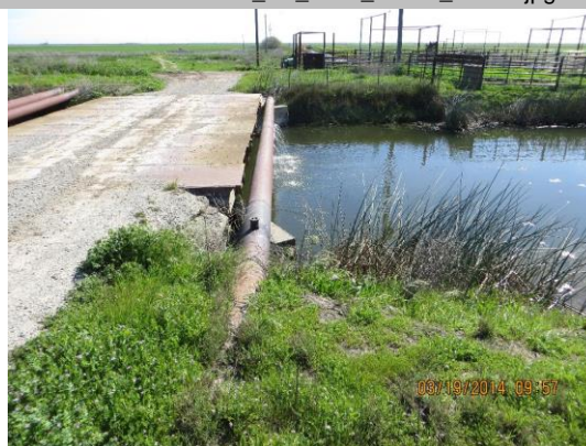
Pipe and siphon breaker visible on LS at canal crossing.