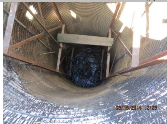
View inside CMP riser on WS shoulder.