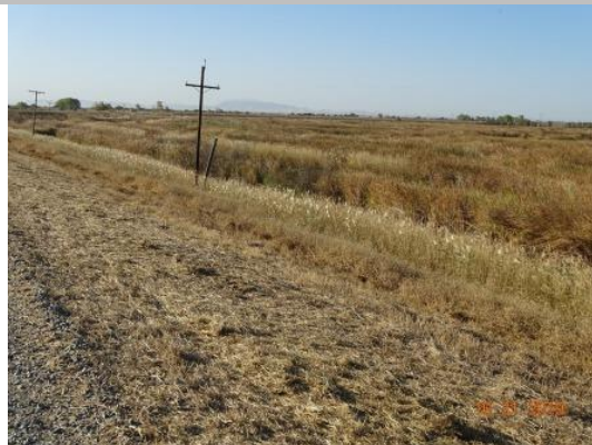
View looking upstream at vegetation on the landside slope (Fall 2019).