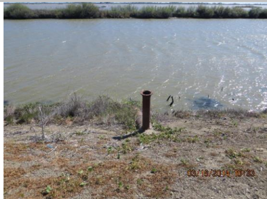
Siphon breaker in steel riser on WS slope.