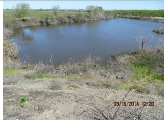
Inlet not visible on LS toe.