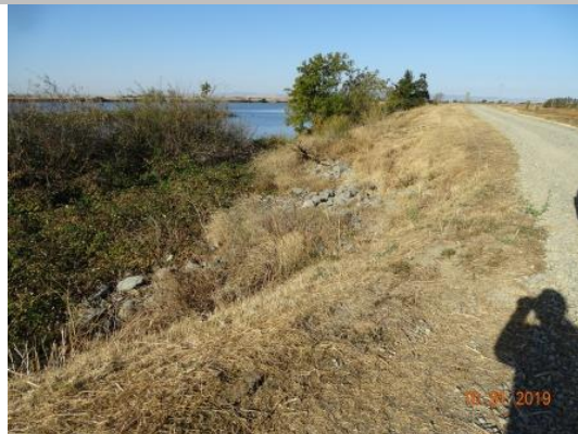
View looking upstream at erosion site on the waterside slope (Fall 2019).