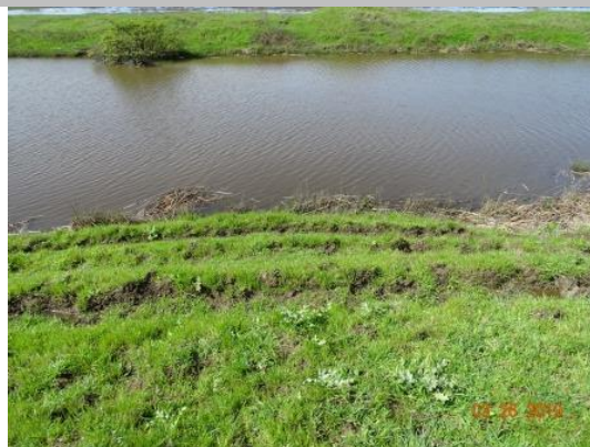
View looking downslope at deep ruts in the waterside slope made by cows (Spring 2019).

* Location LS : Land Side N/A : Not Applicable WS : Water Side CR : Crown