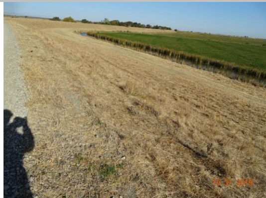
View looking upstream at slope depressions caused by cows (Fall 2019).