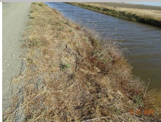
View looking upstream at slope stability site on the landside slope next to the canal (Fall 2019).