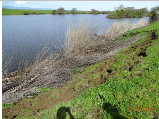
View looking upstream at erosion at the storm damage site that has worsened over January and February of 2019 (Spring 2019).