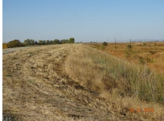
View looking upstream at annual vegetation on the landside slope (Fall 2019).