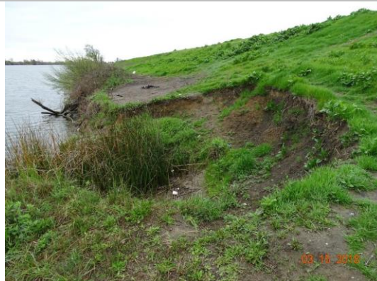
View of erosion on waterside.