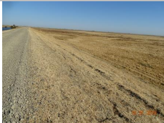
View looking upstream at depressions in the landside slope due to cows (Fall 2019).