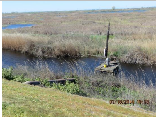
Pump on pile structure in drainage channel on LS toe.