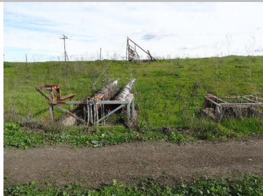
View of WS--pipe crossing is located on the right.