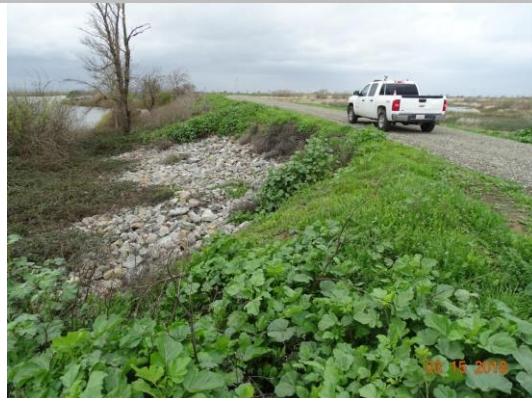
Repair slumping on waterside slope.