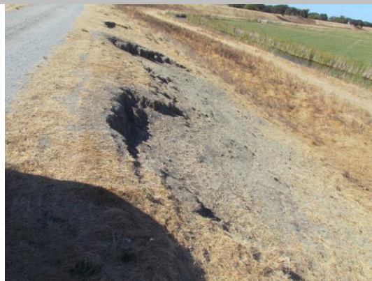
Close up. Looking upstream.