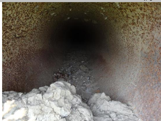
Inside view of pipe from LS.