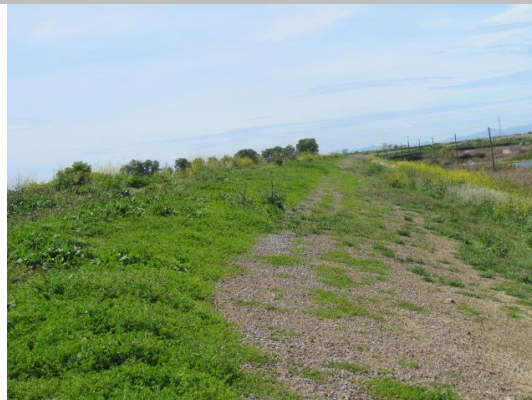
RD 2098 1A Looking upstream from levee mile 0.00-0.52 landside slope.