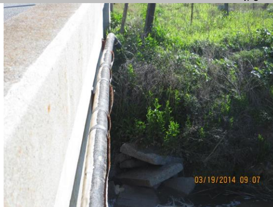
Pipe visible on South side of Bridge at Swan Road.