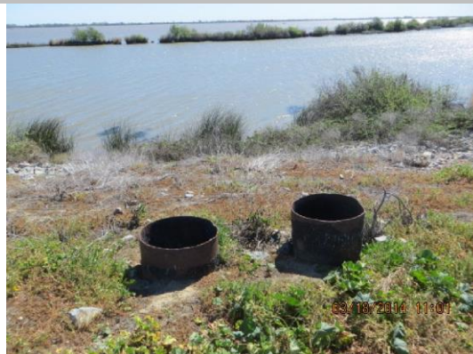
Siphon breaker in steel riser on WS shoulder.