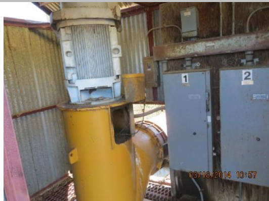
Pump in pumphouse on LS toe.