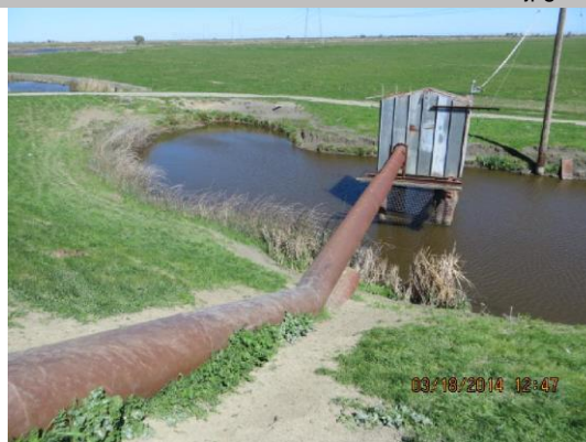
Pipe visible under new pipe on LS slope.