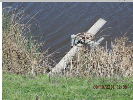
Slide gate at LS toe.