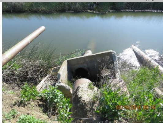
Concrete distribution box on LS slope has slipped into canal.