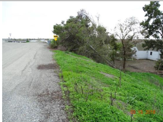
Remove fallen tree and trim remaining trees.