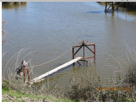
Slide gate at LS toe.