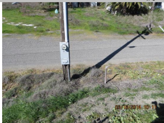
Power pole and meter next to spigot on LS toe.