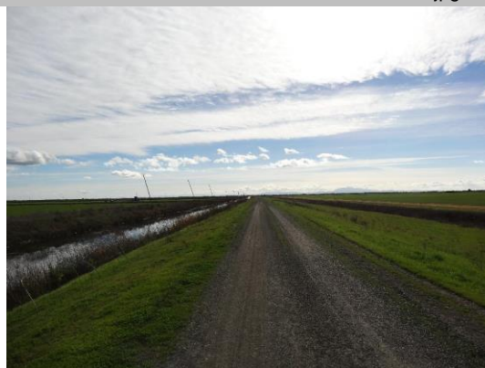
View of levee crown and slopes through this section of the levee.