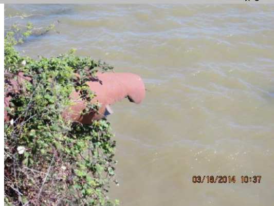
Pipe rusted through at outlet on WS slope.