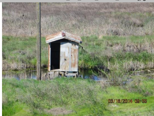
Pumphouse at lowpoint off LS toe.