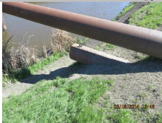
Pipe visible under new pipe on LS slope.