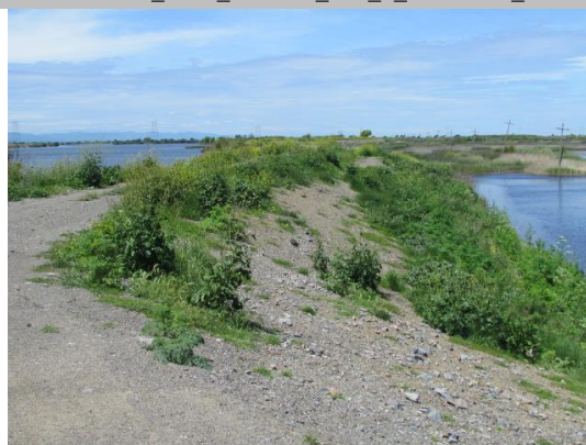
RD 2098 Unit 2 Levee mile 5.30-7.14 wild growth on the landside slope.