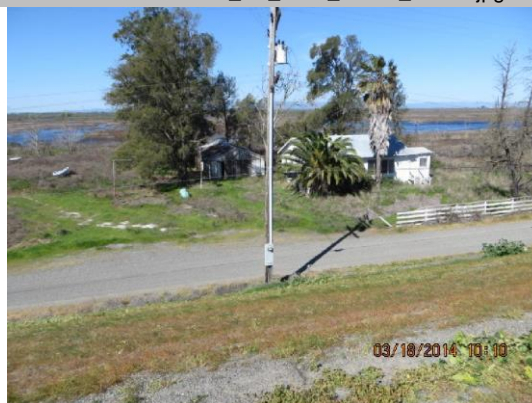
Power pole and meter next to spigot on LS toe.