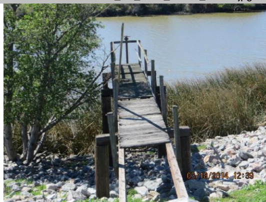
Delapidated wooden pier on WS shoulder.