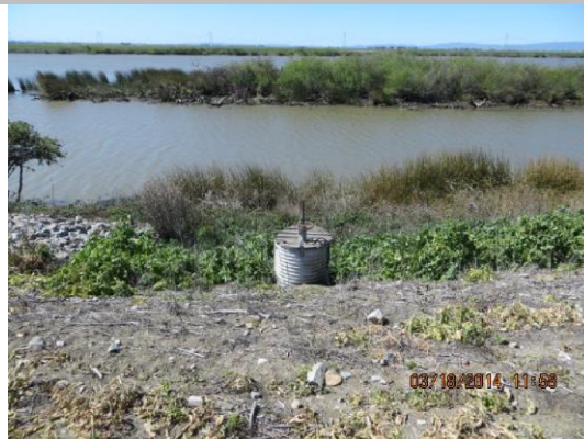
Slide gate in 36-inch standpipe on WS slope.