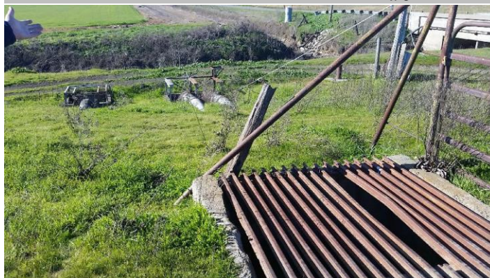
View of WS photo taken from levee crown.