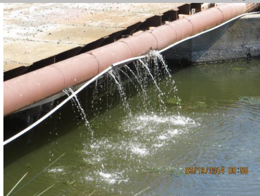
Holes in pipe next to bridge. PVC electrical conduit shown.