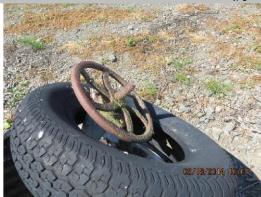
bent actuator on WS slope.