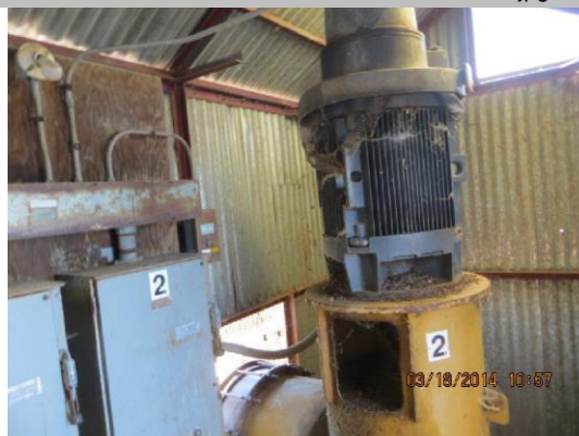
Pump in pumphouse on LS toe.