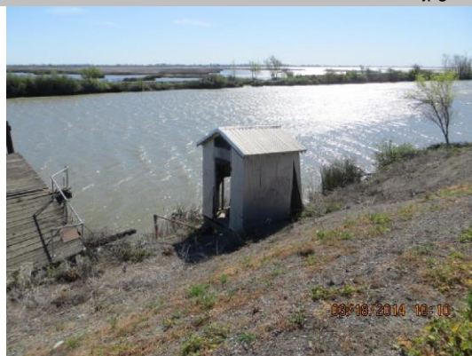
Pumphouse next to fishing dock on WS slope.