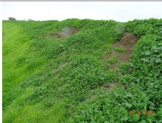
Erosion site on 03/15/18.