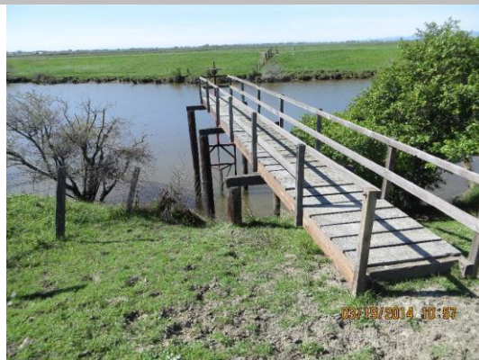
Walkway with slide gate on WS toe.