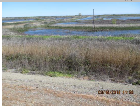
LS - no pipe visible.