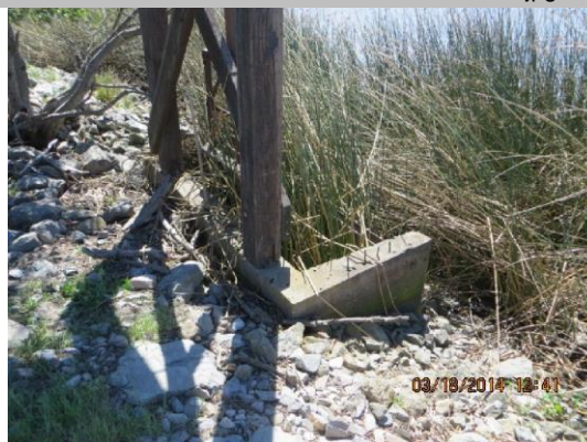
Concrete U-shaped headwall on WS toe.