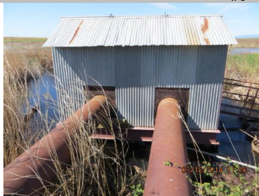
Pump in pumphouse on LS toe.