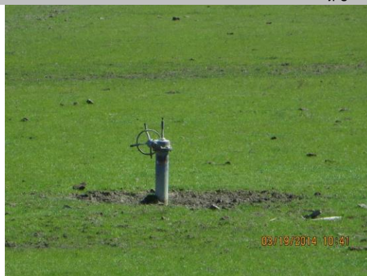
Shutoff valve visible 370-feet off LS toe.