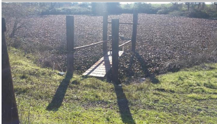
Walkway has been re-built, photo 2 of 2.