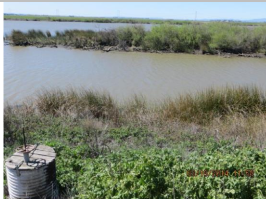
Slide gate in 36-inch standpipe on WS slope.