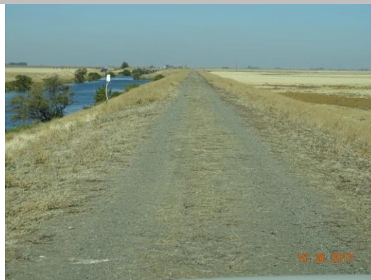
Several areas of scalloped erosion at waterside toe. Largest area is visible in distance in this photo.