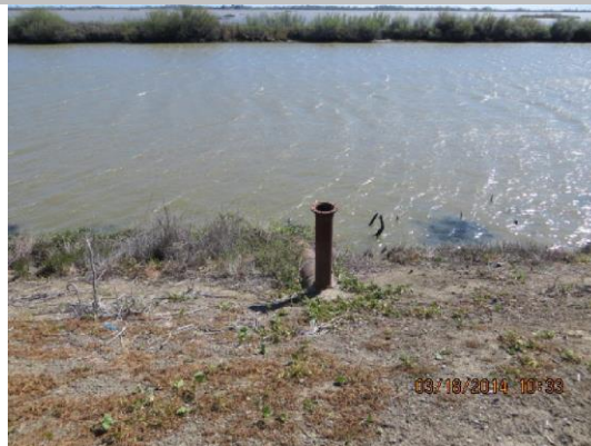
Siphon breaker in steel riser on WS slope.