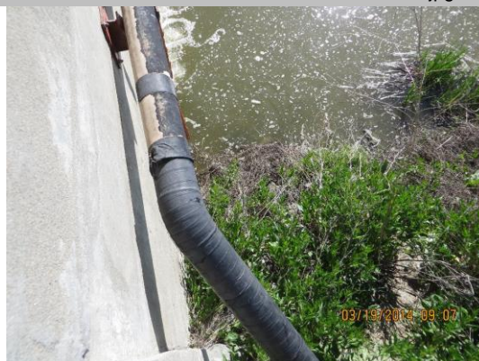
Pipe visible on South side of Bridge at Swan Road.