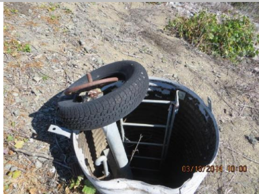
36-inch CMP riser with bent slide gate actuator on WS slope.