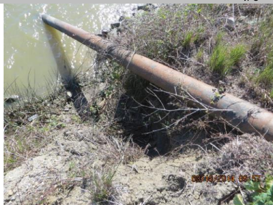
Erosion under pipe at WS toe.