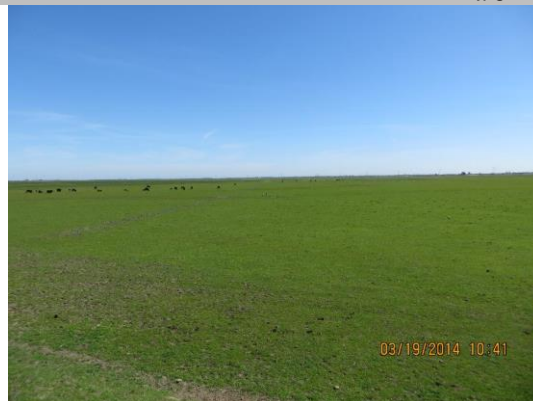
Shutoff valve visible 370-feet off LS toe.