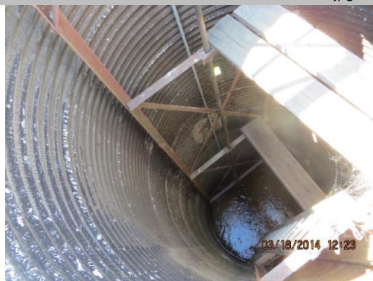
7-foot diameter CMP riser with two slide gates inside.