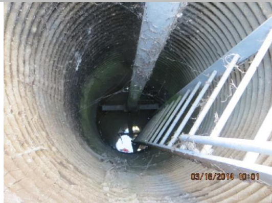
No lid on CMP riser that is 24-feet deep.