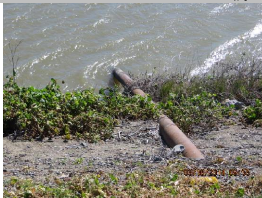
Pipe on WS slope.