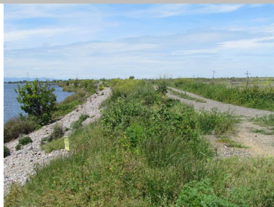
RD 2098 Unit 2 levee mile 5.30- 7.14 waterside levee slope and shoulder.