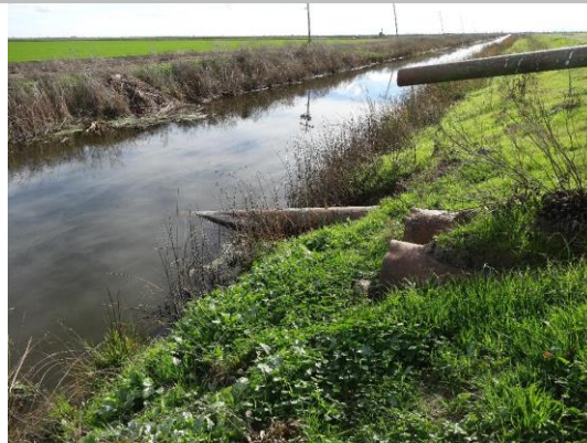
View of LS--damage distribution box noted in last inspection has been removed.