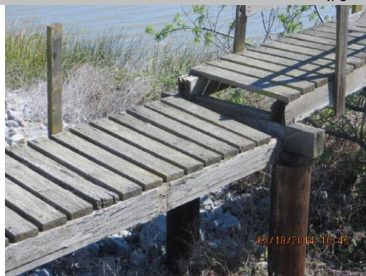
Walkway may not be structurally sound.