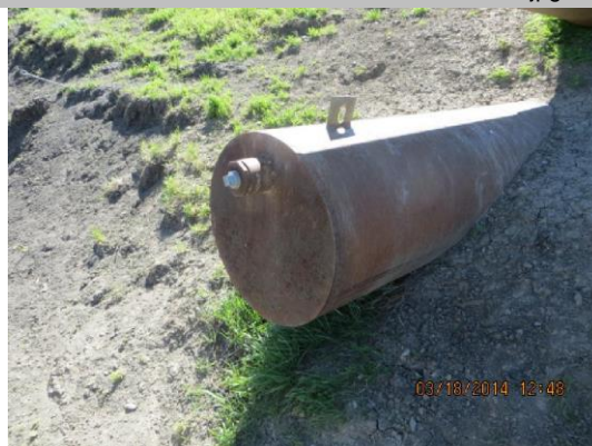
Welded steel cap over LS end of pipe.