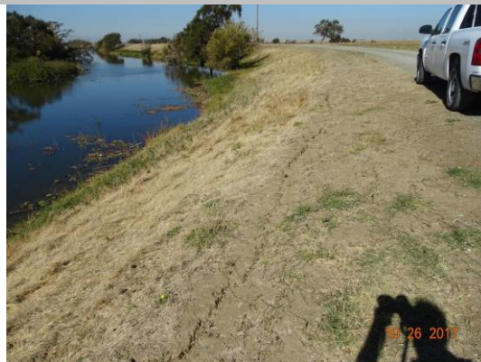
View upstream of cracks in waterside shoulder.