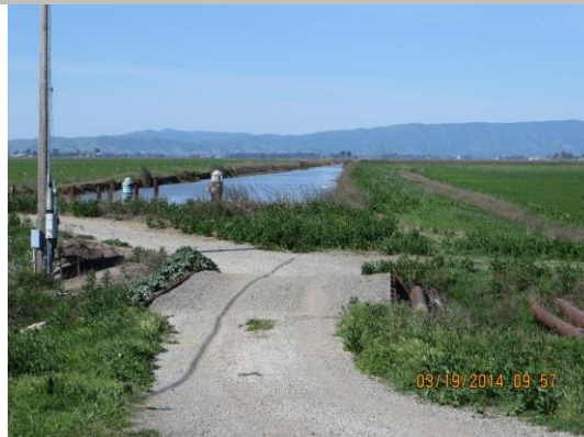
Pump on pier in irrigation canal off WS toe.