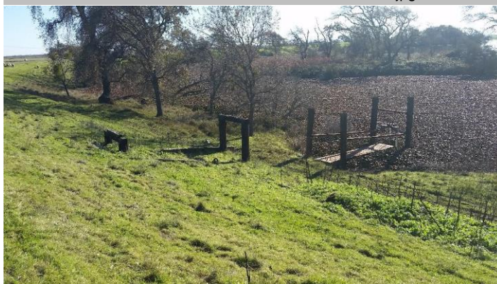
Walkway has been re-built, photo 1 of 2.