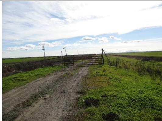
Overview of levee crown at multiple pipe crossings.