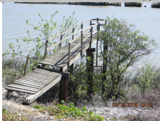
Walkway to slide gate actuator on WS toe.