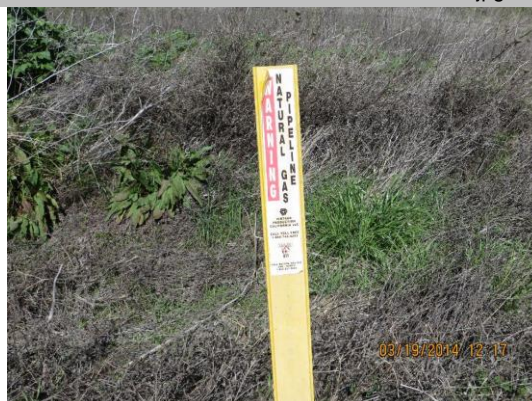
Sign off LS toe on East side of canal.