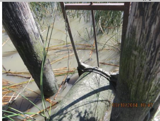
Slidegate on WS toe at pipe.