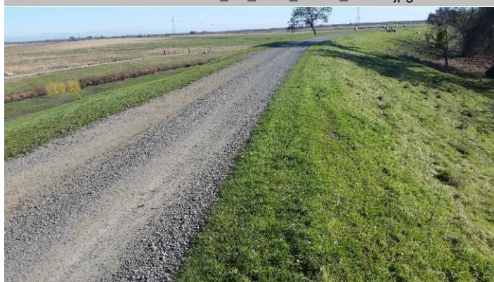
View of levee crown at pipe crossing.