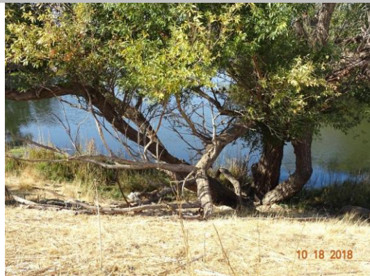
View of fallen tree limb on the water side slope (October 2018).