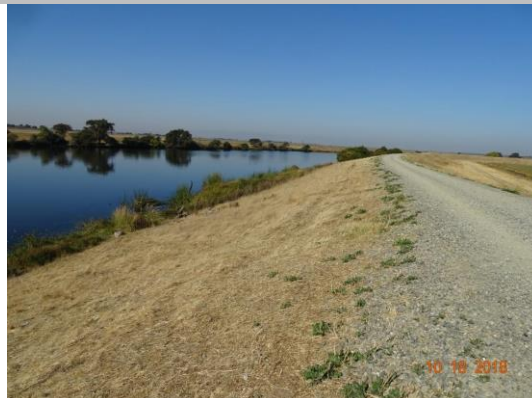
View looking upstream of acceptable vegetation on the water side slope (October 2018).