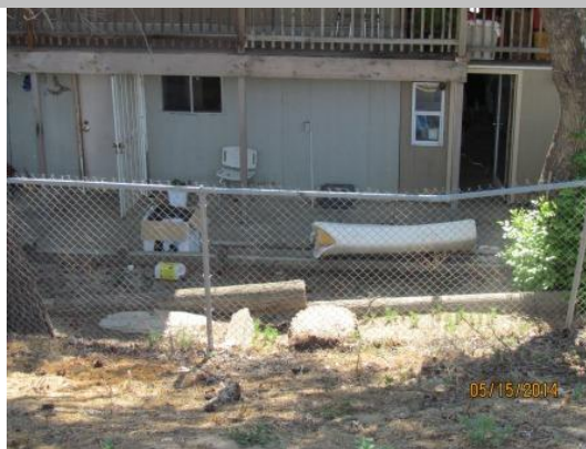
View of the tree stump at the landside levee toe.