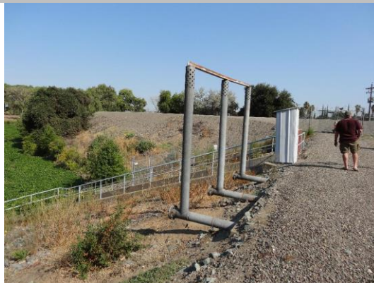
WS view: three air vents for three drainage pipes on levee shoulder.