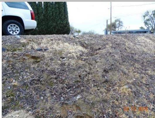
View of the previously rodent infested area on the landside levee slope.