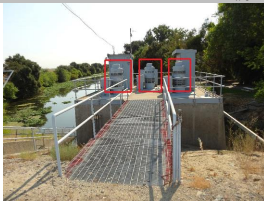
LS view: automatic pumping plant with three pumps. Steel walkway to pump platform.