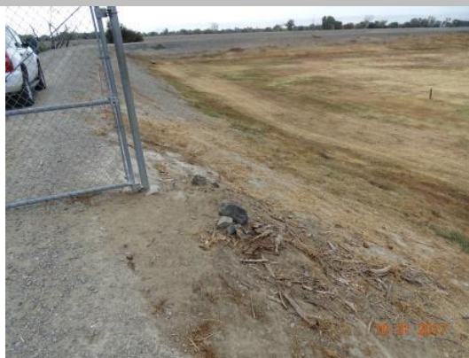
View of the material placed to prevent vehicles from driving around the gate.