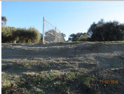
View of the waterside slope damaged by vehicle.

* Location LS : Land Side N/A : Not Applicable WS : Water Side CR : Crown