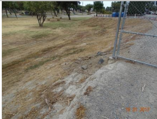
Another view of the material placed to prevent vehicles from driving around the gate. Looking downstream.