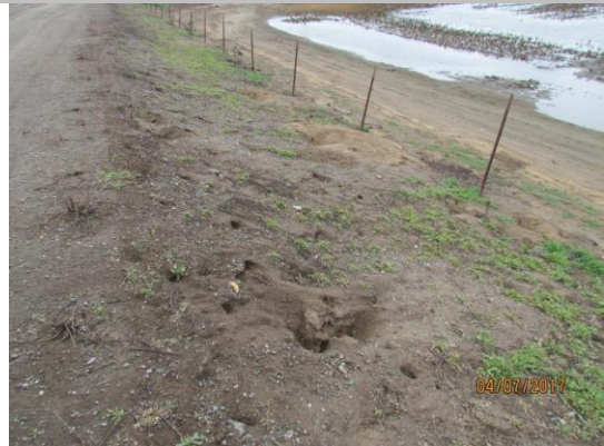
View of multiple rodent holes on the waterside slope of the levee. Spring 2017