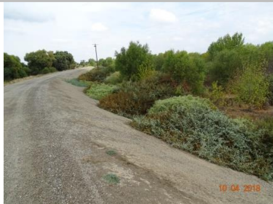
Vegetation along landside slope and toe obstructing view. (Fall 2018)