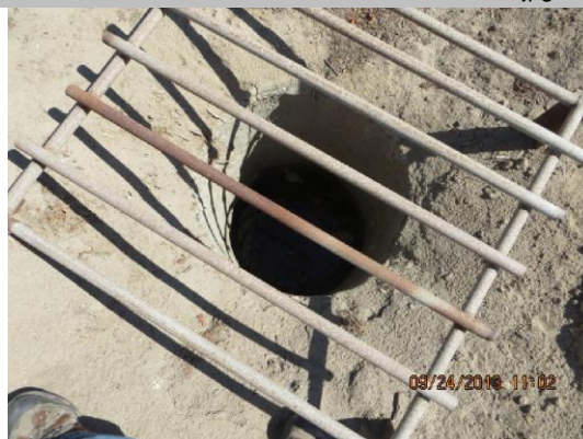
Grate over sump on LS toe.