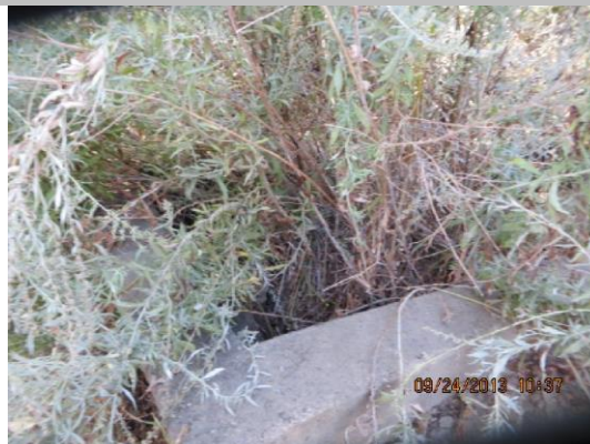
Concrete U-shaped headwall and flapgate on WS berm.