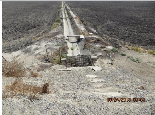
Concrete headwall at base of LS toe.