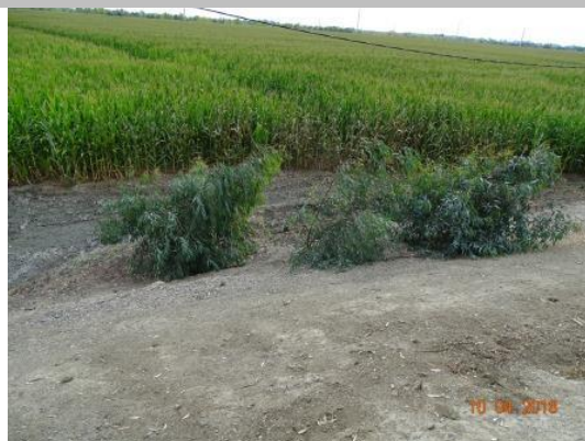
View of saplings along landside levee toe. (Fall 2018)