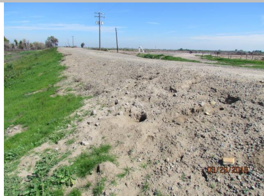
Looking upstream on waterward slope at several large rodent holes. (Spring 2018)