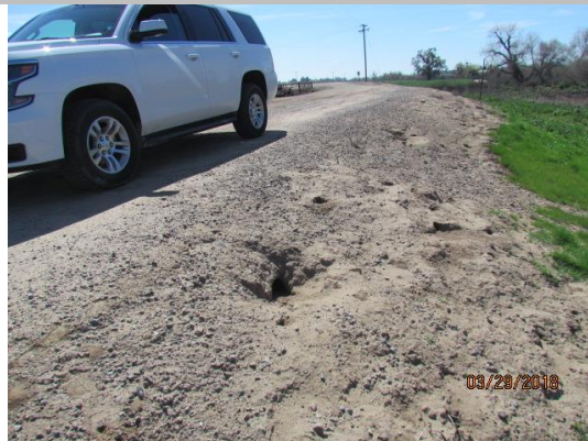
Looking downstream at several rodent holes on waterward slope. (Spring 2018)