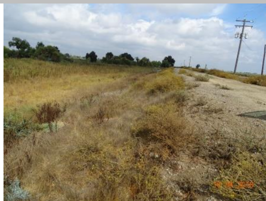
Vegetation on waterside slope should be maintained. (Fall 2018)