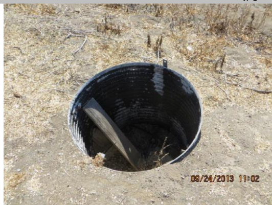
48-inch CMP riser on WS slope.