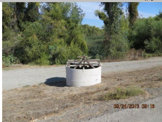
Slide gate in 80-inch CMP riser on WS slope.