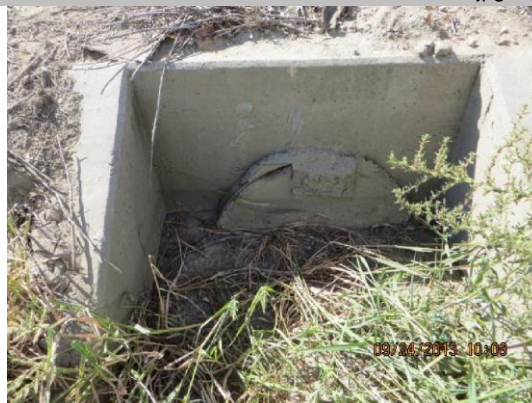
Pipe and concrete headwall visible on LS toe.