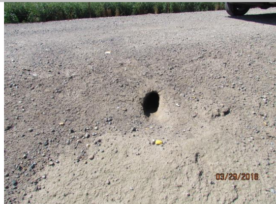
Looking at Typical view of rodent holes on landward slope within this reach. (Spring 2018)