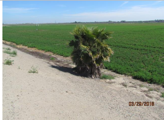
Looking at Palm tree at landward toe. (Spring 2018)