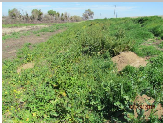
Looking upstream at large rodent holes on waterward slope. (Spring 2018)