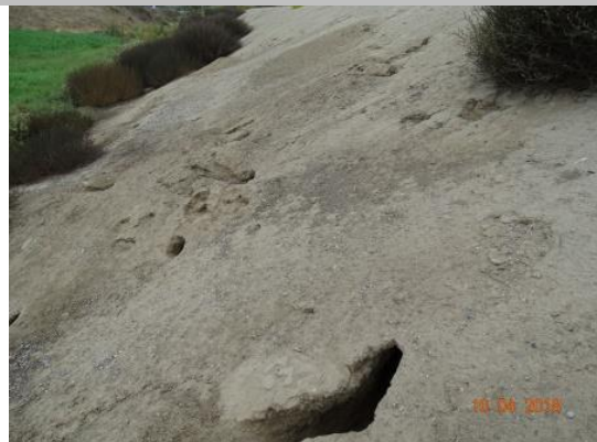
View of animal burrows looking upstream. (Fall 2018)