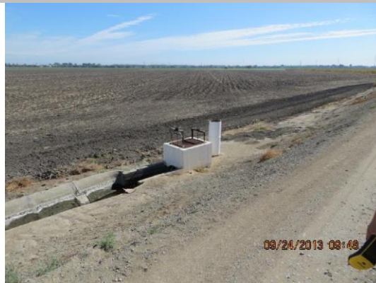
Concrete distribution box at concrete canal on LS toe.