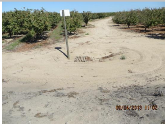
Grate over sump on LS toe.