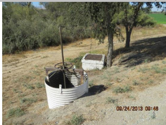
Slide gate in 48-inch CMP riser on WS slope.