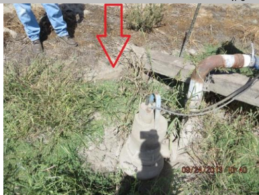
Concrete headwall next to pump on WS toe.