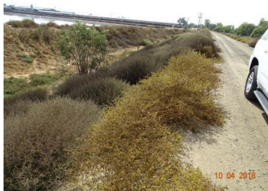
View of vegetation along landside slope looking upstream. (Fall 2018)