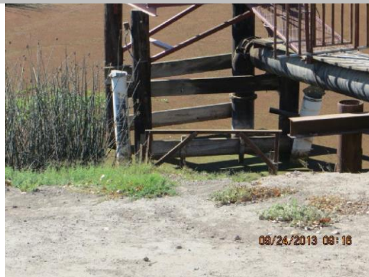
Concrete headwall on LS toe in front of pump on pier.