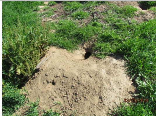
Looking at typical large rodent holes on waterward slope. (Spring 2018)