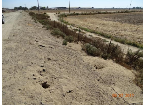
Updated picture of the rodent holes on the waterside of the levee looking upstream. Fall 2017