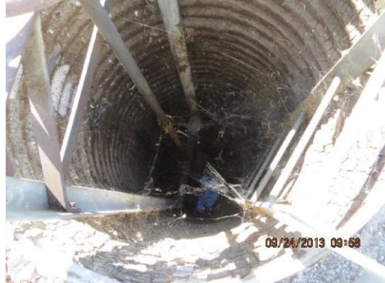
Slide gate in 36-inch CMP riser on WS slope.