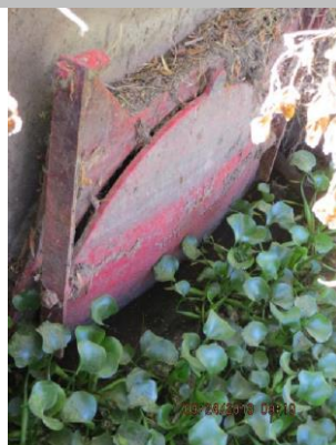
Flapgate and headwall on WS toe.