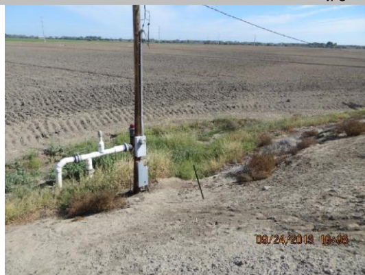
Pipe and concrete headwall visible on LS toe to right of powerpole.