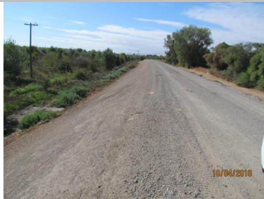
View of the landside slope of the levee during fall 2016 inspection.