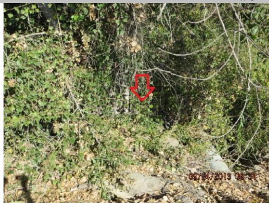
Pipe visible at rivers edge on WS toe.