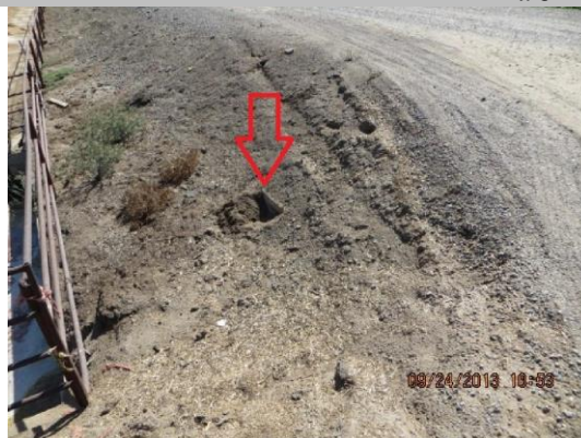
Concrete headwall visible on LS slope.