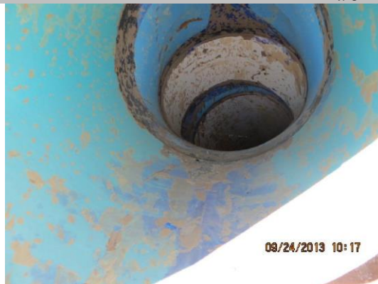
Inside of pipe at LS shoulder.