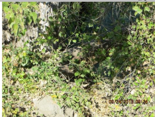
Pipe visible at rivers edge on WS toe.