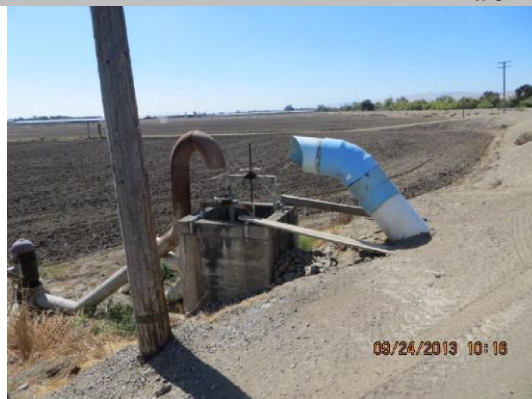
5x5 concrete distribuion box on LS toe.