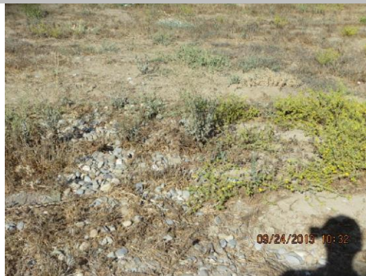
Gravel on WS slope appears to indicate trench.