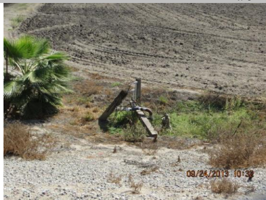
Pump and 4-inch pipe visible at LS toe.