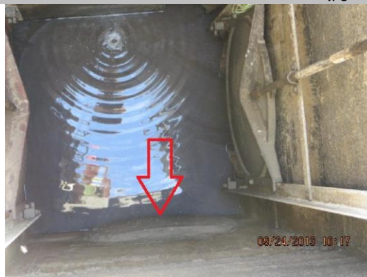
Pipe filled with concrete inside conc. distro box on LS toe.