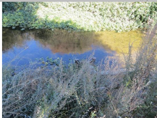
24-inch CMP on concrete headwall with flapgate on WS toe.