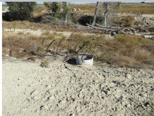
Slide gate in 36-inch CMP riser on WS toe.