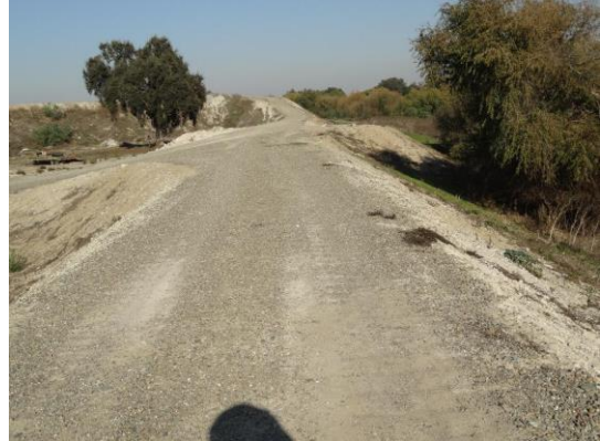
Overview photo of levee crown at crossing.