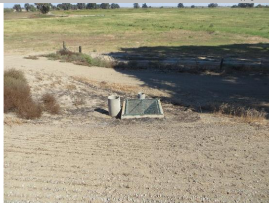
Distribution box on LS toe.