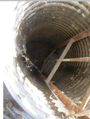
Slide gate in 36-inch CMP riser on WS toe.