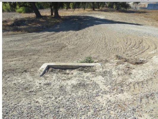
Abandoned concrete box on WS slope.