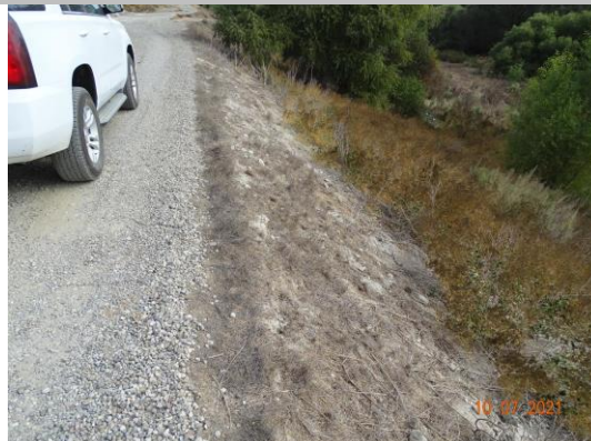
View of vegetation control on the waterside slope. (Fall 2021)