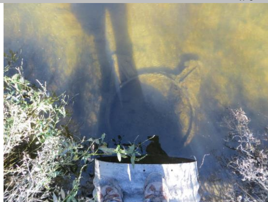
Flapgate has fallen off at WS toe.