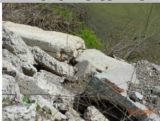
View of rebar and other steel in the concrete rubble along the landside toe. (Spring 2020)