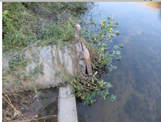
24-inch CMP on concrete headwall with flapgate on WS toe.