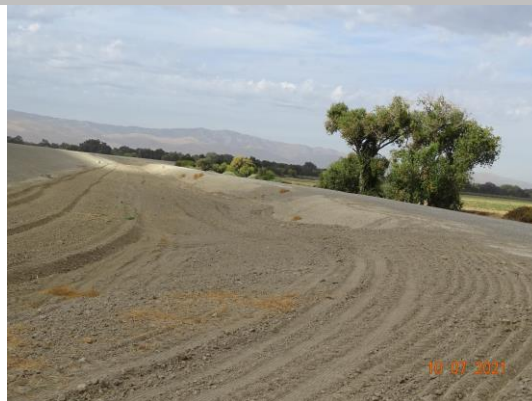
Looking upstream along the landside slope. (Fall 2021)

LS : Land Side N/A : Not Applicable WS : Water Side CR : Crown