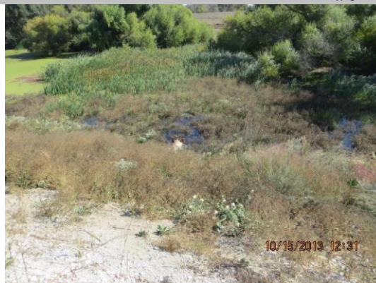
24-inch CMP with flapgate visible on WS toe.