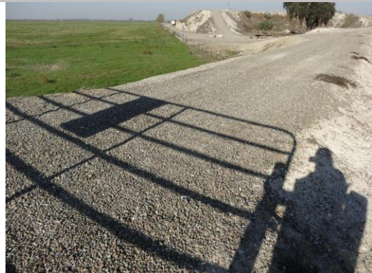
Overview of levee crown at crossing and at a distance there is a shooting range.