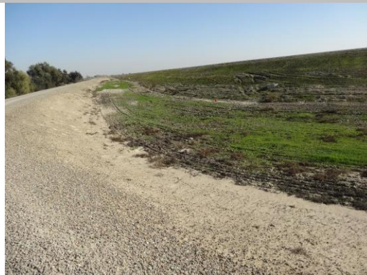
View of LS.