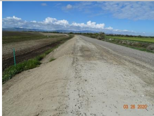
Looking west along the landside shoulder. (Spring 2020)