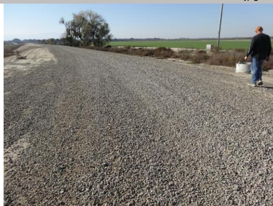
Overview of levee crown at pipe crossing.