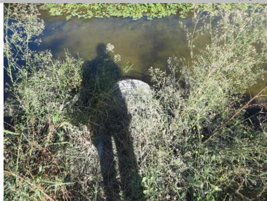
Pipe visible in canal on WS toe.