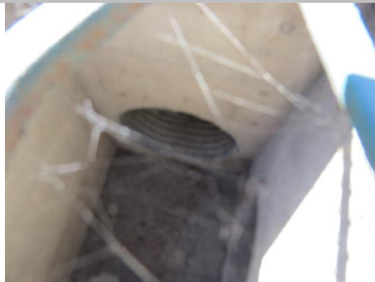
Open CMP pipe through levee at distribution box on LS toe.