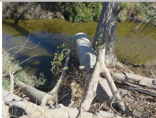
CMP stormdrain at outlet off WS toe.