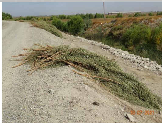
Pruning piles left on the landside slope. (Fall 2021)