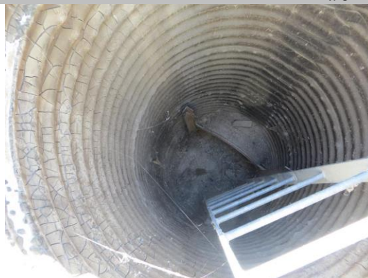
Slide gate missing from open end of pipe at WS slope.