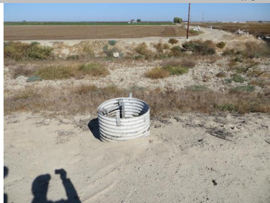
36-inch CMP riser on WS slope.