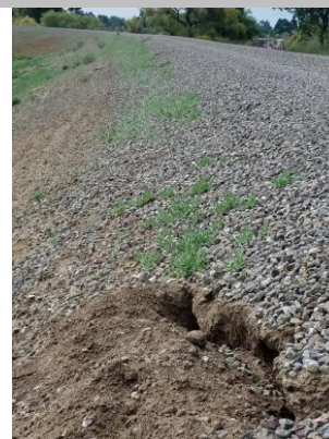
Looking south at rodent activity on landward shoulder and slope.