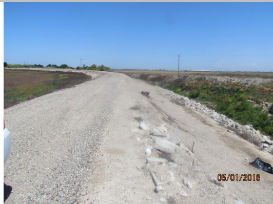
Looking east at repaired site on waterward slope and toe. (Spring 2018)