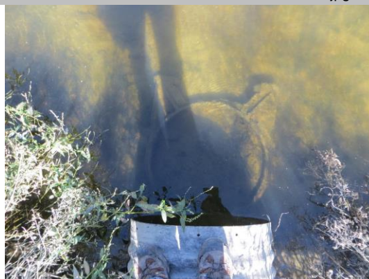
Flapgate has fallen off at WS toe.