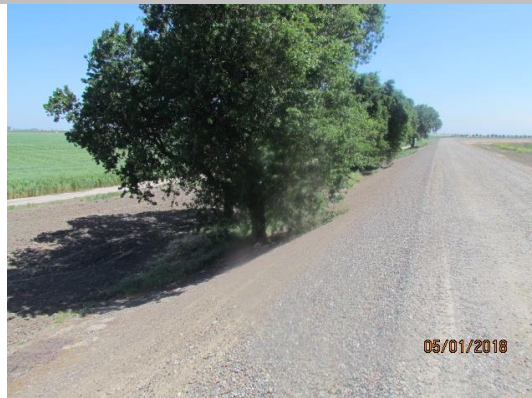
Looking southeast at untrimmed tree at landward toe. (Spring 2018)