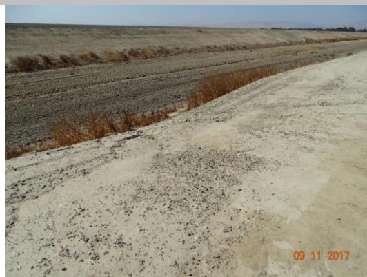
Looking southwest at the dip on the landside shoulder.