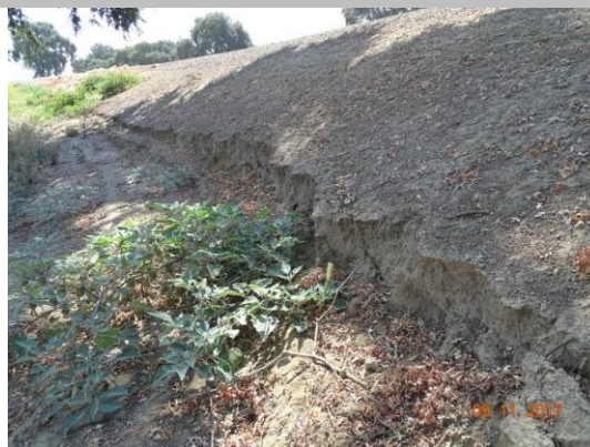
Looking southeast at erosion on the toe of the landside slope.

LS : Land Side N/A : Not Applicable WS : Water Side CR : Crown