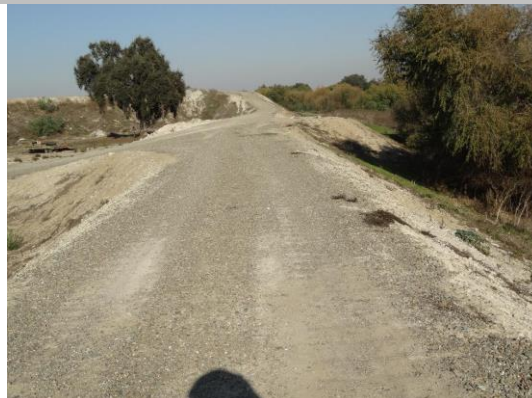
Overview photo of levee crown at crossing.