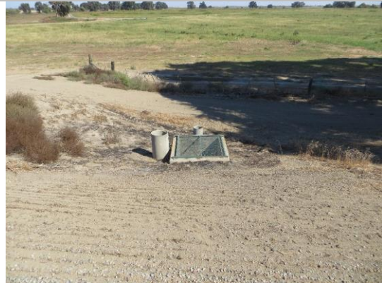
Distribution box on LS toe.