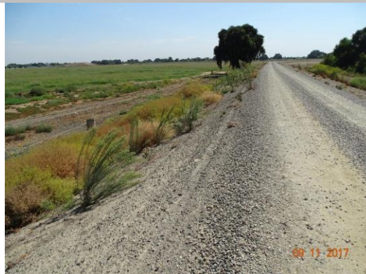
Looking southeast at landside slope.