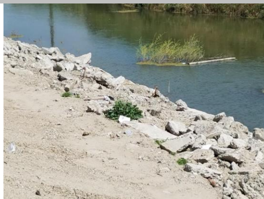
Looking northeast at concrete rubble with rebar at landward toe next to canal.