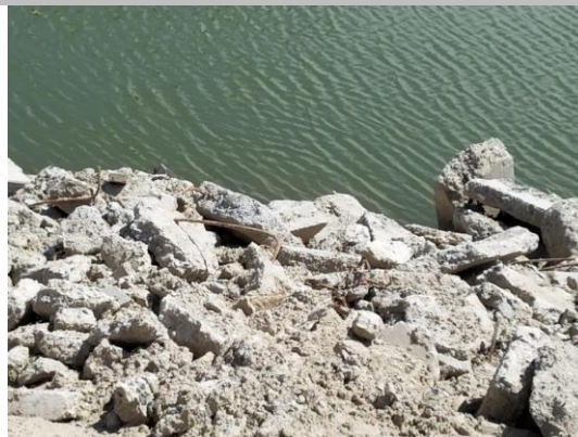
Looking east at concrete rubble with rebar at landward toe next to canal.