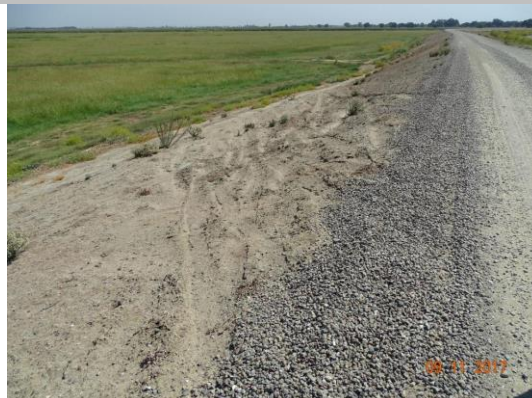
Looking southeast at the landside slope.