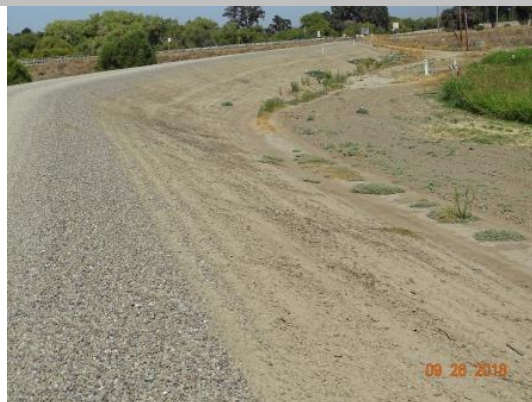
View of landside slope. (2018)