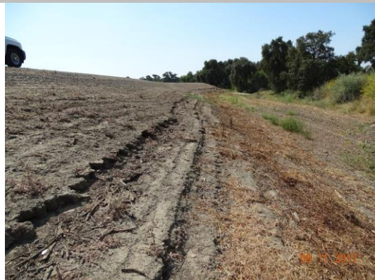
Looking south at erosion on waterside slope.