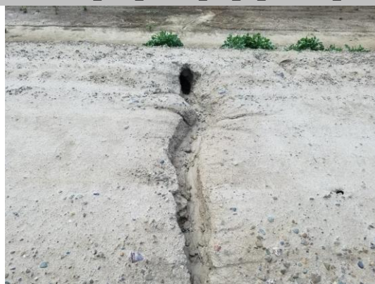
Looking east at rill erosion above rodent hole on landward slope. (Spring 2017)