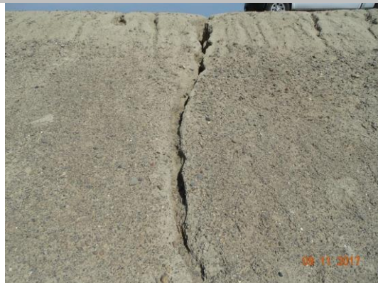
Looking northwest at rill erosion on landside slope.