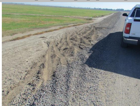
Looking at damage on landside slope.