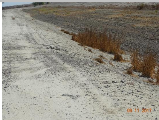
Looking northeast at the dip in the landside shoulder.