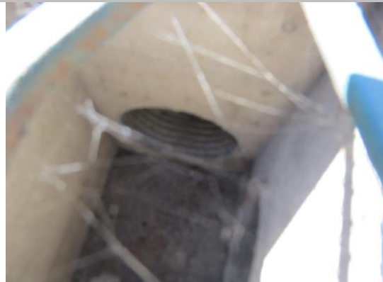
Open CMP pipe through levee at distribution box on LS toe.