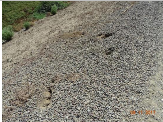
Looking south at landside slope.