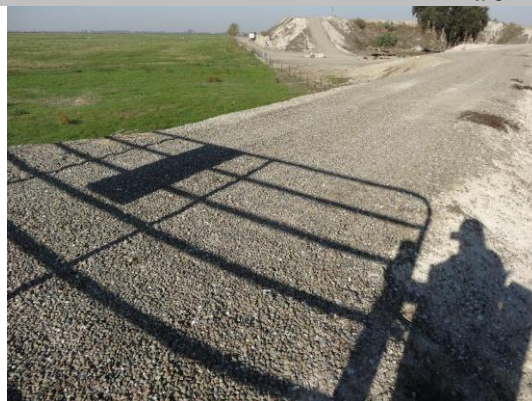
Overview of levee crown at crossing and at a distance there is a shooting range.