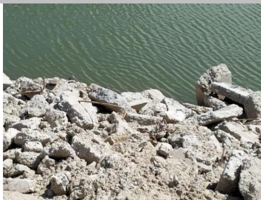
Looking east at concrete rubble with rebar at landward toe next to canal.