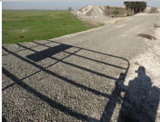
Overview of levee crown at crossing and at a distance there is a shooting range.