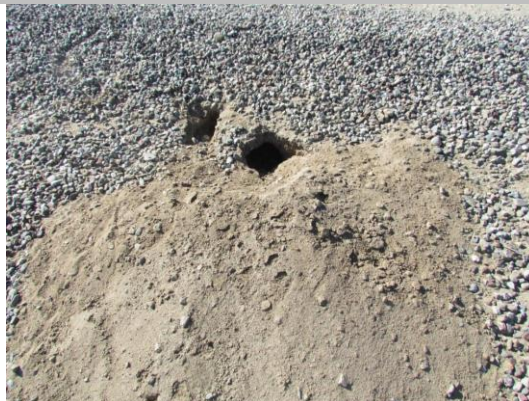
Looking west at close-up view of rodent holes on landward slope.