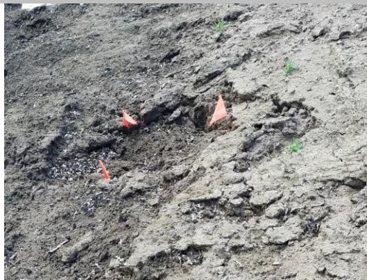
Looking south at possible sinkhole on landward toe.