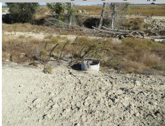
Slide gate in 36-inch CMP riser on WS toe.