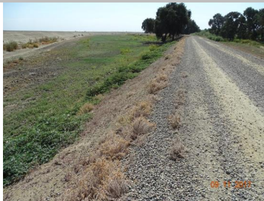
Looking southeast at the landside slope.