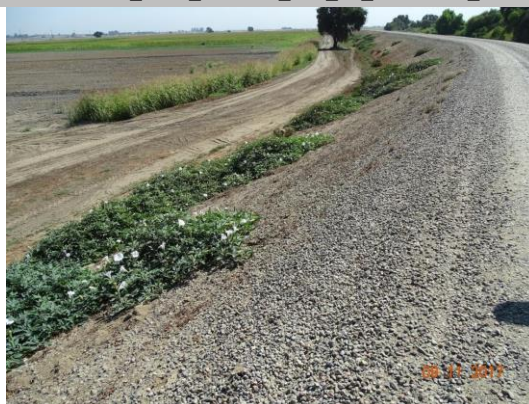
Looking southeast at vegetation on the landside slope.