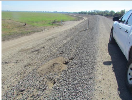
Looking south at several rodent holes on landward slope.