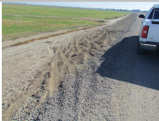
Looking at damage on landside slope.