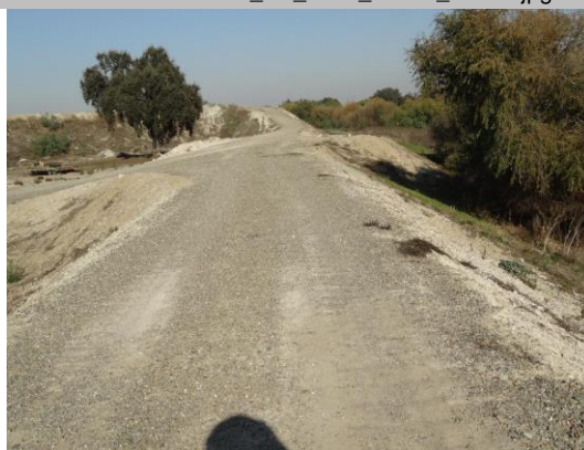
Overview photo of levee crown at crossing.