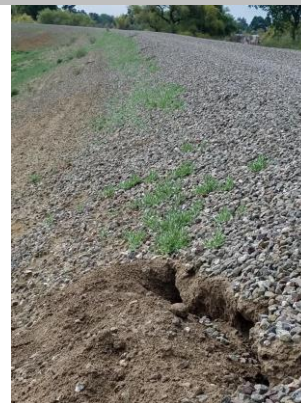
Looking south at rodent activity on landward shoulder and slope.