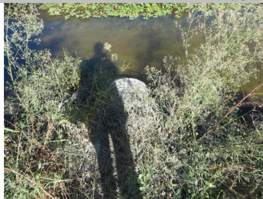
Pipe visible in canal on WS toe.