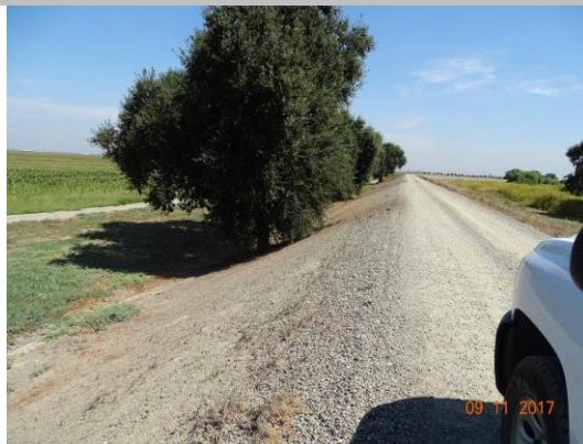
Looking northeast at the landside slope.