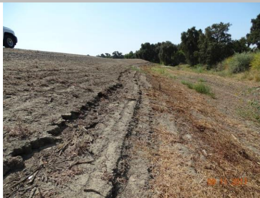
Looking south at erosion on waterside slope.