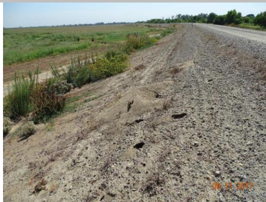
Looking southeast at landside slope.