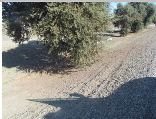
Look northeast at untrimmed tree at landward toe.