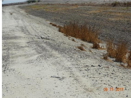
Looking northeast at the dip in the landside shoulder.