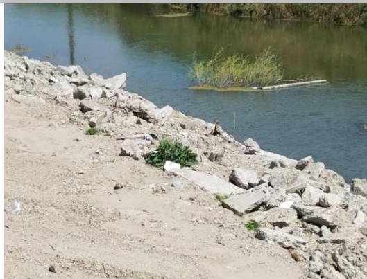
Looking northeast at concrete rubble with rebar at landward toe next to canal.