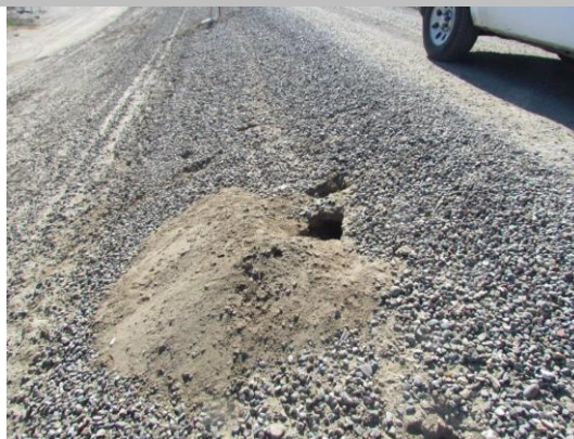
Looking south at close-up view of rodent holes on landward slope.