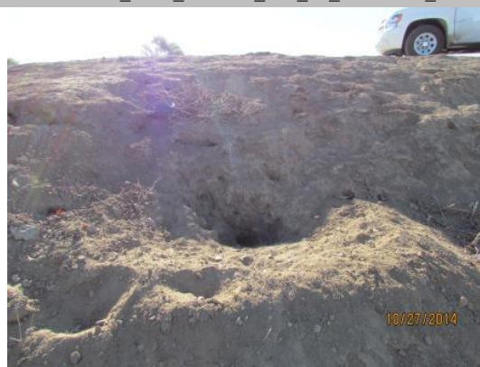
View of the rodent burrow on the landside levee slope.