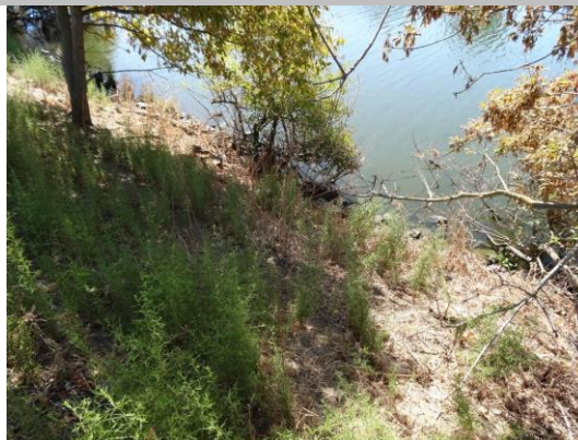
View of the site from levee crest.