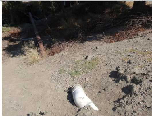
LS view: 6-inch pvc pipe on levee slope. Pipe end open.