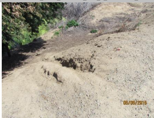
View of the stairs eroding into the landside levee slope.