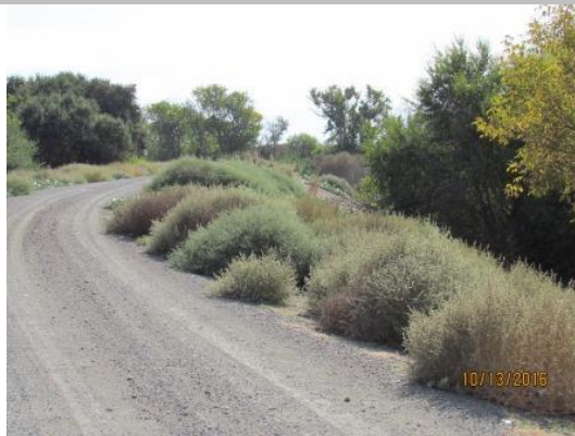
View of the vegetation on the waterside levee slope.