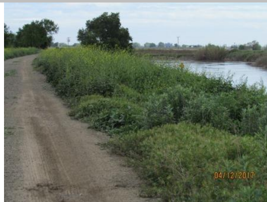
View of the tall vegetation on the levee slope.