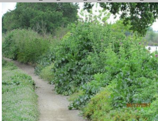
View of the tall vegetation on the levee slope.