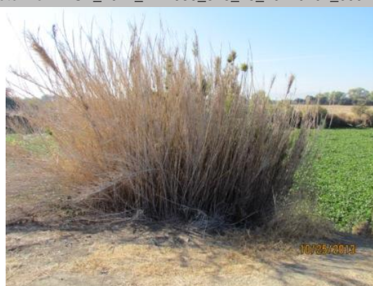
View of the Arrundo on the waterside slope obstructing visibility. LMA is actively trying to remove the wild growth.