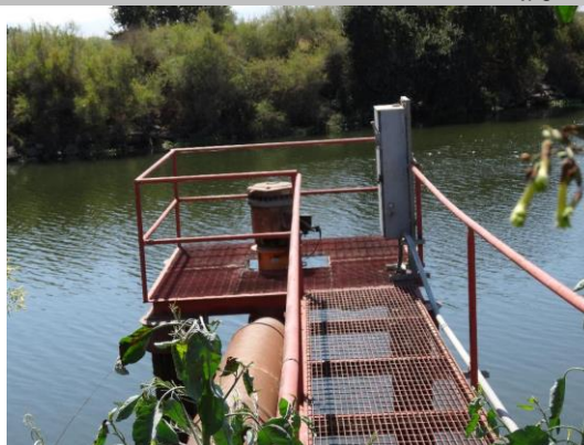
WS view: steel walkway, electric control box, and pump on steel piling structure in the channel.