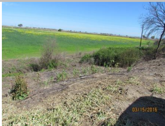
Arundo was trimmed back from the road and needs to be maintained so that it does not obstruct visibility and access to the landside toe.