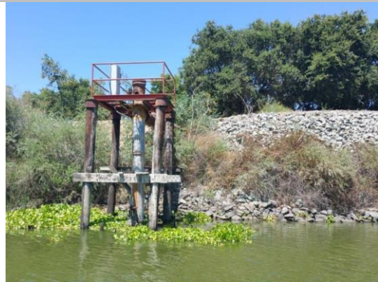
Front view of the site. Note the irrigation pipe on the site.