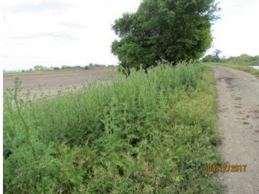
View of the tall vegetation on the levee slope.