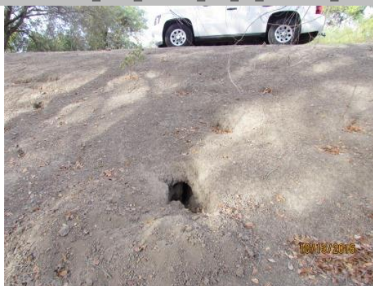
View of the rodent burrow in the landside levee slope.