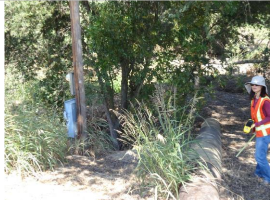
LS view: overview of exposed steel pipe (right) on levee slope and service pole (left).