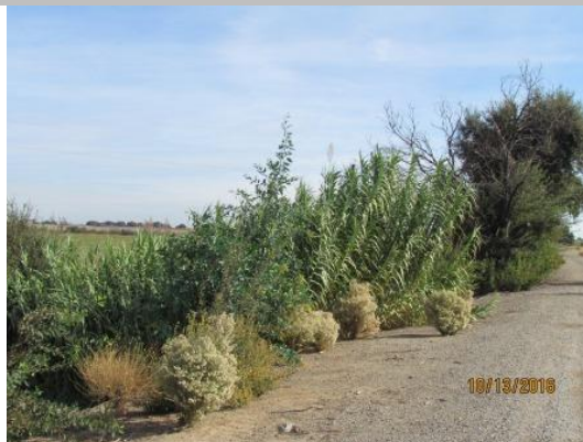
View of the arundo back on the landside levee slope. Fall 2016