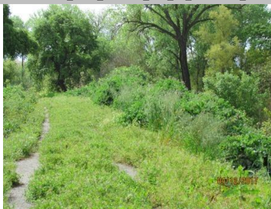
View of the tall vegetation on the levee slope.