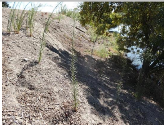
View of the erosion from levee slope.