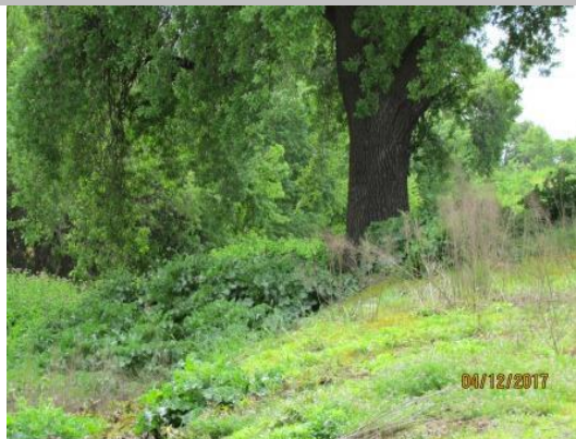
View of the tall vegetation on the levee slope.