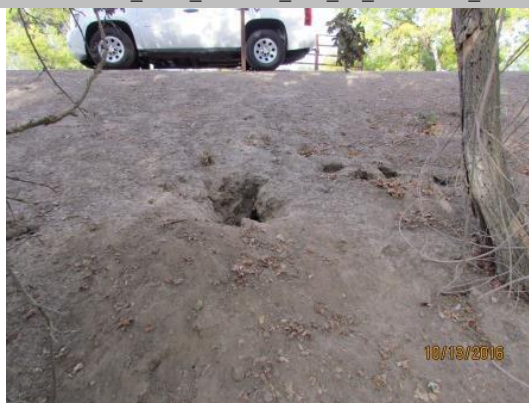
View of the rodent burrow in the landside levee slope.