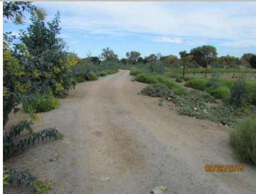
View of the levee crown depression looking downstream.