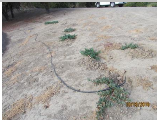
View of the ice plant and irrigation line on the landside levee slope, looking upstream.