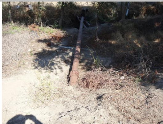
LS view: exposed steel pipe on levee slope.