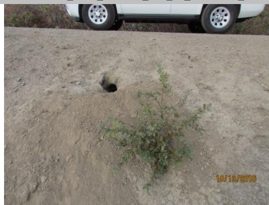
View of the rodent burrow in the landside levee slope.