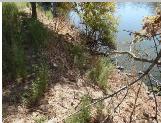
Close view of the erosion. Note the vegetation at the site.