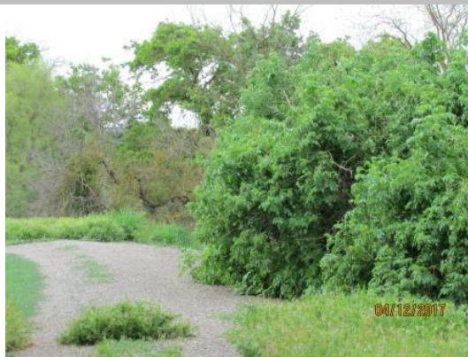
View of the overgrown shrub on the levee slope.