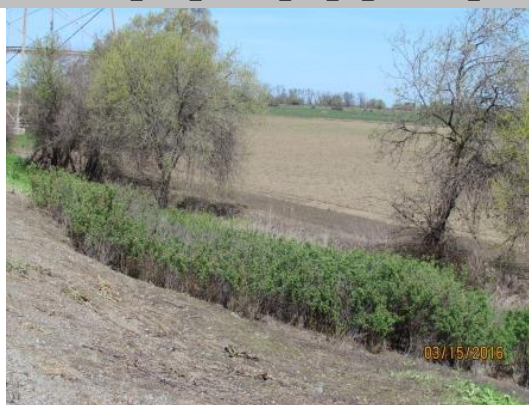
View of the vegetation on the landside levee slope.