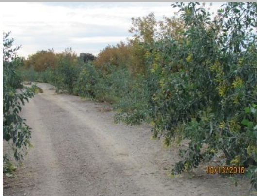
View of the vegetation on the levee slopes.