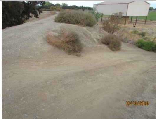
View of the ramp on the landside levee slope.