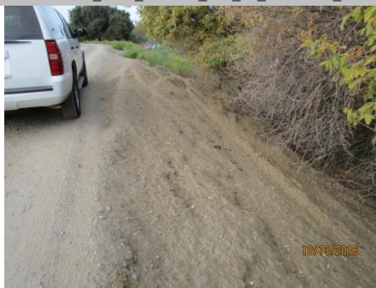
View of the animal paths on the waterside levee slope.