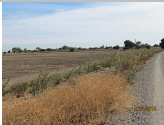
View of the vegetation on the landside levee slope.