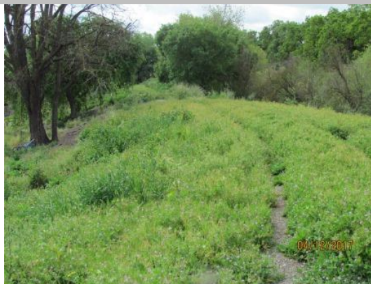
View of the vegetation on the levee crown.