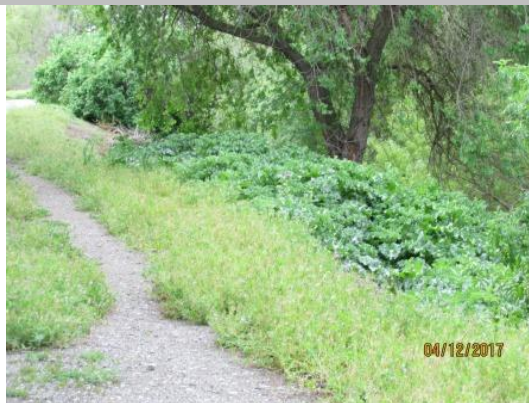
View of the tall vegetation on the levee slope.

* Location LS : Land Side N/A : Not Applicable WS : Water Side CR : Crown