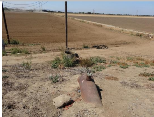
LS view: exposed pipe with siphon breaker on levee slope. Concrete standpipe on levee toe.