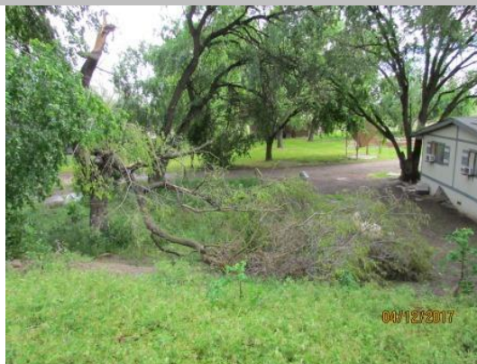
View of the down tree limb on the levee slope.