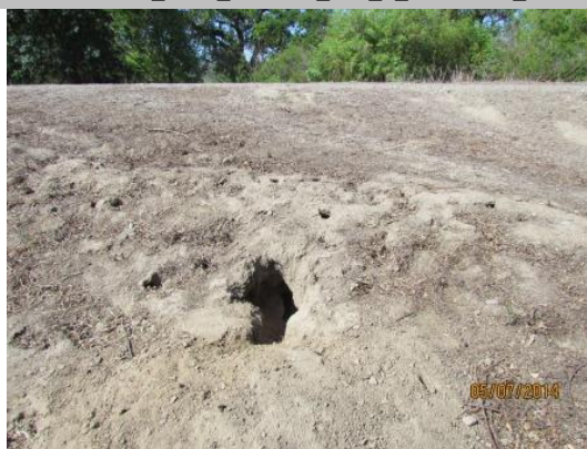
View of the large rodent hole on the landside levee slope.