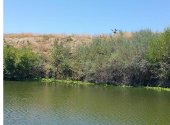
Front view of the site. Note the very dense white willow thickets on site.