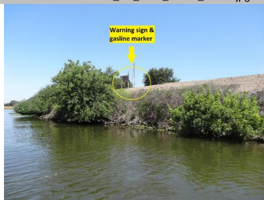
Gasline marker (for crossing with DS ID 25121) appr. 100 ft west of crossing.