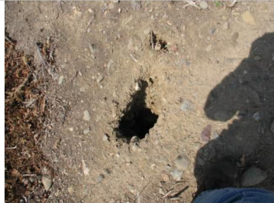
11/10/2011 Deep burrow on waterside.