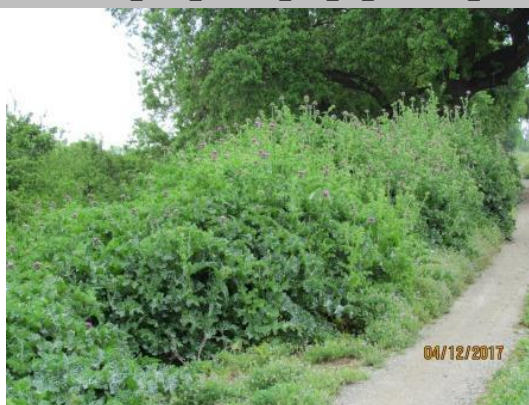
View of the tall vegetation on the levee slope.