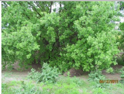
View of the overgrown tree on the levee slope.