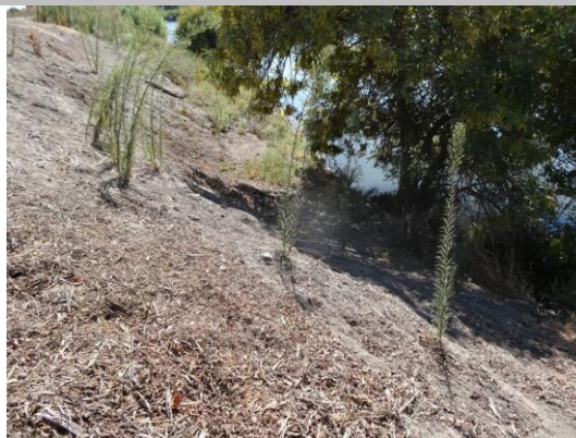
Close view of the erosion.