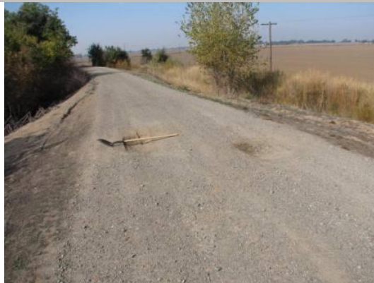
11/10/2011 Depressions in crown.