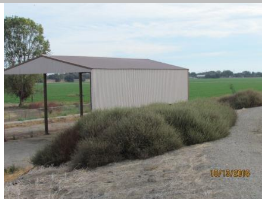
View of the vegetation on the landside levee slope.