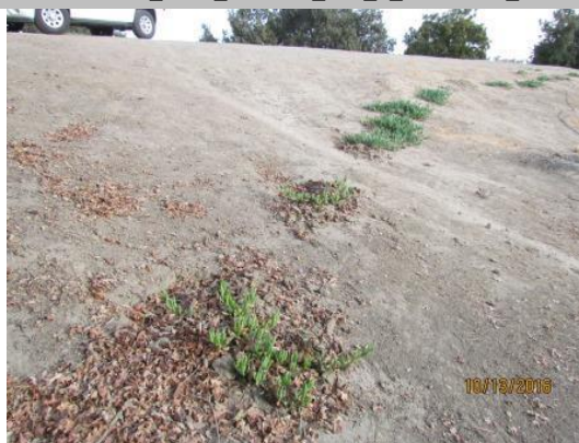
View of the ice plant landscaping on the landside levee slope, looking downstream.