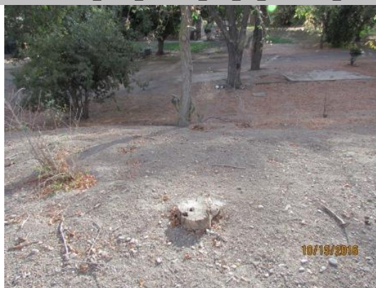
View of the tree stump from the levee crown.