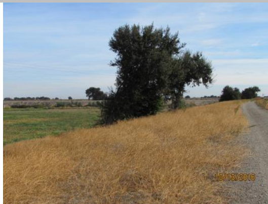
View of the vegetation on the landside levee slope.

LS : Land Side N/A : Not Applicable WS : Water Side CR : Crown