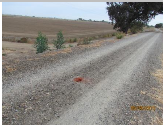
View of the rodent hole on the levee crown.