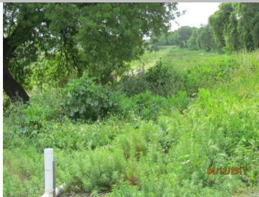
View of the tall vegetation on the levee slope.