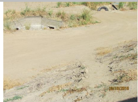
View of the footpath on the landside levee slope.