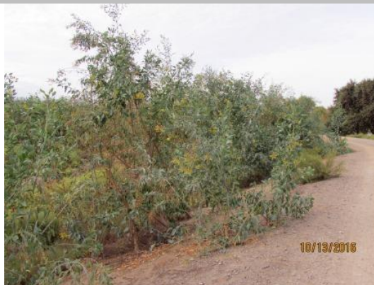
Another view of the thick vegetation on the landside levee slope.