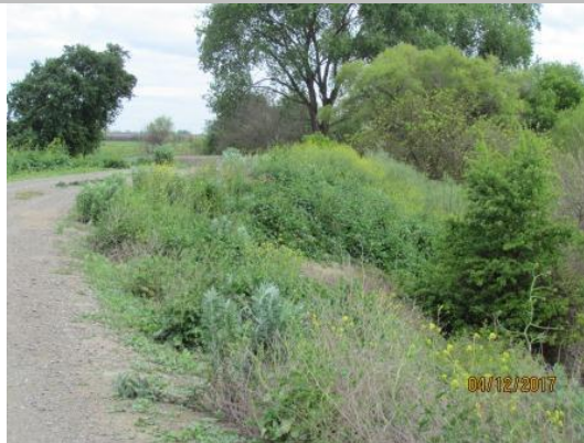
View of the tall vegetation on the levee slope.