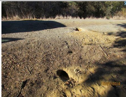
View of several rodent burrows on landside levee hinge and crown.