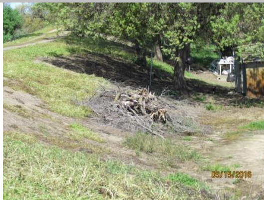
View of the prunings on the landside levee slope.