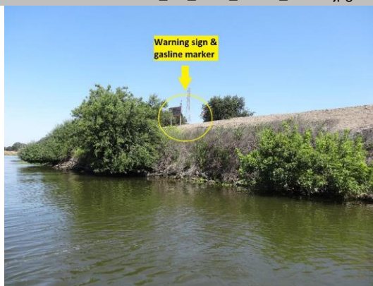
Gasline marker (for crossing with DS ID 25121) appr. 100 ft west of crossing.