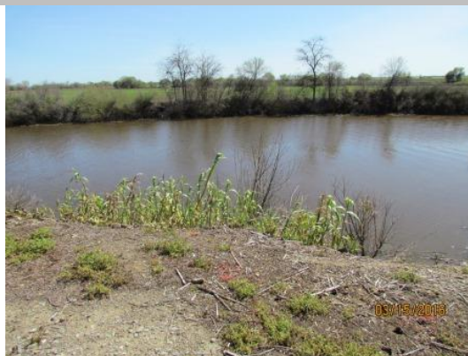
Arundo was trimmed back and needs to be maintained to allow visibility and access.