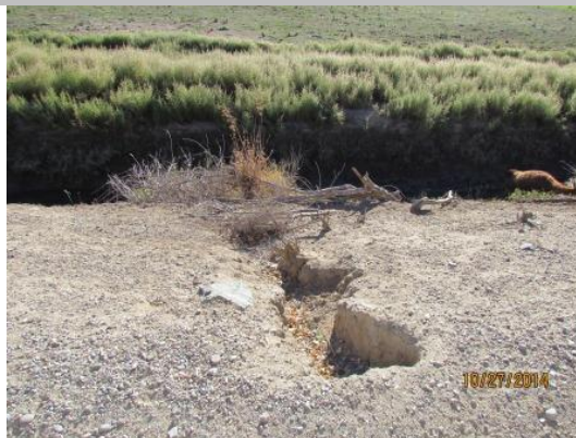
View of the scour from surface runoff on the landside levee slope.