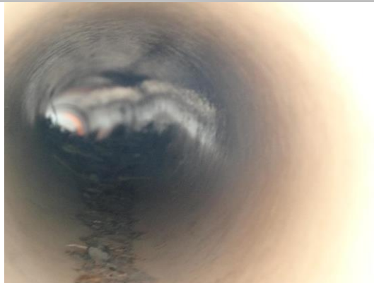
WS view: inside view of pvc pipe. Sediments found inside the pipe.