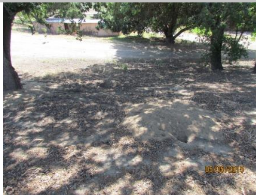
View of the multiple rodent burrows on the landside levee slope.