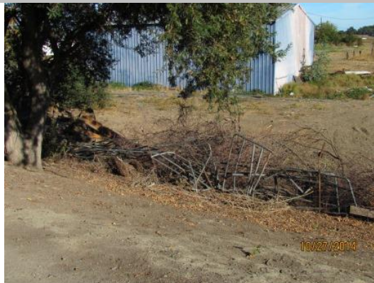
View of the tree branches on the landside levee toe obstructing access.