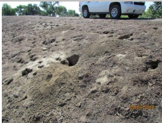
View of the rodent holes on the landside levee slope.