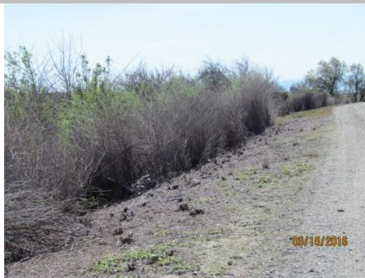
View of tall willows on waterside slope.