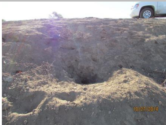
View of the rodent burrow on the landside levee slope.