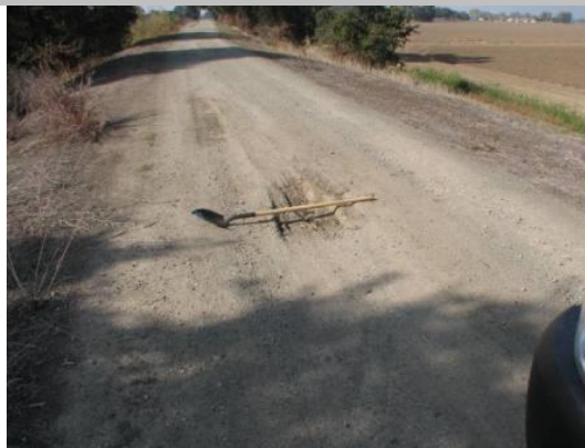
11/10/2011 Roadway depression.