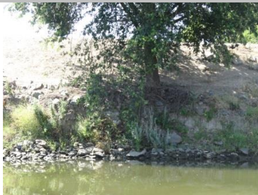
Front view of the erosion site. Note the large tree above the erosion.