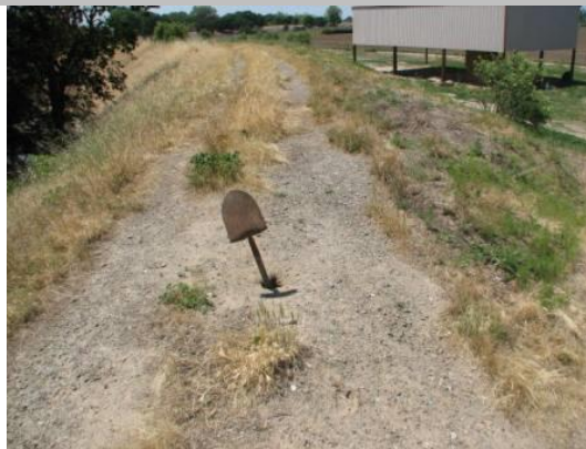
05/24/2011 Deep vertical burrow in levee crown.