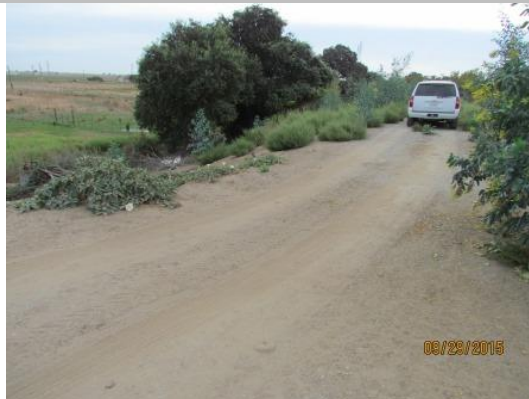
View of the levee crown depression looking upstream.