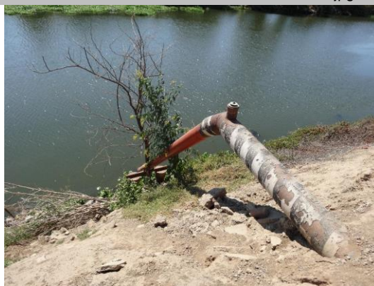
WS view: most of the waterside pipe exposed on levee slope.