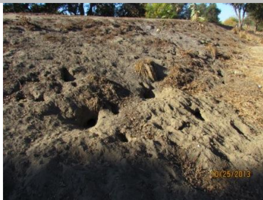
Another view of the multiple rodent burrows on the landside levee slope.