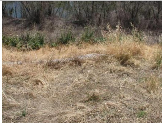
05/24/2011 Old CMP left on waterside levee slope, needs to be removed.