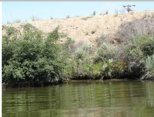
Front view of the site. The scarp is visible on the slope.