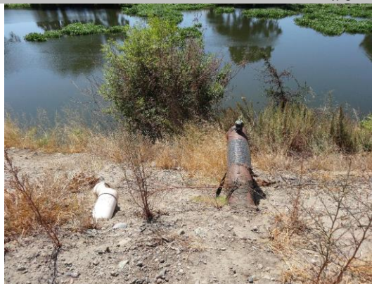
WS view: exposed steel pipe on levee slope. A pvc pipe on left.