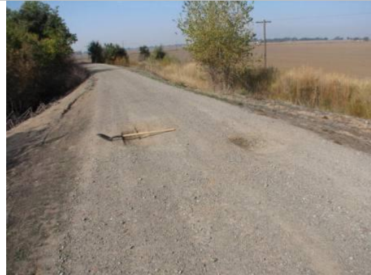
11/10/2011 Depressions in crown.