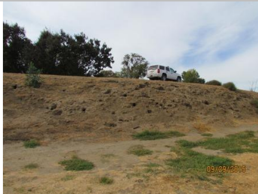
View of the multiple rodent holes on the landside levee slope.