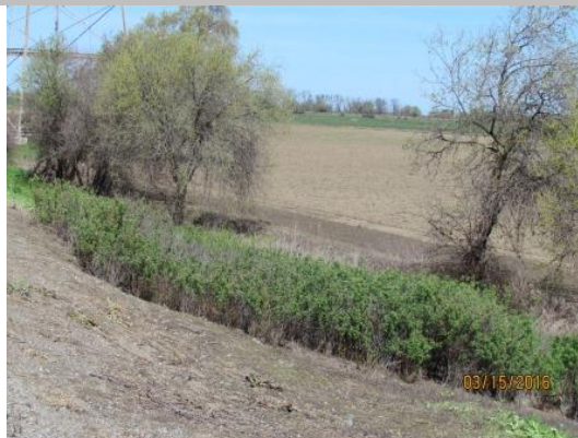
View of the vegetation on the landside levee slope.