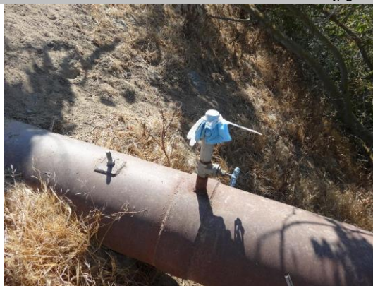
WS view: air relief valve on pipe. Pipe exposed in levee slope.