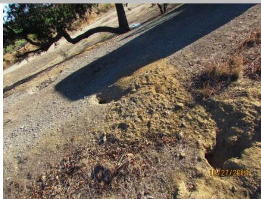
View of several large rodent holes on the levee crown.