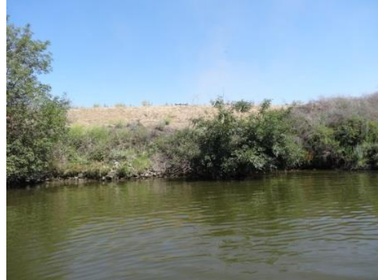
Front view of the site.