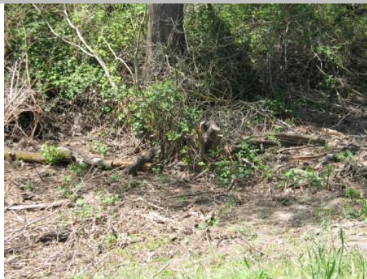
Tree stump &gt;2" left after vegetation and tree removal.