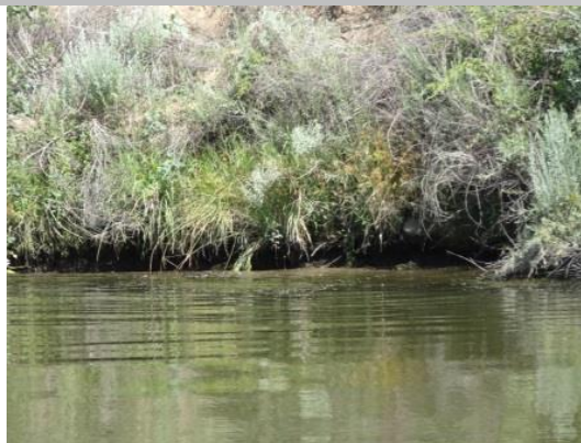
Front view of the site. Note the erosion is invisible because of the dense vegetation.