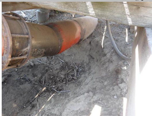
WS view: soil erosion under pump platform. Needs mitigation measures to stop erosion.