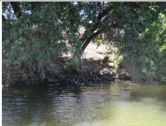
View of the site from the survey boat.