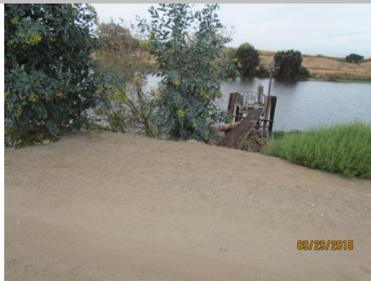
View of the levee crown depression looking to the waterside.