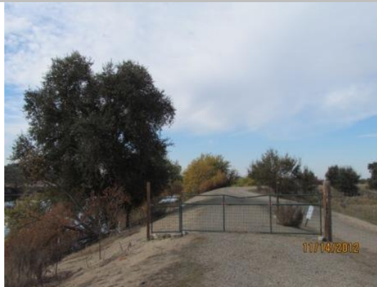
View of gate across levee crown.