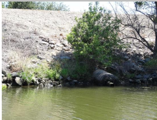
View up WS slope from water. Pipe does not cross channel.