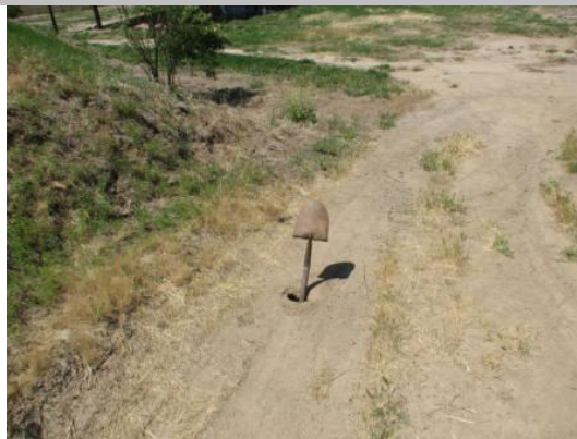
05/24/2011 Deep vertical burrow in ramp on land side of levee.