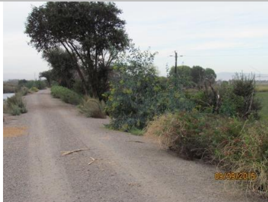
Thick brush and wild rose completely block access and visibility of landside slope and toe.