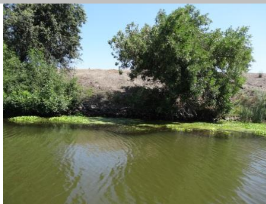
View of the erosion from the survey boat.