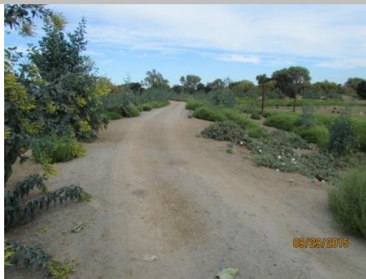
View of the levee crown depression looking downstream.