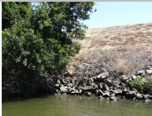
View of the site from the survey boat.