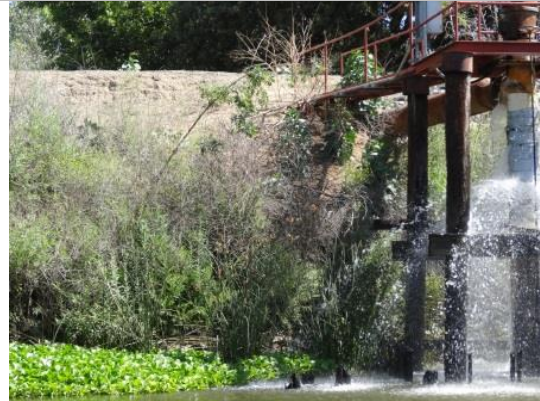
Close view of the site.