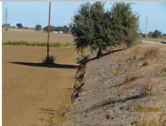
View of the vertical cut along the landside levee toe.