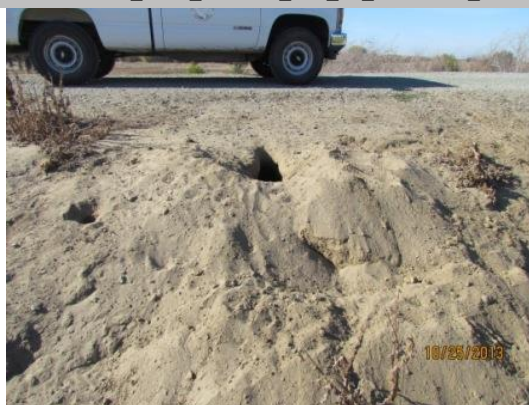
View of the rodent burrow on the landside levee slope.