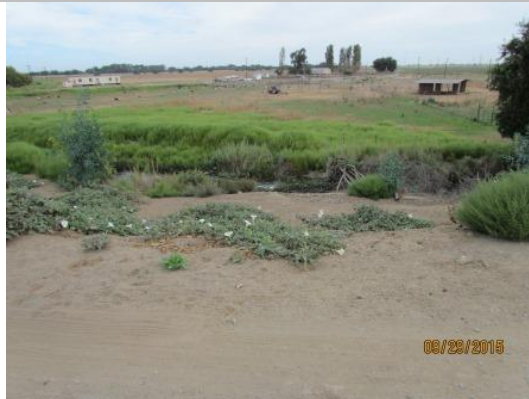
View of the levee crown depression looking to the landside.