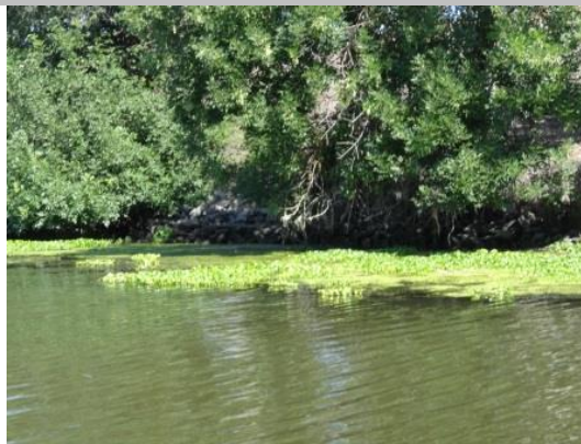
Close view of the site. Note the tree and the vegetation.