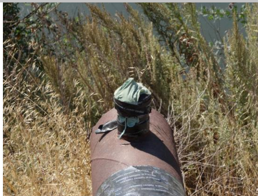
WS view: exposed steel pipe with siphon breaker. Looks siphon breaker needs repair.