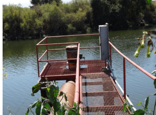
WS view: steel walkway, electric control box, and pump on steel piling structure in the channel.