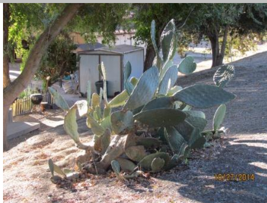
View of the cactus on the landside levee shoulder.