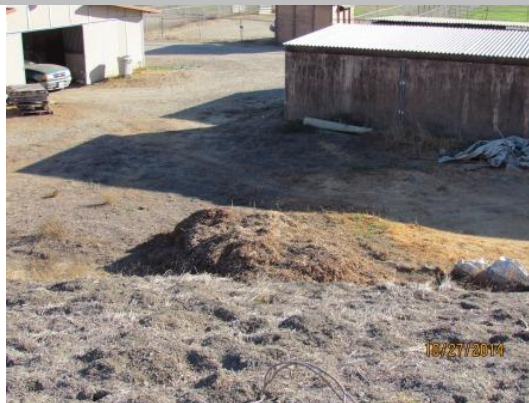
View of the animal feed stockpiled at the landside levee toe.