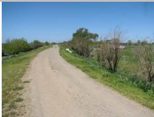
Brush on landside slope limits access.