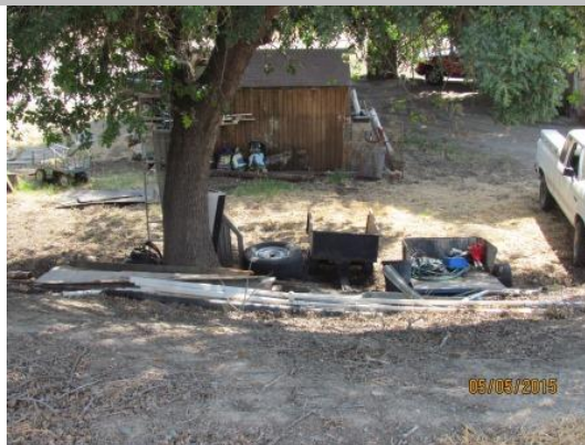
View of the materials stored at the landside levee toe.