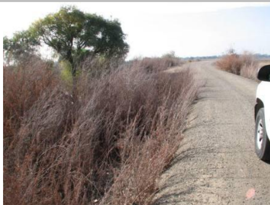
11/10/2011 Vegetation needs to be cleared on the upper 20' of the waterside slope.