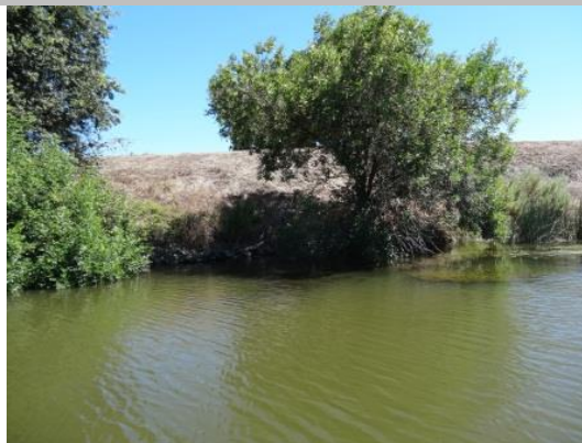
Close view of the site. Note the tree and the vegetation.