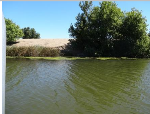
View of the site from the survey boat.