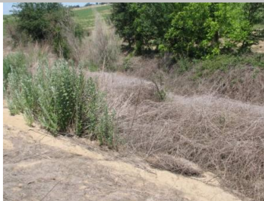
05/24/2011 Dead brush is too thick to allow access and visibility of landside slope and toe.