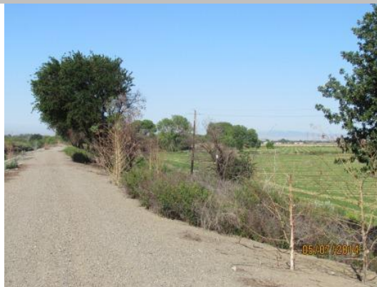
Thick brush and wild rose completely block access and visibility of landside slope and toe.