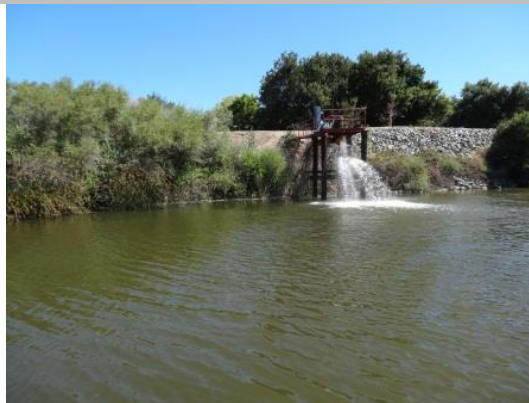
Front view of the site.