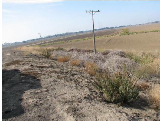
11/10/2011 Vegetation obstructs visibility of slope and toe.