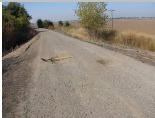
11/10/2011 Depressions in crown.