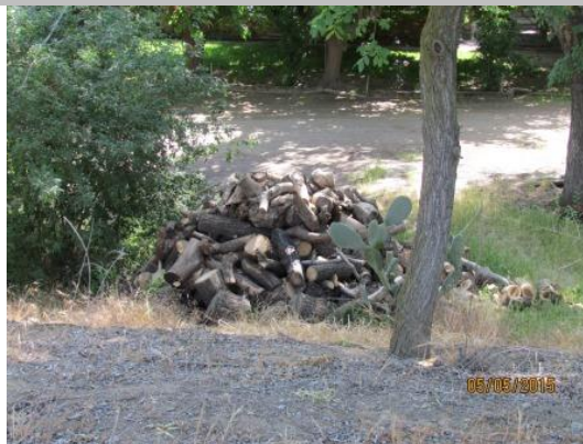
View of the firewood piled at the landside levee toe.