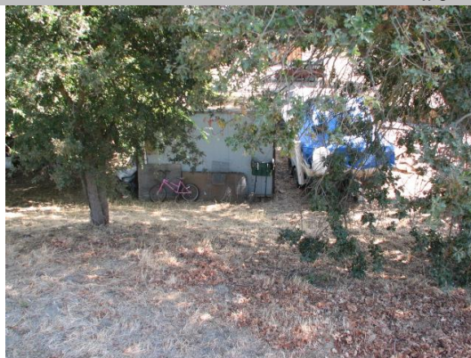
Fall 2009 photo: Buildings and patio decks are built within 10-ft of the levee slope.