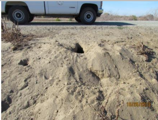
View of the rodent burrow on the landside levee slope.