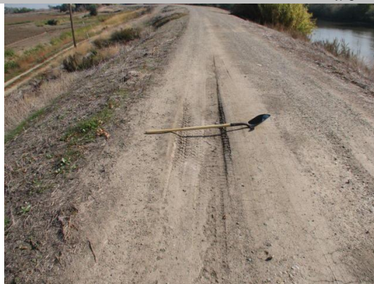
11/10/2011 Depression in roadway.

LS : Land Side WS : Water Side CR : Crown