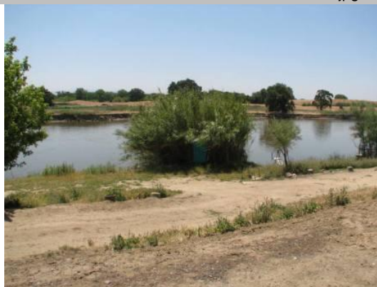
05/24/2011 Portable toilet is in the shadows in the center of the photo at the water's edge.