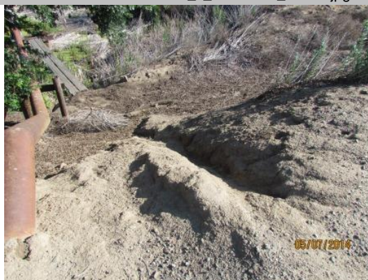
View of the stairs eroding into the landside levee slope.

LS : Land Side WS : Water Side CR : Crown