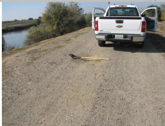
11/10/2011 Depression in crown needs to be filled.

LS : Land Side WS : Water Side CR : Crown