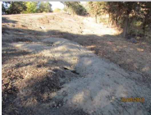
View of the multiple rodent burrows on the landside levee slope.

LS : Land Side WS : Water Side CR : Crown