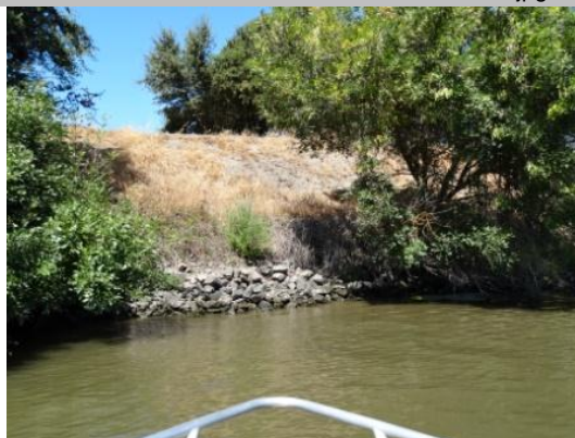
Close view of the site. Note the tree and the vegetation.