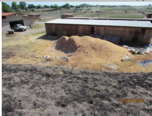
View of the animal feed stockpiled at the landside levee toe.

LS : Land Side WS : Water Side CR : Crown