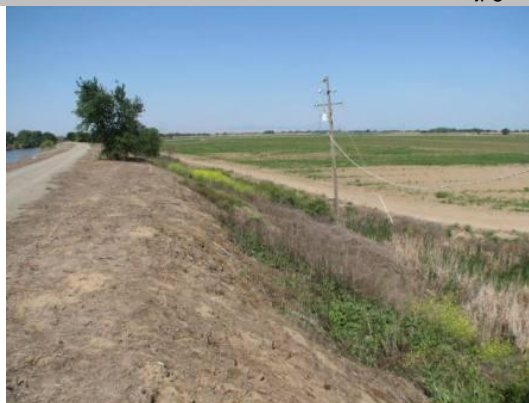
05/24/2011 Ditch flows parallel with the utility line shown in the photo.