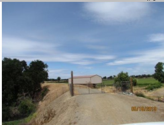
View of the fence gate across levee crown.