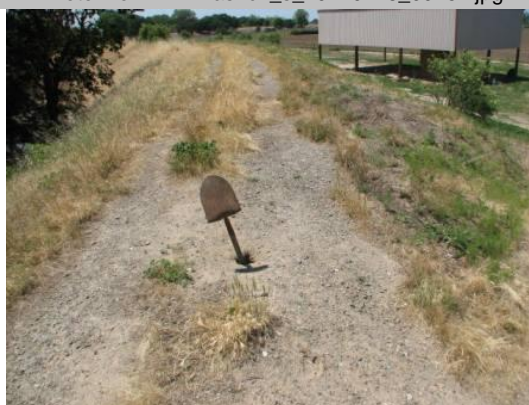
05/24/2011 Deep vertical burrow in levee crown.