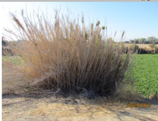
View of the Arundo on the waterside slope obstructing visibility. LMA is actively trying to remove the wild growth.