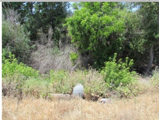
View of water tanks disposed on waterside slope.