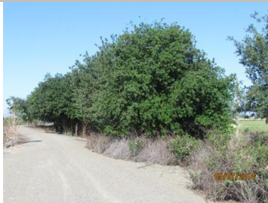
Trees on levee slope obstruct access and visibility.