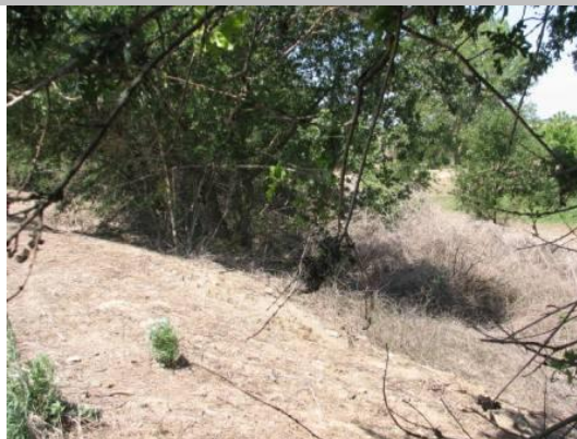
05/24/2011 Photo shows thick dead vegetation and continuation of trees in area that are preventing access and visibility of landside slope and toe.

* Location LS : Land Side WS : Water Side CR : Crown