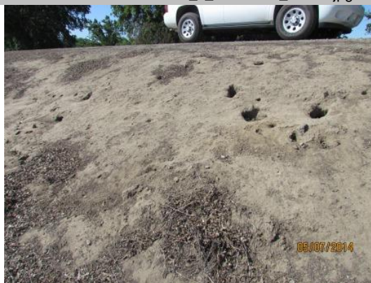
View of the multiple rodent burrows on the landside levee hinge and slope.