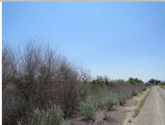
View of tall weeds and brush obstructing visibility on waterside slope. 05/24/2012

* Location LS : Land Side WS : Water Side CR : Crown