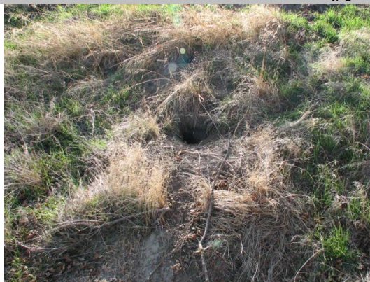
11/10/2011 Active rodent burrow on landside slope.