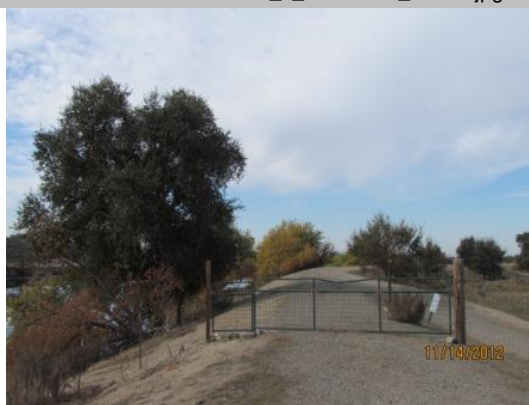
View of gate across levee crown.

* Location LS : Land Side WS : Water Side CR : Crown