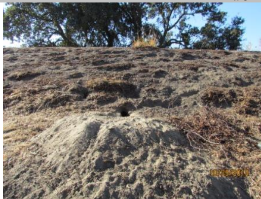
View of the rodent burrow on the landside levee slope.