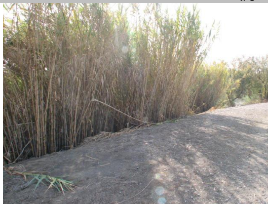
11/10/2011 Arundo on upper 20' of waterside slope.

Photo 1 of 1 : mkhashch_s_20140428_00726.jpg