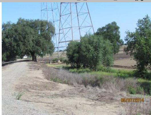
View of the vegetation on the landside levee slope.

* Location LS : Land Side WS : Water Side CR : Crown