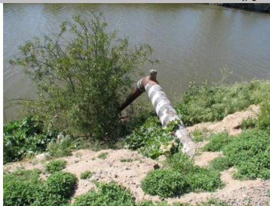
Drainage discharge into Old River.

* Location LS : Land Side WS : Water Side CR : Crown