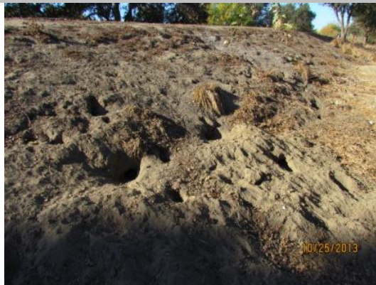
Another view of the multiple rodent burrows on the landside levee slope.