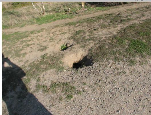
11/10/2011 Two large burrows on crown, need to be filled.