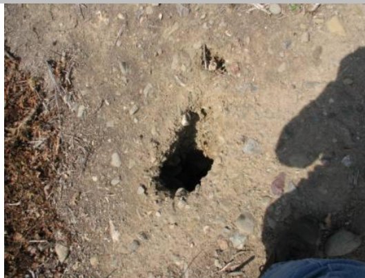
11/10/2011 Deep burrow on waterside.

* Location LS : Land Side WS : Water Side CR : Crown