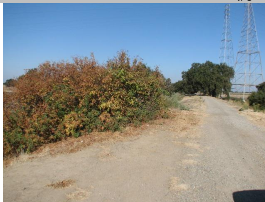
Fall 2009 photo of unacceptable vegetation on levee slope.