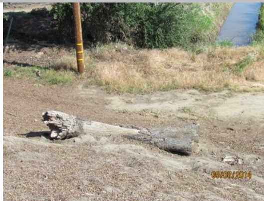
Decaying tree at the landside levee toe is obstructing visibility and access.

* Location LS : Land Side WS : Water Side CR : Crown