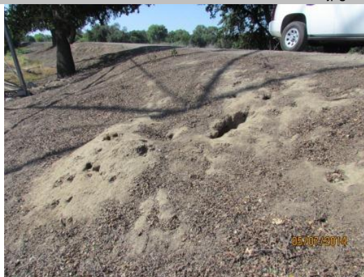
View of the rodent burrow on the landside levee slope.