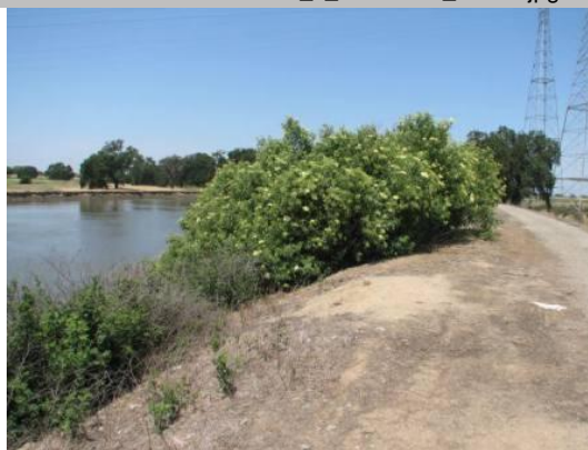
05/24/2011 Updated photo of issue noted in Fall 2010 inspection.