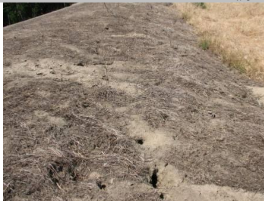
05/24/2011 Active burrows, ground squirrel sighted in area.

* Location LS : Land Side WS : Water Side CR : Crown