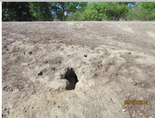
View of the large rodent hole on the landside levee slope.