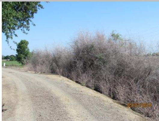
Extremely thick dead brush prevents access and visibility.

* Location LS : Land Side WS : Water Side CR : Crown