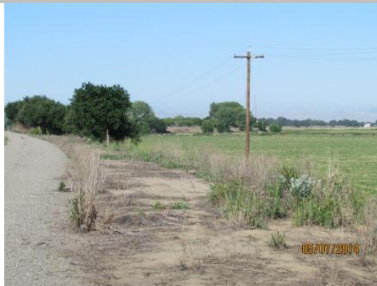
View of the tall vegetation obstructing visibility of the landside levee slope.