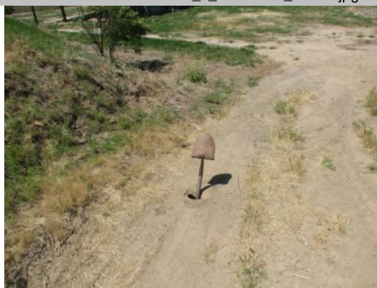
05/24/2011 Deep vertical burrow in ramp on land side of levee.

* Location LS : Land Side WS : Water Side CR : Crown