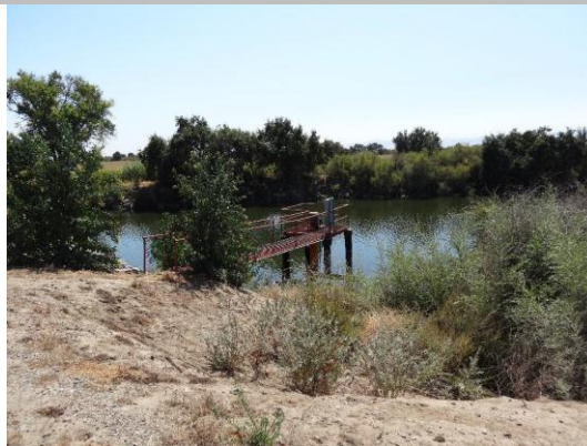
WS view: walkway to pump platform and pump on steel piling structure in the channel.

* Location LS : Land Side WS : Water Side CR : Crown