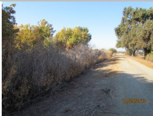
Thick vegetation on upper 20' of waterside slope obstructing visibility and access.

Photo 1 of 1 : mkhashch_s_20140428_00727.jpg