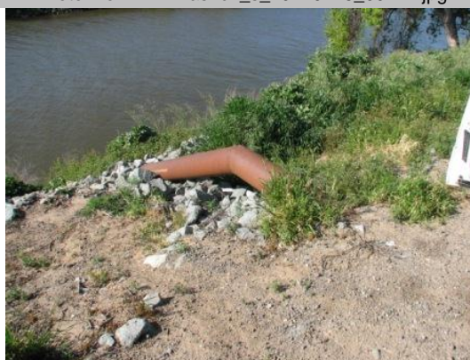
Waterside of drainage discharge to Old River.