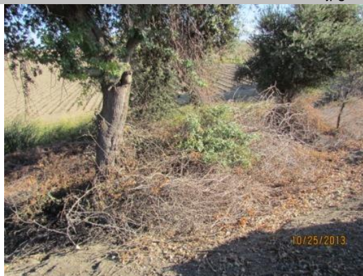
View of the tree branches obstructing landside levee slope.