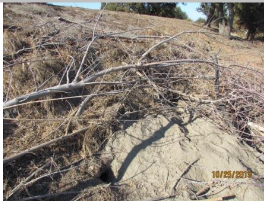
View of the rodent burrow on the landside levee toe.