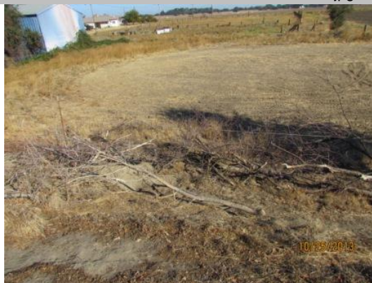
View of the tree branches on the landside levee toe obstructing access.