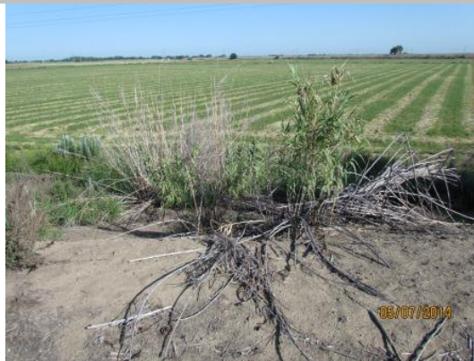
The LMA is actively trying to remove the vegetation on the landside levee slope and toe.

* Location LS : Land Side WS : Water Side CR : Crown