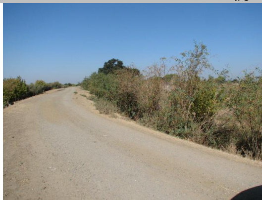
Fall 2009 photo: Brush on landside toe limits visibility and accessibility.

LS : Land Side WS : Water Side CR : Crown