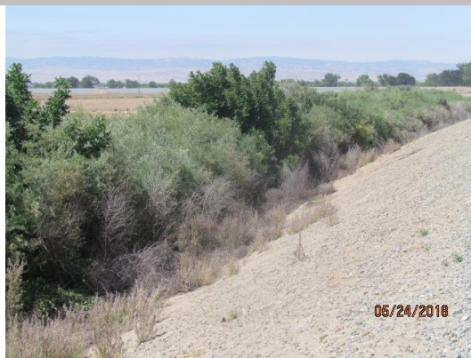
Looking west at dense veg. at landward toe. (Spring 2018)