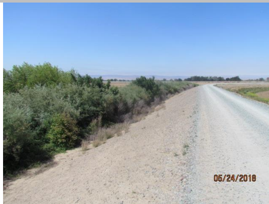
Looking west at dense veg at landward toe. (Spring 2018)