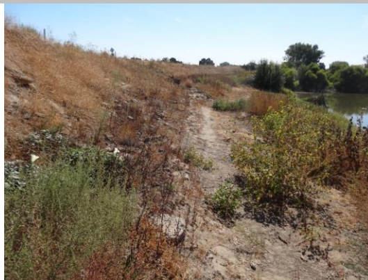
Upstream view of the erosion site.