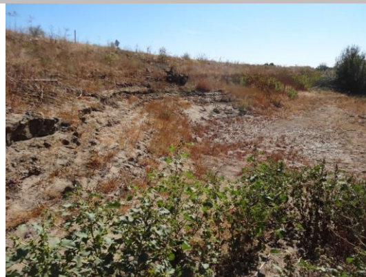
Looking upstream at the site.