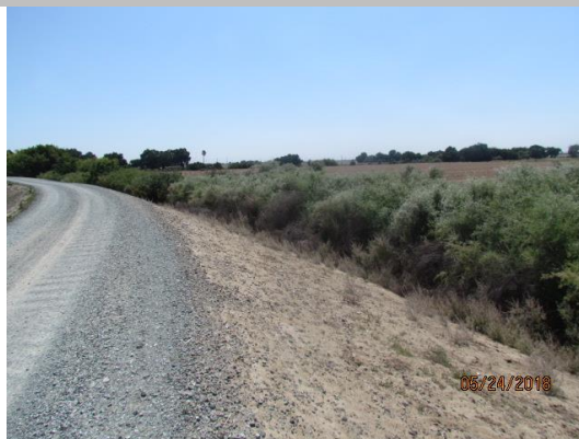
Looking northeast at dense veg at landward toe. (Spring 2018)