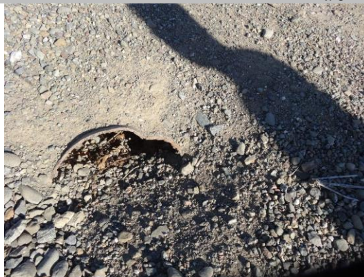
WS view: blocked siphon breaker in steel pipe riser on levee slope.