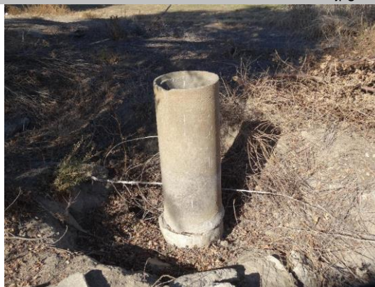
WS view: concrete standpipe on levee toe.