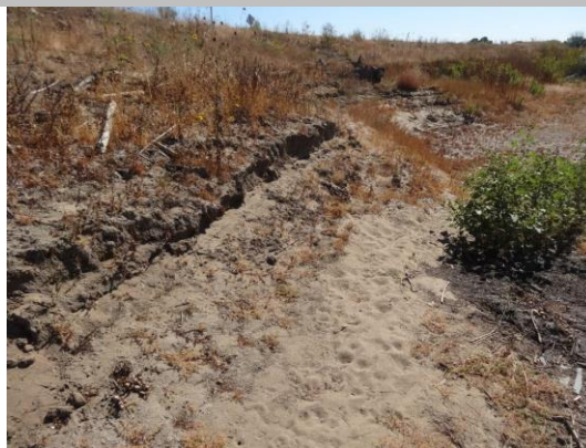
Close view of the site.