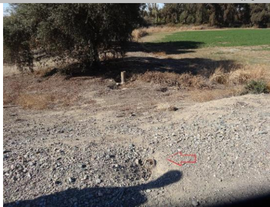
WS view: concrete standpipe (top) and steel pipe riser (bottom marked) on levee slope.