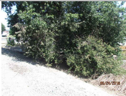
Looking downstream at untrimmed tree on landward toe. (Spring 2018)