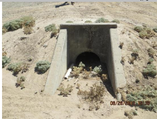
Concrete headwall on LS toe.