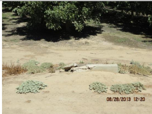
Concrete headwall on LS toe.