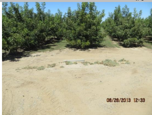
Concrete headwall on LS toe.