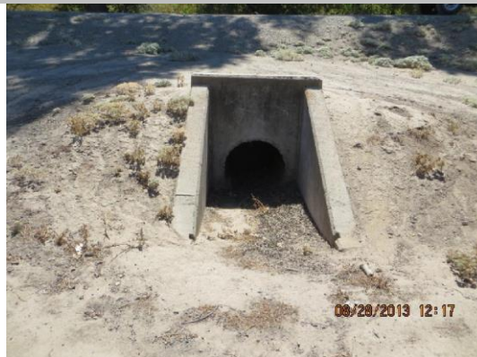
Concrete headwall on LS toe.