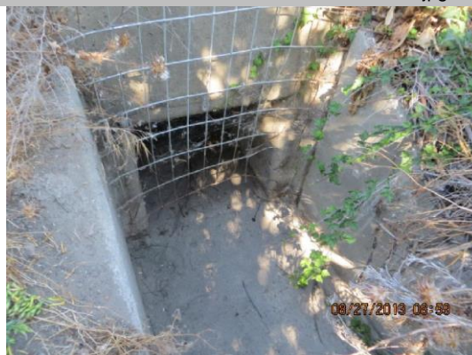
Concrete headwall at inlet on LS toe.