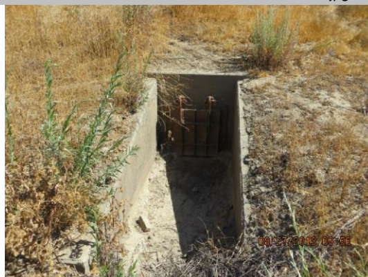
Flap gate on WS toe.