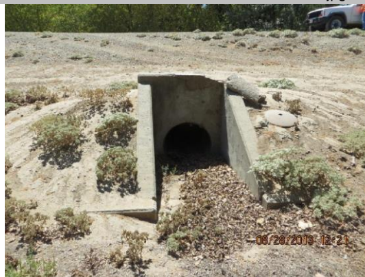
Concrete headwall on LS toe.