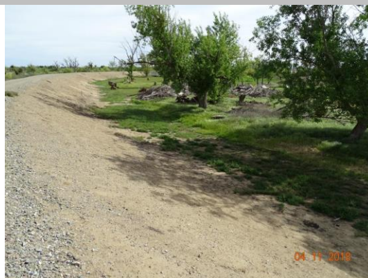
View of former landside rodent area and slash pile in distance. Rodent control program has largely mitigated the problem, but should continue. Fall 2017