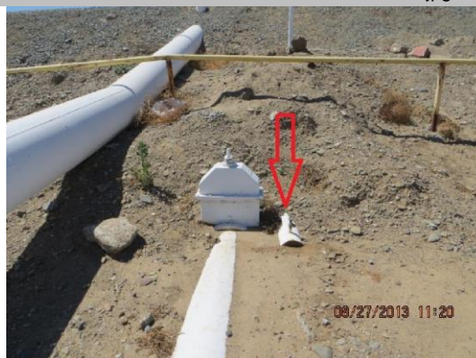
Pipe with welded steel plate over LS end at LS toe.