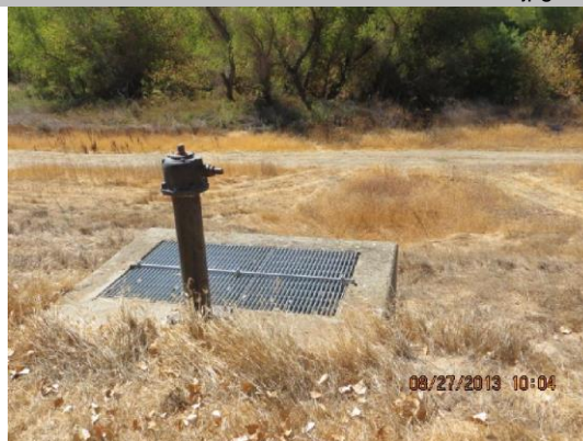
Slide gate in Concrete riser on WS shoulder.