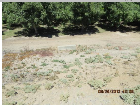
Headwall on LS toe.