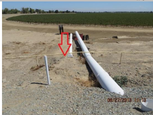
Pipe visible on LS toe.