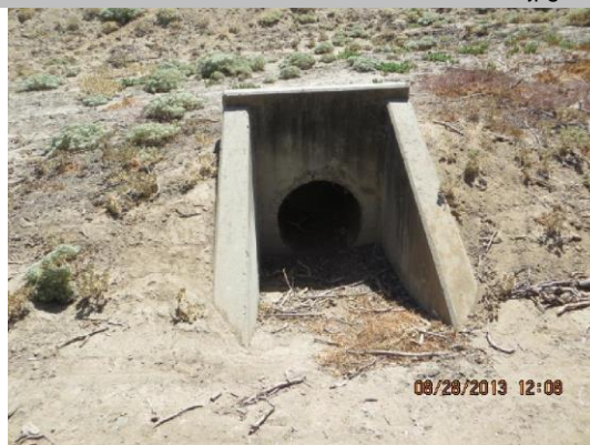
Headwall on LS toe.