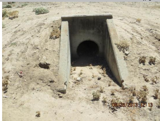
Concrete headwall on LS toe.