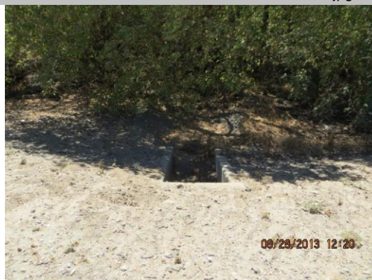
Concrete headwall on WS toe.