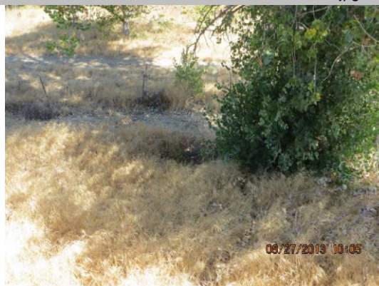
Concrete U-shaped headwall on LS toe.