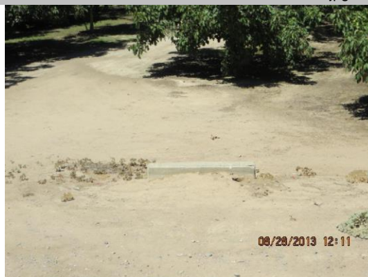
Concrete headwall on LS toe.