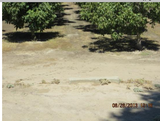
Concrete headwall on LS toe.