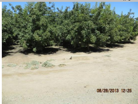
Concrete headwall on LS toe.