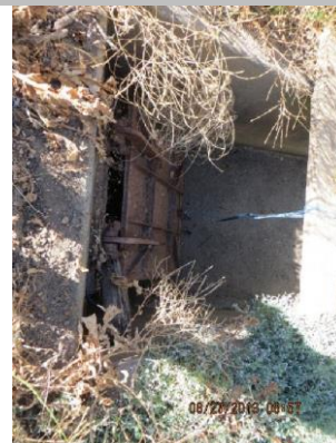
Flap gate and U shaped headwall on WS toe. Debris blocking closure of gate.