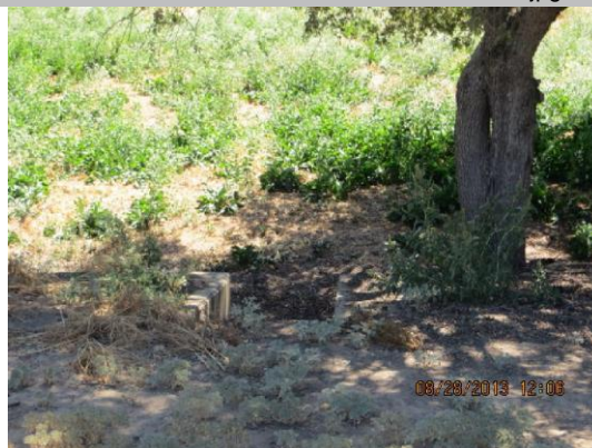
Headwall on WS toe.