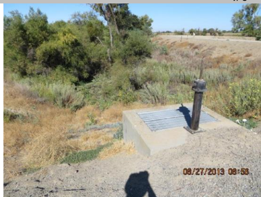
Slide gate in concrete riser on WS shoulder.