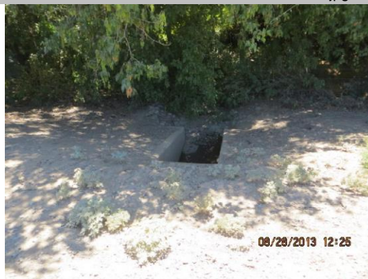
Concrete headwall on WS toe.