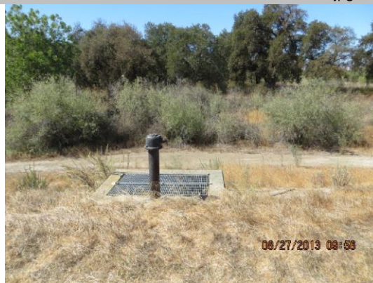
Slide gate in concrete vault on WS shoulder.