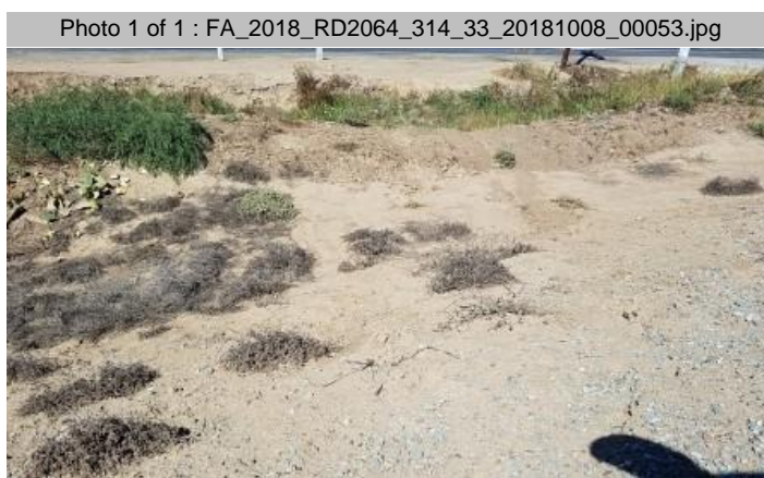
View of slope damage near ditch caused by vehicular traffic. Fall 2018