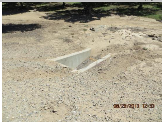
Concrete U shaped headwall on WS toe.