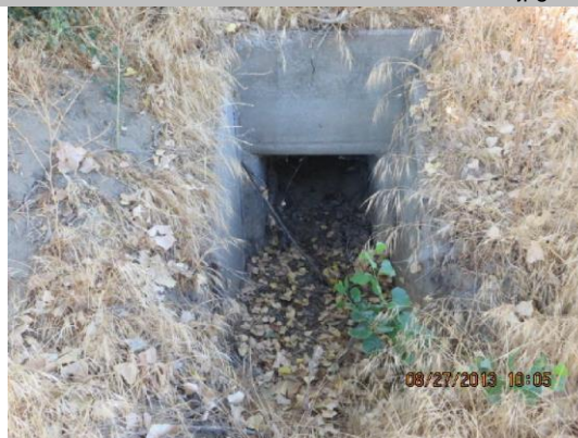
Concrete U-shaped headwall on LS toe.