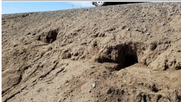
View of animal holes on levee slope. Fall 2018