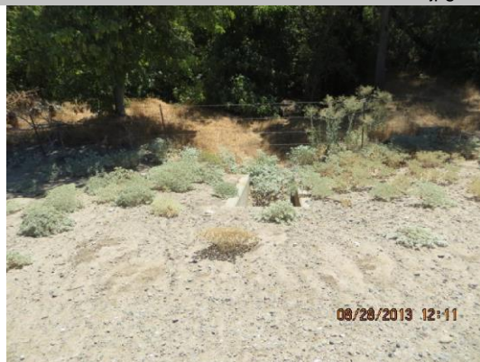
Concrete headwall on WS toe.