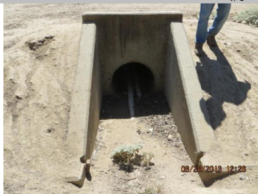
Concrete headwall on LS toe.