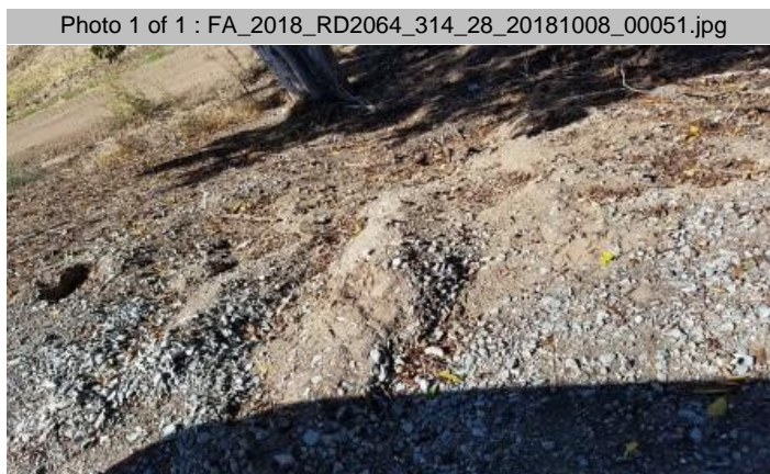
View of slope damage from vehicular traffic. Fall 2018