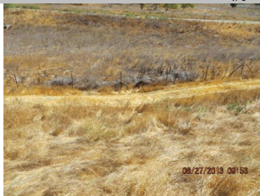
Concrete headwall on LS toe.