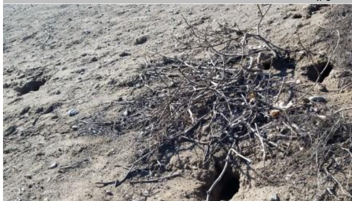
View of animal holes on levee slope. Fall 2018

Photo 1 of 1 : FA_2018_RD2064_313_31_20181008_00052.jpg