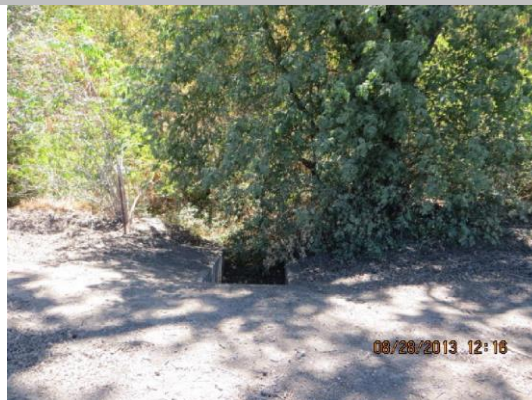
Concrete headwall on WS toe.