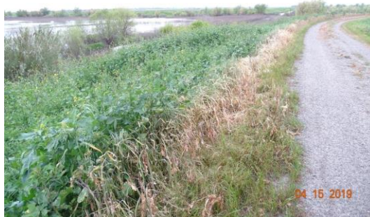
View of vegetation on the waterside slope. Spring 2019.

Photo 1 of 1 : SP_2019_RD2035_240_6_20190422_00015.jpg