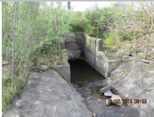
Flap gate and spillway on WS toe.