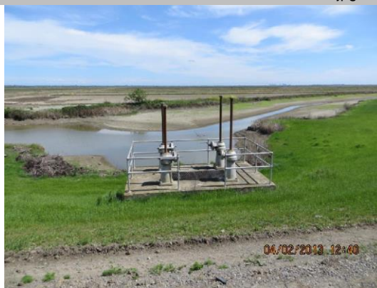
Slide gates in concrete vault on WS slope.