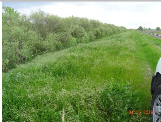
View of vegetation on the waterside slope. Spring 2019.