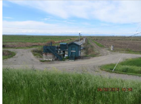
Pumping plant off LS toe.