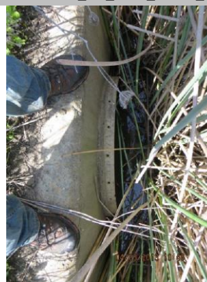
Headwall and pipe on LS toe.