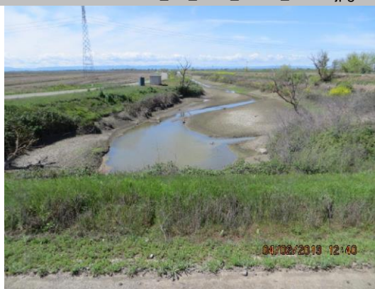
Intake at channel on LS toe.