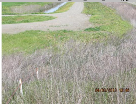
Headwall at bottom of fenceline on LS toe