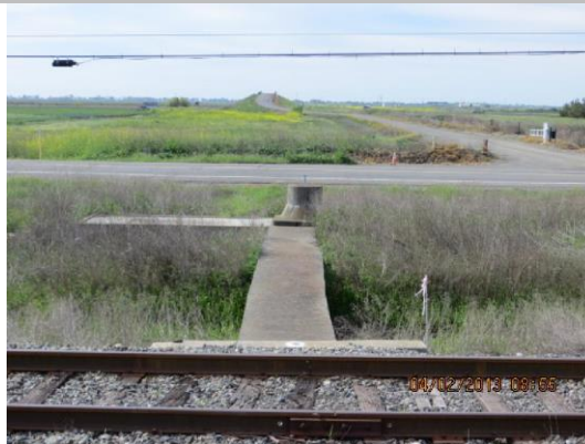
Concrete encased pipe on LS toe.