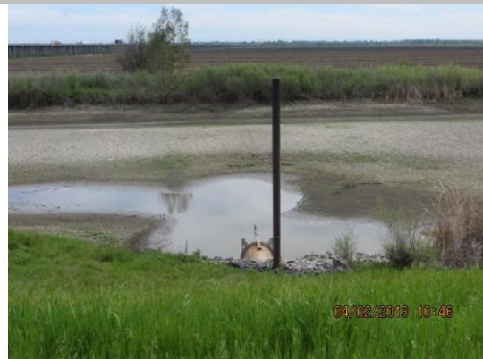
Pipe and flap gate with vent riser on WS toe.