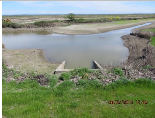
Concrete headwall on WS toe.