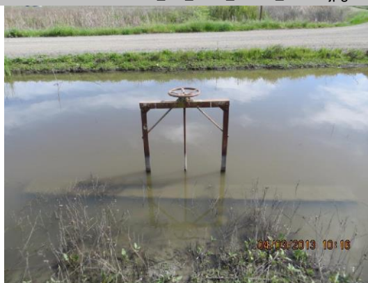
Slide gate and headwall in canal at LS toe.