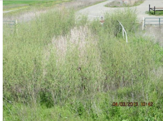
Slide gate at LS toe showing excessive vegetation.