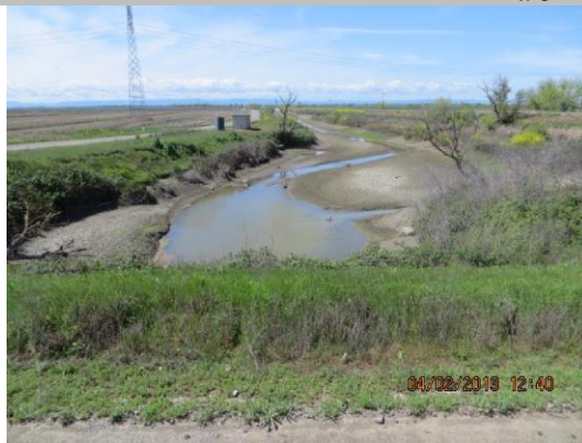
LS at intake.