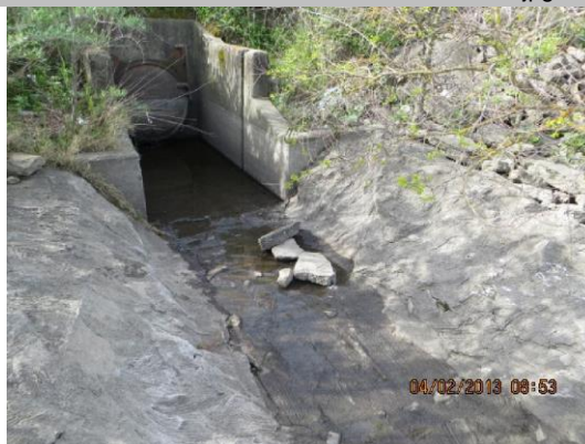
Flap gate and spillway on WS toe.