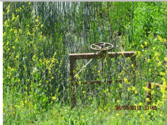
Combination flap and slide gate on WS toe. With excessive vegetation