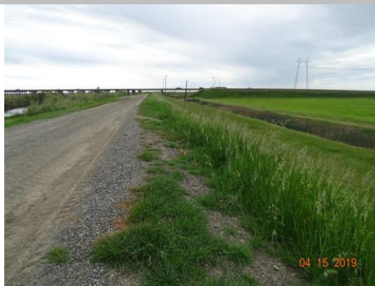
View of vegetation on the landside slope. Spring 2019.