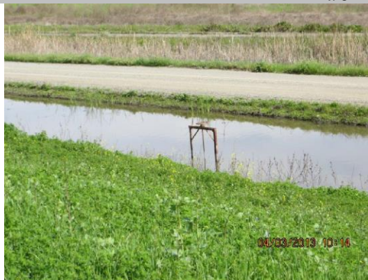
Slide gate and headwall in canal at LS toe.