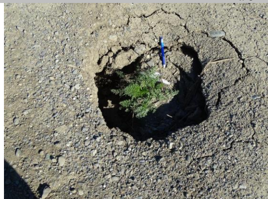
LS view: Close-up view of sinkhole, approximately 1.5-foot in diameter and 0.5-foot deep, located approximately 20 off toe.