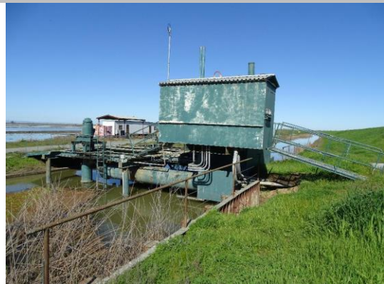
LS view: Pumping plant off LS toe.