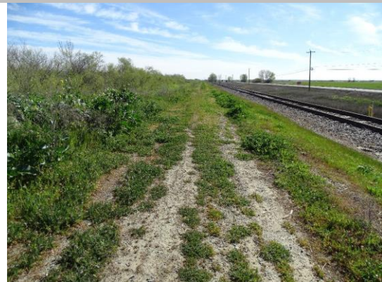
Levee crown looking downstream.