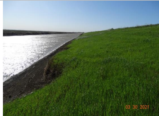
View of erosion at waterside toe. Spring 2021.