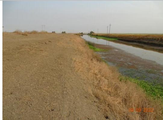
View of erosion on the waterside slope. Fall 2022.