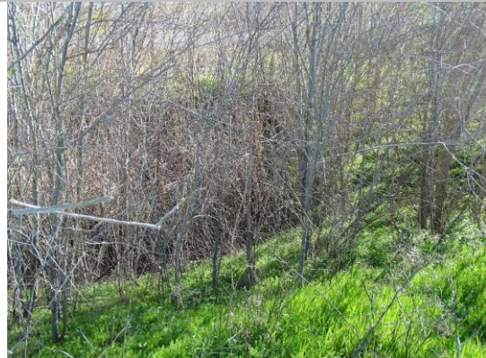
LS view: Headwall at toe barely visible with excessive vegetation.