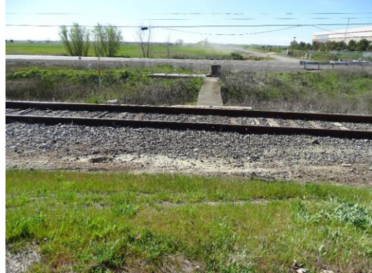
LS view: Concrete encased pipe.