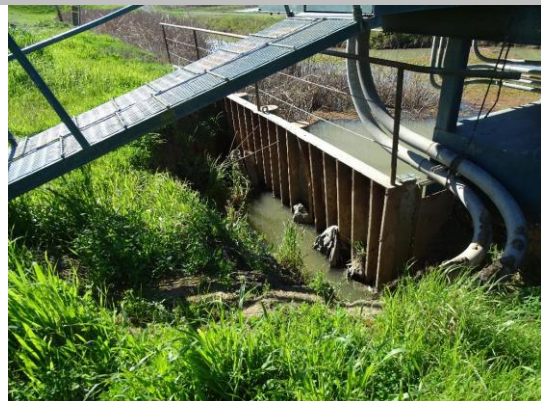
LS view: Erosion on the southern side of the pumping plant.