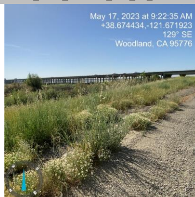
View of vegetation on the waterside slope (Spring 2023).