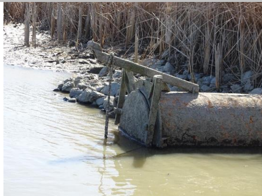
WS view: Pipe outlet with flap gate; unable to determine if flap gate has been repaired.