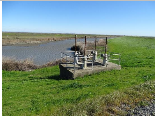
WS view: Slide gate operators and concrete vault on WS slope.