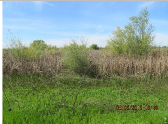
Vegetated area blocks access to WS of pipe.