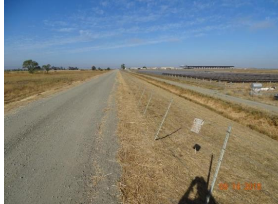
View of fence on the landside shoulder of the crown. Fall 2018.