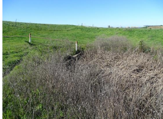
LS view: Headwall at toe with excessive vegetation.