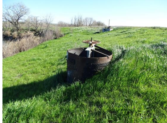
WS view: Steel riser with no cover and slide gate on the slope.