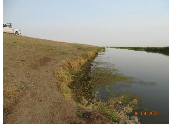
View of erosion on the waterside slope. Fall 2022.