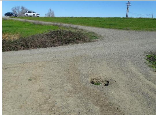
LS view: Sinkhole located approximately 20 feet off toe.