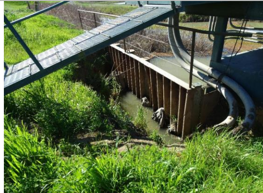
LS view: Erosion on the southern side of the pumping plant.