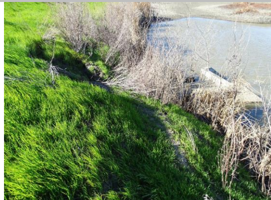
WS view: More than 1/2-foot of erosion above pipe alignment.