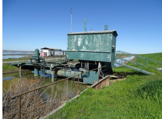
LS view: Pumping plant off LS toe.