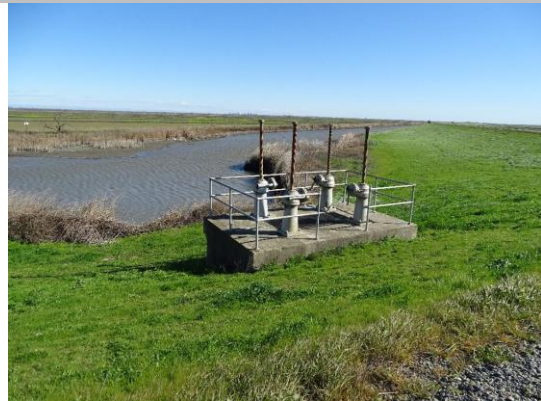
WS view: Slide gate operators and concrete vault on WS slope.