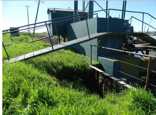
LS view: Erosion on the northern side of the pumping plant.