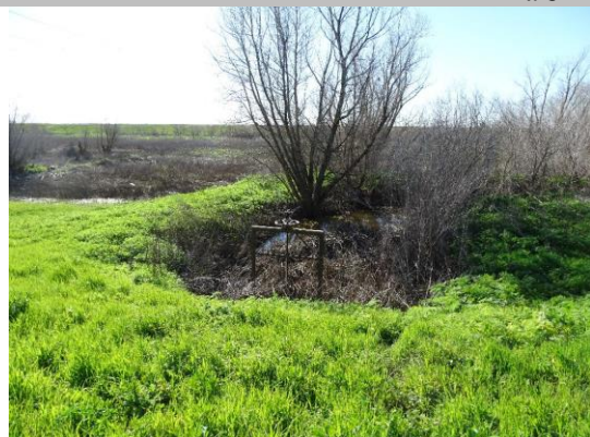
WS view: Slide gate on toe with excessive vegetation.