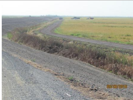
View of the ditch on the landward side of the levee looking downstream. Fall 2016.