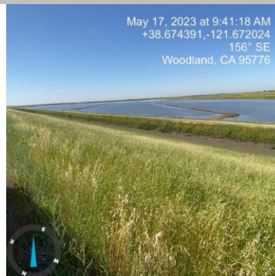
View of the drainage ditch on the landward side of the levee looking downstream (Spring 2023).