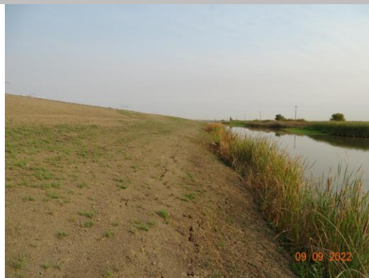
View of erosion on the waterside slope. Fall 2022.