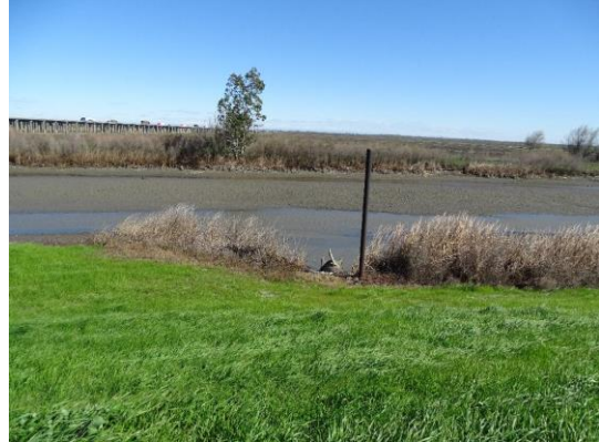
WS view: Pipe with vent riser on toe.