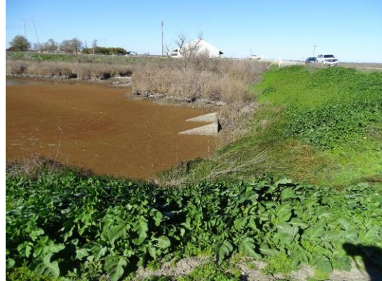
LS view: Pipe intake headwall.