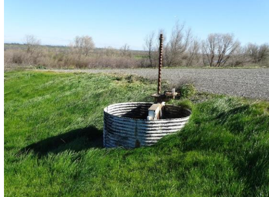
WS view: CMP riser with no cover and slide gate on the slope.