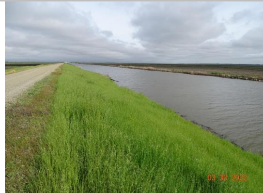
View of erosion at the waterside toe. Spring 2022.