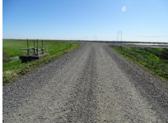
Levee crown looking downstream.