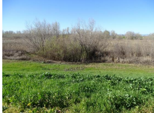
WS view: Vegetated area blocks access to pipe outlet.