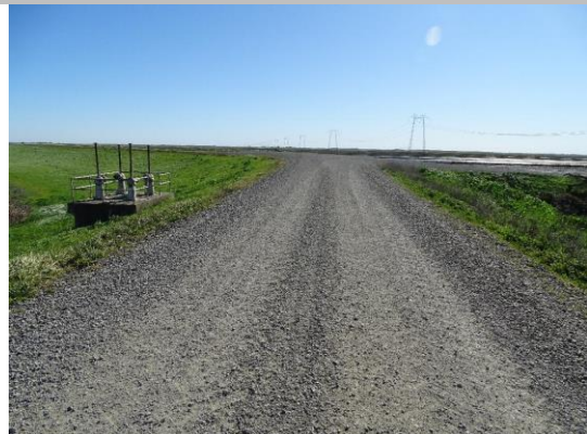
Levee crown looking downstream.