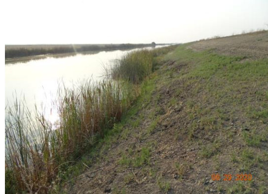
View of erosion on the waterside slope near the toe. Fall 2020.