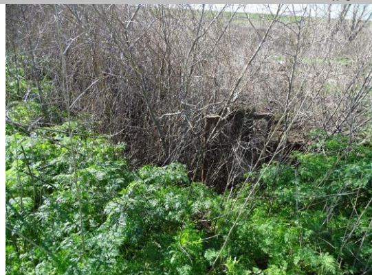
WS view: Combination flap and slide gate on toe with excessive vegetation.