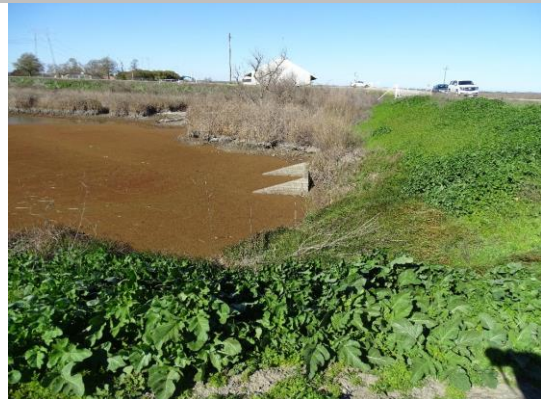
LS view: Pipe intake headwall.