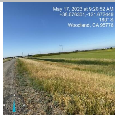
View of vegetation on the landside slope (Spring 2023).