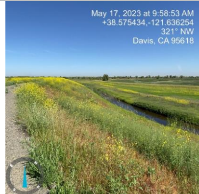
View of vegetation on the landside slope (Spring 2023).