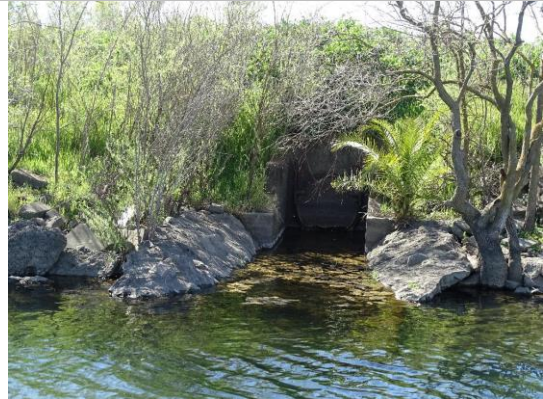
WS view: Flap gate and spillway on WS toe (view facing levee from WS).