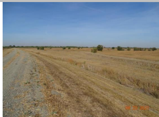
View of the ditch at the landside toe. Fall 2021.