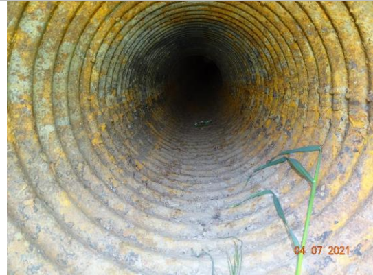
Land-Side: View inside of pipe at headwall