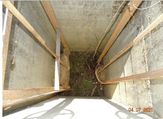
Water-Side: Slide gates inside of concrete box on levee berm