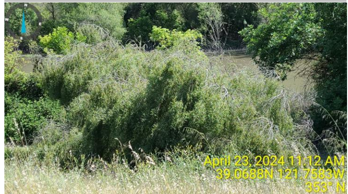
View of a fallen tree on the waterside slope. Spring 2024.

Photo 1 of 1 : SP_2024_RD1660_9_13_20240425_00017.jpg