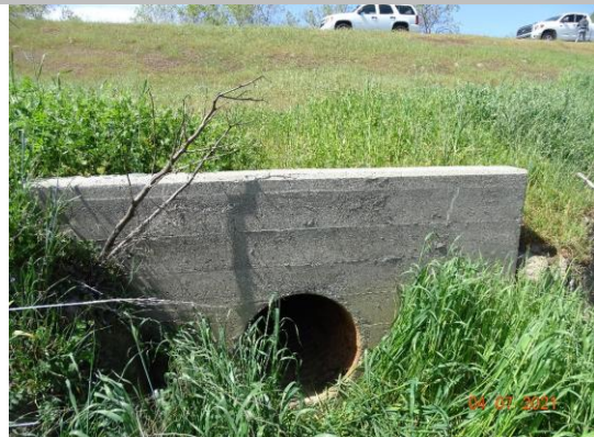
Land-Side: Headwall near levee toe