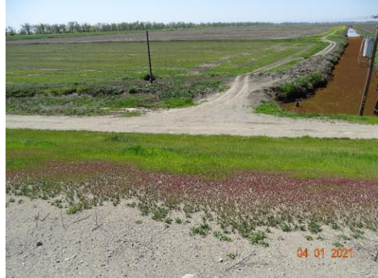
Land-Side: View of levee slope looking from crown, irrigation canal on landside