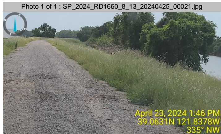
View of the vegetation along the waterside slope. Spring 2024.