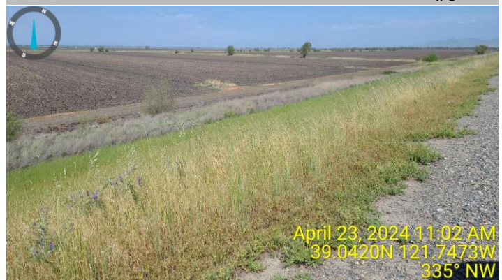
View of the vegetation along the landside slope. Spring 2024.