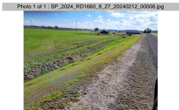
View of the rodent burrows along the landside slope. Fall 2021.