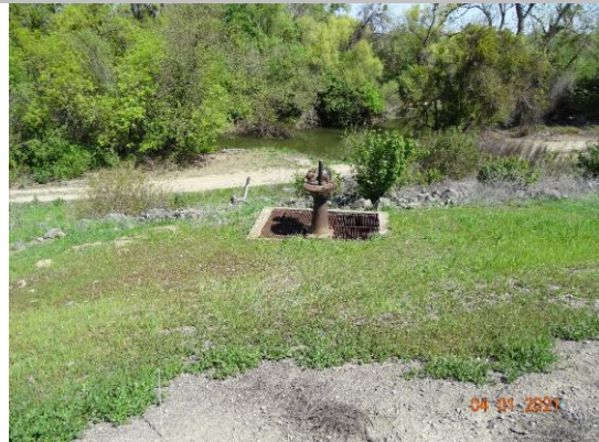
Water-Side: View of levee slope looking from crown, concrete box with slide gate on levee slope