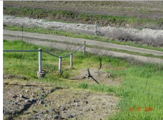
View of the slope instability along the landside slope. Spring 2020.