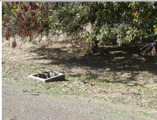
WS view: concrete box on levee slope. No pipe found on berm and river bank.