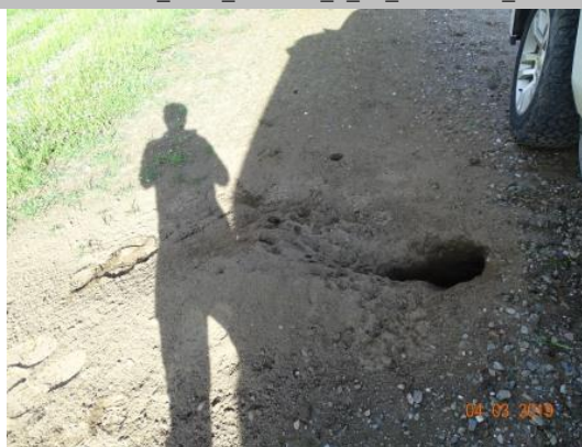
View of a large rodent burrow on the waterside shoulder. Spring 2019.