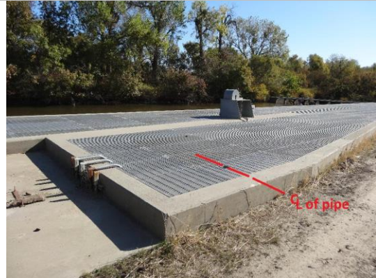
WS view: concrete box on channel bank. Pipe end with slide gate. Pipe discharges into this box.