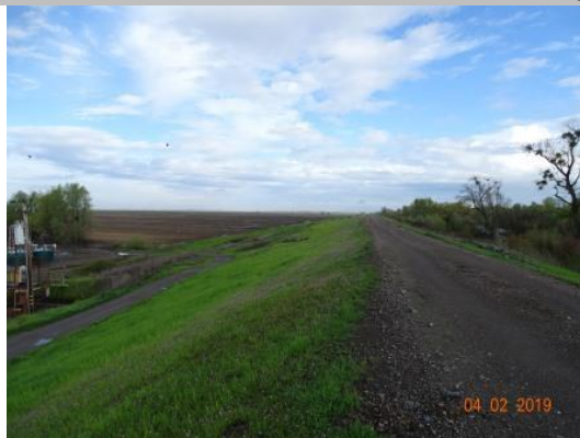
View of the vegetation on the landside slope. Spring 2019.