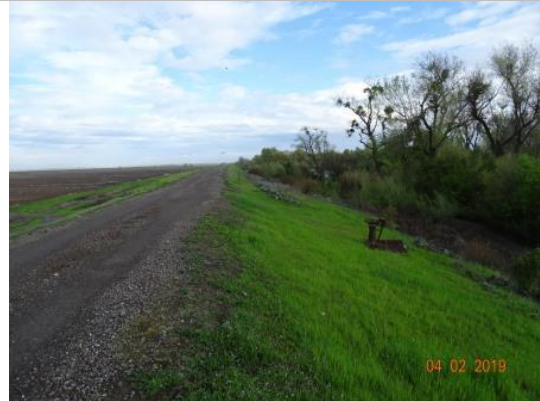
View of the vegetation on the waterside slope. Spring 2019.