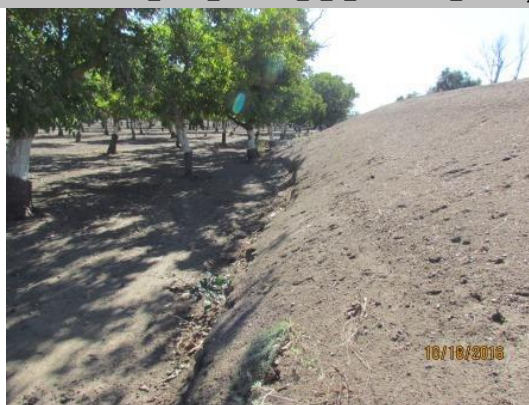
View of the toe cut by the farmer on the landside.