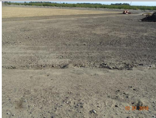
View of rodent holes along the landside slope.