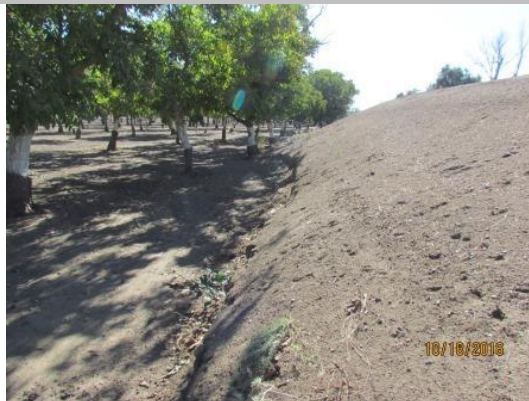
View of the toe cut by the farmer on the landside.