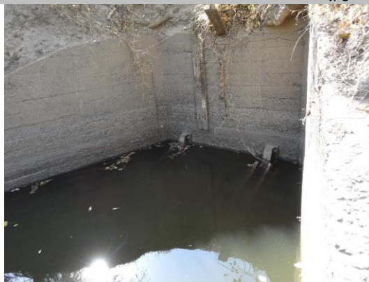
WS view: closer view of U shaped concrete headwall in bypass channel. Pipe not visible.