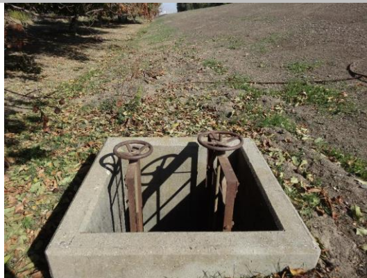
WS view: two slide gates in concrete box on levee slope.