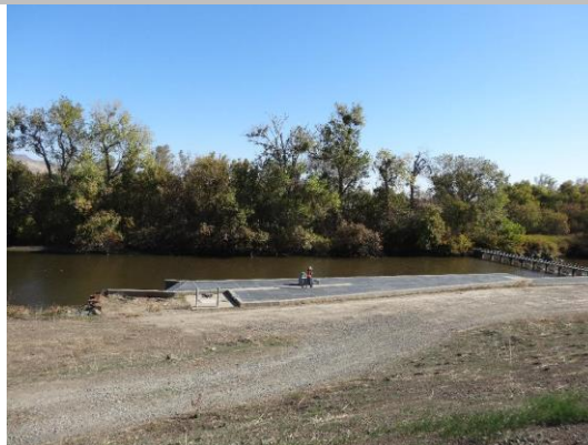
WS view: overview of concrete box on channel bank. It looks like a fish ladder. Pipe discharges into this box.