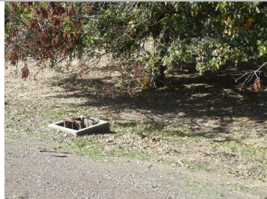
WS view: concrete box on levee slope. No pipe found on berm and river bank.