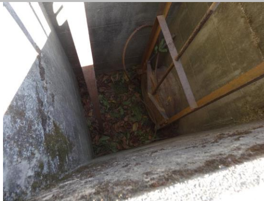
WS view: closer view of two slide gates in concrete box on levee slope.