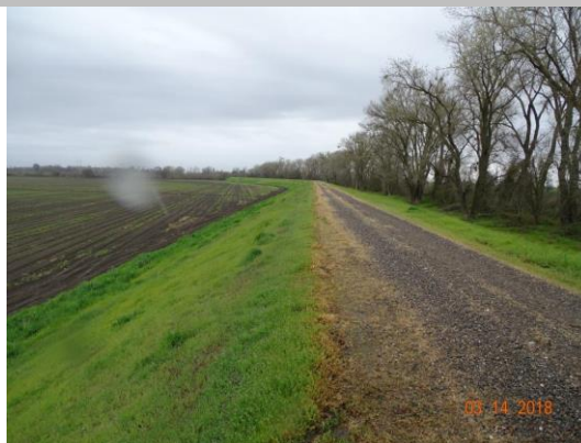
View of the native grasses on both slopes.