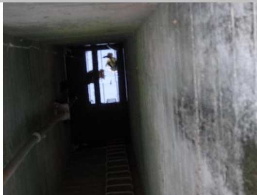
WS view: inside view of concrete box on levee slope. Slide gate in concrete box.