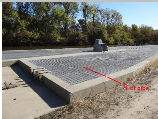
WS view: concrete box on channel bank. Pipe end with slide gate. Pipe discharges into this box.