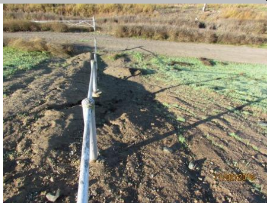
Another view of the slope instability looking from the levee crown.