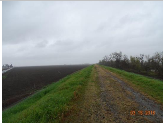
View of the native grasses on both slopes.