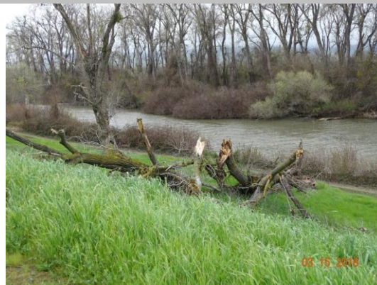
View of the tree along the waterside toe.