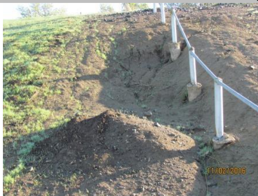
View of the slope instability looking from the landside toe.