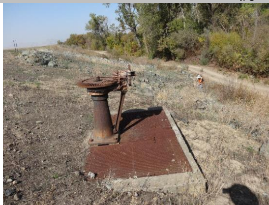
WS view: 4 ft. by 8 ft. concrete box with slide gate on levee slope. USED bench mark on top of the box.