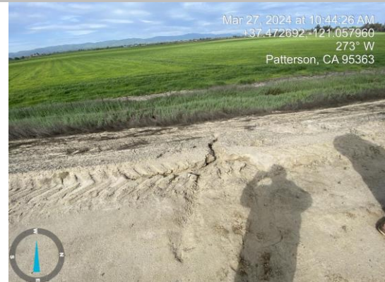
View of erosion/rills along the landside slope (Spring 2024).