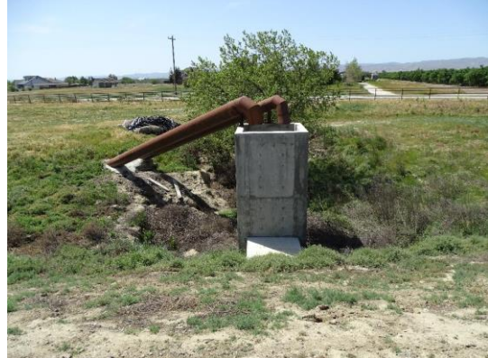
LS view: Looking from crown; new concrete drainage box on toe.