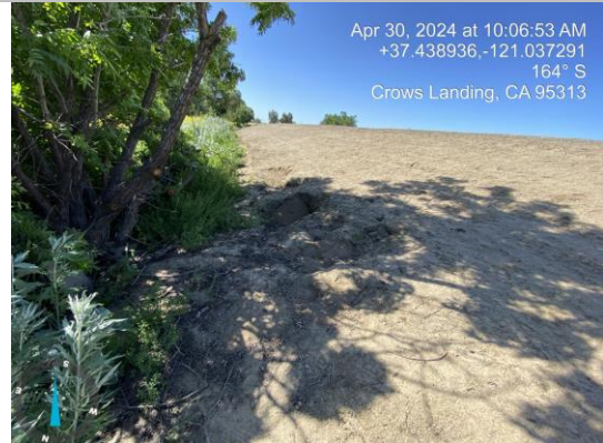
View of erosion pocket on the waterside slope near the toe (Spring 2024).