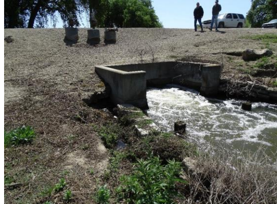
LS view: Concrete discharge box on toe; erosion around downstream sides.