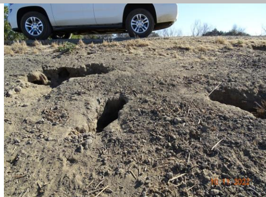
Several large animal burrows were observed at this location. (Fall 2022)