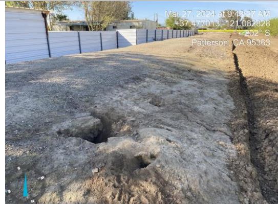
View of animal holes along the waterside slope (Spring 2024).