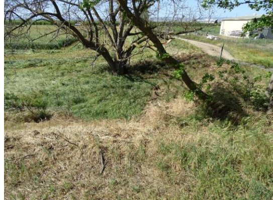
LS view: Looking from levee crown; general overview.