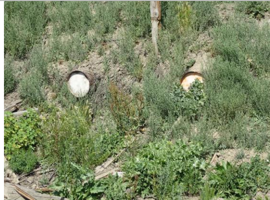
LS view: Close-up view of pipe inlet capped.