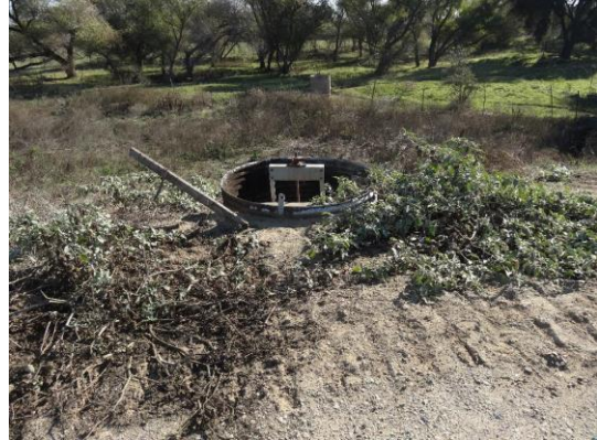
View of WS--CMP riser located on WS shoulder and concrete riser approximately 100 feet from levee crown.