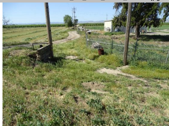
LS view: Looking from crown; general overview.