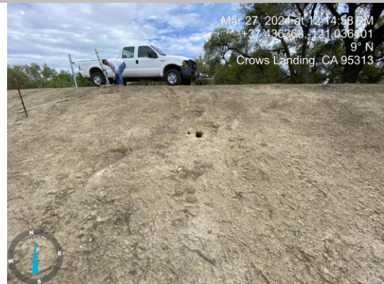
View of animal burrow along the landside slope (Spring 2024).