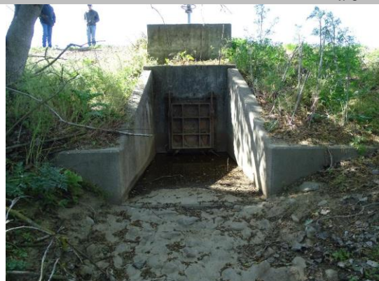
WS view: Concrete headwall and flap gate; surge box in the background.