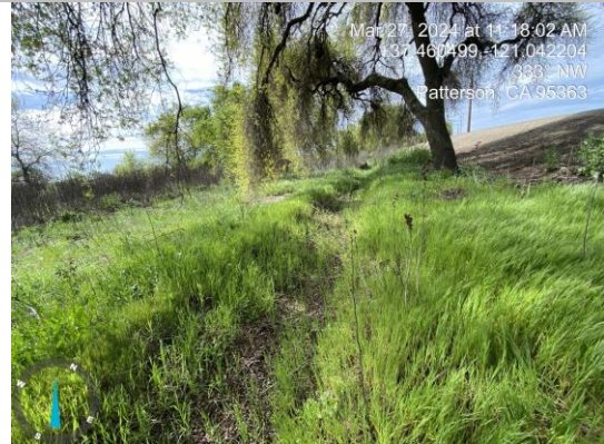
Looking upstream along the waterside toe (Spring 2024).