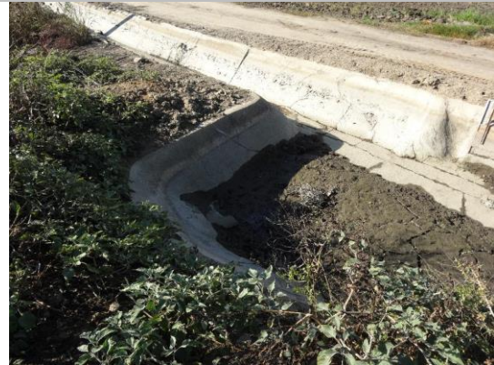
Concrete drain channel located on LS toe.