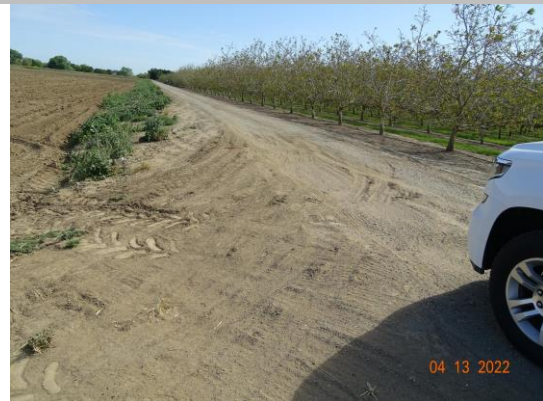
Depression in levee crown from vehicle traffic. (Spring 2022)