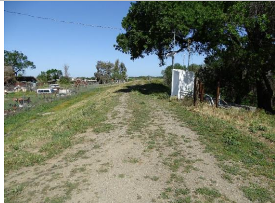
Levee crown looking downstream.