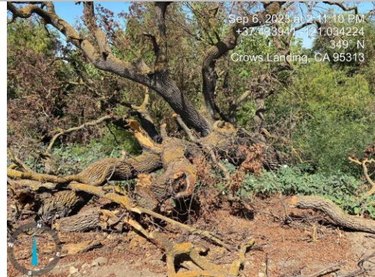
View of fallen tree on waterside slope (Fall 2023).