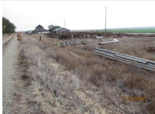
A fence was found on the landside toe of the levee looking upstream.