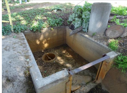
LS view: Pipe outlet on toe within concrete ditch.