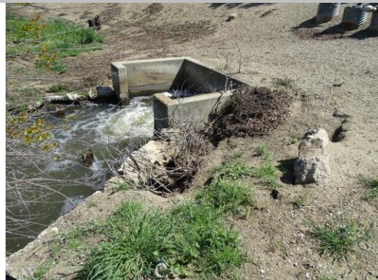
LS view: Concrete discharge box on toe; erosion around downstream sides.