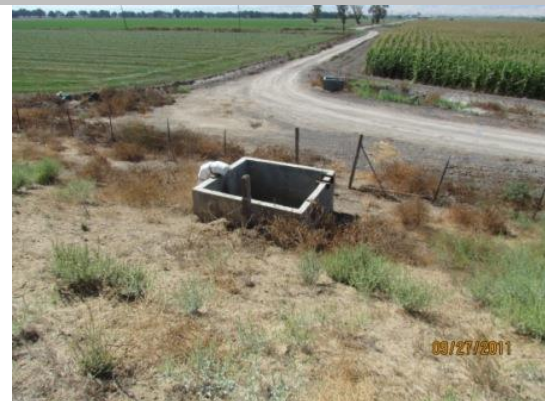
A well is located at the landside toe of the levee. The picture was taken from the crown looking toward the landside of the levee.