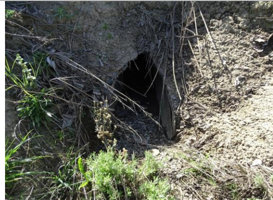
LS view: Outlet of irrigation pipe is deteriorated.