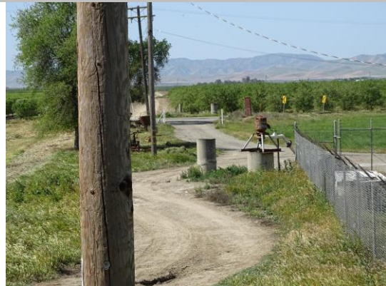
LS view: Likely risers for pipe off LS toe.