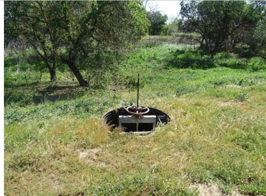
WS view: Looking from crown; CMP riser with no cover on slope.