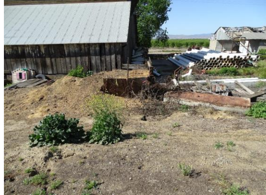
LS view: Looking from crown; general overview.