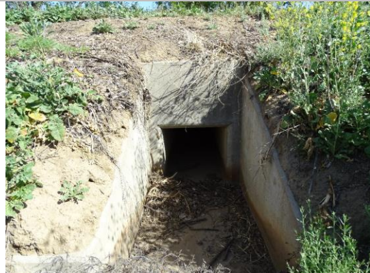
LS view: Close-up view of concrete headwall on toe.