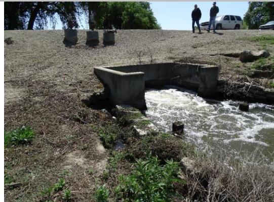
LS view: Concrete discharge box on toe; erosion around downstream sides.