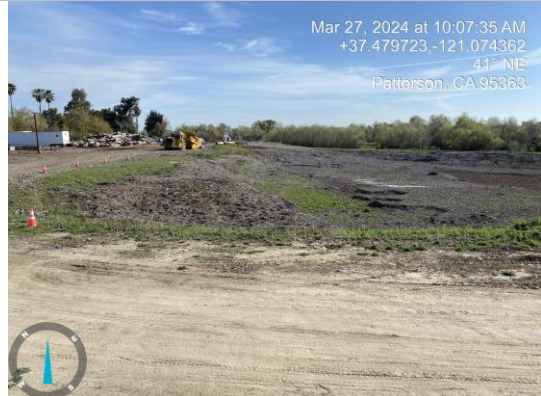
Haul road constructed by an adjacent landowner and material piled in the channel (Spring 2024).