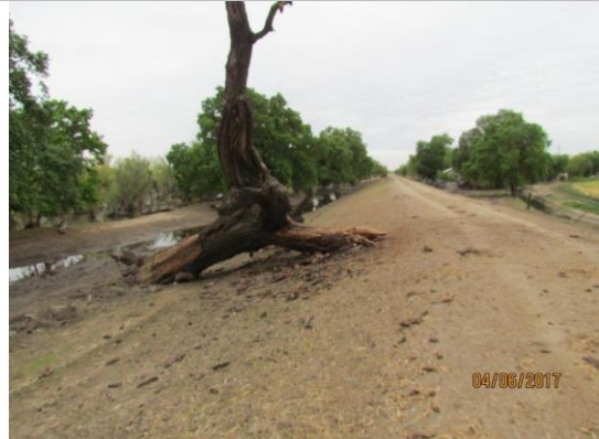
View of a tree trunk on the waterside slope of the levee.