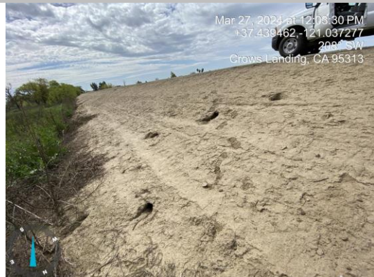
View of rodent holes along the waterside slope (Spring 2024).