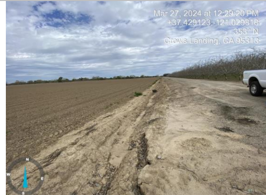
View of ditch along the landward toe (Spring 2024).