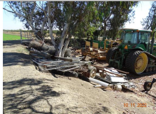
Equipment should be moved off of the landside slope and toe. (Fall 2022)