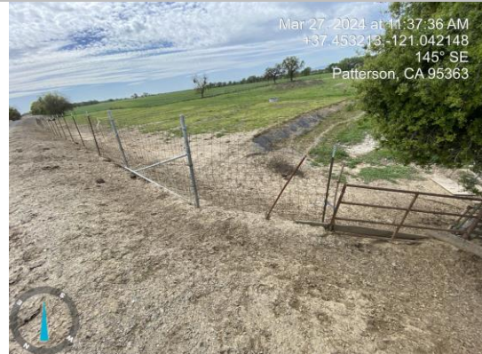
View of damage to USACE seepage berm that appears to be caused by foot traffic (Spring 2024).