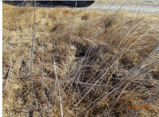
Several rodent holes noted at this location. (Fall 2020)