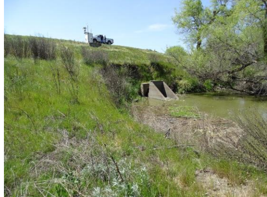
WS view: Looking toward levee; concrete headwall on toe with erosion.