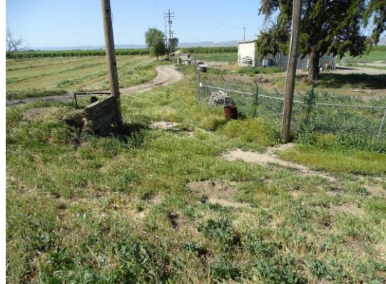
LS view: Looking from crown; general overview.