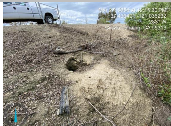
View of animal burrow on the waterside slope (Spring 2024).