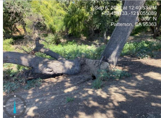
View of downed tree with root ball exposed on waterside slope (Fall 2023).