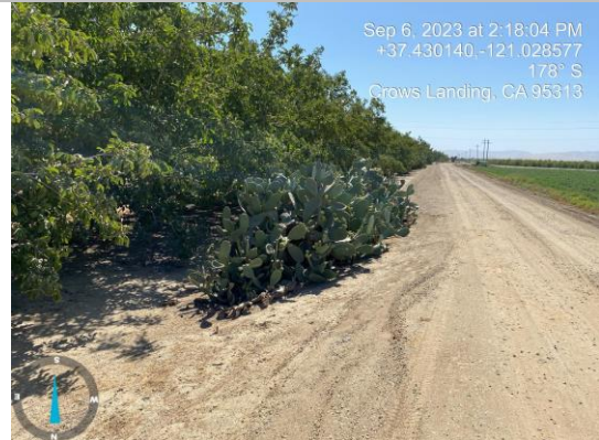
Looking at dense cactus growth on the waterside slope (Fall 2023).