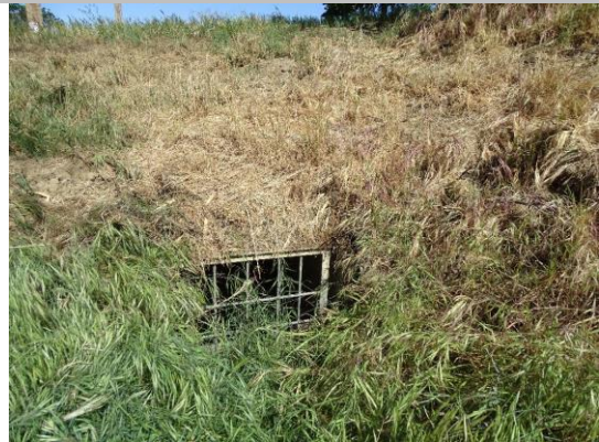
LS view: Concrete inlet on toe.