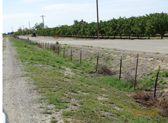
View of barbed wire fence at landward toe looking upstream. (Spring 2022)