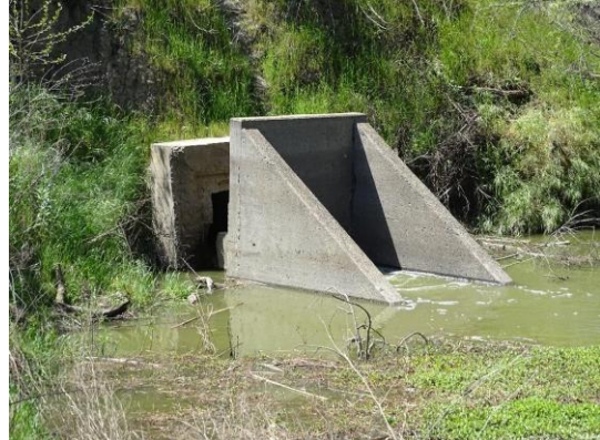
WS view: Close-up view of detached concrete headwall on toe.