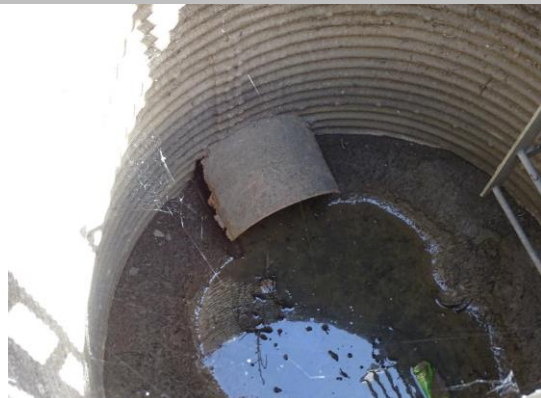
WS view: Looking into CMP riser at deteriorated pipe inlet.