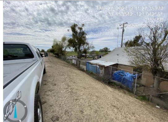
Looking southwest at fence and other encroachments on landward toe (Spring 2024).