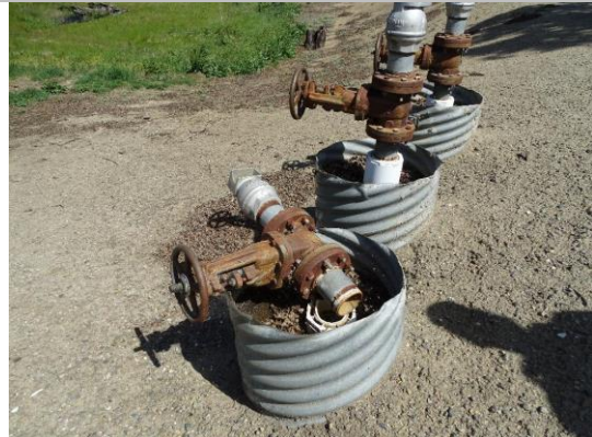
LS view: Close-up view of broken siphon breaker.