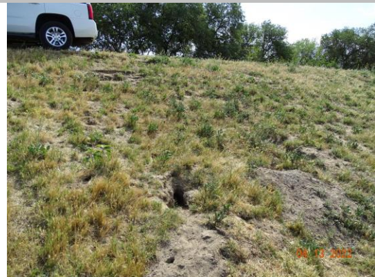
View of rodent burrows in the landside slope. (Spring 2022)