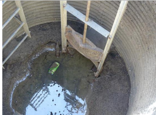
WS view: Looking into CMP riser at slide gate.