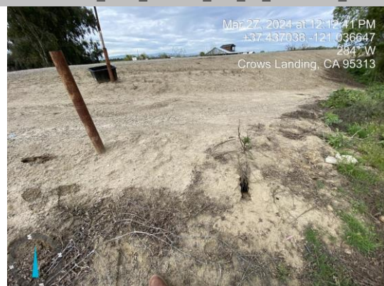
View of animal burrows along the waterside slope near the gate (Spring 2024).

Photo 1 of 1 : SP_2024_RD1602_110_48_20240403_00101.jpg