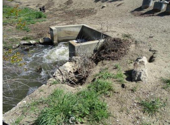
LS view: Concrete discharge box on toe; erosion around downstream sides.