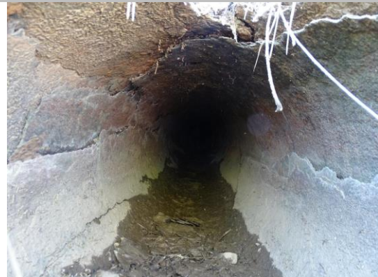
LS view: View of inside of pipe outlet.