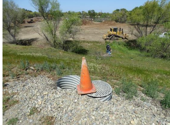
WS view: Siphon breaker in CMP riser on shoulder; missing cover on riser. Concrete headwall on toe in background.