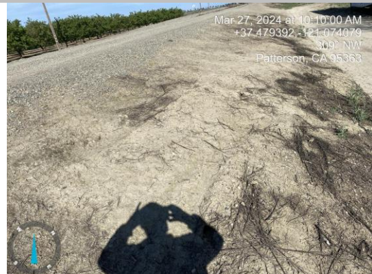
View of collapsed rodent holes that need to be backfilled and compacted properly (Spring 2024).