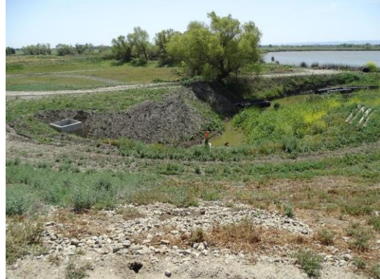
LS view: Looking from crown; general overview.