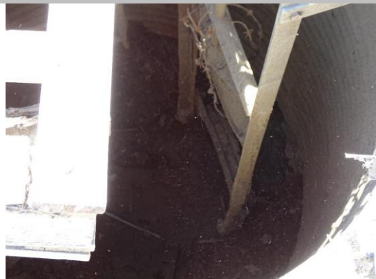
WS view: Looking into CMP riser; inlet of pipe through levee is deteriorating.