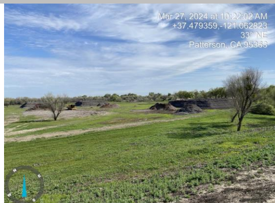
View of wood chippings within the channel (Spring 2024).