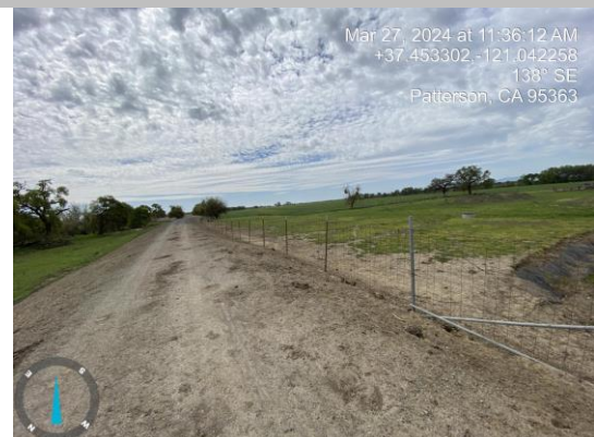
View of fence along the landside slope and shoulder (Spring 2024).