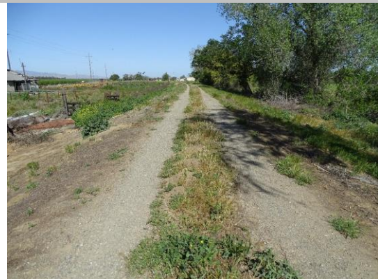
Levee crown looking downstream.