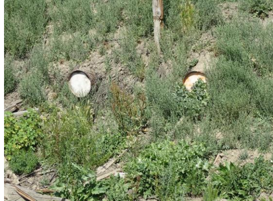
LS view: Close-up view of pipe inlet capped.