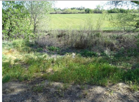
WS view: Looking from crown; 12-inch CMP outlet with flap gate on toe.