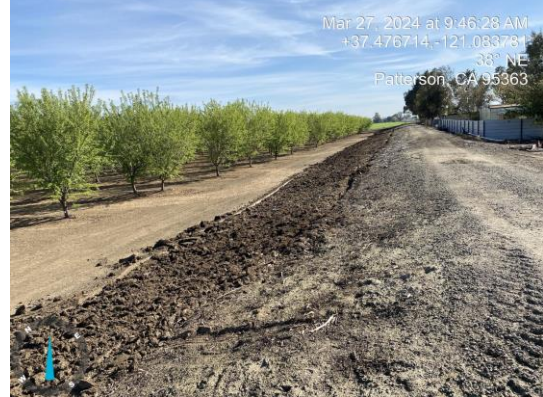
View of tilling along the waterside slope (Spring 2024).