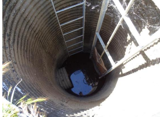
WS view: Looking into CMP riser.