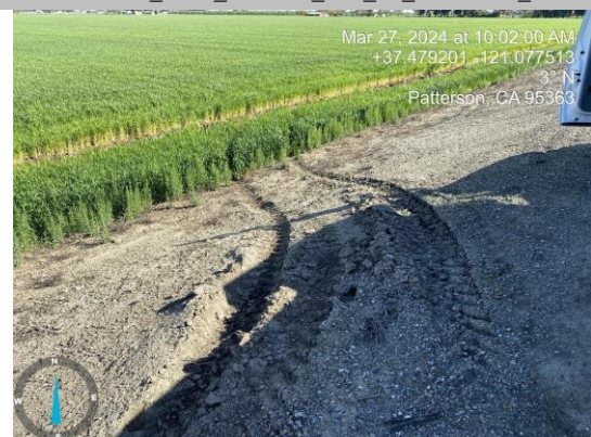
View of vehicle traffic that has cut ruts into the waterside slope (Spring 2024).