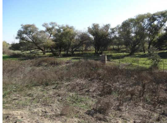
Concrete riser located in the floodway, photo 1 of 2.