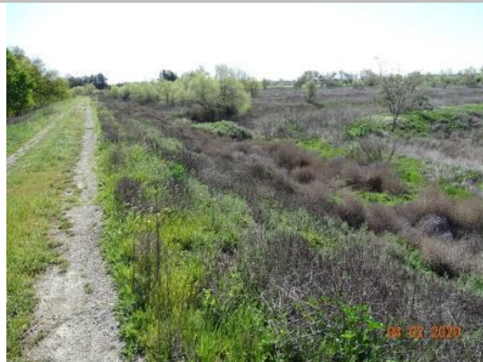
Looking upstream at vegetation growing on the landside slope and toe. (Spring 2020)