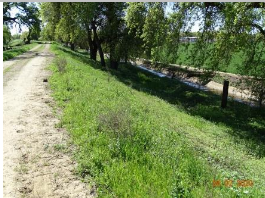
View of the landside slope looking upstream. (Spring 2020)