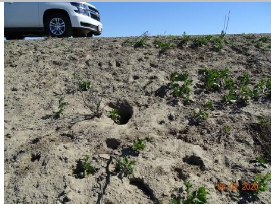
View of the landside slope from the toe of the levee. (Spring 2020)