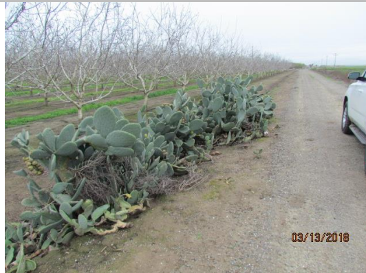
Looking south at dense cactus on waterward slope.

* Location LS : Land Side N/A : Not Applicable WS : Water Side CR : Crown