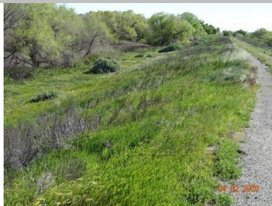
View of the waterside slope looking upstream. (Spring 2020)