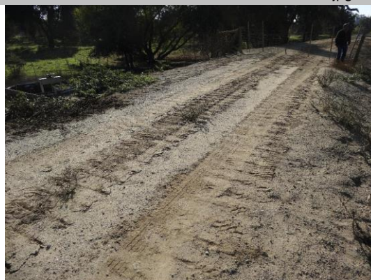
Overview of levee crown at pipe crossing.