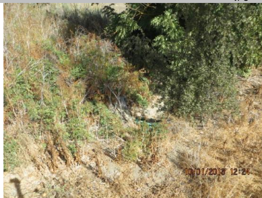
Concrete outlet on WS toe.