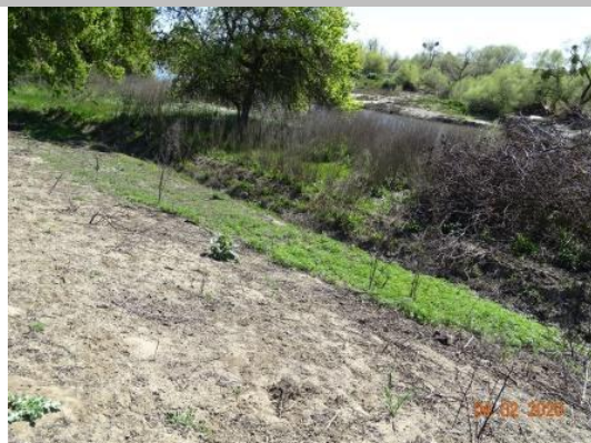
Looking downstream along the waterside slope. (Spring 2020)