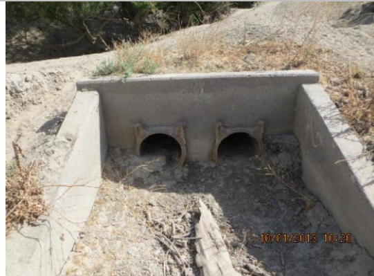
Concrete headwall on WS toe with missing flapgate.