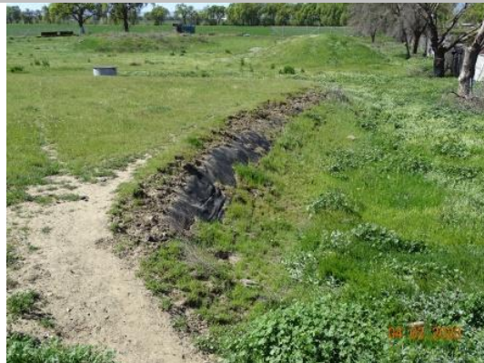
View of damage on downstream side of seepage berm. (Spring 2020)

* Location LS : Land Side N/A : Not Applicable WS : Water Side CR : Crown