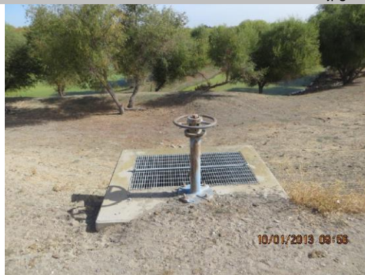
Slide gate in concrete box on WS shoulder.