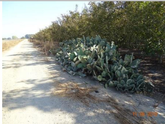
Looking at dense cactus growth on the waterside slope. (Fall 2019)