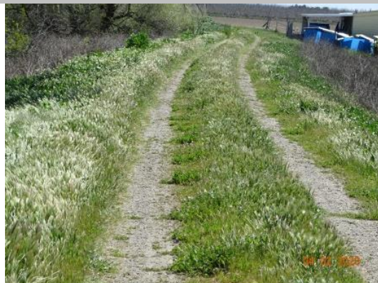
View of vegetation along the levee crown. (Spring 2020)

* Location LS : Land Side N/A : Not Applicable WS : Water Side CR : Crown