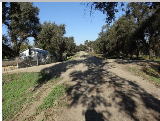
Overview of levee crown at pipe crossing.