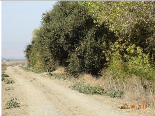
Looking upstream along the waterside shoulder. (Fall 2019)