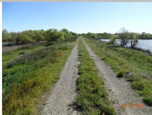
View of vegetation growing along the crown. (Spring 2020)

* Location LS : Land Side N/A : Not Applicable WS : Water Side CR : Crown