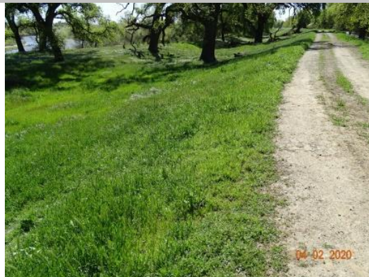
Looking upstream along the waterside slope. (Spring 2020)