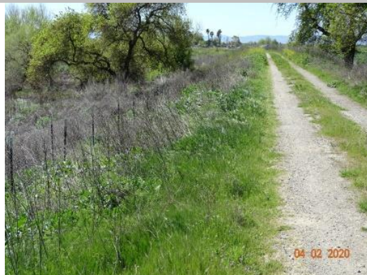
View of waterside slope looking upstream. (Spring 2020)

* Location LS : Land Side N/A : Not Applicable WS : Water Side CR : Crown