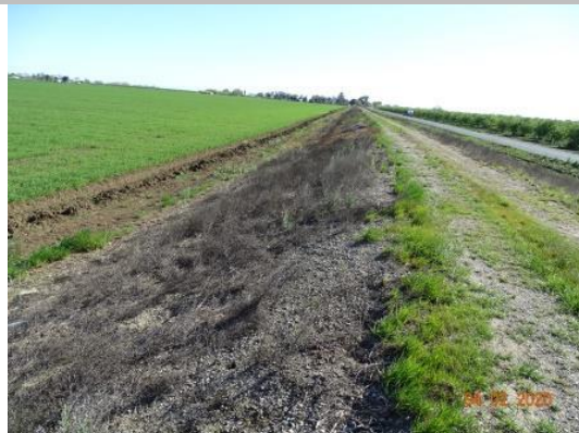
Looking East along the waterside slope. (Spring 2020)

* Location LS : Land Side N/A : Not Applicable WS : Water Side CR : Crown