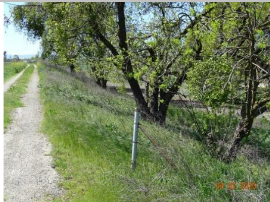
View of the landside slope looking upstream. (Spring 2020)