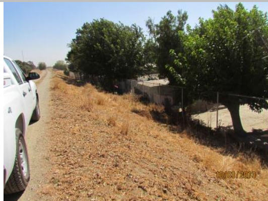
Fences were found on the landside toe of the levee looking upstream.