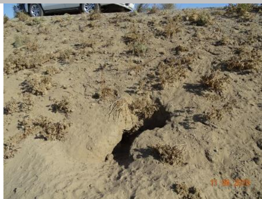
View of rodent burrows in the landside slope. (Fall 2019)