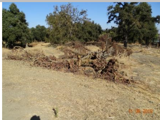
View of fallen tree on the waterside slope and toe. (Fall 2019)

* Location LS : Land Side N/A : Not Applicable WS : Water Side CR : Crown