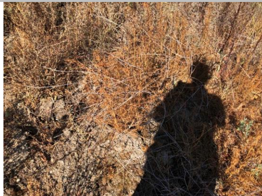
Close view of the erosion.