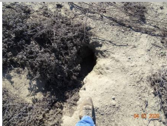
Representative view of rodent burrow in landside slope. (Spring 2020)