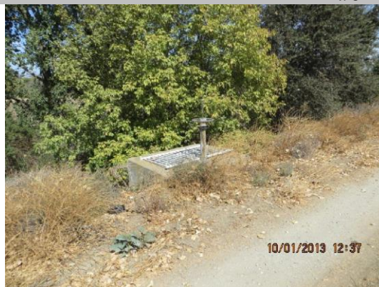
Slide gate in concrete riser on WS shoulder.