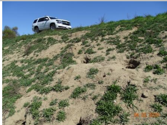
Looking downstream at the landside slope. (Spring 2020)