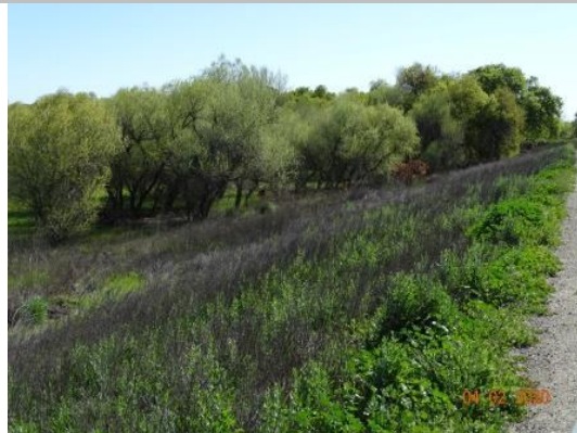
View of the waterside slope looking upstream. (Spring 2020)