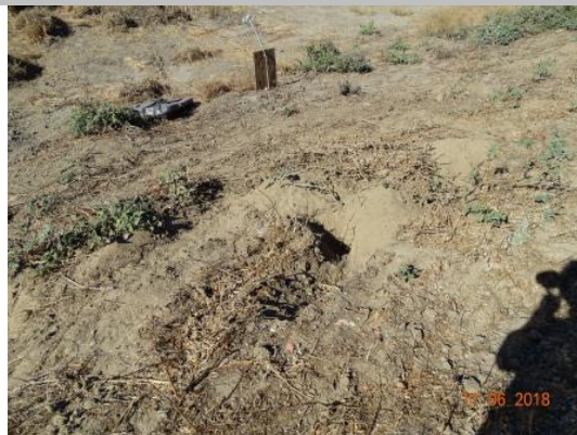
Upclose view of some of the damage to slope. (Fall 2018)