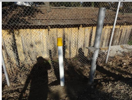
PVC riser with yellow cover located along fence on LS.