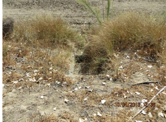
Concrete U-shaped headwall on LS toe.