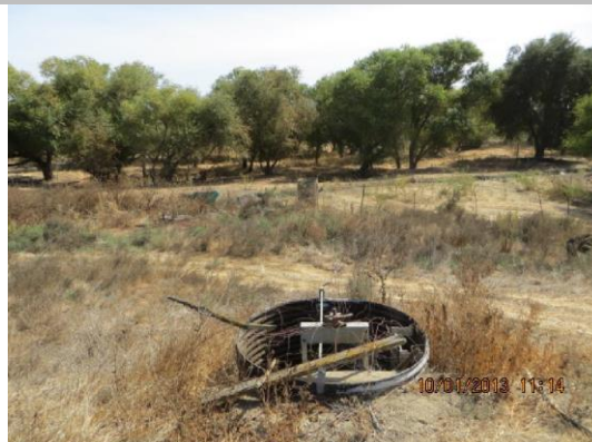
Slide gate in 60-inch CMP riser on WS shoulder.