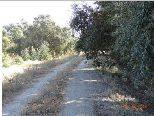
Looking at tree limbs hanging over the landside shoulder and crown. (Fall 2019)

* Location LS : Land Side N/A : Not Applicable WS : Water Side CR : Crown