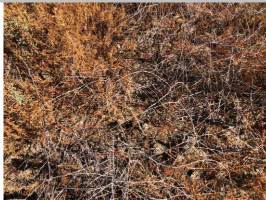
Close-up view at the erosion. Signs of squirrel activities.