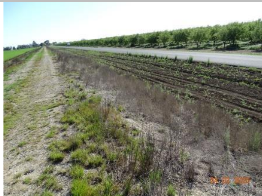
Looking East along the landside slope. (Spring 2020)