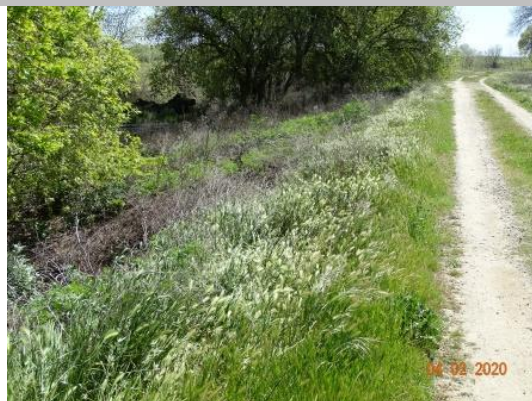
View of vegetation on the waterside slope looking upstream. (Spring 2020)