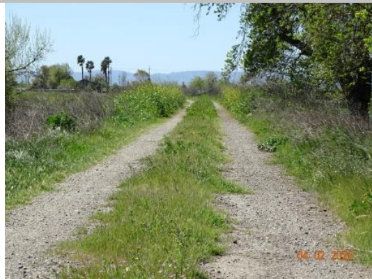
View of vegetation growing along the levee crown. (Spring 2020)