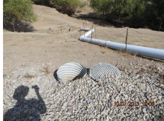
Siphon breaker in 24-inch CMP riser on WS shoulder.