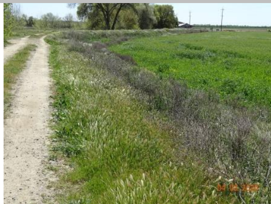
View of vegetation along the landside slope looking upstream. (Spring 2020)