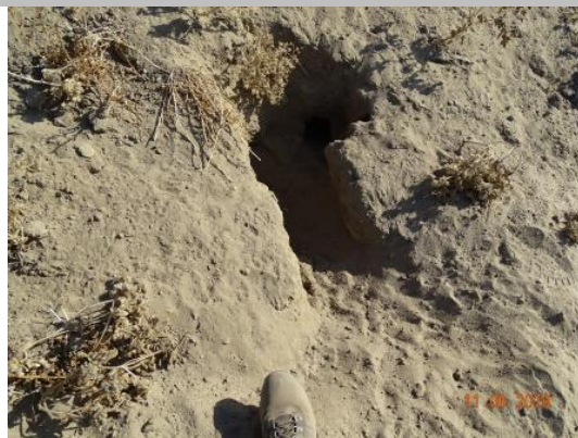
Representative rodent burrow in the landside slope. (Fall 2019)