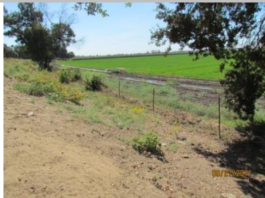
View of the fence on the landside toe of the levee. The picture was taken from crown looking upstream.

* Location LS : Land Side N/A : Not Applicable WS : Water Side CR : Crown