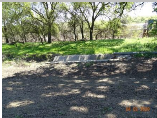
View of upstream end of the the waterside ditch. (Spring 2020)

LS : Land Side N/A : Not Applicable WS : Water Side CR : Crown