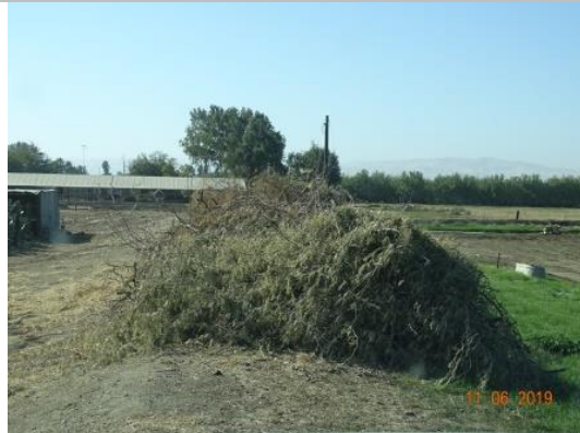
View of burn pile on levee crown. (Fall 2019)