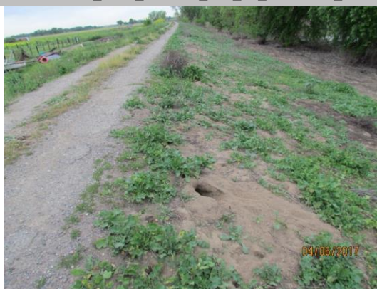
View of a rodent hole on the waterside shoulder of the levee looking downstream.