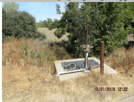
Slidegate in concrete riser on WS shoulder.