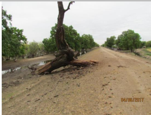
View of a tree trunk on the waterside slope of the levee.

LS : Land Side N/A : Not Applicable WS : Water Side CR : Crown