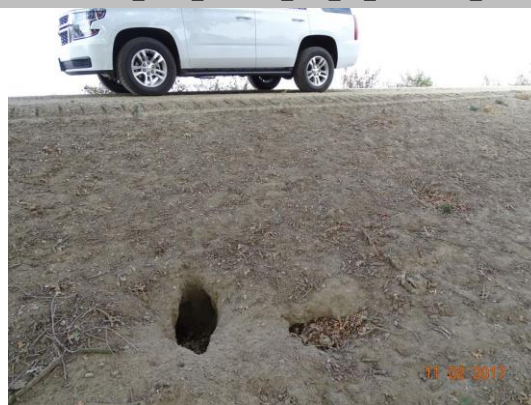
View of a rodent hole on the waterside of the levee.