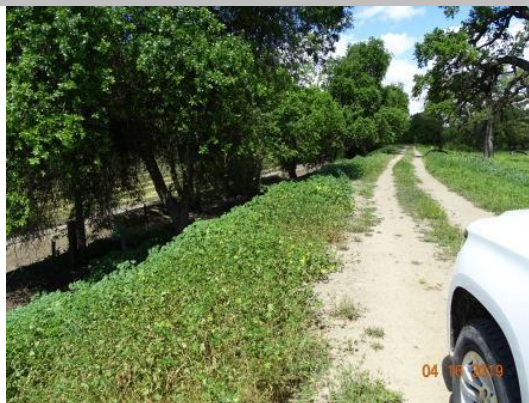
View of landside slope looking downstream. (Spring 2019)