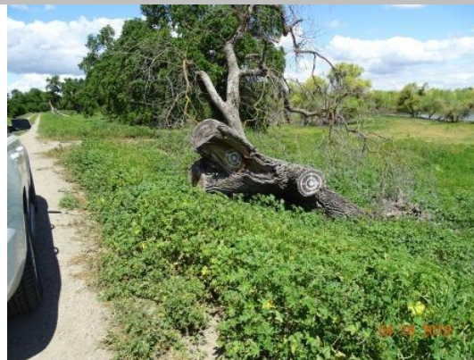
Fallen tree trunk on waterside slope. (Spring 2019)