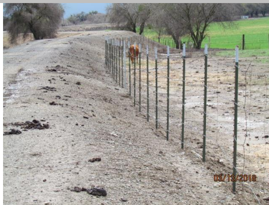
Looking upstream at new fence on landward slope. (Spring 2018)