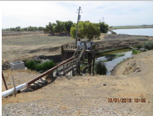
Pipe visible under walkway at puming plant on LS toe.