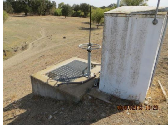
Slide gate in concrete riser next to shed on WS shoulder.