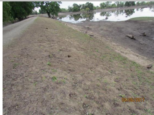
View of rodent holes on the waterside of the levee looking downstream. Spring 2017