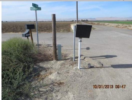
Communication line access box on LS shoulder.