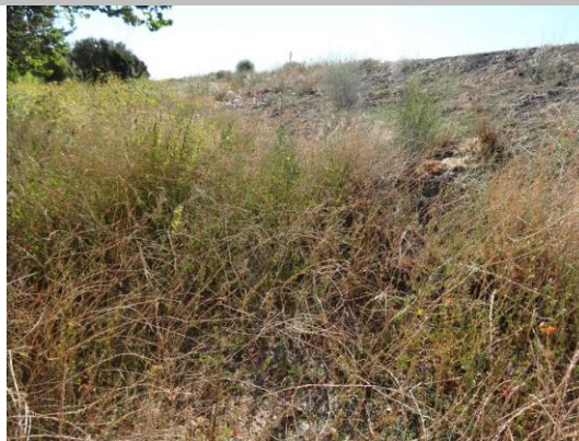
Looking up at the erosion from the levee toe.