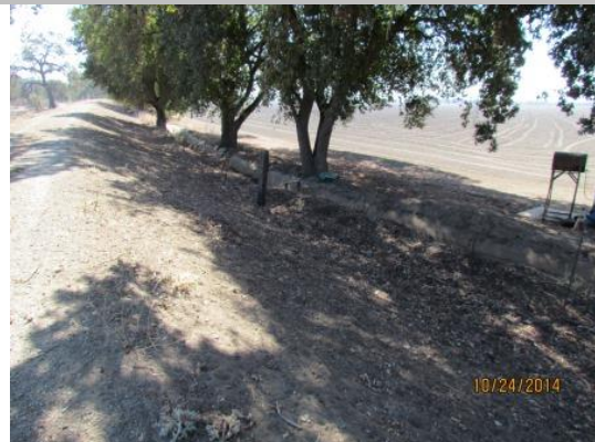
View of a ditch on the landside toe of the levee looking upstream.