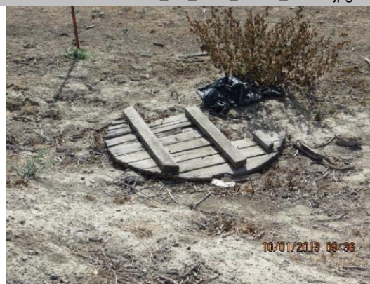
Damaged Wooden lid on WS toe.