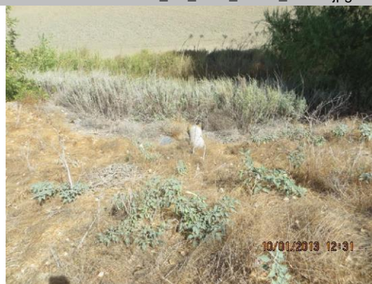
Pipe and flapgate visible on WS toe.