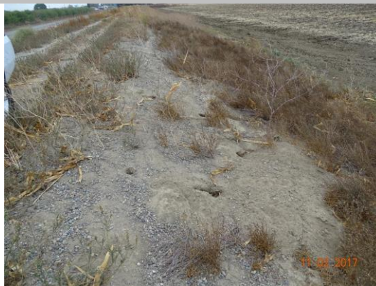
View of a rodent hole on the waterside of the levee. Fall 2017