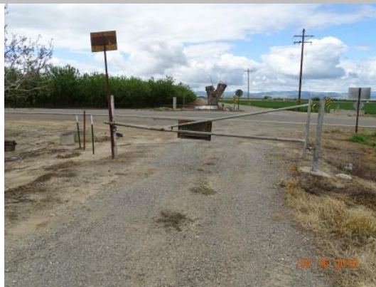
Landowner replaced existing LMA lock with their own lock. Unable to access through the gate.

* Location LS : Land Side N/A : Not Applicable WS : Water Side CR : Crown