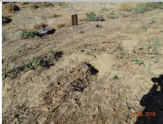
Upclose view of some of the damage to slope. (Fall 2018)