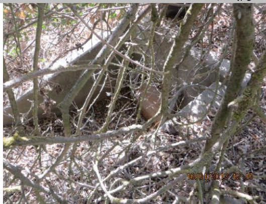
Flapgate in Concrete headwall on WS toe under tree.