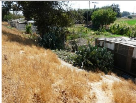
Remove landscaping from within 10' of landside toe.