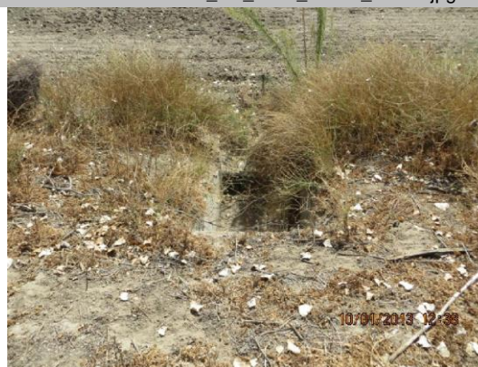
Concrete U-shaped headwall on LS toe.