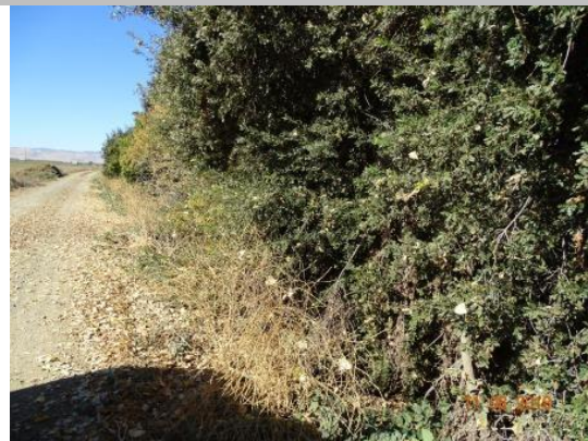
trim tree to 5 feet above ground. (Fall 2018)