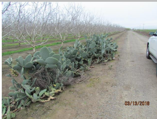
Looking south at dense cactus on waterward slope.