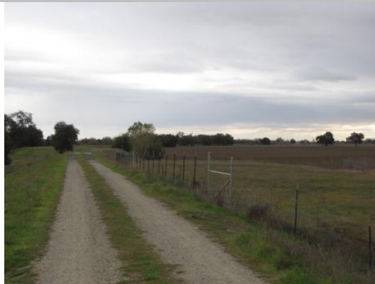
View of a barbed wire fence on the landward slope looking upstream.