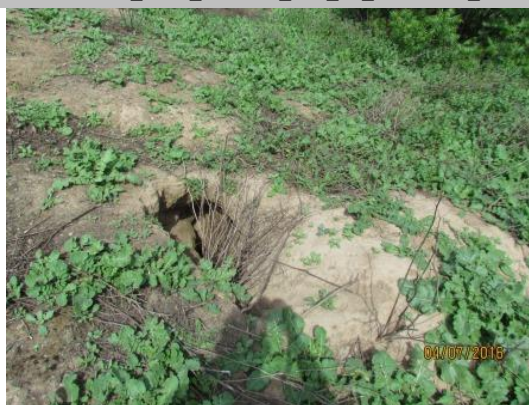
View of rodent holes on the waterside of the levee looking downstream.

* Location LS : Land Side N/A : Not Applicable WS : Water Side CR : Crown