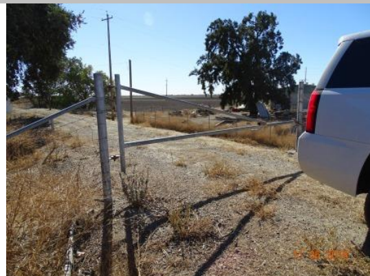
DWR and LMA do not have keys for locks on gate. (Fall 2018)