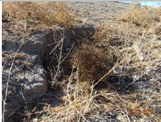
close up view of erosion at toe. (Fall 2018)