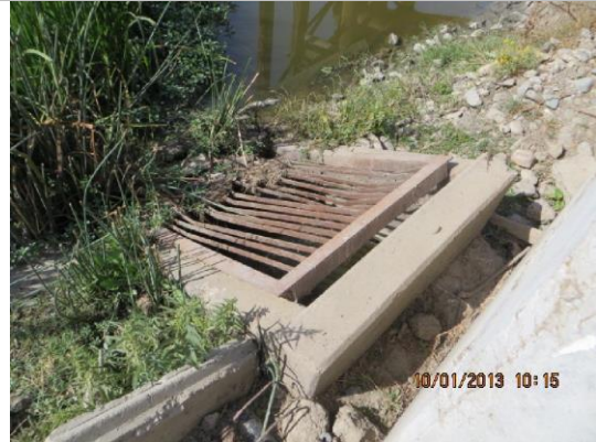
Grated inlet at LS toe.