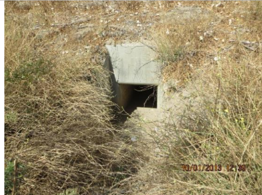
Concrete U-shaped headwall on LS toe.