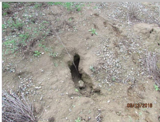
Looking at typical rodent holes on waterward slope. (Spring 2018)