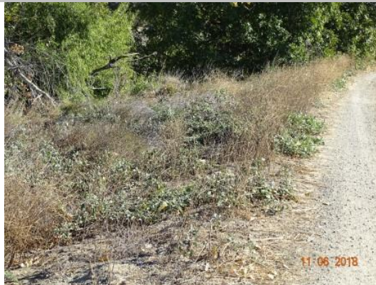
dense vegetation on waterside slope. (Fall 2018)