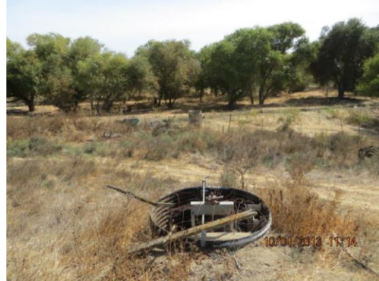
Slide gate in 60-inch CMP riser on WS shoulder.