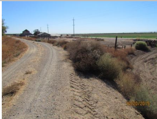
Vegetation was obstructing the view of the landside of the levee.