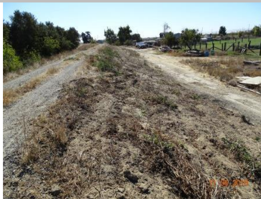
View along landside slope looking upstream. (Fall 2018)