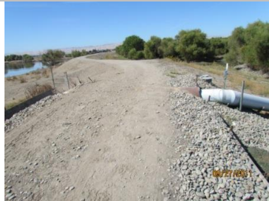
View of the ramp on the crown. The picture was taken from crown looking downstream.