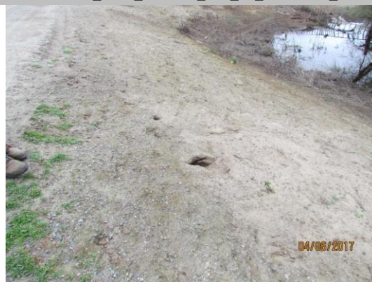
View of a rodent hole on the waterside slope of the levee.