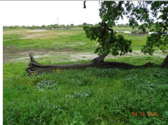
View of fallen tree trunk on waterside slope. (Spring 2019)