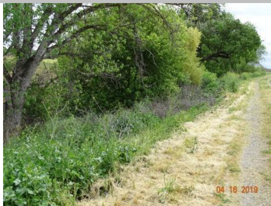
View of waterside slope looking upstream. (Spring 2019)