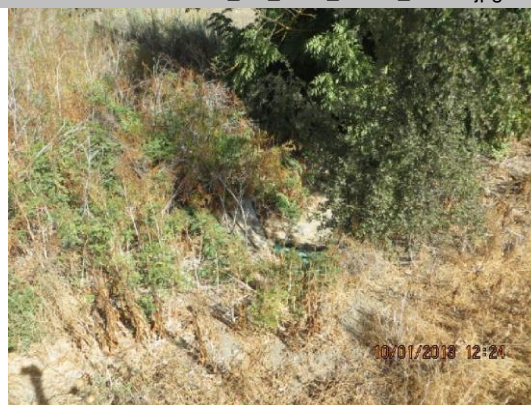
Concrete outlet on WS toe.