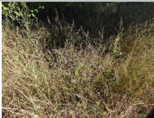
Close view of the erosion.