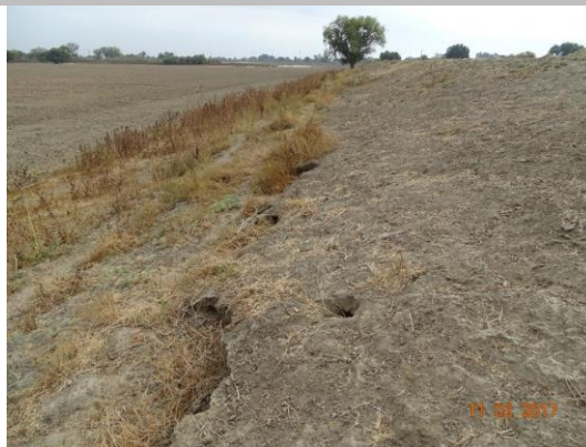
View of redox holes on the landside of the levee.