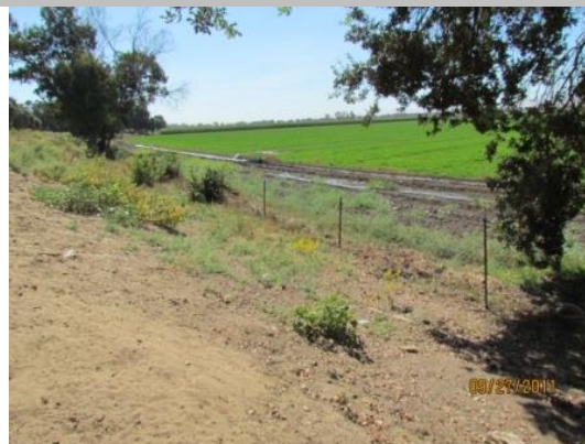
View of the fence on the landside toe of the levee. The picture was taken from crown looking upstream.