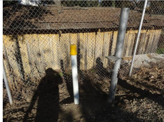
PVC riser with yellow cover located along fence on LS.