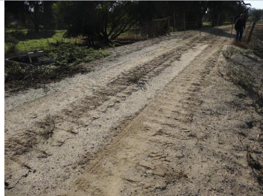
Overview of levee crown at pipe crossing.