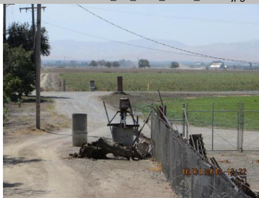
Likely risers for pipe off LS toe.