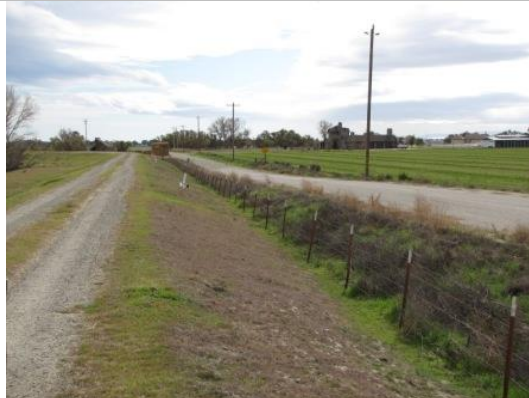
View of barbed wire fence at landward toe looking upstream.