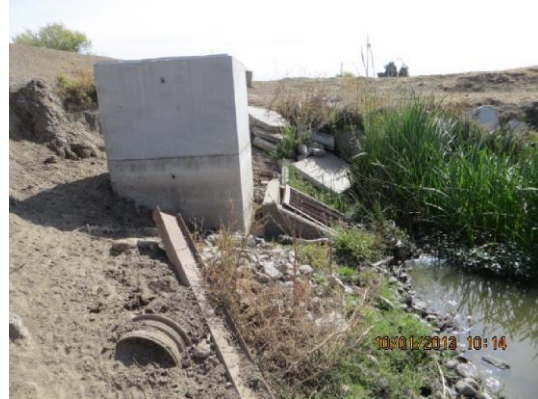
Grated inlet and 5'X5' concrete box on LS toe.