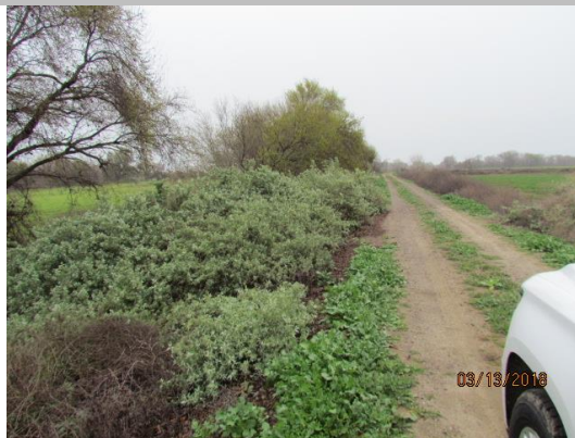
Looking at upstream at dense vegetation on waterward slope. (Spring 2018)