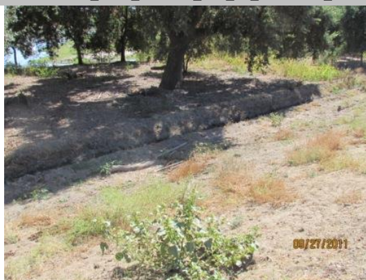
A ditch was located on the waterside toe of the levee. The picture was taken from the crown looking upstream.