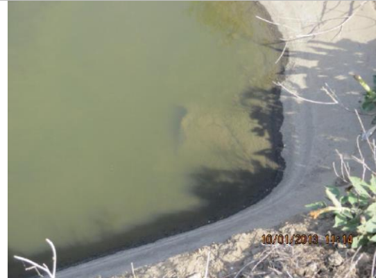
Pipe visible in concrete channel on LS toe.