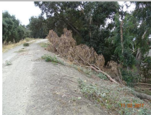
View of prunings on the landside of the levee.