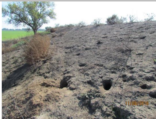
View of rodent holes on the waterside of the levee. Fall 2016