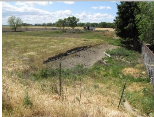
Repair damage to USACE constructed seepage berm by pedestrian and cycle traffic.