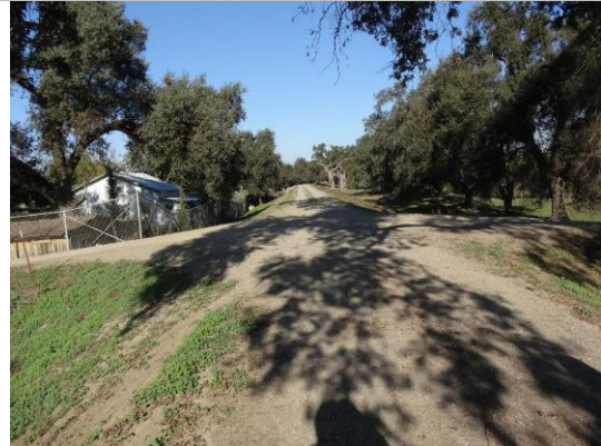
Overview of levee crown at pipe crossing.