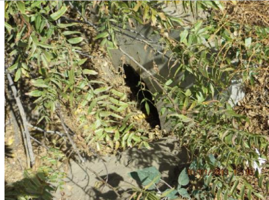
Concrete headwall at inlet on LS toe.