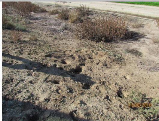
View of rodent holes on the landside of the levee. Fall 2016