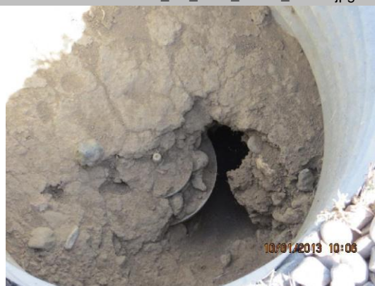
Siphon breaker in 24-inch CMP riser on WS shoulder.