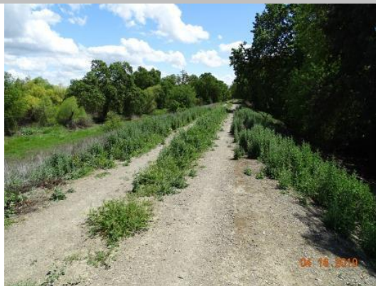
View of vegetation on crown looking upstream. (Spring 2019)