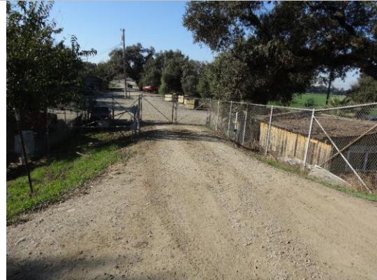
View of LS.