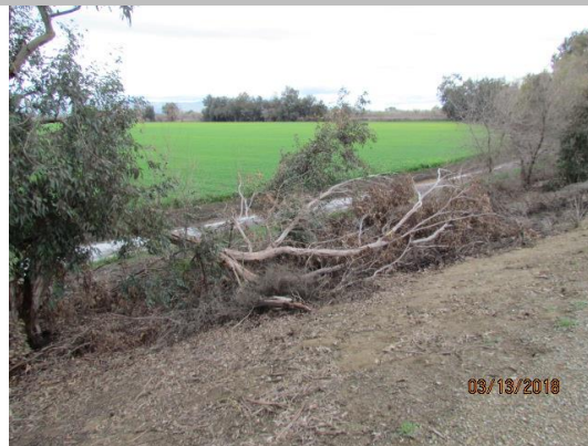
Looking downstream at broke branch on landward slope and toe.