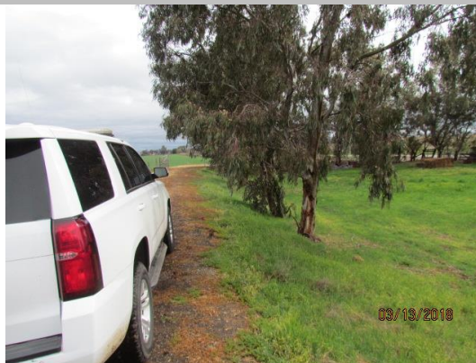
Looking upstream at trees on landward slope.