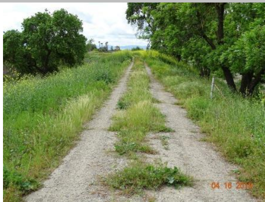
View of vegetation on levee crown looking downstream. (Spring 2019)