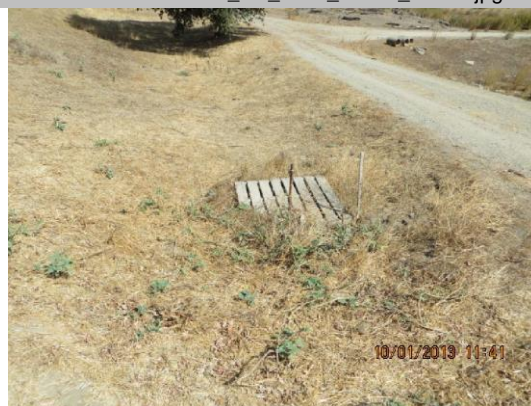
Slide gate in CMP riser on WS slope.