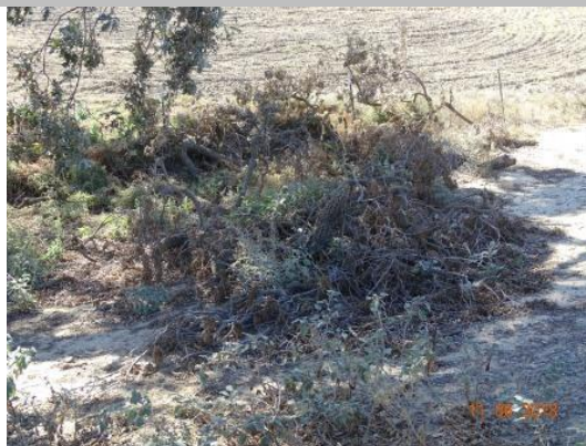
pruning pile at landside toe. (Fall 2018)