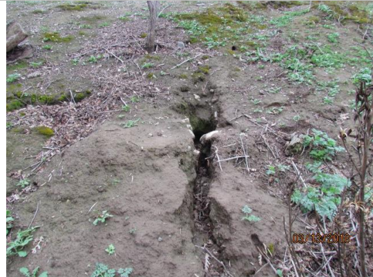
Looking at rodent hole and erosion around rodent hole on waterward slope.