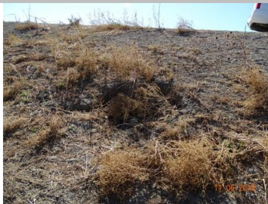
erosion at waterside toe. (Fall 2018)