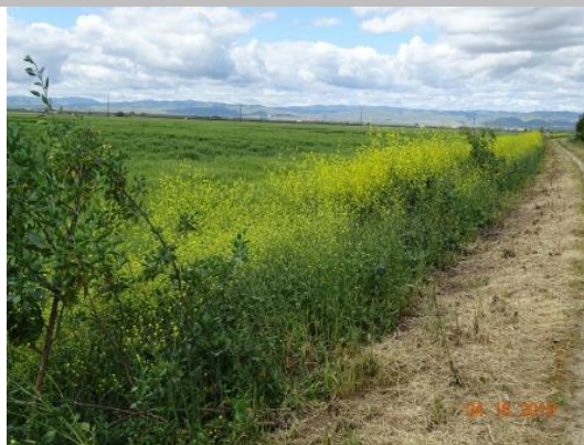
View of landside slope looking downstream. (Spring 2019)