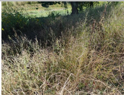
Close view of the erosion.