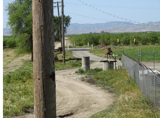
LS view: Likely risers for pipe off LS toe.