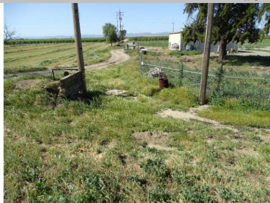
LS view: Looking from crown; general overview.