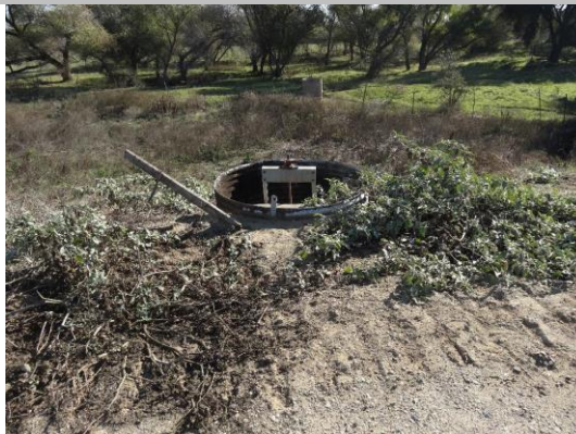
View of WS--CMP riser located on WS shoulder and concrete riser approximately 100 feet from levee crown.