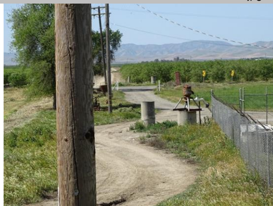
LS view: Likely risers for pipe off LS toe.