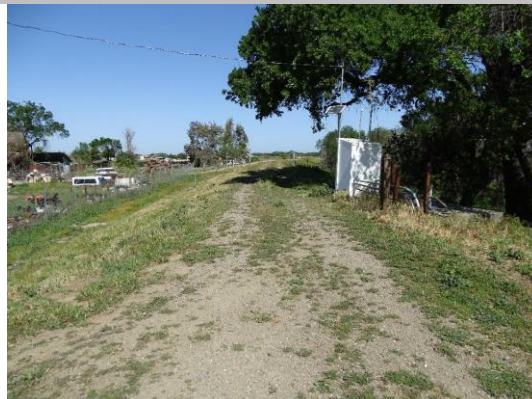
Levee crown looking downstream.