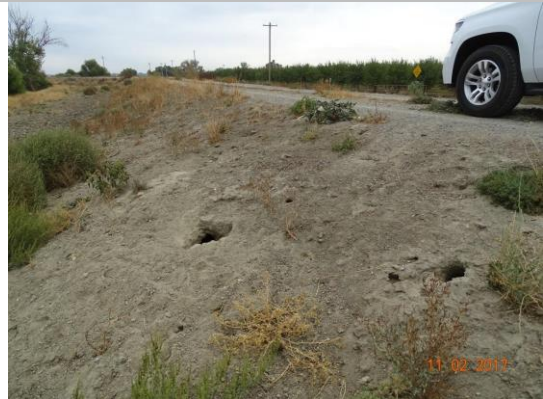
View of rodent holes on the waterside slope of the levee. Fall 2017