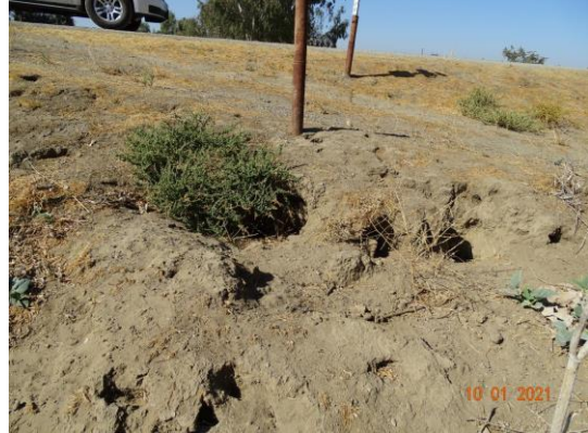
View of rodent holes on the waterside of the levee looking downstream. (Fall 2021)