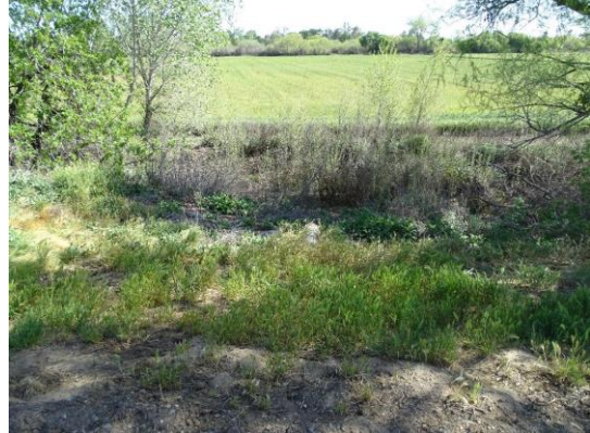
WS view: Looking from crown; 12-inch CMP outlet with flap gate on toe.