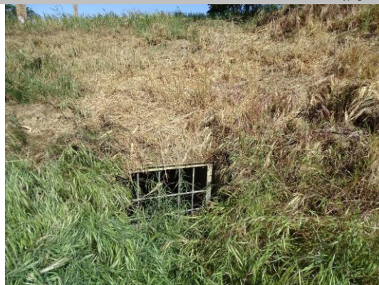
LS view: Concrete inlet on toe.