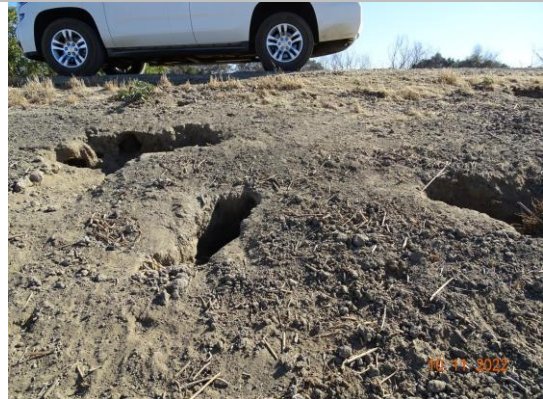
Several large animal burrows were observed at this location. (Fall 2022)