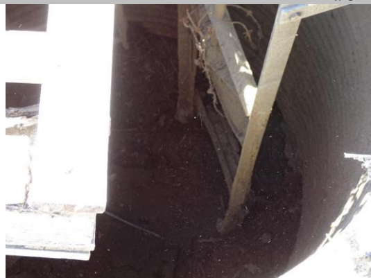
WS view: Looking into CMP riser; inlet of pipe through levee is deteriorating.