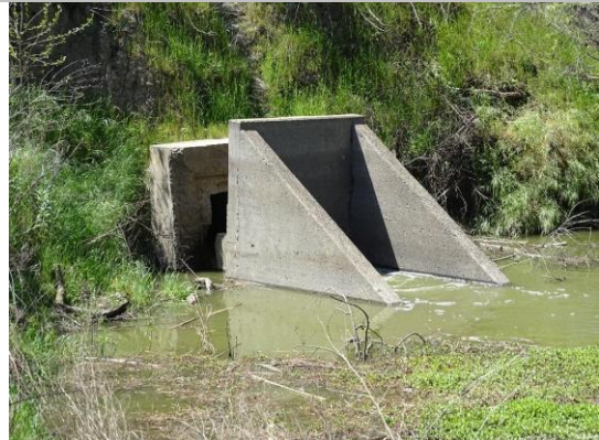
WS view: Close-up view of detached concrete headwall on toe.