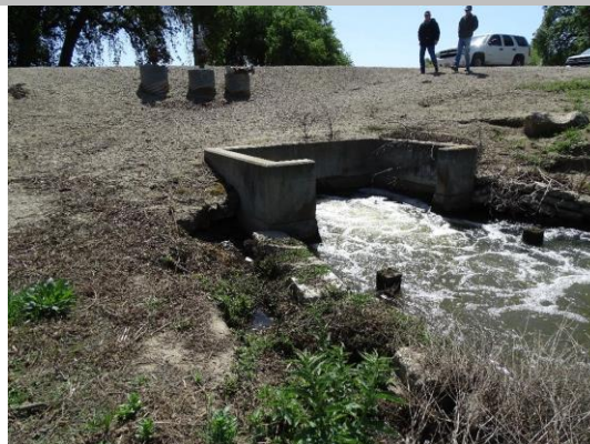
LS view: Concrete discharge box on toe; erosion around downstream sides.