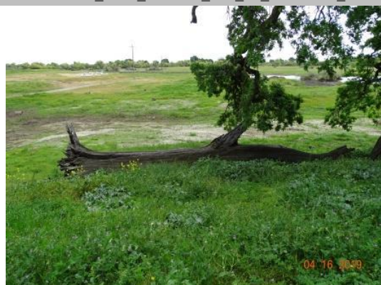
View of fallen tree trunk on waterside slope. (Spring 2019)

* Location LS : Land Side N/A : Not Applicable WS : Water Side CR : Crown