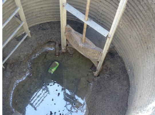
WS view: Looking into CMP riser at slide gate.