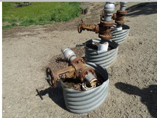
LS view: Close-up view of broken siphon breaker.