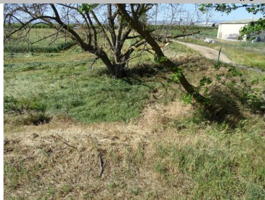
LS view: Looking from levee crown; general overview.