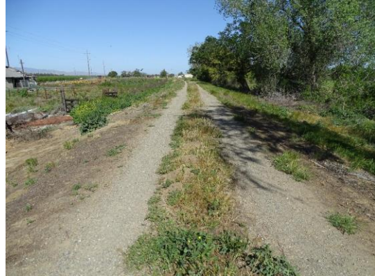
Levee crown looking downstream.