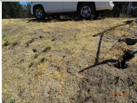
Large rodent burrows in the landside slope. (Spring 2021)