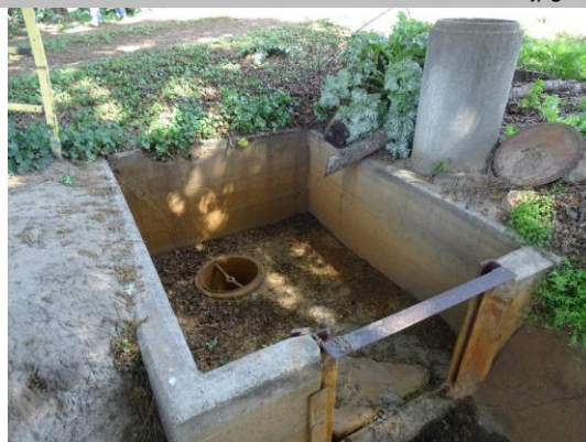
LS view: Pipe outlet on toe within concrete ditch.