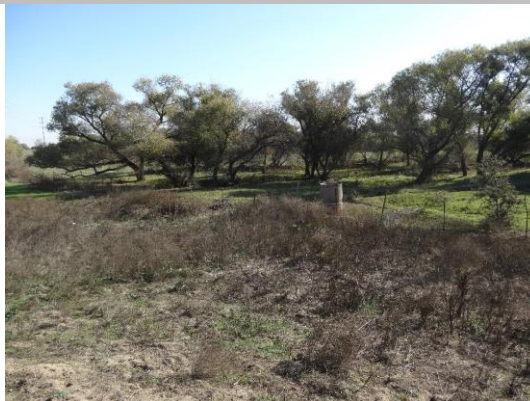
Concrete riser located in the floodway, photo 1 of 2.