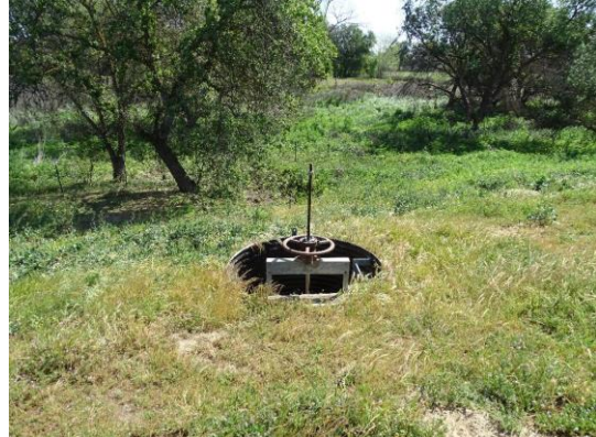
WS view: Looking from crown; CMP riser with no cover on slope.