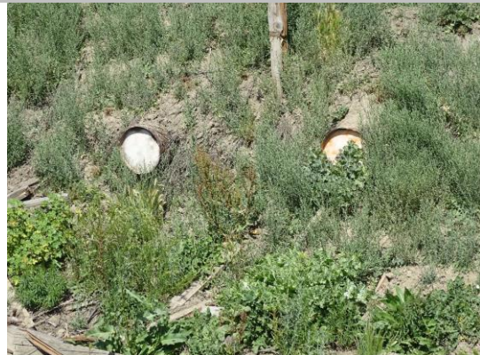
LS view: Close-up view of pipe inlet capped.