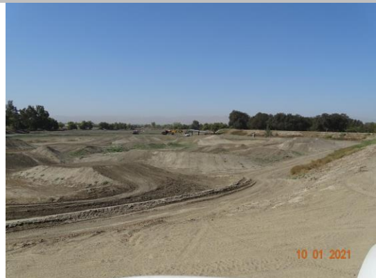
Landowner is constructing a BMX track on the landside toe. (Fall 2021)