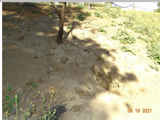
View of large rodent burrow on the waterside slope. (Spring 2021)