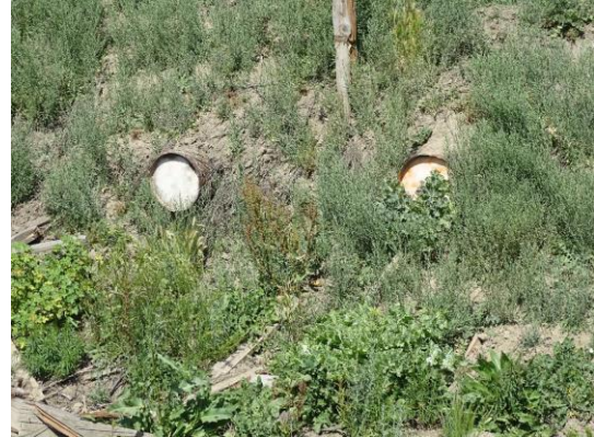
LS view: Close-up view of pipe inlet capped.