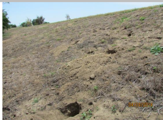
Rodent holes were found on the waterside toe of the levee looking upstream.