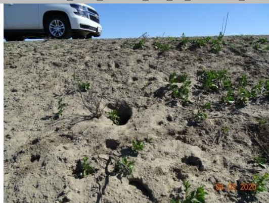
View of the landside slope from the toe of the levee. (Spring 2020)