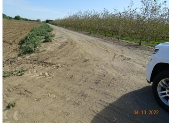
Depression in levee crown from vehicle traffic. (Spring 2022)