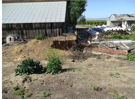
LS view: Looking from crown; general overview.