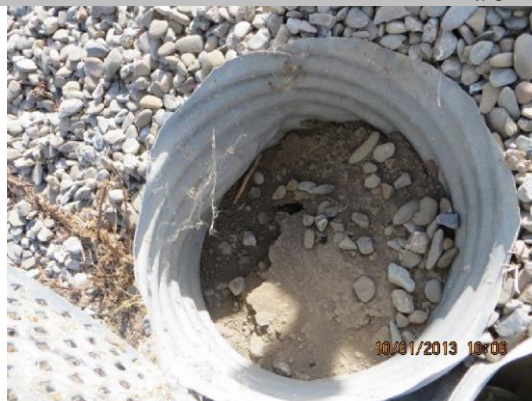
Siphon breaker covered in soil at CMP riser on WS shoulder.