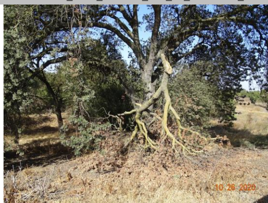
Tree limb hanging on the waterside slope. (Fall 2020)

Photo 1 of 1 : FA_2020_RD1602_110_72_20201109_00112.jpg