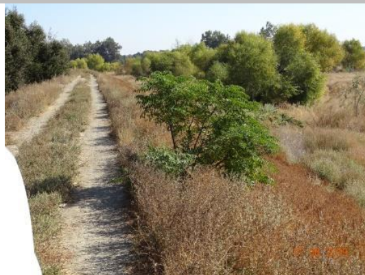
Young tree growing on the landside shoulder should be removed. (Fall 2019)