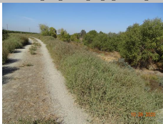
View of the waterside slope looking downstream. (Fall 2020)