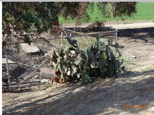
Cactus growing on the landside slope. (Fall 2020)

LS : Land Side N/A : Not Applicable WS : Water Side CR : Crown