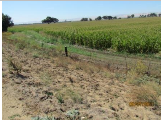
View of the fence on the landside toe of the levee. The picture was taken from the crown looking upstream.