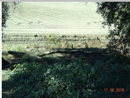
tree limbs on landside toe. (Fall 2018)