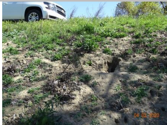
Looking at the landside slope from the levee toe. (Spring 2020)