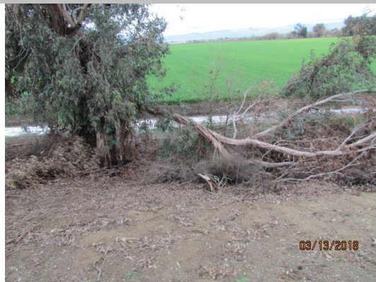
Looking at fallen branch on landward slope and toe.