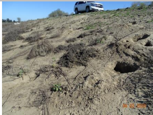
View rodent burrows in landside slope. (Spring 2020)