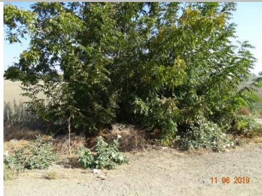
View of a tree growing on the waterside slope. (Fall 2019)