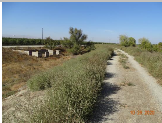
View of the landside slope looking downstream. (Fall 2020)