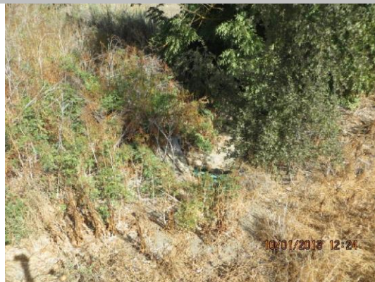
Concrete outlet on WS toe.