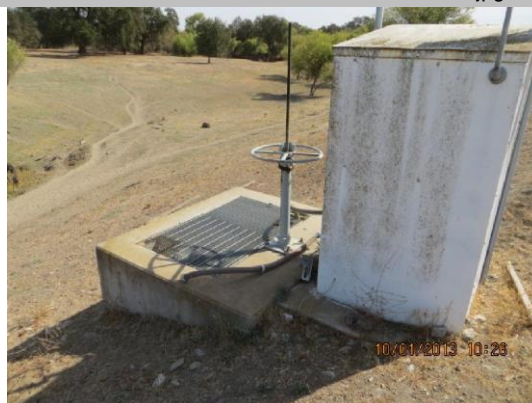
Slide gate in concrete riser next to shed on WS shoulder.