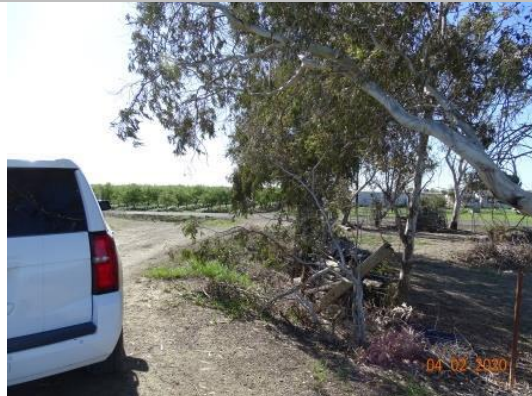
View of trees on landside slope looking towards Fig Ave. (Spring 2020)

Photo 1 of 1 : FA_2020_RD1602_110_60_20200901_00026.jpg