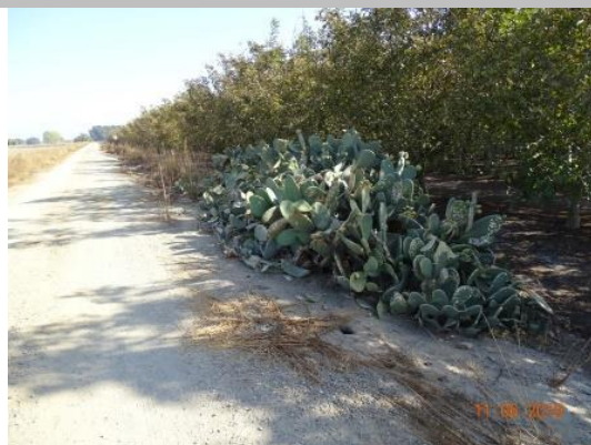
Looking at dense cactus growth on the waterside slope. (Fall 2019)

LS : Land Side N/A : Not Applicable WS : Water Side CR : Crown