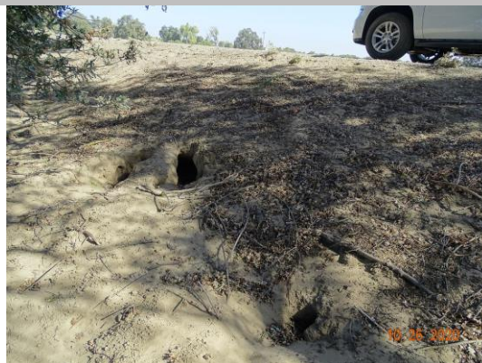
Large animal burrows in the landside slope. (Fall 2020)