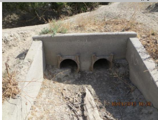
Concrete headwall on WS toe with missing flapgate.