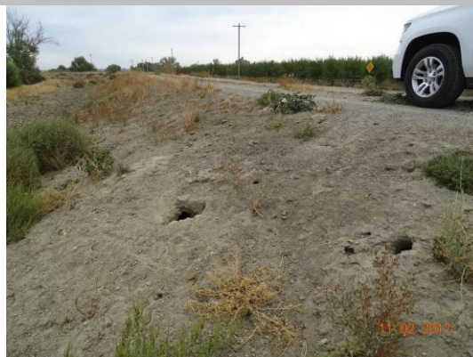
View of rodent holes on the waterside slope of the levee. Fall 2017

* Location LS : Land Side N/A : Not Applicable WS : Water Side CR : Crown