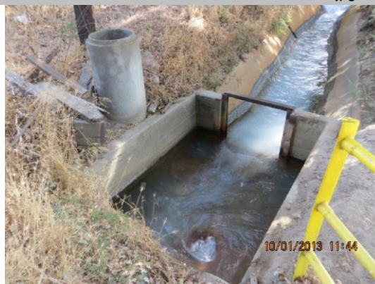
Concrete ditch at outlet from pipe on LS toe.