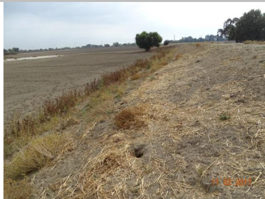
View of a rodent hole on the waterside of the levee.