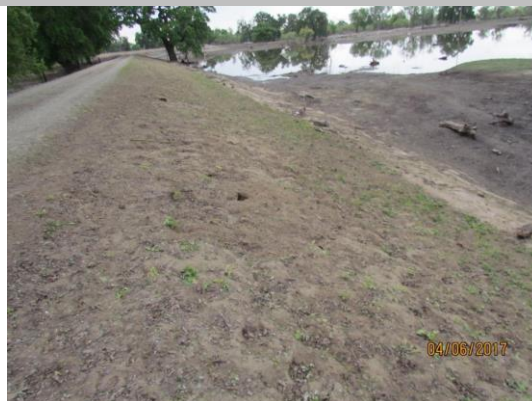
View of rodent holes on the waterside of the levee looking downstream. Spring 2017