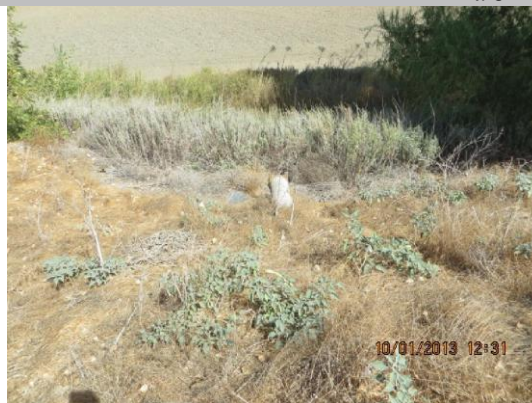
Pipe and flapgate visible on WS toe.