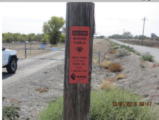
Communication line marker on LS shoulder.