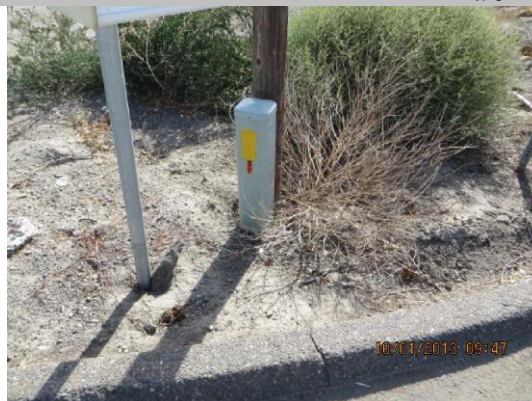
Communication line access box on LS shoulder.