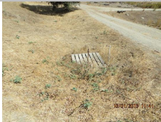
Slide gate in CMP riser on WS slope.

DS_ID:20207 FS_ID:51332 EP_NO: 8195 Repair Type: Non-Urgent EVAL Issue: Crossing Status: Found UCIP Comments: 11/18/2016 60-inch riser has a temporary cover therefore crossing has been downgraded from Urgent to Non-Urgent. (O. Magana - DWR UCIP) 10/01/2013 Lid missing from 60-inch CMP riser, may be an attractive nuisance or hazard to public. (W. Wylie - DWR UCIP) FIELD_STRUCT_DESC: 18-inch steel pipe through levee, 10 feet below crown. Slide gate in 60-inch corrugated metal pipe riser located on the waterside (WS) slope. Concrete discharge box is located on landside (LS) end. Pipe is buried across WS berm to pump located on the riverbank approximately 1,000 feet from the levee. (18-inch pipe authorized under Automatic Board Order (ABO) issued as Permit No. 8195, 1972 - Larry Buehner). [Additional Reference(s): DWR Levee Log, 1992. USACE San Joaquin River O&M Manual Unit 13, April 1964, (HLM 4.51), Drawing No. 7-4-1784]. FS Date: 11/18/2016