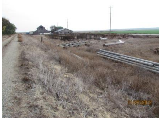
A fence was found on the landside toe of the levee looking upstream.