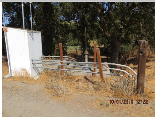
Slide gate in Concrete vault on WS shoulder.