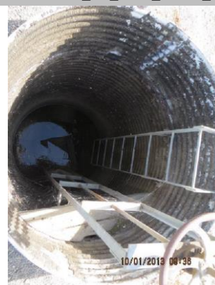
CMP riser with slide gate on WS shoulder.