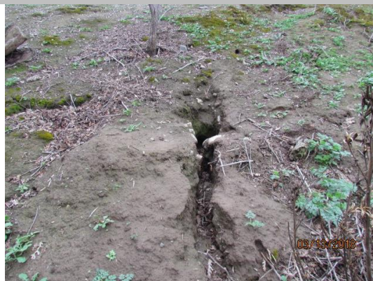
Looking at rodent hole and erosion around rodent hole on waterward slope.