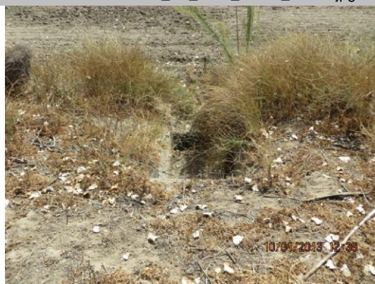
Concrete U-shaped headwall on LS toe.