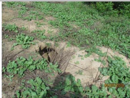
View of rodent holes on the waterside of the levee looking downstream.

* Location LS : Land Side N/A : Not Applicable WS : Water Side CR : Crown