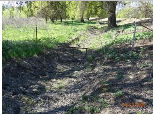
Looking upstream along the waterside toe. (Spring 2020)