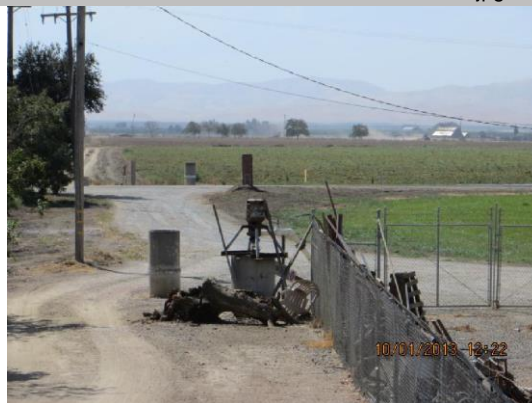
Possible concrete risers for pipe off LS toe.