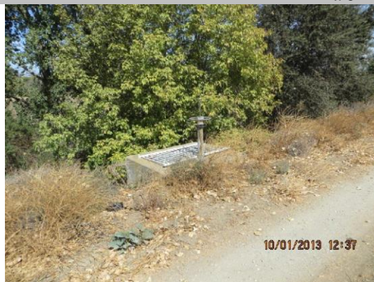
Slide gate in concrete riser on WS shoulder.