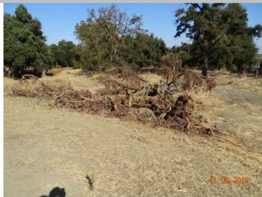
View of fallen tree on the waterside slope and toe. (Fall 2019)