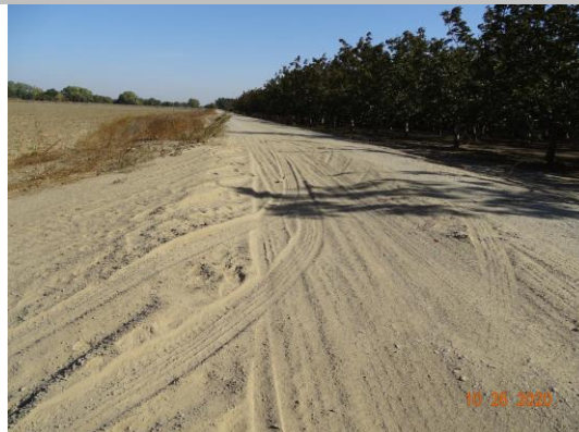
Depression in levee crown from vehicle traffic. (Fall 2020)