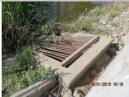
Grated inlet at LS toe.