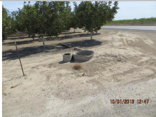
36-inch concrete standpipe on WS shoulder.