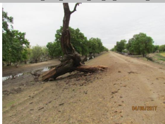
View of a tree trunk on the waterside slope of the levee.

LS : Land Side N/A : Not Applicable WS : Water Side CR : Crown