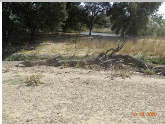
Large tree limb left on the waterside slope. (Fall 2020)

* Location LS : Land Side N/A : Not Applicable WS : Water Side CR : Crown