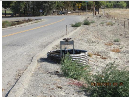
60-inch CMP riser on WS shoulder.