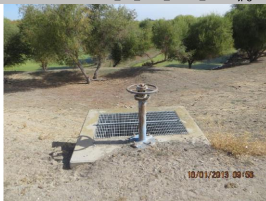
Slide gate in concrete box on WS shoulder.