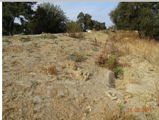
View of rodent holes on the waterside of the levee.