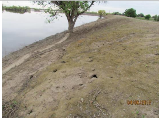
View of rodent holes on the waterside slope of the levee. Spring 2017