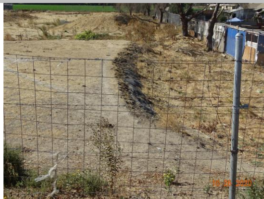
View of damage to seepage berm constructed on the landside toe. (Fall 2020)