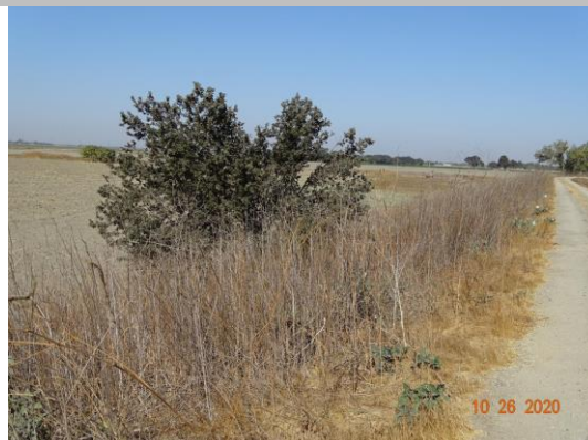
View of the landside slope looking downstream. (Fall 2020)