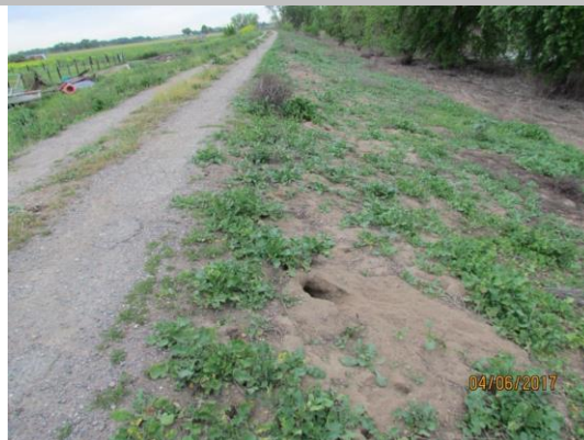
View of a rodent hole on the waterside shoulder of the levee looking downstream.