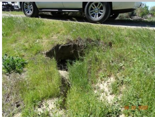
View of burrow in the waterside shoulder. (Spring 2020)