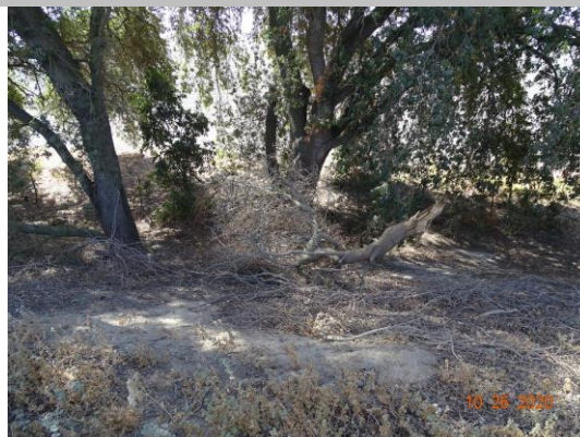
Broken tree limb left on the landside toe. (Fall 2020)