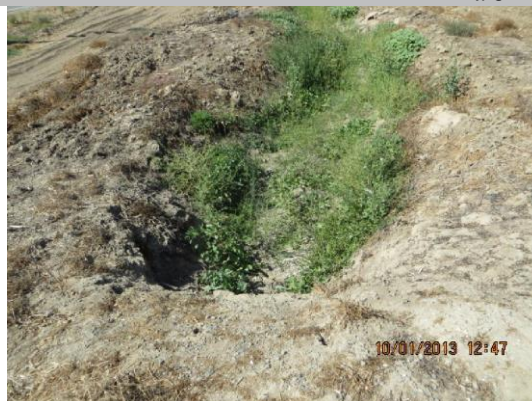
Drainage/irrigation canal on LS toe.