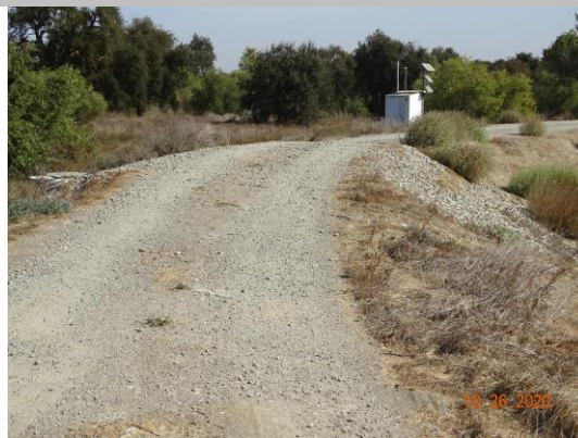
View of ramp built up on levee crown. (Fall 2020)

* Location LS : Land Side N/A : Not Applicable WS : Water Side CR : Crown