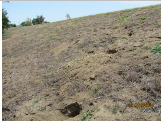
Rodent holes were found on the waterside toe of the levee looking upstream.