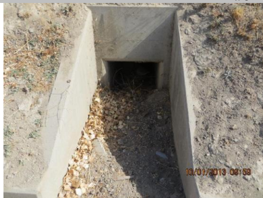
Concrete inlet on LS toe.