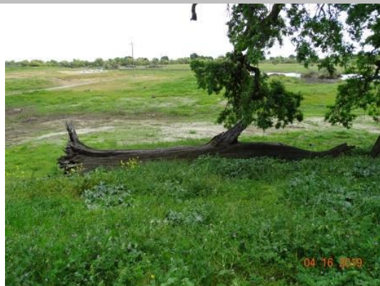
View of fallen tree trunk on waterside slope. (Spring 2019)

LS : Land Side N/A : Not Applicable WS : Water Side CR : Crown