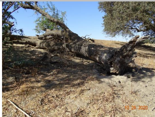
Large tree has fallen on the waterside slope. (Fall 2020)