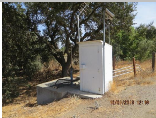
Shed with slide gate in Concrete riser on WS shoulder.