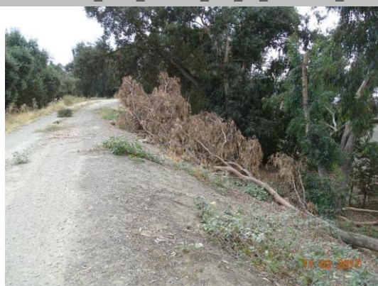
View of prunings on the landside of the levee.

LS : Land Side N/A : Not Applicable WS : Water Side CR : Crown