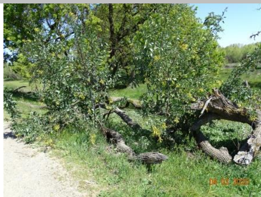
View of young trees growing around tree limb on the waterside slope. (Spring 2020)