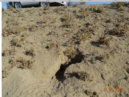
View of rodent burrows in the landside slope. (Fall 2019)