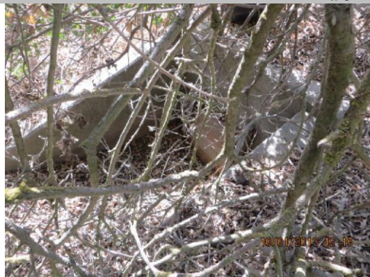
Flapgate in Concrete headwall on WS toe under tree.