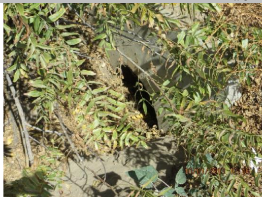
Concrete headwall at inlet on LS toe.