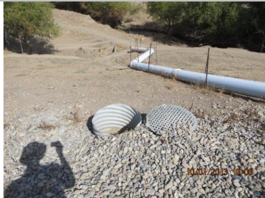
Siphon breaker in 24-inch CMP riser on WS shoulder.