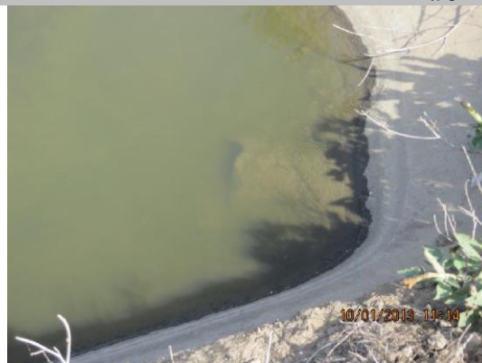
Pipe visible in concrete channel on LS toe.