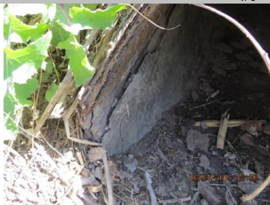
Pipe deteriorated on LS at outlet.