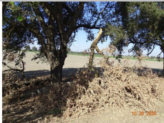
View of broken tree branch that has fallen on the landside slope. (Fall 2020)