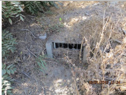
Concrete inlet on LS toe.