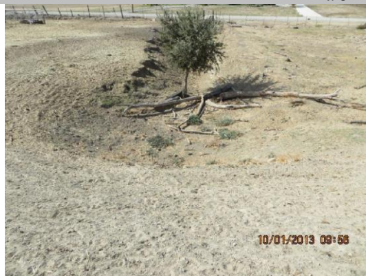
Inlet on LS toe.