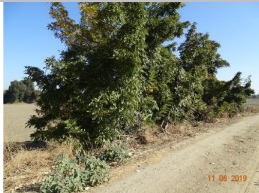
View of trees growing on the waterside slope. (Fall 2019)