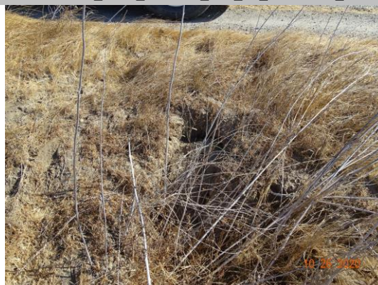
Several rodent holes noted at this location. (Fall 2020)