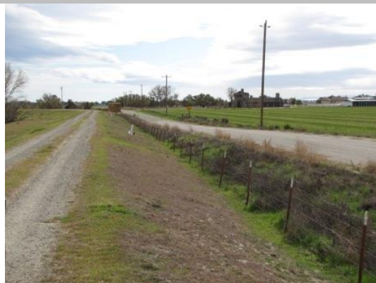
View of barbed wire fence at landward toe looking upstream.

LS : Land Side N/A : Not Applicable WS : Water Side CR : Crown