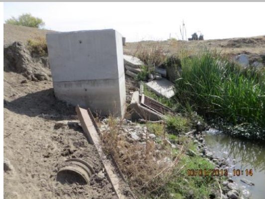
Grated inlet and 5'X5' concrete box on LS toe.