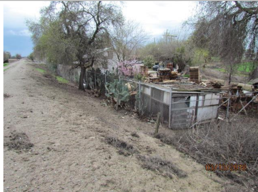
Looking southwest at animal pens and other encroachments on landward toe. (Spring 2018)