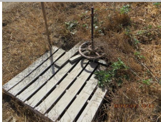
Slide gate in CMP riser on WS slope.