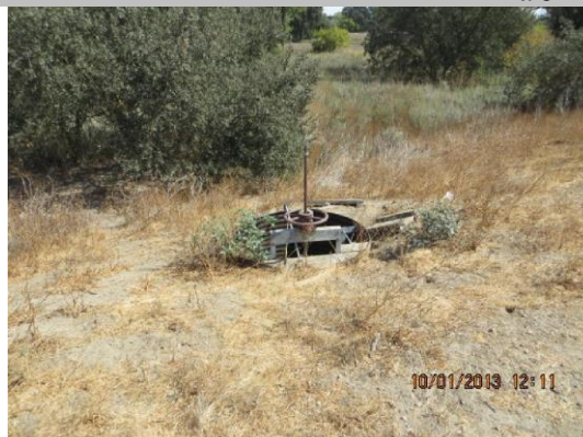
Slide gate in CMP riser on WS slope. Outlet visible under tree in background.