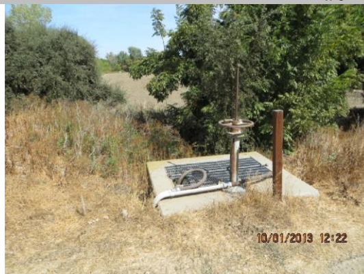
Slidegate in concrete riser on WS shoulder.