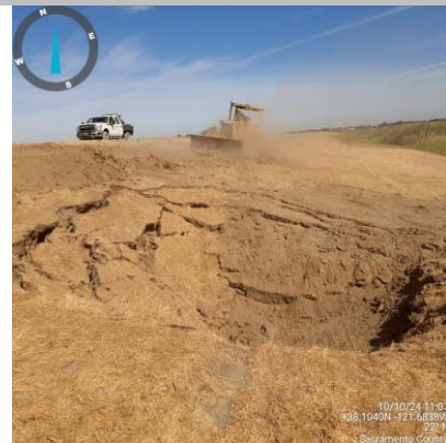
View of approximately 30'x30' sink hole that has formed on the landside slope. (Fall 2024)