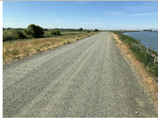
Levee crown at crossing location on record.