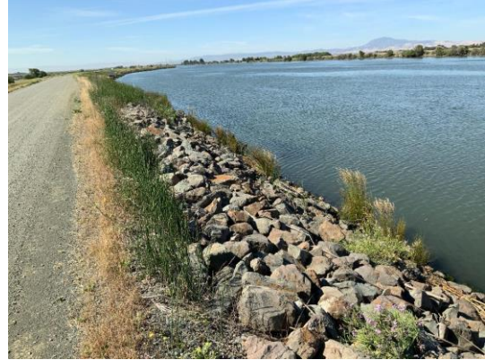
WS view: Slope from crown at crossing location on record; no visible pipe crossing.