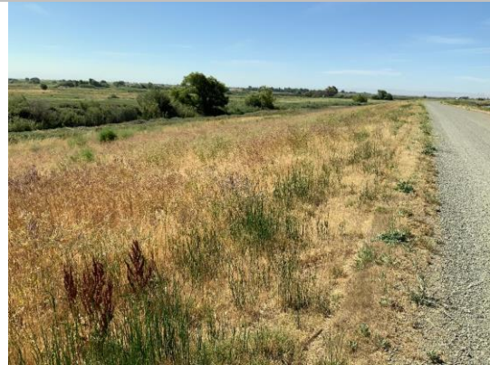
LS view: Toe from crown at crossing location on record; no visible pipe crossing.