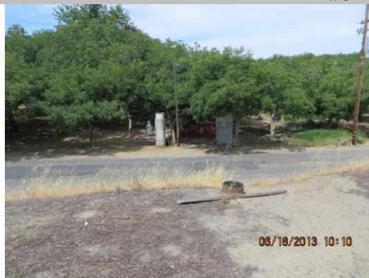
Siphon breaker in steel riser on LS shoulder and concrete standpipe off LS toe.