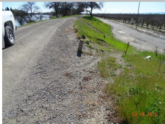
View of ruts on landside shoulder. Spring 2019.