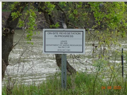
View of revegetation sign on the waterside berm. Spring 2020.