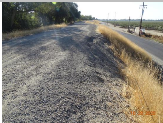
View of the erosion on the landside slope. Fall 2020.