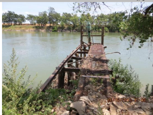
Debris buildup at metal platform waterline.