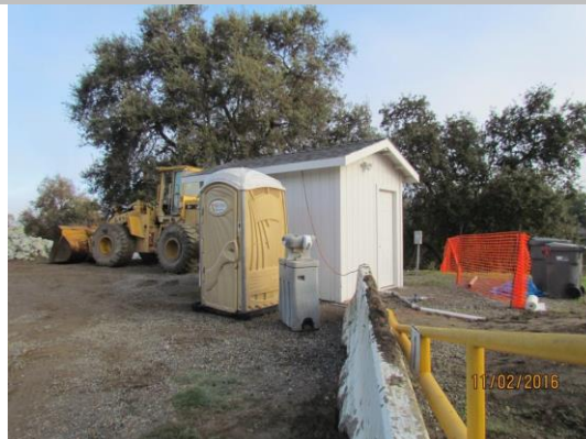
View of the building. Fall 2016.