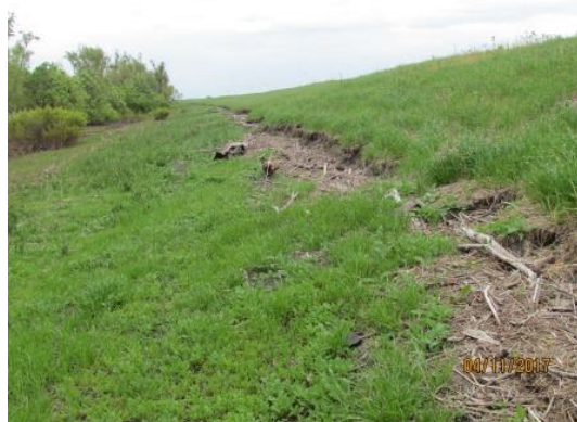
View of wave wash damage on waterside levee slope. Spring 2017.