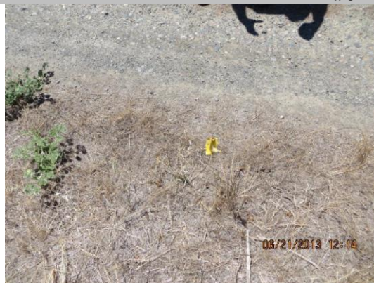
PG&amp;E marker flag on Crown.