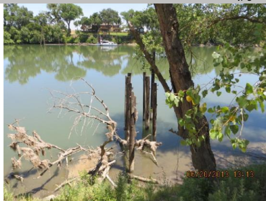
Pump missing from pier on WS toe.