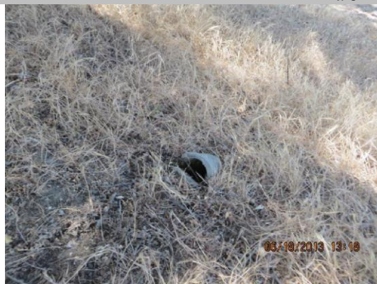
Pipe visible on LS slope.