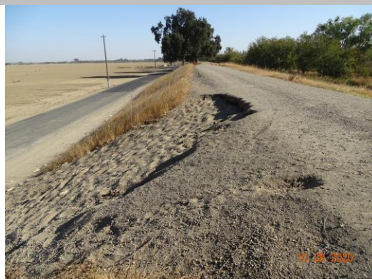
View of bank caving on the landside slope. Fall 2020.