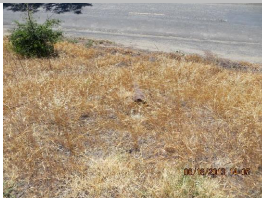
Pipe and remnants of grouted pipe on LS slope.