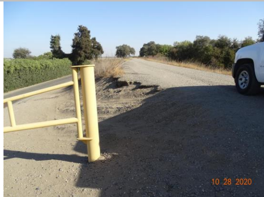
View of erosion on the landside slope. Fall 2020.

* Location LS : Land Side N/A : Not Applicable WS : Water Side CR : Crown