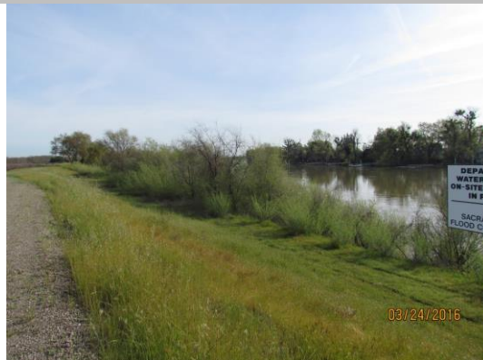
View of the revegetation site on the berm of the waterward side of the levee looking upstream. Spring 2016.