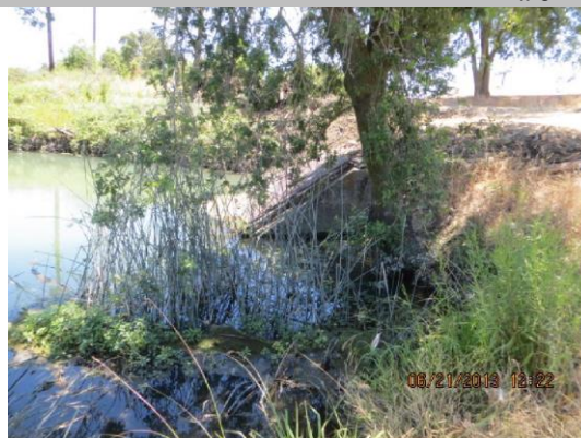
Concrete intake structure on LS.