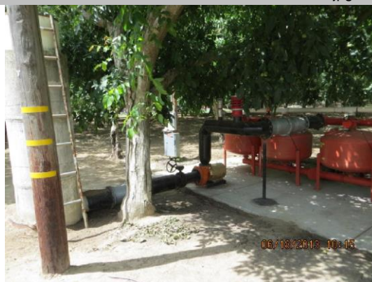
Filters, boost pump, and gate valve down stream from concrete standpipe off LS toe.