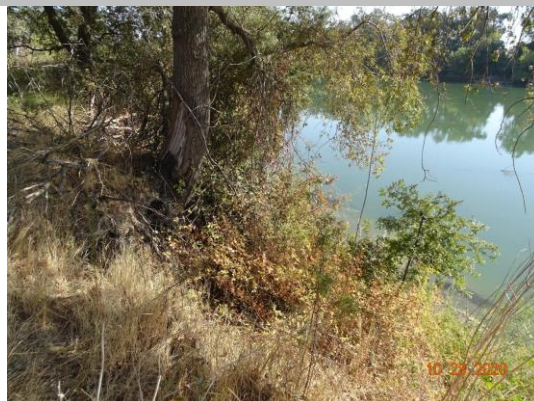
View of erosion location on the waterside berm. Fall 2020.