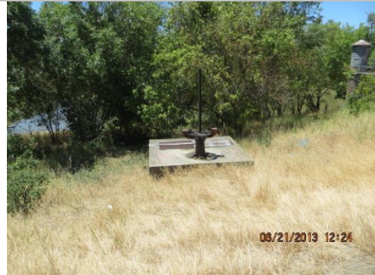
Slide gate in 9'X10' concrete box on WS slope.