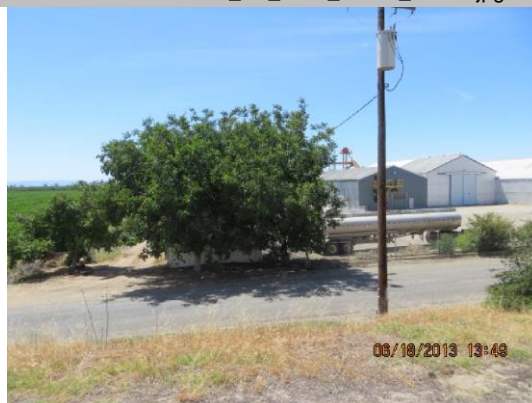
Pumphouse/distribution box off LS toe.