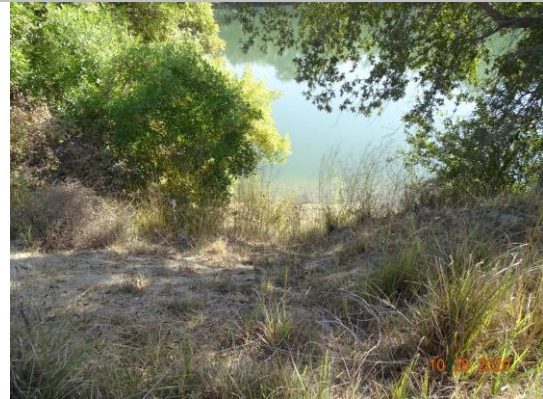
View of erosion location on waterside berm. Fall 2020.