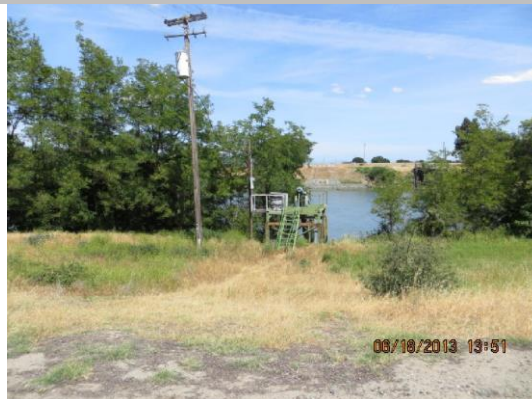
Slant pump on metal pier on WS berm.