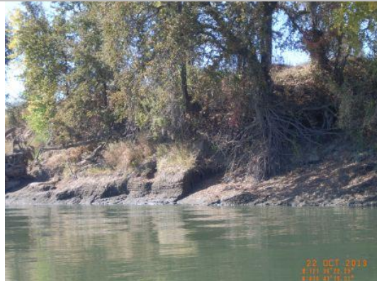
USACE 2013 Photo #1