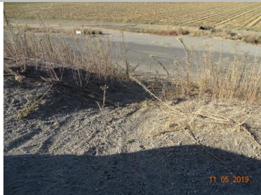
View of settlement and footpath on landside slope. Fall 2019.