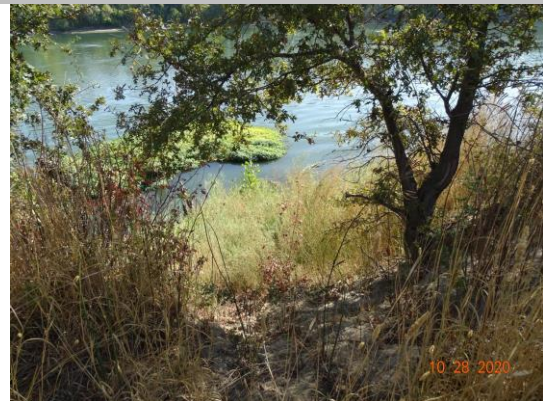
View of erosion on the waterside slope. Fall 2020.