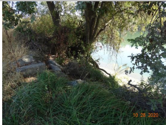
View of erosion location on waterside berm. Fall 2020.

* Location LS : Land Side N/A : Not Applicable WS : Water Side CR : Crown