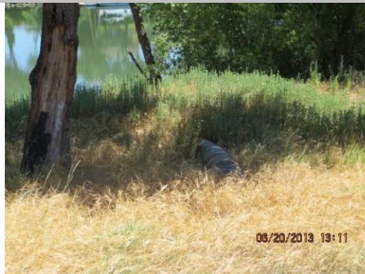
Pipe on WS slope.