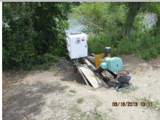
Pump and gate valve on WS slope.