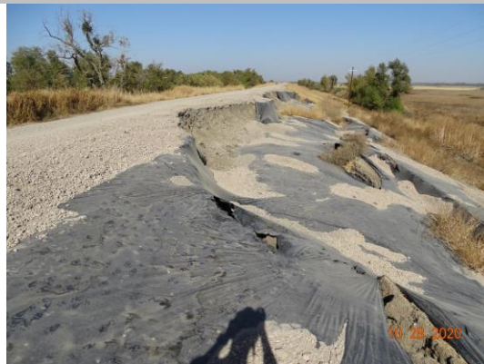
View of sloughing on the landside slope. Fall 2020.