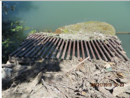
Concrete intake structure on LS.