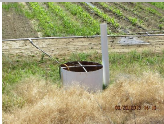
4-foot diameter steel standpipe at LS toe, may be indicator of pipe location.