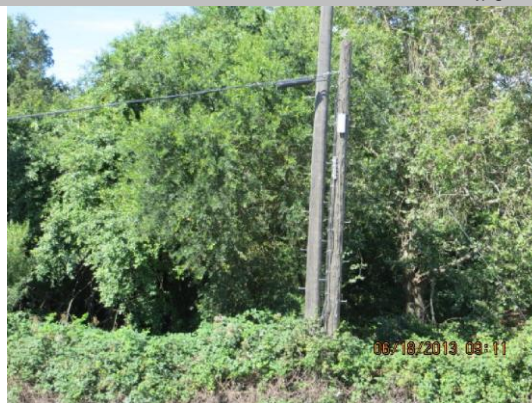
Line visible on JP off LS toe. Likely this is the source of crossing.