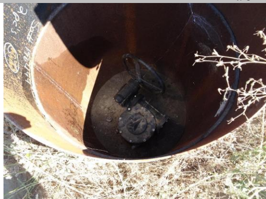
view of positive closure device in metal riser on WS shoulder of levee.