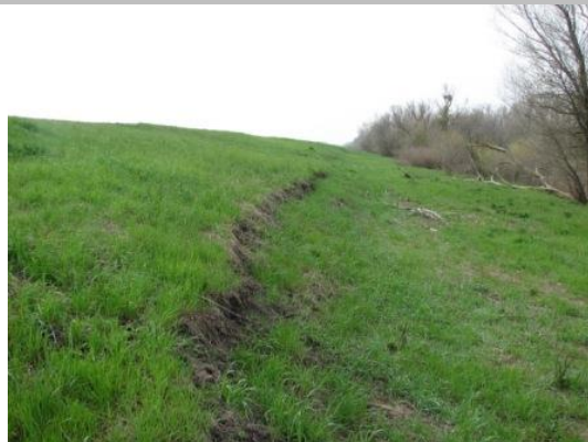
Wave wash damage along the slope the cut is 1'-2'.

LS : Land Side N/A : Not Applicable WS : Water Side CR : Crown