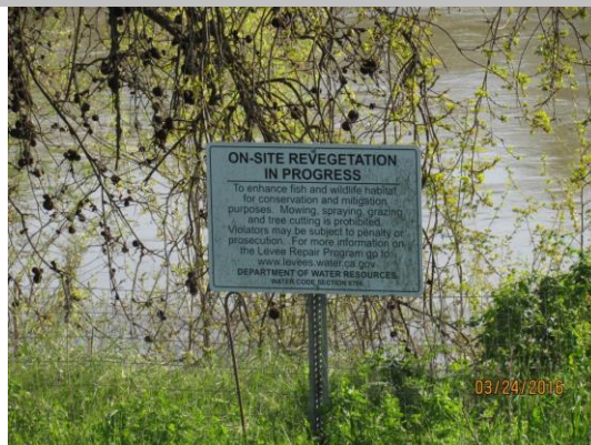
Sign stating revegetation site. Spring 2016.