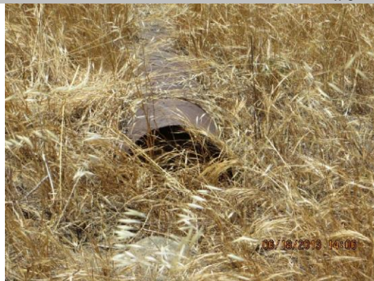
Pipe and remnants of grouted pipe on LS slope.