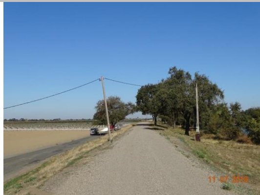
View of telephone line over levee crown. Fall 2018.