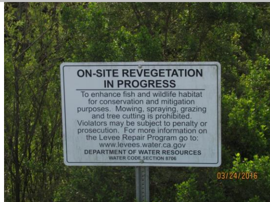
Sign for revegetation site. Spring 2016.