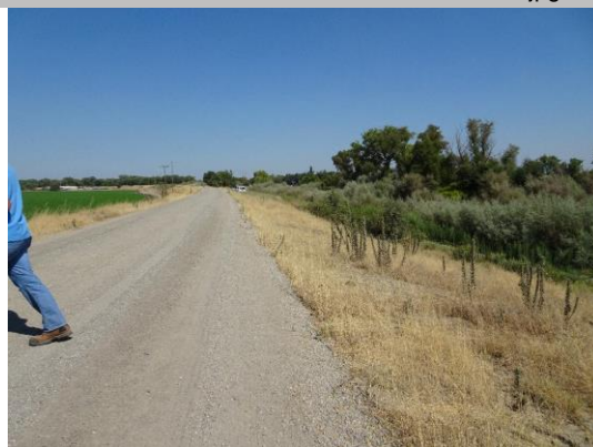
view of levee crown looking upstream from pipe location.