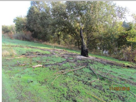
View of burnt tree on waterside slope. Fall 2016.