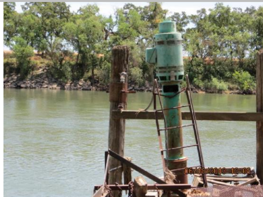
Electrical cut to pump.