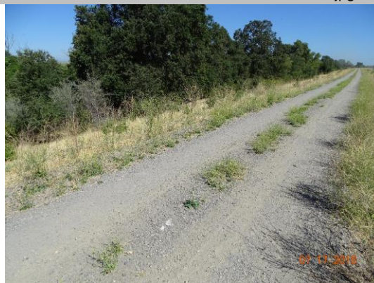
View of levee crown at potential crossing looking upstream.