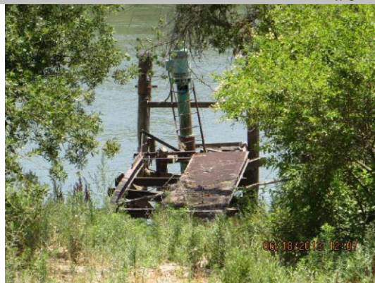
Pump on metal platform off WS berm.