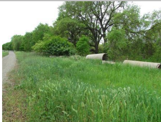
View of debris on the waterward side of the levee looking upstream. Spring 2015.

Photo 1 of 1 : FA_2020_RD1600_191_1202_20200813_00030.jpg