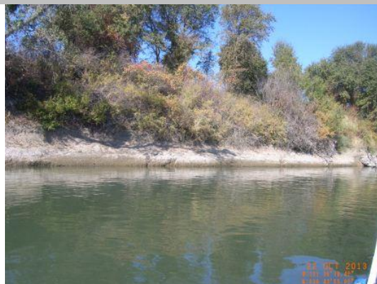
USACE 2013 Photo #1