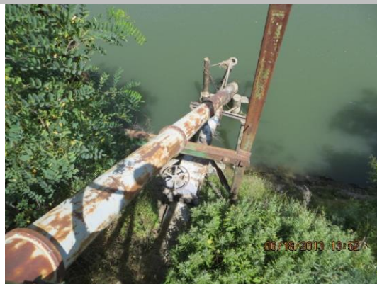
16-inch pipe ties into 24-inch pipe under pump platform at slide gate.