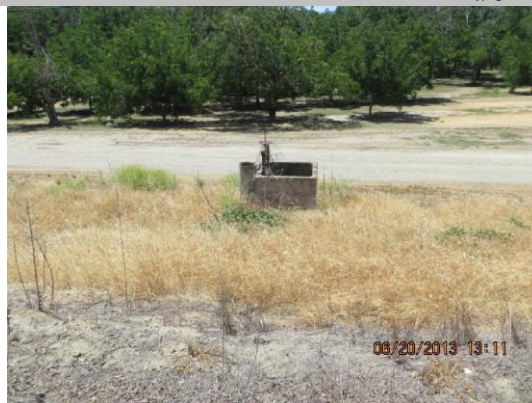
6'X6' concrete distribution box on LS toe.