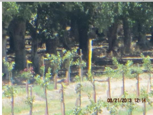
Carsonite gasline marker visible approximately 1,000-feet east of levee crown.