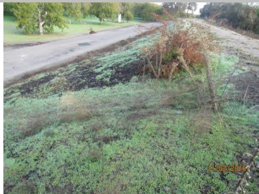
View of slope instability. Fall 2016.