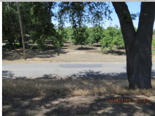
Pipe visible on LS slope.